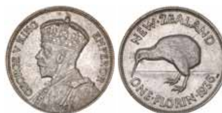
916* George V , florin, 1936. Tiny edge nick at 7 o'clock on reverse, toned with subdued mint bloom, uncirculated/nearly uncirculated and rare, the key date.