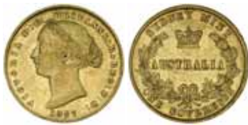
1001* Queen Victoria, second type, 1857. Fine.