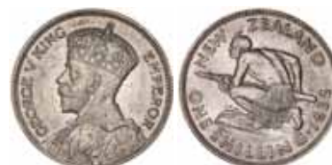
919* George V , shilling, 1935. Even grey toning, uncirculated.