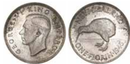
945* George VI , florin, 1945. Uneven toning with underlying frosty brilliance, uncirculated.