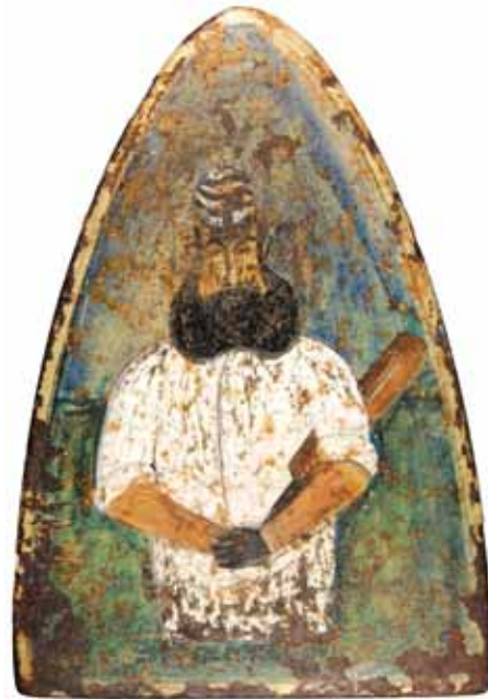
1141* Cricket memorabilia , Salter 6-pound iron in black enamelled cast iron with painting of the legendary English cricketer, W.G. Grace, 1848-1915, on the base. Some rust showing through the base, otherwise very fine.