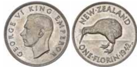
942* George VI , florin, 1942. Nearly uncirculated.