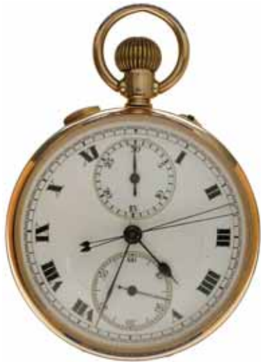
1137* Gents gold (9ct) open face split seconds chronograph pocket watch Swiss Made c1910 , top wind, case (50mm) #128649, gold dust cover, unsigned white enamel dial, two subsidiary dials and two centre seconds hands, with black Roman numerals.