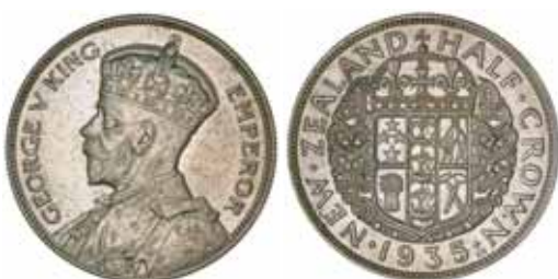
911* George V , halfcrown 1935. Hairline die break across bust, original mint bloom, uncirculated and rare thus.