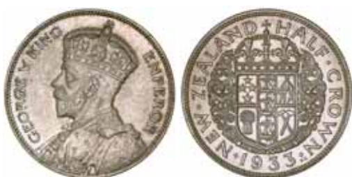
908* George V , halfcrown, 1933. Toned, uncirculated.