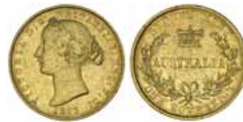
1007* Queen Victoria, second type, 1863. Good fine.