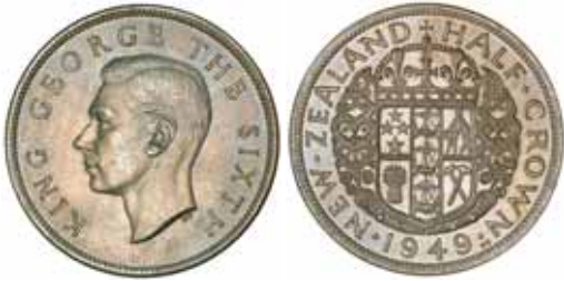
936* George VI , halfcrown, 1949. Uncirculated.