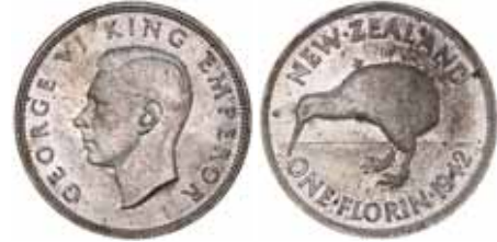
941* George VI , florin, 1942. Uneven toning with underlying frosty brilliance, uncirculated.