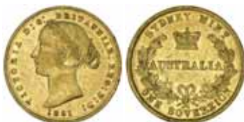
1005* Queen Victoria, second type, 1861. Good fine.