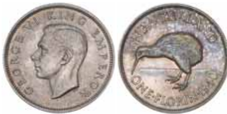
938* George VI , florin, 1940. Toned reverse, extremely fine/nearly uncirculated and rare.