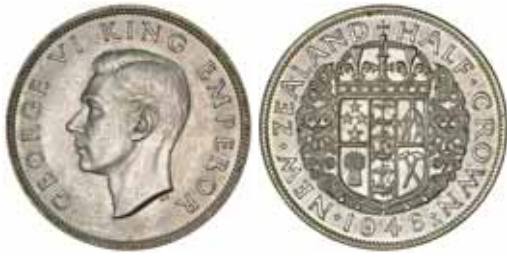
935* George VI , halfcrown, 1946. Nearly uncirculated.