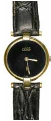
1139A* Cartier Vermiel ladies wristwatch , c.1980's, gold plated over sterling silver, quartz movement, original leather band and buckle, not running (may need new battery). Very fine.