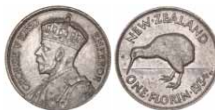
914* George V , florin, 1934. Toned, uncirculated.