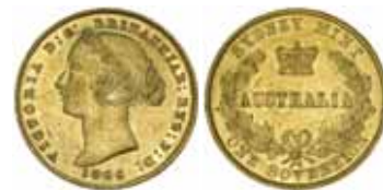
1012* Queen Victoria, second type, 1866. Good very fine.