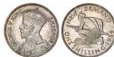
917* George V , shilling, 1934. Toned, nearly uncirculated.