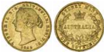
1003* Queen Victoria, second type, 1859. Fine/good very fine.