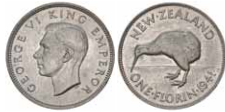
940* George VI , florin, 1941. Frosty mint bloom, uncirculated.