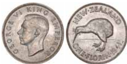
939* George VI , florin, 1941. Lightly toned with underlying brilliance, uncirculated.