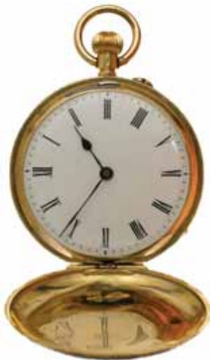
1139* Ladies gold (18ct) full hunter pocket watch c1900 , top wind, chased case (38mm) #79866, metal dust cover with inscribed naming "Alice Fairbairn", Swiss movement for Stewart Dawson & Co, white enamel dial with black Roman numerals.