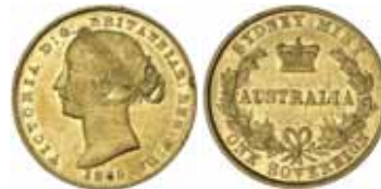
1011* Queen Victoria, second type, 1865. Rim nick, good very fine.