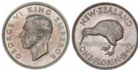
937* George VI , florin, 1940. Full original frosty mint bloom on the reverse, uncirculated/choice uncirculated and rare in this condition, one of the finest known.