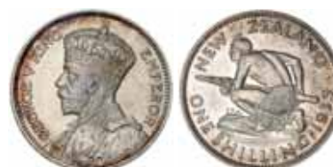
918* George V , shilling, 1935. Full mint bloom, lightly toned, choice uncirculated.