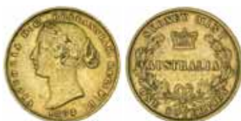
1006* Queen Victoria, second type, 1862. Fine.