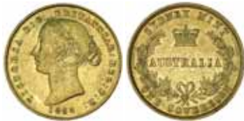
1002* Queen Victoria, second type, 1858. Very fine/good very fine.