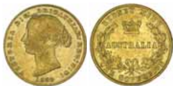
1004* Queen Victoria, second type, 1860. Very good/fine.