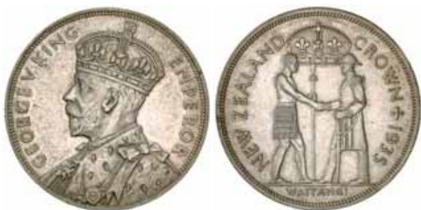
907* George V , Waitangi crown, 1935. Lightly toned, mirrored fields, uncirculated.