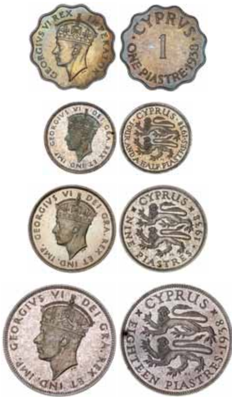
2112* Cyprus , George VI, proof one, four and a half, nine and eighteen piastres, 1938 (KM.23-26). Lightly toned, some spotting, nearly FDC - FDC. (4)