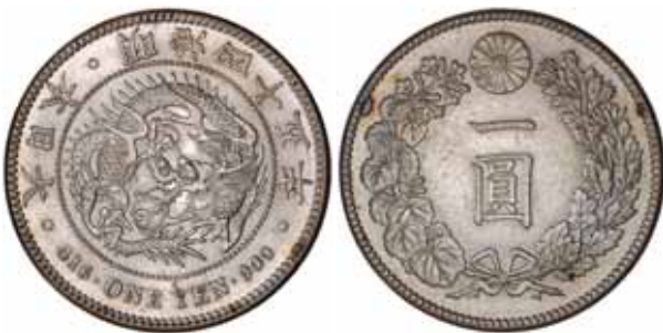
2253* Japan , Meiji era, one yen, year 45 (1912) (KM.Y.A25.3). Bright, virtually uncirculated.