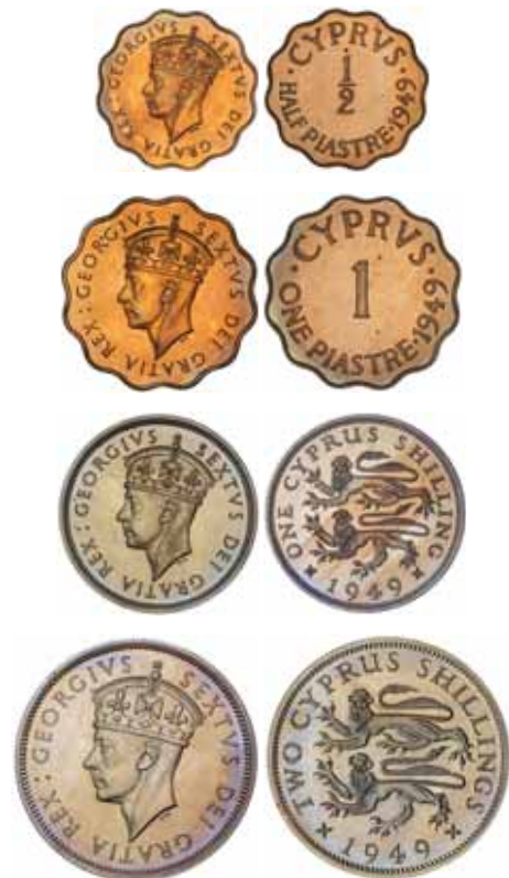
2114* Cyprus , George VI, proof set, 1949, half piastre, one piastre, shilling and two shillings (KM.PS4). Lightly toned, FDC and rare. (4)