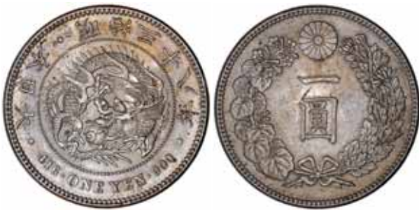
2252* Japan , Meiji era, silver one yen, Year 38 (1905) (KM.Y.A25.2). Extremely fine, scarce.