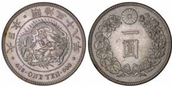
2251* Japan , Meiji era, one yen, year 38 (1905) (KM.Y.A25.3). Nearly uncirculated.