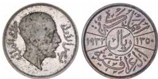
2206* Iraq , Faisal I, proof ryal, 1932, London mint (KM.101). Unevenly toned, obverse with light scratch under eye, nearly FDC.