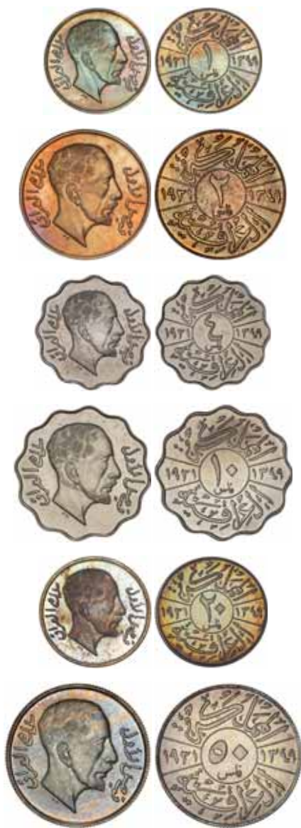
2205* Iraq , Kingdom, Faisal I, proof set, 1931 (AH 1349) one fil to fifty fils, London mint (KM.95, 96, 97, 98, 99, 100). Lightly toned, FDC. (6)