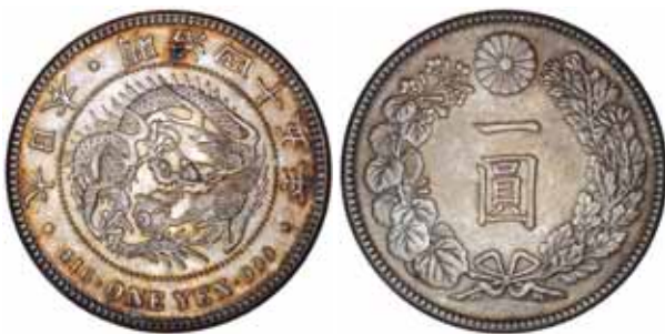
2254* Japan , Meiji era, one yen, year 45 (1912) (KM.Y.A25.3). Lightly toned, virtually uncirculated.