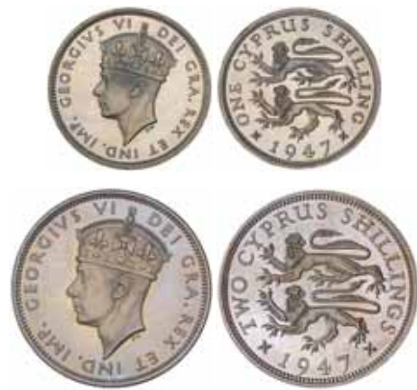
2113* Cyprus , George VI, proof shilling and two shillings, 1947, London mint (KM.27, 28). Lightly toned, FDC and rare. (2)