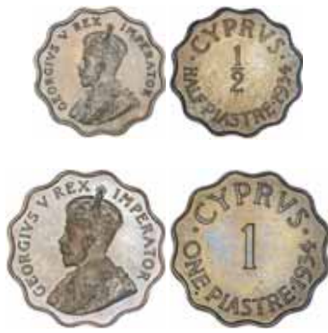
2111* Cyprus , George V, proof half piastre and one piastre, 1934 (KM.20, 21). Toned, FDC and rare. (2)