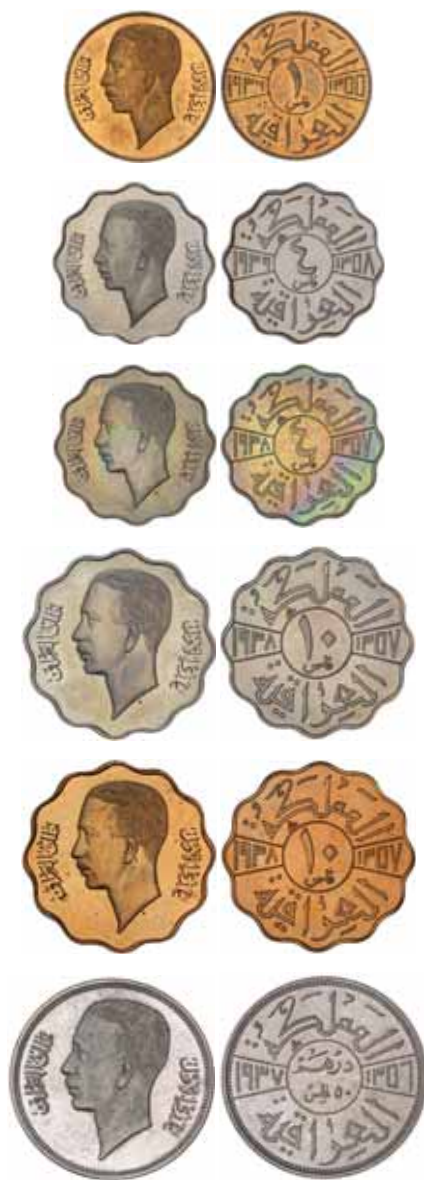
2207* Iraq , Ghazi I, proof coins, one fil, 1936 (AH 1355) (KM.102); four fils, 1938 (AH 1357) (KM.105); four fils, 1939 (AH 1358) (KM.105); ten fils, 1938 (AH 1357) (KM.103a) struck in cupro nickel; ten fils, 1938 (AH 1357) (KM.103b) struck in bronze; fifty fils, 1937 (AH 1356) (KM.104), all London mint. Lightly toned, nearly FDC - FDC. (6)