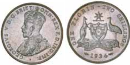
1588* George V, 1934. Lightly toned, nearly uncirculated.