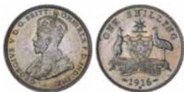
1600* George V, 1916M. Golden brown toned, uncirculated.