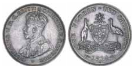
1577* George V, 1914H. Attractive olive and gun metal grey patina, well struck for this, uncirculated and very rare in this condition, one of the finest known. $20,000

Private purchase from Winsor & Sons in Sept 2002.