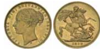
1435* Queen Victoria , 1879 Melbourne (McD.156). Good extremely fine. $500

The seriffed tail of the 4 is curved like a 3, possibly an overdate.