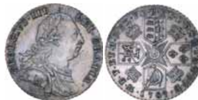
1346* Great Britain , George III, shilling, 1787 (S.3743). Attractively toned, nearly uncirculated. $150