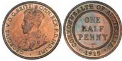
1709* George V, 1915H. Nearly full original mint red, lightly toned in centre of reverse, choice uncirculated and very rare in this condition, one of the finest known. $12,500