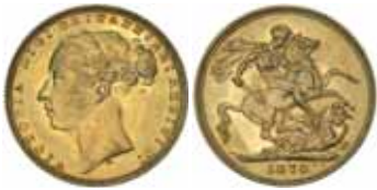
1429* Queen Victoria , 1874/3 (?) Melbourne. Satin or pearl-like mint bloom, choice uncirculated. $1,500