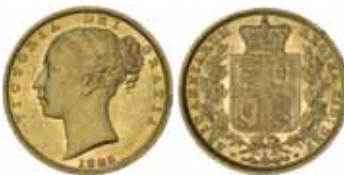
1420* Queen Victoria , 1885 Sydney. Original frosty mint bloom, uncirculated. $2,500