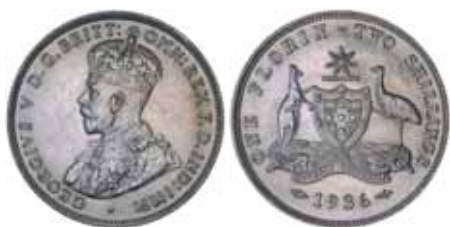
1591* George V, 1936. Uncirculated/choice uncirculated.