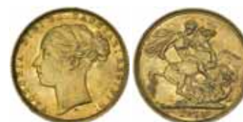
1425* Queen Victoria , 1872 Melbourne. Hairline scratch on neck, subdued original mint bloom nearly uncirculated and rare. $2,500