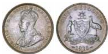
1599* George V, 1916M. Lightly toned, full original subdued mint bloom, choice uncirculated.