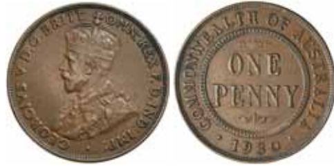
1694* George V , 1930 Indian die. Free of rim bruises and well struck, even brown, nearly very fine and rare. $20,000