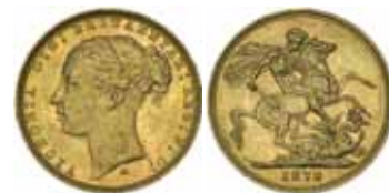
1436* Queen Victoria , 1879 Melbourne. Subdued mint bloom, nearly uncirculated. $500