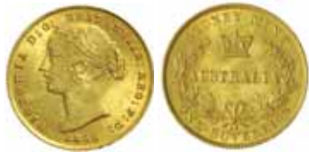
1401* Queen Victoria , second type, 1866. Subdued underlying frosty mint bloom, nearly uncirculated. $2,500