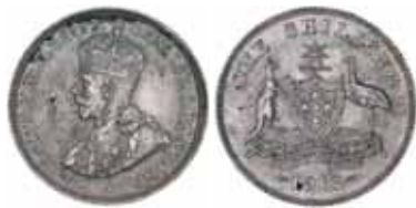
1597* George V, 1913. Subdued original mint bloom, nearly uncirculated and rare in this condition.