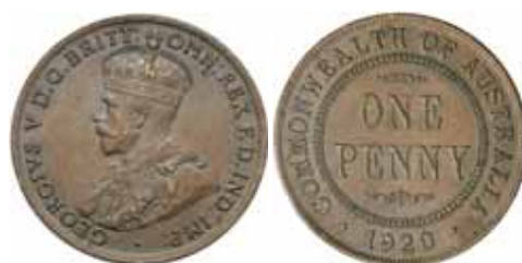
1686* George V , 1920 plain, Indian die. Hints of original colour, dusty blue-brown patina, good extremely fine and very rare in this condition. $1,000