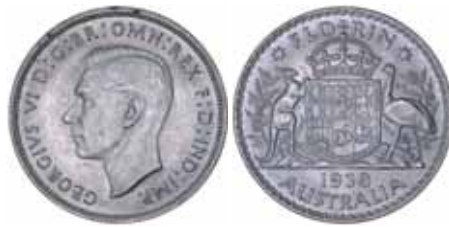
1592* George VI, 1938. Subdued mint bloom, uncirculated.