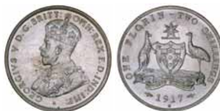
1580* George V, 1917M. Full original mint bloom, uncirculated/choice uncirculated. $2,500