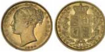
1417* Queen Victoria , 1884 Sydney. Minute reverse rim bruise at 2 o'clock, otherwise good extremely fine. $700