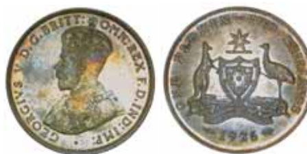
1582* George V, 1926. Iridescent toned, full original mint bloom, choice uncirculated and rare in this condition. $6,000

Ex W.G. & L.M. Wright Collection, Noble Numismatics Sale 89B (lot 1947).