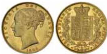
1419* Queen Victoria , 1885 Melbourne. Obverse with edge nick at 6 o'clock and reverse at 12 o'clock, good extremely fine. $350