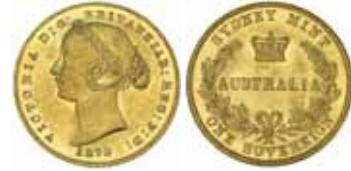
1405* Queen Victoria , second type, 1870. Minor field hairline behind head, otherwise full original mint bloom uncirculated/choice uncirculated. $2,500