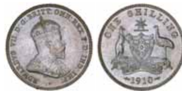
1594* Edward VII, 1910. Full original mint bloom, uncirculated.