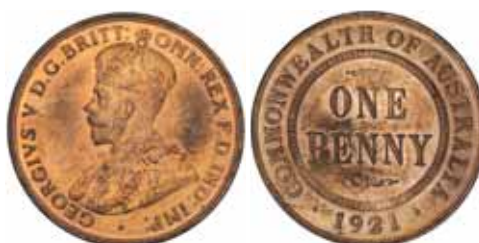
1687* George V , 1921 Indian die. Full original mint red, some carbon toned areas, uncirculated and rare in this condition, one of the finest known. $1,400