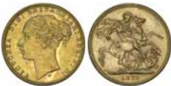
1431* Queen Victoria , 1876 Melbourne. Subdued original mint bloom, nearly uncirculated. $850