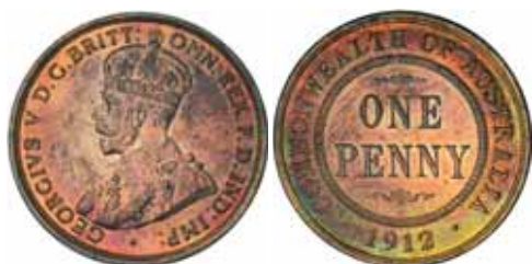
1681* George V , 1912H. Red and olive tone, full mint bloom, uncirculated and rare in this condition. $800