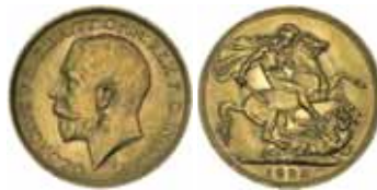
1504* George V , 1928 Melbourne. Choice uncirculated and rare, especially in this condition.

Ex Noble Numismatics Sale 80 (lot 1342).