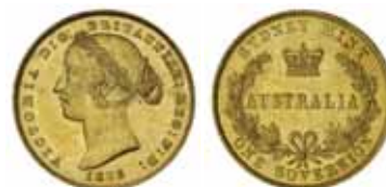
1393* Queen Victoria , second type, 1860. Re-entered 0 in date, minor surface marks, full mint bloom, obverse rim bruise at 9 o'clock, otherwise nearly choice uncirculated and very rare in this condition, one of the finest known.