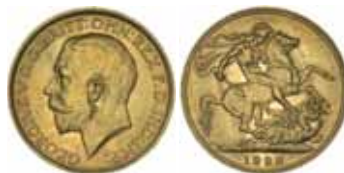
1505* George V , 1928 Melbourne. Nearly uncirculated and rare.