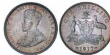
1602* George V, 1917M. Hairline die break emu tail to rim, attractive gold grey brown toned uncirculated, choice except for hairline below G to rim.