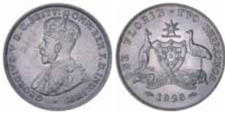
1586* George V, 1928. Well struck, subdued mint bloom, nearly uncirculated.