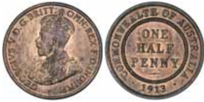
1707* George V, 1913. Red and brown, virtually uncirculated. $500