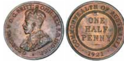
1715* George V, 1921. Red and brown, uncirculated. $300