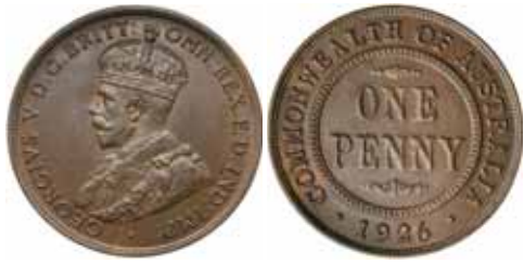
1690* George V , 1926 London die. Obverse peripheral die break, reverse die clashed, granular field trace of red on reverse, good extremely fine and rare in this condition. $350