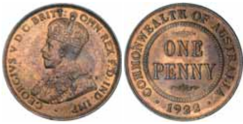
1688* George V , 1922 London die. Cleaned, red and brown uncirculated. $200