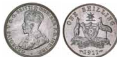
1596* George V, 1911. Extremely fine/good extremely fine.