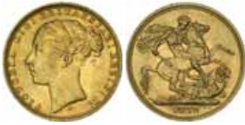
1426* Queen Victoria , 1872 Sydney. Light toned, good extremely fine. $750