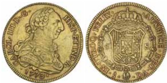
1340* Chile , Charles III, eight escudos, 1773 DA, Santiago Mint (KM.27). Light marks in obverse field, otherwise very fine. $1,200