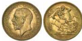
1508* George V , small head, 1929 Melbourne. Extremely fine and rare.

Ex Spink London Sale, March 1992 (lot 408).