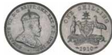
1595* Edward VII, 1910. Uncirculated.