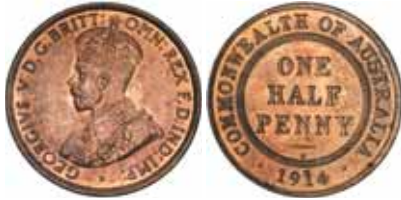
1708* George V, 1914H. Full original mint red, choice uncirculated and rare in this condition, one of the finest known. $2,000