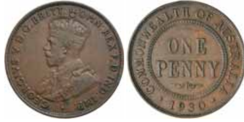
1695* George V , 1930 Indian die. Even brown patina, nearly very fine and rare. $20,000