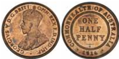
1710* George V, 1916I. Full mint red with some brilliance, choice uncirculated. $600