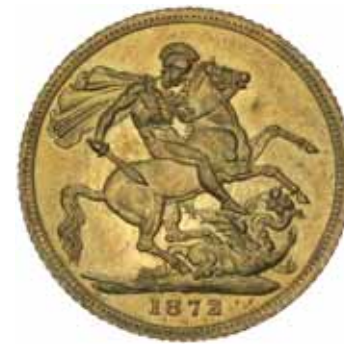
1424* Queen Victoria , 1872 Melbourne. Considerable original mint bloom, nearly uncirculated and very rare in this condition, one of the finest known. $5,000