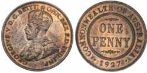
1691* George V , 1927 London die. Red and brown, nearly uncirculated. $100