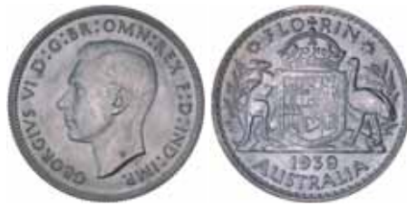
1593* George VI, 1939. Soft strike top left coat of arms, otherwise full original subdued mint bloom, uncirculated and rare thus.