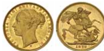
1437* Queen Victoria , 1879 Melbourne (McD.157). Good extremely fine/nearly uncirculated. $350