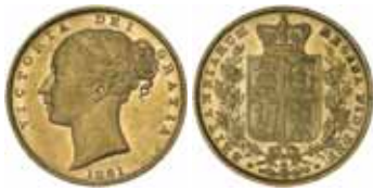
1416* Queen Victoria , 1881 Melbourne. Nearly extremely fine. $500