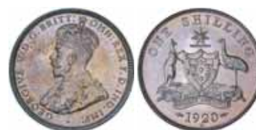
1603* George V, 1920M. Attractive crimson blue toned obverse, full original mint bloom, nearly gem uncirculated and one of the finest known.