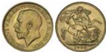
1501* George V , 1926 Sydney. Nearly uncirculated and very rare, especially in this condition, one of the finest known. $45,000