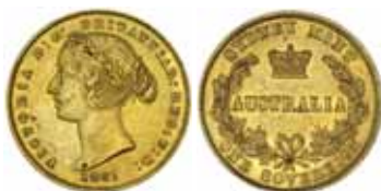
1394* Queen Victoria , second type, 1861. Lightly toned, relatively unmarked surfaces, extremely fine and rare in this condition.