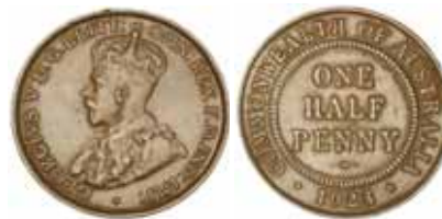
1717* George V, 1923. Reverse rim nick at 2 o'clock, medium brown, nearly very fine, with diagnostic peripheral die breaks on both sides. $2,000