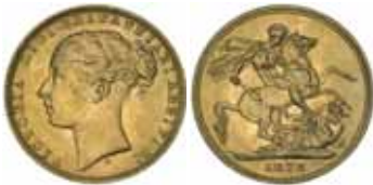
1428* Queen Victoria , 1873 Sydney. Considerable original mint bloom, nearly uncirculated/uncirculated. $1,000