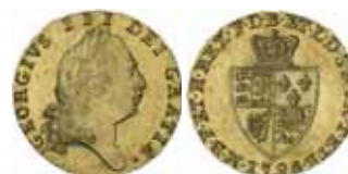
1345* Great Britain , George III, gold half guinea, 1798, fifth bust or spade type (S.3735). Good extremely fine/nearly uncirculated. $900

Private purchase from Spink London 22/5/1987.