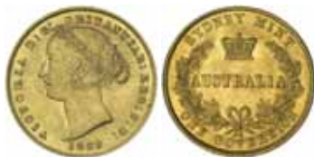
1402* Queen Victoria , second type, 1866. Contact mark on cheek, original mint bloom, good extremely fine. $1,000