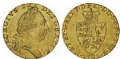
1341* Great Britain , George III, guinea, fifth bust or spade type, 1791 (S.3729). Nearly very fine/very fine. $700