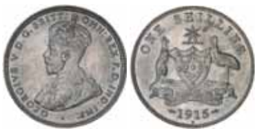
1598* George V, 1915H. Nearly full original frosty mint bloom, uncirculated and very rare in this condition, one of the finest known.