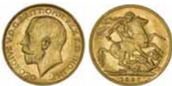
1502* George V , 1927 Perth. Nearly uncirculated/uncirculated and scarce. $600