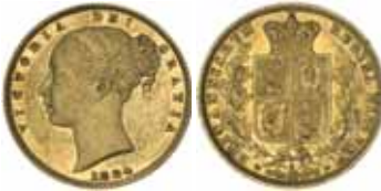
1418* Queen Victoria , 1884 Sydney. Extremely fine. $450