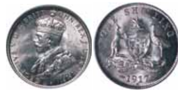
1601* George V, 1917M. Full original mint bloom, uncirculated.