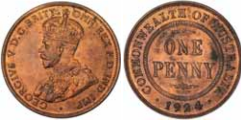
1689* George V , 1924 London die. Mostly red uncirculated. $450