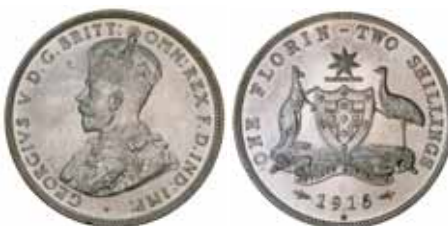
1579* George V, 1916M. Full original mint bloom, choice uncirculated. $4,000

Ex Noble Numismatics Sale 73 (lot 1483).