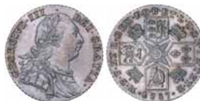
1347* Great Britain , George III, shilling, 1787 (S.3746). Extremely fine. $100