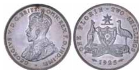
1581* George V, 1925. Well struck, full satin-like mint bloom, relatively unmarked surfaces, choice uncirculated. $1,250