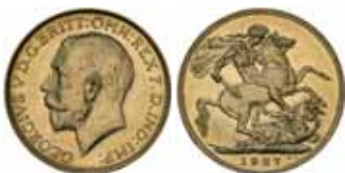
1503* George V , 1927 Perth. Nearly uncirculated and scarce. $600

Ex Noble Numismatics Sale 80 (lot 1342).