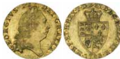
1344* Great Britain , George III, guinea, fifth bust or spade type, 1798 (S.3729). Good extremely fine. $600

Private purchase from Spink London 22/5/1987.