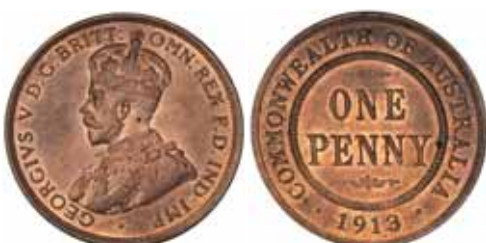
1682* George V , 1913. Red and brown, uncirculated and rare in this condition. $1,000