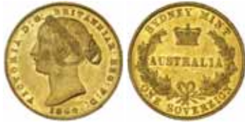
1399* Queen Victoria , second type, 1864. Some mint bloom, nearly extremely fine. $600