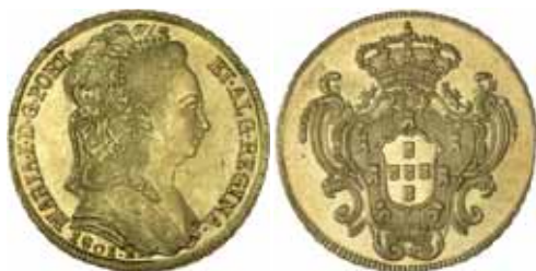
1339* Brazil , Mary I, six thousand four hundred reis, 1801 R (Rio) (KM.226.1). Nearly uncirculated/uncirculated. $1,750