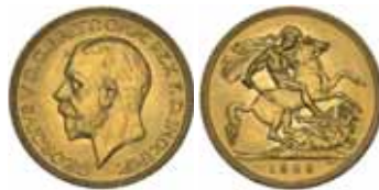
1507* George V , small head, 1929 Melbourne. Good extremely fine and rare.

Private purchase from Jaggards, 3 Sept 1990.