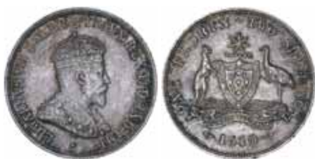
1576* Edward VII, 1910. Patchy toning, extremely fine. $500