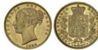
1422* Queen Victoria , 1886 Sydney. Nearly uncirculated. $400