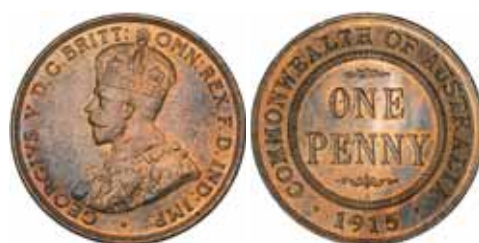
1683* George V , 1915H. Nearly full original mint red, choice uncirculated and rare in this condition. $3,000