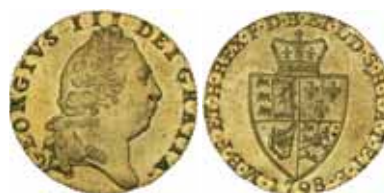
1343* Great Britain , George III, guinea, fifth bust or spade type, 1798 (S3729). Full original mint bloom, uncirculated. $1,200