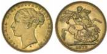
1427* Queen Victoria , 1873 Melbourne. Extremely fine. $400