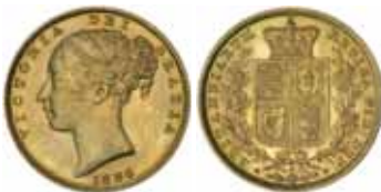
1421* Queen Victoria , 1886 Sydney. Nearly uncirculated. $600