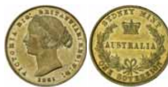
1395* Queen Victoria , second type, 1861. Some mint bloom, surface marking, otherwise extremely fine.