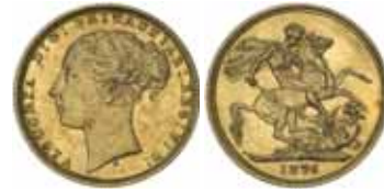
1432* Queen Victoria , 1876 Sydney. Lightly toned, nearly uncirculated. $750