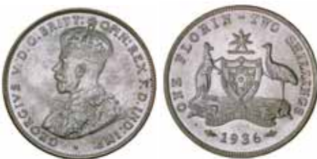
1590* George V, 1936. Full original mint bloom, gem uncirculated.