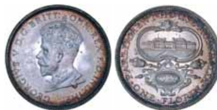
1583* George V, 1915H. Superb, with original mint bloom and peripheral edge toning, uncirculated. $200

Ex W.G. & L.M. Wright Collection, Noble Numismatics Sale 89B (lot 1947).