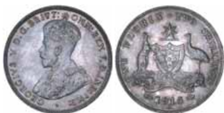
1578* George V, 1915H. Full original mint bloom, gold and brown toned highlights, choice uncirculated and very rare in this condition, one of the finest known. $10,000

Private purchase from Winsor & Sons in Sept 2002.