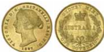
1403* Queen Victoria , second type, 1867. Relatively unmarked surfaces, good extremely fine. $900