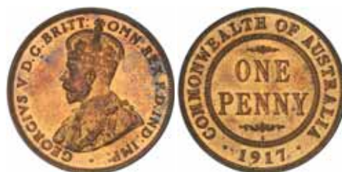
1684* George V , 1917I. Full brilliant proof-like mint red, gem uncirculated and rare thus. $1,000