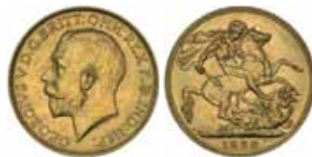
1506 George V , 1928 Perth. Nearly uncirculated.

Ex Noble Numismatics Sale 62 (lot 1540).