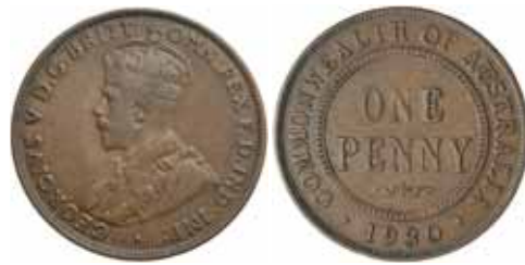
1696* George V , 1930 Indian die. Even brown patina, top scroll weak, otherwise good fine and free of rim knocks, rare. $18,000