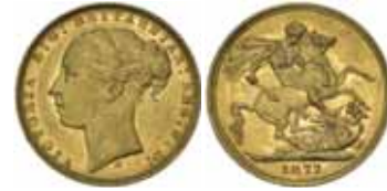
1433* Queen Victoria , 1877 Melbourne. Extremely fine. $400