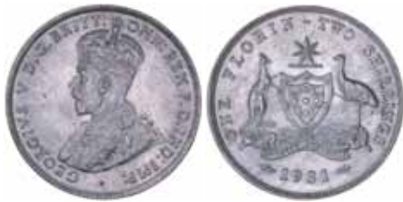
1587* George V, 1931. Full original subdued mint bloom, uncirculated.