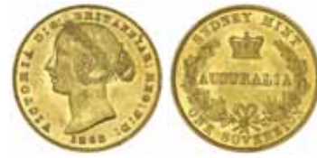
1404* Queen Victoria , second type, 1868. Considerable mint bloom, miniscule hairlines on obverse, otherwise uncirculated. $3,000