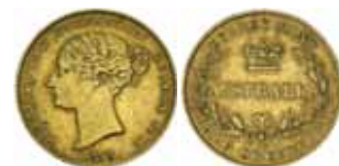
1407* Queen Victoria , first type, 1856. Graffito scratching behind neck, otherwise good very fine and rare in this condition. $2,000