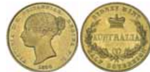
1406* Queen Victoria , first type, 1856. Minor hairline scratches on obverse, otherwise nearly extremely fine and rare thus. $2,000