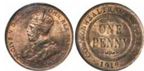
1685* George V , 1919 dot below scroll. Full original mint red with some dark grey carbon tone areas, uncirculated. $650