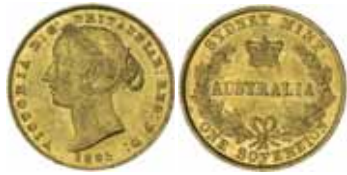
1400* Queen Victoria , second type, 1865. Nearly very fine. $500