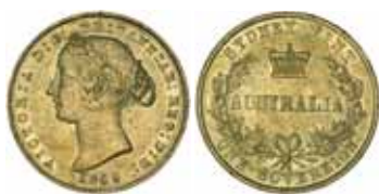
1392* Queen Victoria , second type, 1859. Good very fine and rare in this condition.