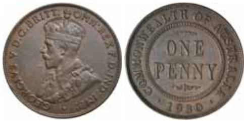
1692* George V , 1930 Indian die. Well struck, very fine and rare. $24,000