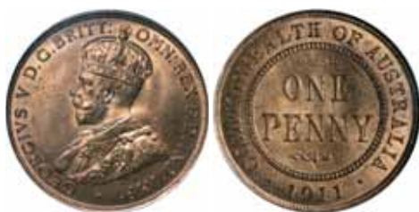
1680* George V , 1911. Full original mint red, uncirculated. $850