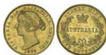
1397* Queen Victoria , second type, 1862. Minor obverse field marking, otherwise extremely fine and rare.