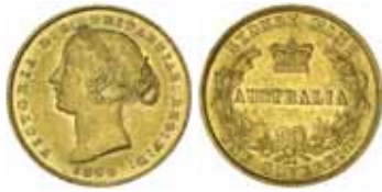
1398* Queen Victoria , second type, 1864. Struck from clashed reverse die, frosty mint bloom, nearly extremely fine. $700