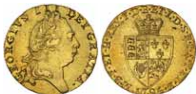
1342* Great Britain , George III, guinea, fifth bust or spade type, 1794 (S.3729). Good very fine. $750