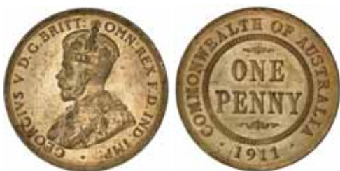
1679* George V , 1911. Full original mint red, uncirculated. $1,000