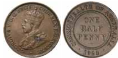
1716* George V, 1923. Peripheral die breaks both sides, rim nicks, otherwise brown patina, good very fine. $2,500