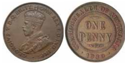
1693* George V , 1930 Indian die. Even brown patina, part centre diamond, nearly very fine and rare. $22,500