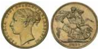
1430* Queen Victoria , 1874 Sydney. Hairline on neck, has been cleaned otherwise nearly uncirculated. $1,500

The seriffed tail of the 4 is curved like a 3, possibly an overdate.