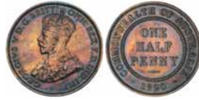
1714* George V, 1920. Die axis at 90 degrees, lightly cleaned, otherwise good extremely fine, wide date variety with small peripheral die break at top of obverse, very rare thus. $400