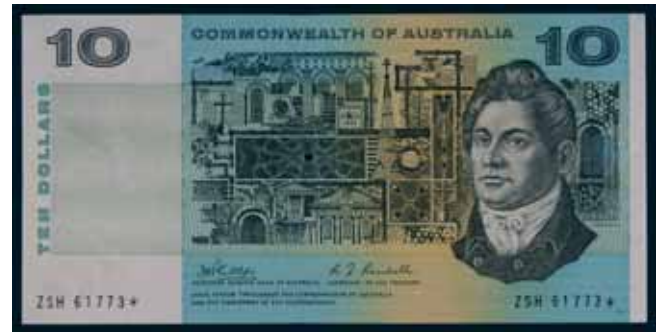
3480* Ten dollars , Phillips/Randall (1968) ZSH 61773* (R.303s). Nearly extremely fine.