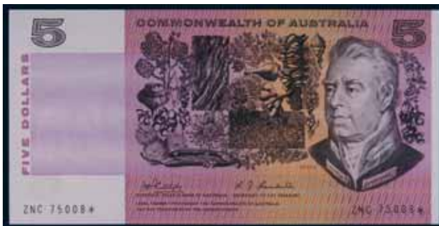
3460* Five dollars , Phillips/Randall (1969) ZNC 75008* (R.203s). Uncirculated. $10,000