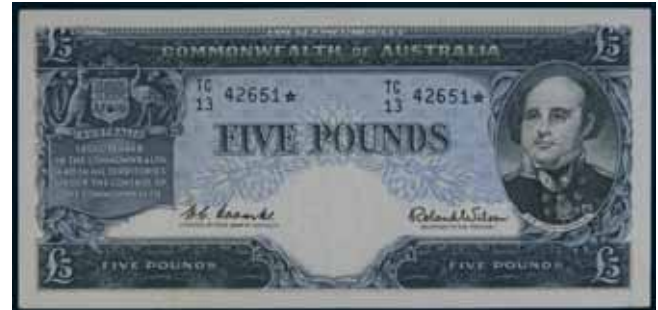
3426* Five pounds , Coombs/Wilson (1960) TC/13 42651* (R.50s). Flattened, otherwise very fine.