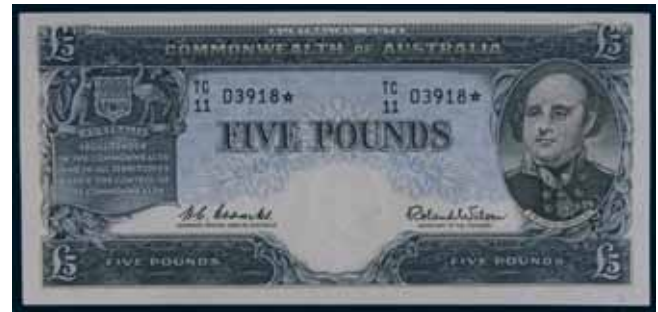
3424* Five pounds , Coombs/Wilson (1960) TC/11 03918* (R.50s). Flattened of centre fold, good very fine and rare.