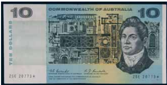
3478* Ten dollars , Coombs/Randall (1967) ZSE 20773* (R.302s). Tiny tear at top on security thread and on left corner fold, otherwise good fine.