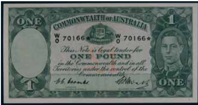
3413* One pound , Coombs/Watt (1949) W/O 70166* (R.31s). Nearly extremely fine and very rare in this condition. $20,000