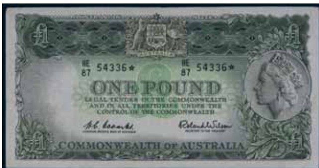
3423* One pound , Coombs/Wilson (1961) HE/87 54336* (R.34bs). Original body good fine.