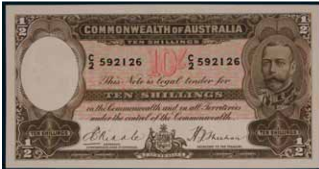
3130* Ten shillings , Riddle/Sheehan (1933) C/2 592126 (R.9). Flattened of three vertical folds, good body and colour, extremely fine and very rare in this condition.