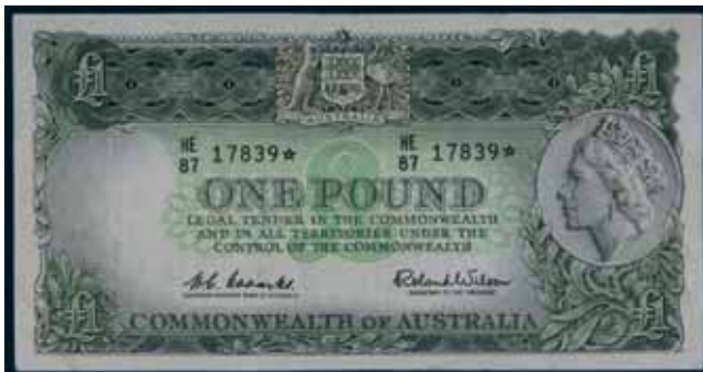
3422* One pound , Coombs/Wilson (1961) HE/87 17839* (R.34bs). Folds and creases, otherwise original and nearly very fine.