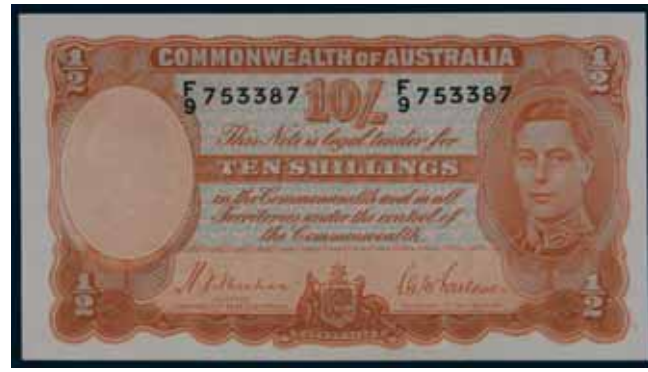
3143* Ten shillings , Sheehan/McFarlane (1939) F/9 753387 (R.12). Extremely fine. $200