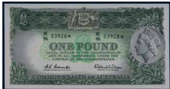
3419* One pound , Coombs/Wilson (1961) HE/96 53928* (R.34as). Nearly uncirculated and very rare thus. $20,000