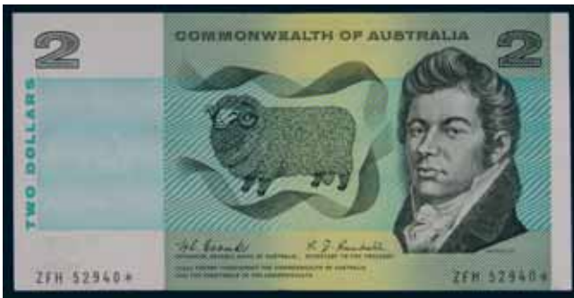
3450* Two dollars , Coombs/Randall (1967) ZFH 52940* (R.82s) last serial prefix. Good extremely fine and very scarce.