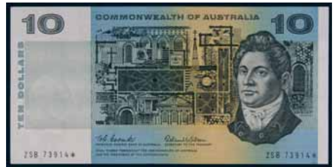
3463* Ten dollars , Coombs/Wilson (1966) ZSB 73914* (R.301s). Extremely fine or better. $2,500