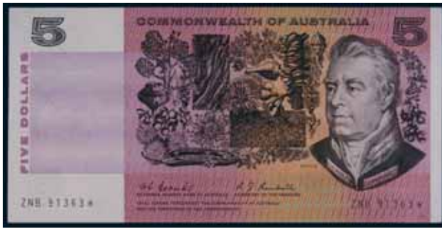
3458* Five dollars , Coombs/Randall (1967) ZNB 91363*. Trimmed, flattened of folds, otherwise nearly extremely fine. $2,000