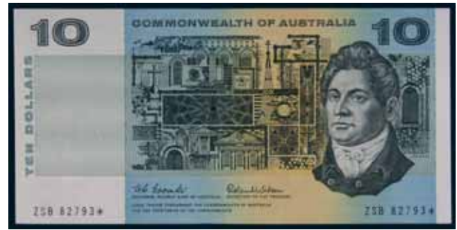
3462* Ten dollars , Coombs/Wilson (1966) ZSB 82793* (R.301s). Crisp, good extremely fine. $3,000