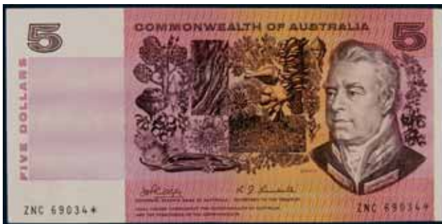
3461* Five dollars , Phillips/Randall (1969) ZNC 69034* (R.203s). Flattened of centre fold, otherwise good extremely fine and rare. $6,000