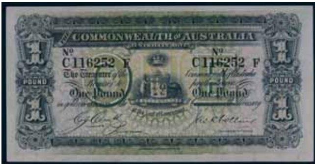
3191* One pound , Cerutti/Collins (1918) C 116252 F (R.21). Good very fine. $2,500