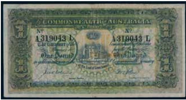
3189 One pound , Collins/Allen (1913) A 319043 L (R.18e). A full note, nearly fine. $1,500