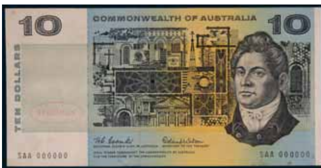
3407* Ten dollars , Coombs/Wilson (1966), SAA 000000 type one specimen note (McD.DS4). Tone spots, flattened, otherwise good very fine and very rare. $2,800