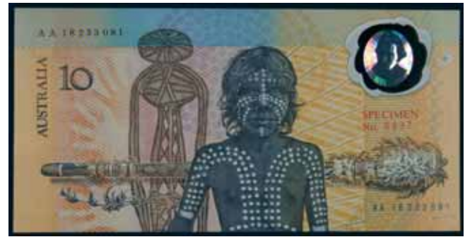
3409* Ten dollars , Johnston/Fraser (1988) Bicentennial AA 18233081, 'SPECIMEN' No.0837 overprinted in red (McD.DS29). In a folder; uncirculated and very rare. $20,000