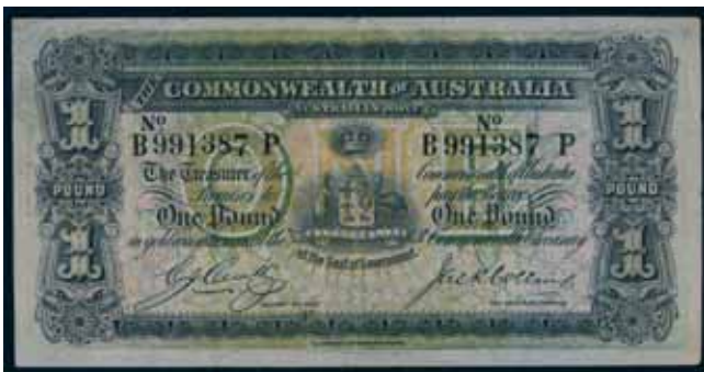
3192* One pound , Cerutti/Collins (1918) B 991387 P (R.21). Flattened of quarter folds, otherwise nearly very fine. $1,250