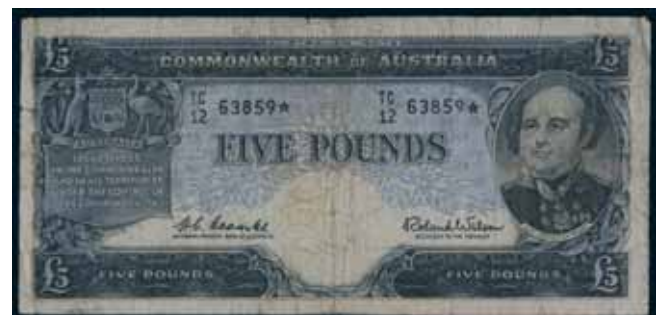
3427* Five pounds , Coombs/Wilson (1960) TC/12 63859* (R.50s). Four mm tear left margin in central pin hole, extensive folds and creases, otherwise nearly very good.