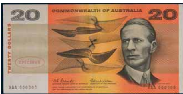
3408* Twenty dollars , Coombs/Wilson (1966) XAA 000000, type one specimen note (McD.DS5). Flattened of centre fold, otherwise good very fine and very rare. $4,000