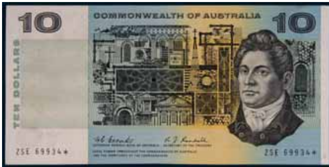
3476* Ten dollars , Coombs/Randall (1967) ZSE 69934* (R.302s). Flattened, good very fine and rare.