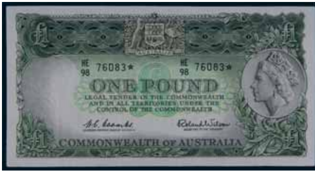
3420* One pound , Coombs/Wilson (1961) HE/98 76083* (R.34as). Nearly very fine.