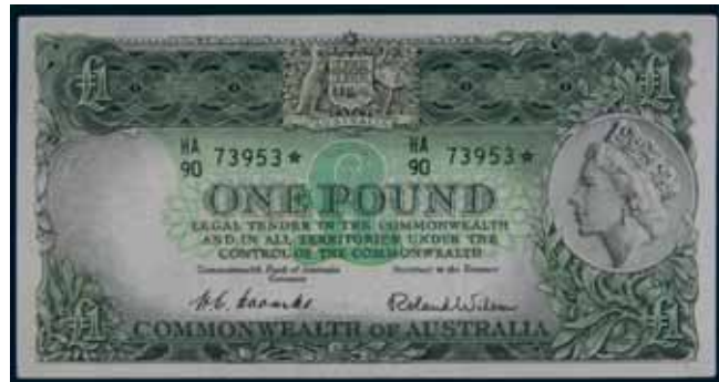
3417* One pound , Coombs/Wilson (1953) HA/90 73953* (R.33s). Very fine. $2,400