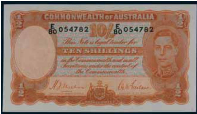
3147 Ten shillings , Sheehan/McFarlane (1939) to Coombs/Wilson (1961) (R.12, 13, 16, 17). Good very fine - nearly uncirculated. (4) $200