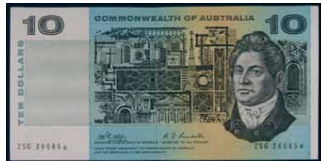
3482* Ten dollars , Phillips/Randall (1968) ZSG 26085* (R.303s). Teller corner fold top right, otherwise good very fine.