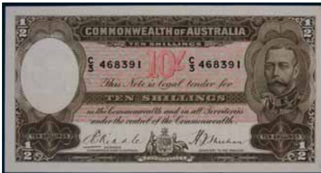
3131* Ten shillings , Riddle/Sheehan (1933) C/3 468391 (R.9). Cleaned and flattened, with faint left margin tear repair, limp body to paper otherwise, good colour, very fine and rare.