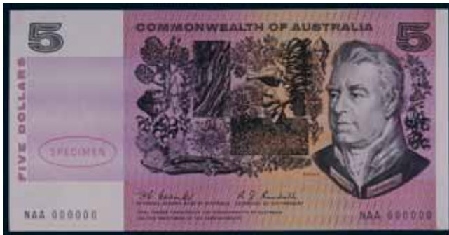
3405* Five dollars , Coombs/Randall (1967) type one specimen note, NAA 000000 (McD.DS3). Nearly uncirculated and rare. $12,000