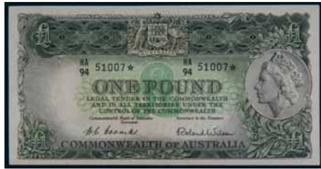
3416* One pound , Coombs/Wilson (1953) HA/94 51007* (R.33s). Toned, good very fine. $3,500