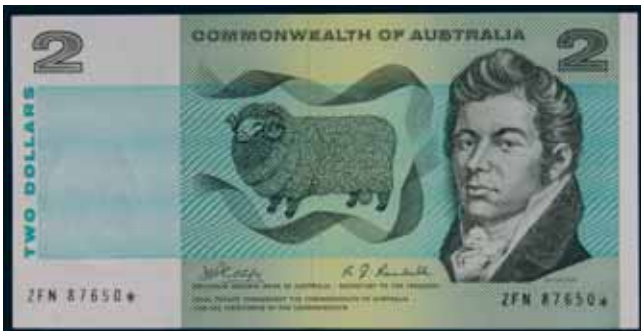
3452* Two dollars , Phillips/Randall (1968) ZFN 87650* (R.83s). Crisp, extremely fine.