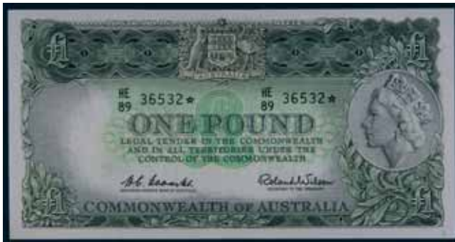
3421* One pound , Coombs/Wilson (1961) HE/89 36532* (R.34bs). Flattened of folds and creases, otherwise good very fine.