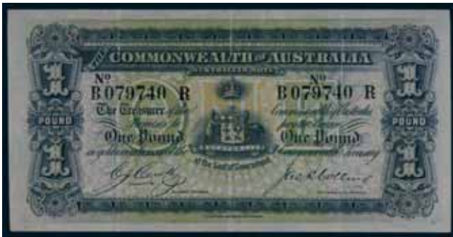
3190* One pound , Cerutti/Collins (1918) B 079740 R (R.21). Three vertical folds, flattened, otherwise very fine or better. $3,000