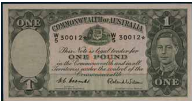
3415* One pound , Coombs/Wilson (1952) W/5 30012* (R.32s). Repair bottom margin extreme right, flattened of centre fold, otherwise good fine and rare. $8,000