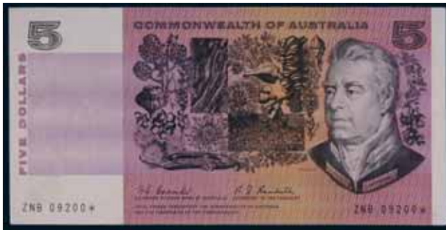
3459* Five dollars , Coombs/Randall (1967) ZNB 09200* (R.202s). Frail or thinned bottom right corner, otherwise very fine and scarce. $1,500