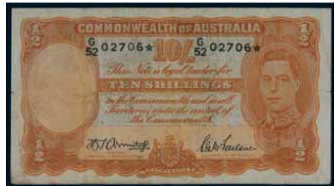
3410* Ten shillings , Armitage/McFarlane (1942) G/52 02706* (R.13s). Very good. $75,000