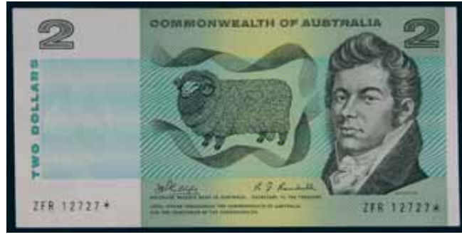
3454* Two dollars , Phillips/Randall (1968) ZFR 12727* (R.83s). Flattened, otherwise good very fine.