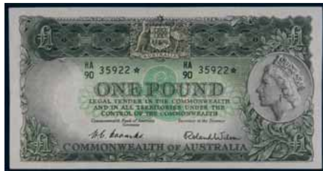
3418* One pound , Coombs/Wilson (1953) HA/90 35922* (R.33s). Horizontal and vertical folds and creases, otherwise nearly very fine. $1,400