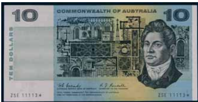
3477* Ten dollars , Coombs/Randall (1967) ZSE 11113* (R.302s). Pin-holes, nearly very fine.