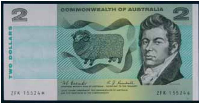
3449* Two dollars , Coombs/Randall (1967) ZFK 15524* (R.82s). Uncirculated.