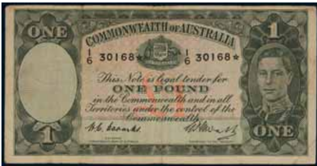
3414* One pound , Coombs/Watt (1949) I/6 30168* (R.31s). Very good. $1,400