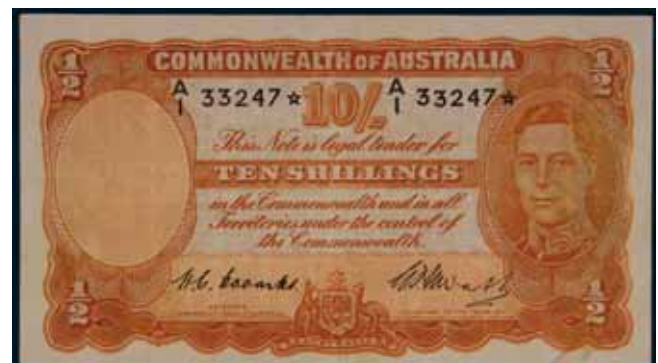
3411* Ten shillings , Coombs/Watt (1949) A/1 33247* (R.14s). Flattened, otherwise good fine and rare. $2,000