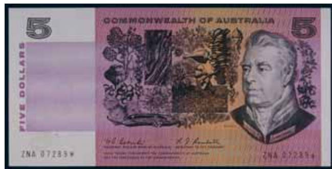
3457* Five dollars , Coombs/Randall (1967) ZNA 07289* (R.202). Light centre fold, extremely fine.