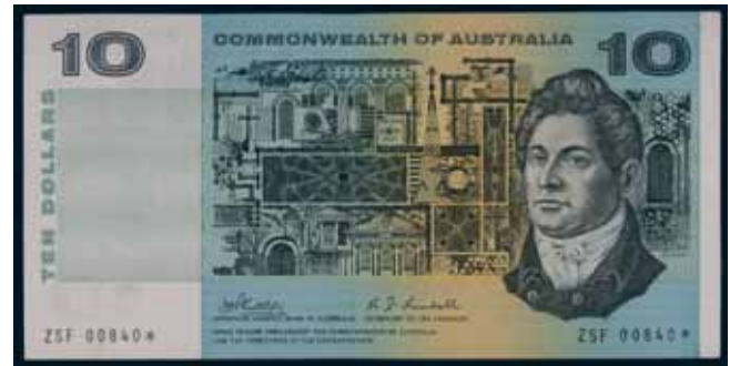
3481* Ten dollars , Phillips/Randall (1968) ZSF 00840* (R.303s). Flattened, very fine or better.