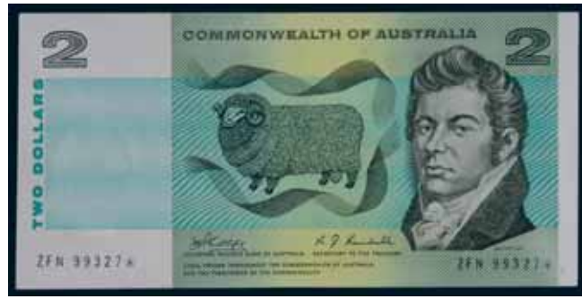
3453* Two dollars , Phillips/Randall (1968) ZFN 99327* (R.83s). Good extremely fine and scarce.