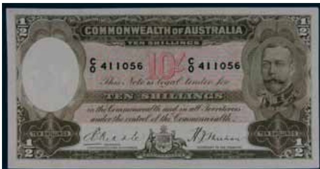
3132* Ten shillings , Riddle/Sheehan (1933) C/0 411056 (R.9). Cleaned, flattened, otherwise fine and rare.