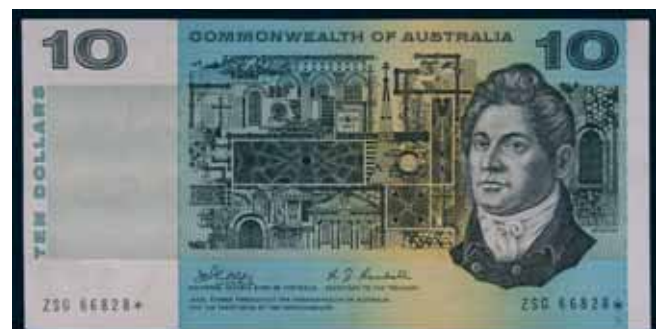
3483* Ten dollars , Phillips/Randall (1968) ZSG 66828* (R.303s). Good very fine.