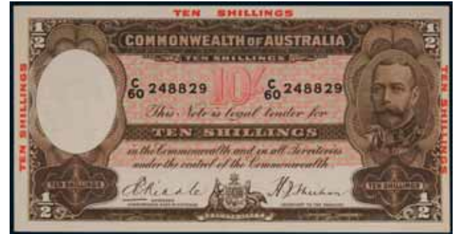
3135* Ten shillings , Riddle/Sheehan (1934) C/60 248829 (R.10). Flattened of centre fold and horizontal fold, possibly right edge trimmed, otherwise extremely fine and rare in this condition.