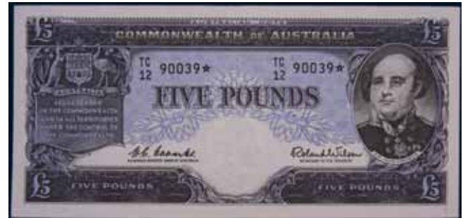
3425* Five pounds , Coombs/Wilson (1960) TC/12 90039* (R.50s). Flattened of centre fold, some original body to paper, good very fine and rare in this condition.