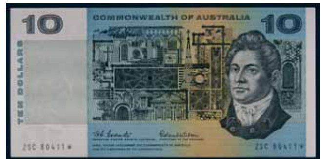
3465* Ten dollars , Coombs/Wilson (1966) ZSC 80411* (R.301s). Extremely fine. $1,000