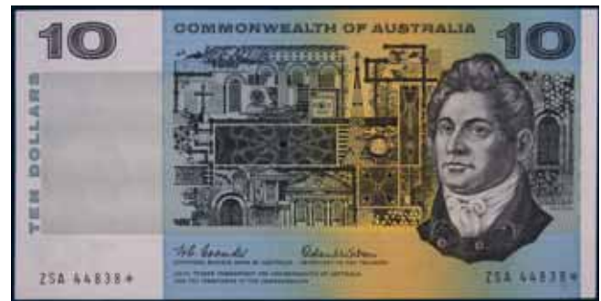
3464* Ten dollars , Coombs/Wilson (1966) ZSA 44838* (R.301s). Flattened but crisp body, good extremely fine. $1,200