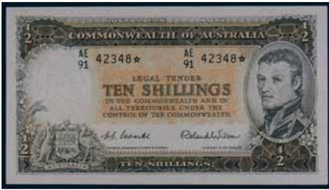
3412* Ten shillings , Coombs/Wilson (1954) AE/91 42348* (R.16s). Cleaned and flattened, nearly very fine and rare. $4,500