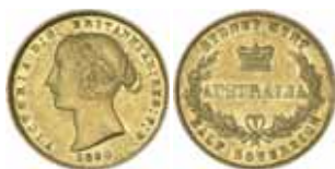
1389* Queen Victoria , second type, 1860. Some surface marks, otherwise nearly extremely fine and rare in this condition.