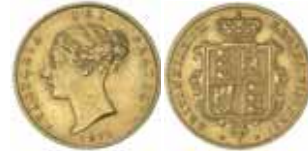
1467* Queen Victoria , 1871 Sydney. Good very fine.