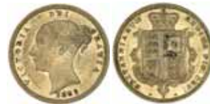
1470* Queen Victoria , 1882 Sydney. Some mint bloom, good very fine and rare.

Taken from jar in cornerstone of S. Hoffnung & Co Ltd premises 165/7 Pitt St Sydney, resumed by Commonwealth Government 12th December 1936. Jar was placed there in 1881.