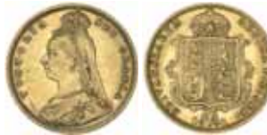
1477* Queen Victoria , 1891 Sydney, without JEB (McD.38a). Nearly extremely fine/extremely fine.