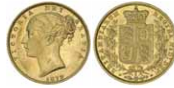
1400* Queen Victoria, 1879 Sydney. Nearly uncirculated. $750

Ex Douro Cargo (lot 1262 part) and Noble Numismatics Sale 53 (lot 3601).