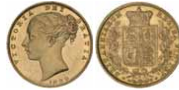
1401* Queen Victoria, 1880 Sydney. Nearly uncirculated. $750

Ex Douro Cargo (lot 1262 part) and Noble Numismatics Sale 53 (lot 3617).