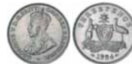
1700* George V, 1934. Lightly polished, otherwise well struck uncirculated.

Ex C. Wolzak Collection (acquired 24 Aug 2001).