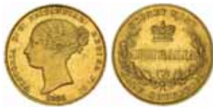
1388* Queen Victoria , first type, 1856, with filleted head of Victoria left by James Wyon. Subdued full original mint bloom, minute surface marks, otherwise uncirculated and very rare in this condition, one of the finest known.