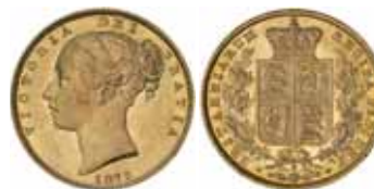
1393* Queen Victoria , 1872 Sydney. Good extremely fine.