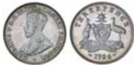
1692 George V, 1926. Choice uncirculated.