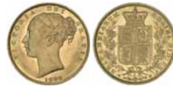
1403* Queen Victoria, 1884 Sydney. Attractive mint bloom, uncirculated. $750