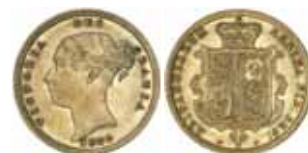
1471* Queen Victoria , 1883 Sydney (McD.25a). Nearly extremely fine.