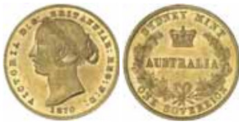
1387* Queen Victoria , 1870. Nearly uncirculated.