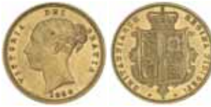
1473* Queen Victoria , 1884 Melbourne. Nearly uncirculated and rare in this condition.