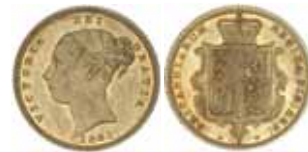
1469* Queen Victoria , 1881 Sydney. Brush marks on obverse otherwise nearly uncirculated.