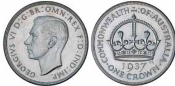
1542* George VI , 1937. Well struck, minor contact marks, cleaned with flan polishing lines clear, choice uncirculated and rare thus . $350