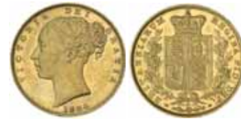
1402* Queen Victoria, 1884 Melbourne. Good extremely fine. $600

Ex Douro Cargo (lot 1262 part) and Noble Numismatics Sale 53 (lot 3617).