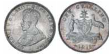
1592* George V, 1911. Attractive full mint bloom with light toning, choice uncirculated and rare in this condition.

Ex C. Wolzak Collection (acquired 13 Sep 2006).