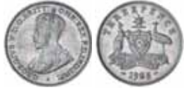
1691* George V, 1925. Nearly uncirculated, reverse brilliant.