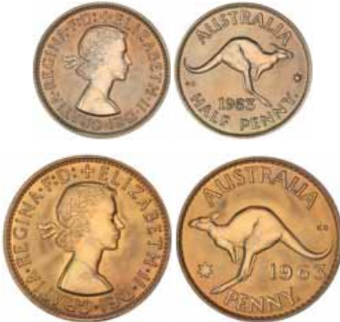
1538* Elizabeth II , Perth Mint proof set, 1963. FDC . (2) $1,500