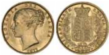
1397* Queen Victoria, 1877 Sydney. Nearly uncirculated. $600

Ex Douro Cargo (lot 1496 part) and Noble Numismatics Sale 53 (lot 3568).