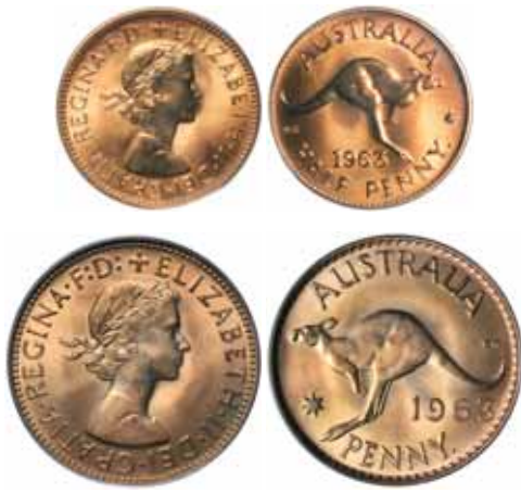
1537* Elizabeth II , Perth Mint proof set, 1963. FDC . (2) $1,750 Both slabbed by PCGS as PR66RD.