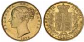
1399* Queen Victoria, 1879 Sydney. Minor obverse contact marks, otherwise uncirculated. $1,400

Ex Douro Cargo (lot 1259 part) and Noble Numismatics Sale 53 (lot 3589).