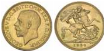
1465* George V , small head, 1930 Melbourne. Nearly uncirculated and scarce.