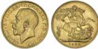
1463* George V , 1922 Sydney. Rim bruise at 3 o'clock on the reverse otherwise extremely fine and extremely rare.