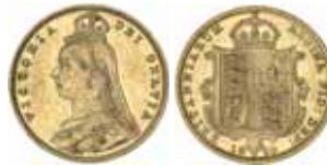
1478* Queen Victoria , Jubilee head, 1893 Melbourne. Considerable mint bloom, nearly uncirculated and rare in this condition.