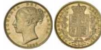
1405* Queen Victoria, 1885 Sydney. Minor surface marking otherwise nearly uncirculated. $500