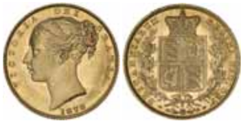
1398* Queen Victoria, 1878 Sydney. Nearly uncirculated. $600

Ex Douro Cargo (lot 1516 part) and Noble Numismatics Sale 53 (lot 3574).