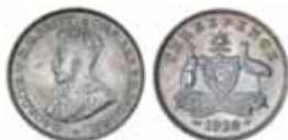
1696* George V, 1928. Lightly toned, uncirculated/choice uncirculated.