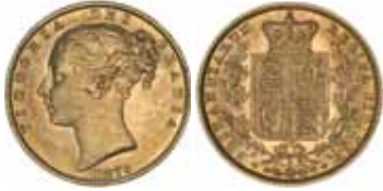
1396* Queen Victoria, 1875 Sydney. Planchet flaw in front of ear lobe, otherwise uncirculated. $1,600

Ex Douro Cargo (lot 1065) and Noble Numismatics Sale 53 (lot 3562).