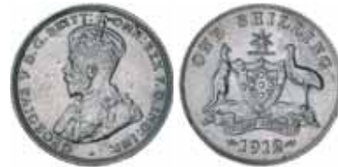
1593* George V, 1912. Extremely fine and rare.