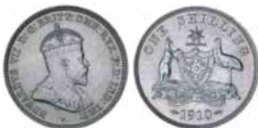
1590* Edward VII, 1910. Has been dipped otherwise uncirculated.