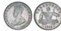
1697* George V, 1928. Die polishing, well struck, uncirculated.