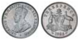
1690* George V, 1925. Uncirculated.