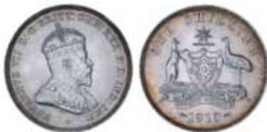
1589* Edward VII, 1910. Well struck with high rim, peripheral golden tone on reverse, probably has been wiped long ago, uncirculated/choice uncirculated.

With accompanying letter from Commonwealth Treasury Melbourne stating 'The accompanying shilling, which is one of a parcel of 112 - the first coins issued by the Commonwealth of Australia - is forwarded to (handwritten in ink) 'Senator the Hon Sir (name blacked out)' with the compliments of the Ministers of State for the Commonwealth. 7th March 1910.'