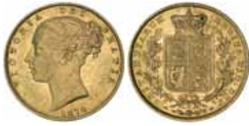
1395* Queen Victoria, 1874 Melbourne. Good extremely fine. $750

Ex Douro Cargo (lot 1065) and Noble Numismatics Sale 53 (lot 3562).