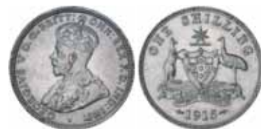
1595* George V, 1915. Hairline scratch above shoulder, slightly polished, well struck and uncirculated and very rare in this condition.