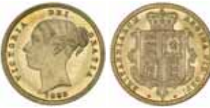
1472* Queen Victoria , 1883 Sydney (McD.25a). Full original mint bloom, choice uncirculated and very rare in this condition, one of the finest known.