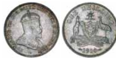
1591* Edward VII, 1910. Deep iridescent tone, uncirculated.