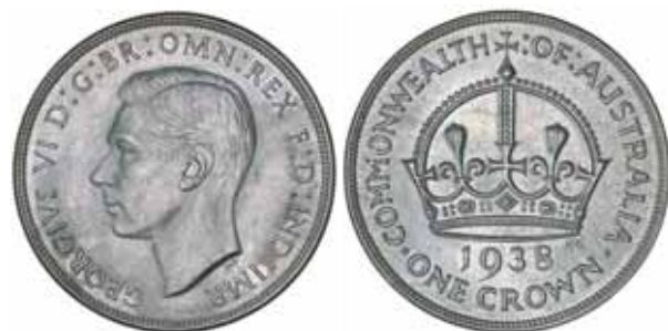
1543* George VI , 1937 (2) and 1938. Uncirculated - choice uncirculated . (3) $550