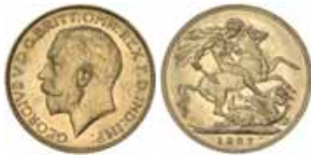
1464* George V , 1927 Perth. Nearly uncirculated and scarce.