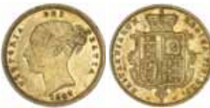
1474* Queen Victoria , young head, 1887 Melbourne. Minor surface marks otherwise nearly extremely fine and rare in this condition.