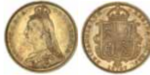
1476* Queen Victoria , Jubilee head, 1887 Sydney (McD.32a). Old red tone, nearly uncirculated and rare in this condition.