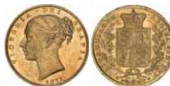
1394* Queen Victoria , 1872 Melbourne. Edge damage on reverse at 5 o'clock, extremely fine/good extremely fine.