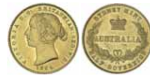
1391* Queen Victoria , second type, 1864. Cut under braid, contact marks in reverse field otherwise frosty original mint bloom, uncirculated and very rare in this condition.