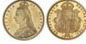
1475* Queen Victoria , Jubilee head, 1887 Melbourne (McD.33). Proof-like uncirculated.