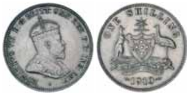
1588* Edward VII, 1910. Toned, uncirculated.