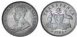
1693* George V, 1926. Lightly toned, uncirculated.