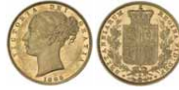
1404* Queen Victoria, 1885 Melbourne. Nearly uncirculated/proof-like uncirculated. $1,000