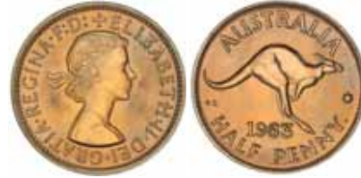
1541* Elizabeth II , Perth Mint proof halfpenny, 1963. Nearly FDC . $500