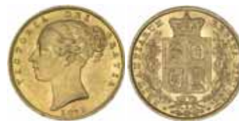
1392* Queen Victoria , 1871 Sydney W.W. incuse. Some mint bloom, extremely fine or better.