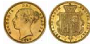
1468* Queen Victoria , 1880 Sydney (McD.20a). Obverse buffed, nearly extremely fine/good extremely fine.