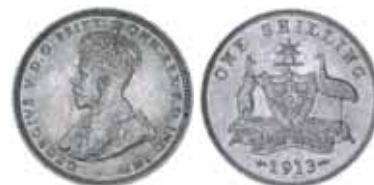
1594* George V, 1913. Light grey tone, well struck, nearly uncirculated and rare in this condition.