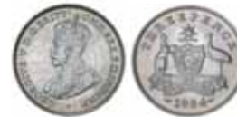
1699* George V, 1934. Close scroll on right, full original mint bloom with light golden tone, choice uncirculated.