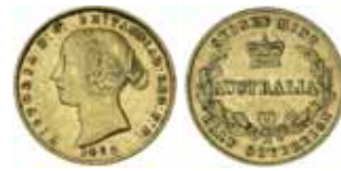
1390* Queen Victoria , second type, 1862. Nearly very fine.