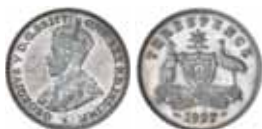
1695* George V, 1927. Light golden brown tone, uncirculated.