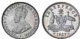
1694* George V, 1927. Choice uncirculated/gem uncirculated.