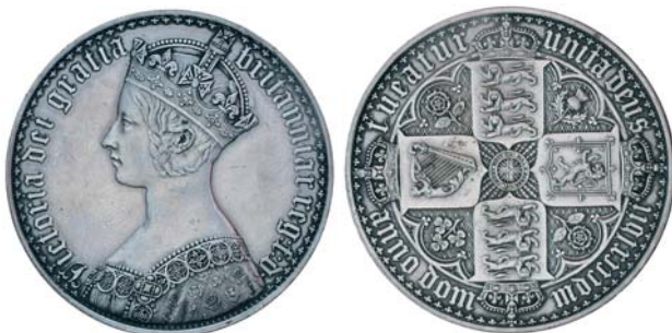
2137* Queen Victoria , Gothic crown, 1847, lettered edge (S.3883). Cleaned, good extremely fine. $1,500