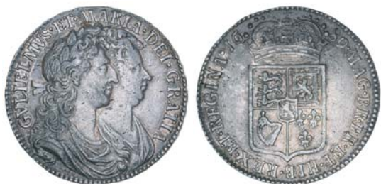
1991* William and Mary , halfcrown, first busts, first reverse, 1689, caul only frosted, no pearls (S.3434; ESC 506). Good very fine.