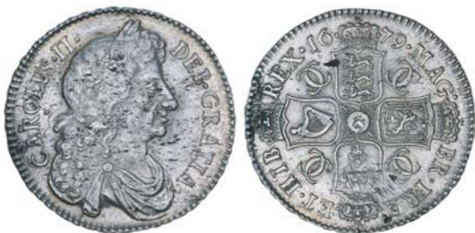
1988* Charles II, halfcrown, fourth bust, 1679 decns error for decvs (S.3367; ESC.483). Cleaned, carbon flecking on obverse, adjustment marks at French arms shield, otherwise good very fine and rare.