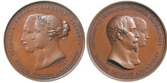
2248* Queen Victoria Visit to Paris, Napoleon III Visit to London, 1855 , in bronze (41mm) by L.C.Wyon, obverse, conjoined busts of Queen Victoria and Prince Albert, reverse, conjoined busts of Napoleon III and Empress Eugenie (BHM 2560, Eimer 1498). Nearly FDC.