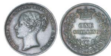
2143* Queen Victoria , young head shilling, 1859, no WW, (S.3904, ESC 1307). Grey peripheral tone, nearly uncirculated and very scarce. $240