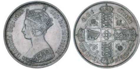
2140* Queen Victoria , Gothic florin, 1852 (S.3891). Extremely fine. $150