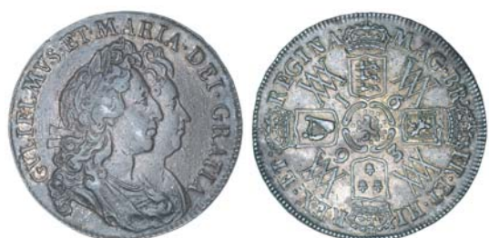
1994* William and Mary , halfcrown, second busts, 1693/over inverted 3 (S.3436; ESC 521). Toned obverse, nearly very fine.