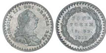
2104* George III, silver three shillings bank token, 1811 (S.3769, ESC 969). Good extremely fine. $170