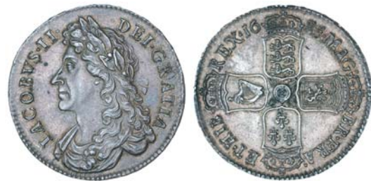
1989* James II, halfcrown, first bust, 1685 (S.3408). Beautifully struck with light grey and golden toning, good extremely fine and very rare in this condition, one of the finest known.