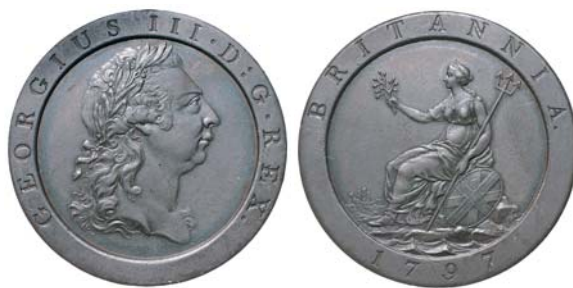
2111* George III, pattern cartwheel penny, 1797, large head right (Peck 1090). Even grey brown patina, nearly extremely fine and rare.