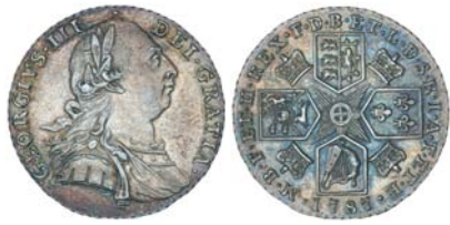
2100* George III, shilling, 1787 (S.3743). Good extremely fine. $150