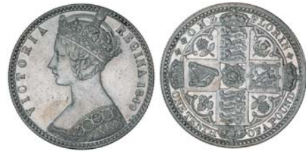
2139* Queen Victoria , Godless florin, 1849 (S.3890). Extremely fine. $150