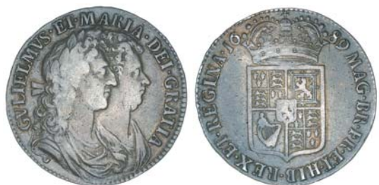
1992* William and Mary , halfcrown, first busts, second reverse, 1689 caul only frosted, pearls (S.3435; ESC.510). Evenly worn, toned, fine.