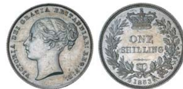
2142* Queen Victoria , silver shilling, young head, 1853 (S.3904, ESC 1300). Light peripheral toning, good extremely fine/nearly uncirculated. $200