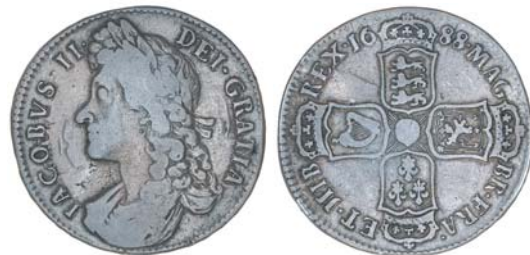
1990* James II, halfcrown, second bust, 1688 (S.3409). Die clashed, toned very good.