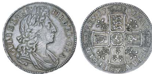
1995* William III , halfcrown, 1701 plumes (S.3496; ESC567). Light tone, very fine/good very fine and rare.