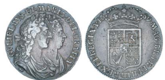
1993* William and Mary , halfcrown, first busts, second reverse, 1689, no frosting, no pearls (S.3435; ESC.512). Toned, nearly very fine.