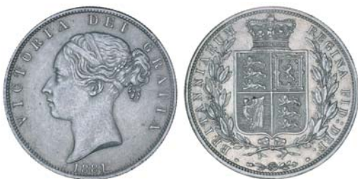
2138* Queen Victoria , young head, halfcrown, 1881 (S.3889). Nearly uncirculated. $150