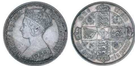
2141* Queen Victoria , Gothic florin, 1880 (S.3900). Toned, nearly extremely fine. $150