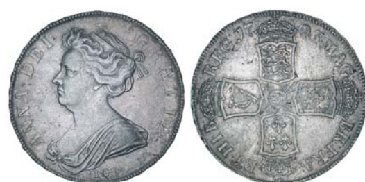
1996* Anne , before Union with Scotland, halfcrown, 1703 Vigo (S.3580). Lightly toned, good very fine.