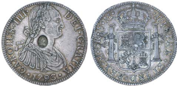
2101* George III, emergency dollar (current for 4/9) oval countermark head of George III on Mexico City Mint eight reales 1793FM (S.3765A). Toned, good very fine. $750