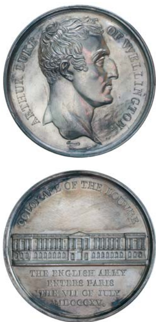
2241* English Army re-enters Paris 1815 , in silver (40mm) bust of Duke of Wellington, reverse Colonade (Eimer 1076). Nearly uncirculated and rare in silver.