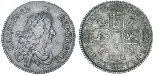
1985* Charles II, halfcrown, third bust, 1670 (S.3365). Die break from rim between 4 and 5.30 o'clock, toned nearly very fine, bump in centre of reverse.