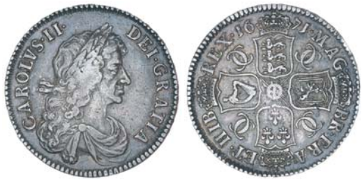
1986* Charles II, halfcrown, third bust variety, 1671 (S.3366). Toned, very fine.