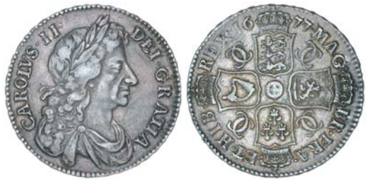
1987* Charles II, halfcrown, fourth bust, 1677, v.nono (S.3367). Light brown grey tone, very fine or better.