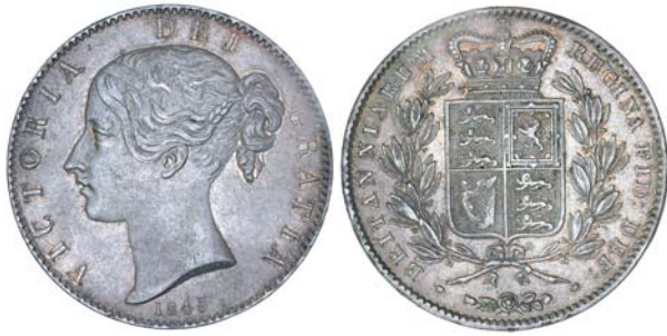
2135* Queen Victoria , young head, crown, 1845, edge VIII and stars (S.3882). Old grey tone, good very fine. $250