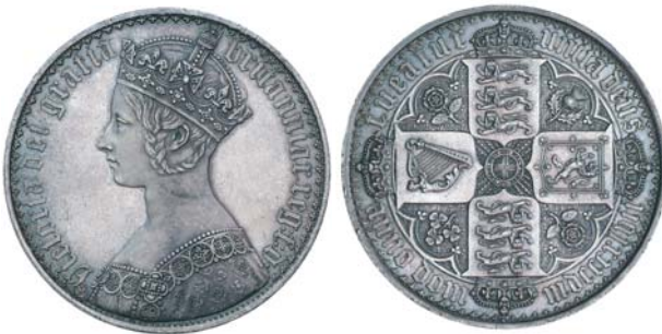
2136* Queen Victoria , Gothic crown, 1847, lettered edge (S.3883). Obverse has been wiped, minute obverse field contact marks at 8 o'clock, otherwise nearly uncirculated. $2,000