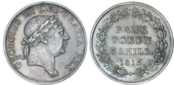
2105* George III, silver three shillings bank token, 1815 (S.3770). Extremely fine. $140