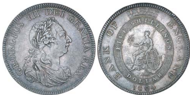
2103* George III, Bank of England, dollar or five shillings, 1804 (S.3768), top leaf to side of E. Toned, very fine. $350