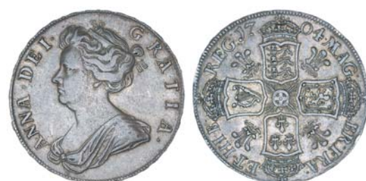
1997* Anne , before Union with Scotland, halfcrown, 1704 plumes (S.3581). Golden blue grey toned, very fine/good very fine.