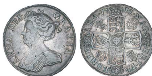
1998* Anne , after Union with Scotland, halfcrown, 1713, roses and plumes (S.3607). Nearly very fine/very fine.