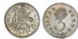
765* Thornthwaite, J.C., Sydney silver threepence, 1854 (A.682). Has been plugged, otherwise toned, very fine and rare.