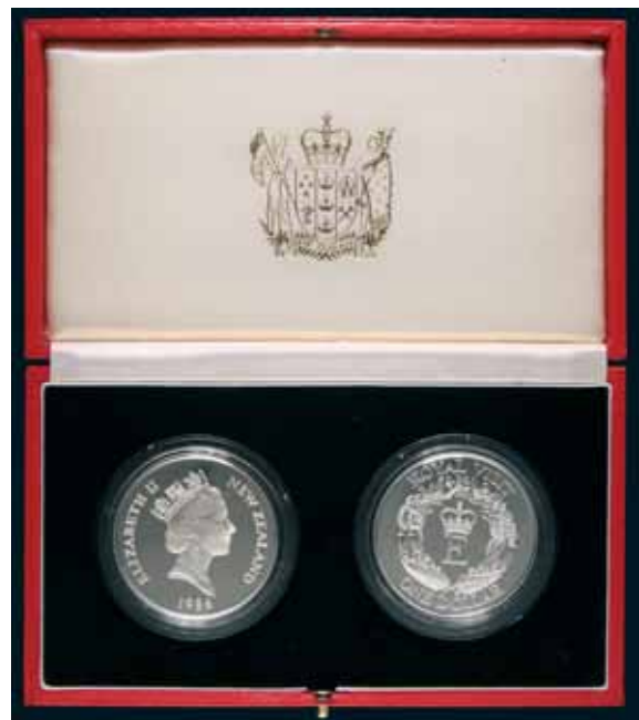
644* Elizabeth II , Royal Mint, VIP proof set of two silver dollars, Royal Visit, 1986. In plush presentation case, with official descriptive card, FDC and rare.