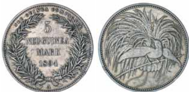
605* German New Guinea , five mark, 1894A. Brooch mounts on obverse, otherwise good very fine. $650