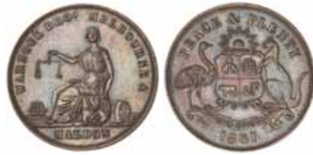
756* Warnock Bros , Melbourne and Maldon halfpenny, 1861 (A.604). Good extremely fine. $100