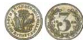
767* Hogarth, Erichsen & Co; Sydney silver threepence, 1858 (A.687). Planchet cracked in rim at 3 o'clock, toned, nearly uncirculated and very rare in this condition.