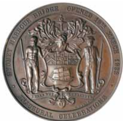
lot 899 obverse