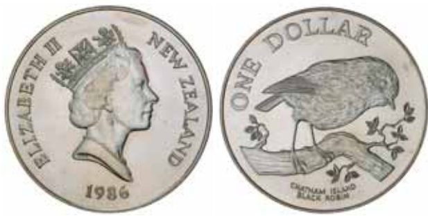
649* Elizabeth II , Royal Mint pattern dollar, 1986, cupro-nickel (27.5g) with reverse of the 1984 dollar 'Chatham Island Black Robin'. Uncirculated and excessively rare.