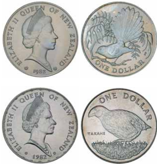
647* Elizabeth II , Royal Mint pattern dollar, specimen in cupronickel (27.1g), 1982. Uncirculated and excessively rare.

This pattern features a modified obverse effigy of Queen Elizabeth II, by James Berry, a design which was not adopted at the time. The obverse of an issued example is shown below it for comparison.