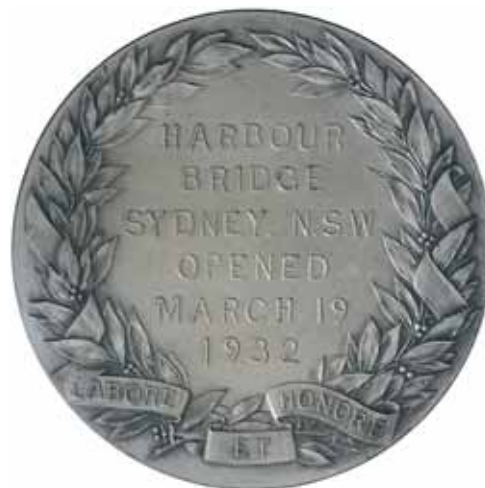
lot 904 reverse

Ex Carl Veen Collection and previously from Dave Allen, Ron Byatt personal collection (not Amor Archives), as such unique.