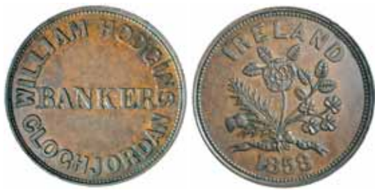
761* Hodgins, William, CloghJordan penny, 1858 (A.659). Obverse die break at 2 o'clock, two hairline scratches on left of reverse, grey brown tone, extremely fine or better and scarce.