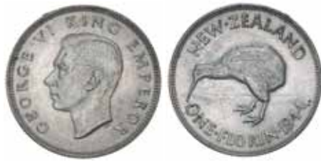
635 George VI , florin, 1944. Metal flaw on forehead, otherwise nearly uncirculated/uncirculated.