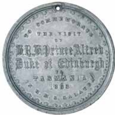
lot 822 reverse

Geelong Grammar School was established in 1855. In 1858 Geelong Grammar and Scotch College played the first recognised public school cricket match in Victoria. Scotch College won by fourteen runs in a low scoring match.