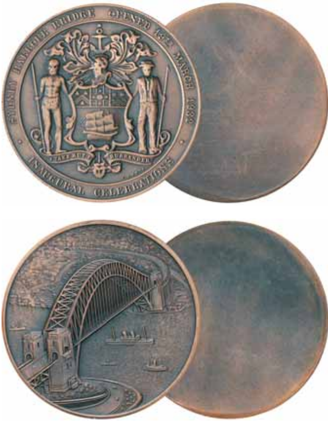
901* Sydney Harbour Bridge , Opened 19th March 1932 Inaugural Celebrations, uniface of obverse and reverse in copper (51mm) by Amor, made by Christies c1988 (C.1932/5). Good extremely fine. (2)