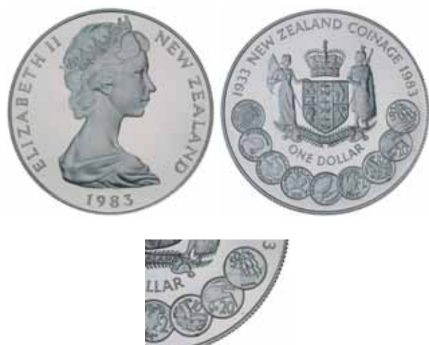
648* Elizabeth II , Royal Mint pattern proof dollar, 1983, 50th Anniversary commemorative, in silver (.925, 27.5g). FDC and excessively rare.

This pattern not only has the reverse of the 1980 'fantail' dollar but features a modified obverse effigy of Queen Elizabeth II, by James Berry, a design which was not adopted at the time. An issued example is shown below it for comparison.