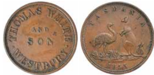
757 Warnock Bros. , Melbourne penny, 1863 (A.605). Good very fine. $170