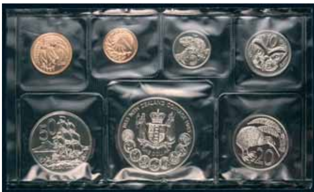
650* Elizabeth II , Royal Mint, mint set of seven, 1983, includes a pattern dollar in cupro-nickel. In mint sealed pack, uncirculated and excessively rare.