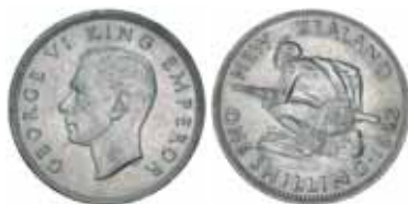
637* George VI , shilling, 1942, broken back. Good extremely fine.