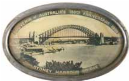
lot 908 part