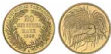
604* German New Guinea , gold twenty mark, 1895A. Lightly polished, otherwise good extremely fine and very rare. $25,000