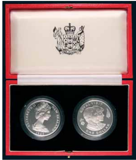
643* Elizabeth II , Royal Mint, VIP proof set of two silver dollars, 1983 Royal Visit. In plush presentation case with official descriptive card, only 15 issued, FDC and very rare.