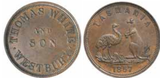
758* White, Thomas and Son , Westbury pennies, 1855 and 1857 (A.620, 622). Good very fine; good extremely fine. (2) $250