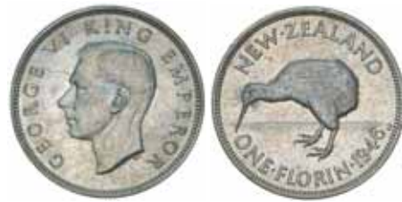
636* George VI , florin, 1946, flat back. Nearly uncirculated and rare thus.