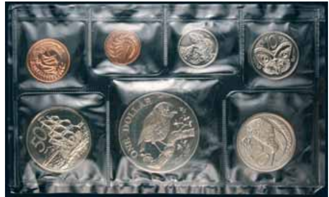
651* Elizabeth II , Royal Mint, mint set of seven, 1986, includes a pattern dollar with reverse of the 1984 dollar 'Chatham Islands Black Robin'. In mint sealed pack, uncirculated and excessively rare.