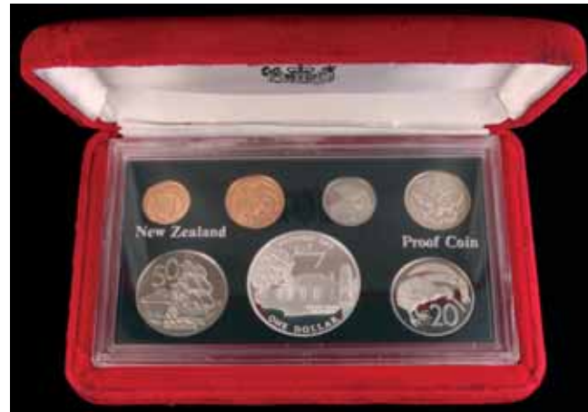
641* Elizabeth II , Royal Mint, VIP proof set of seven coins, Royal Visit, 1977. In plush presentation case with official descriptive card, FDC and rare.