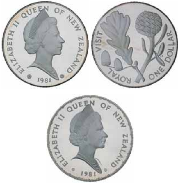
645* Elizabeth II , Royal Mint pattern proof dollar, in silver (.925, 28.2g), 1981 'Royal Visit' commemorative. FDC and excessively rare.