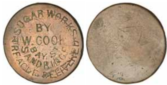
764* Countermarked issue, W.Cook, Bay St, Sandridge on reverse of 1797 cartwheel penny (A.1051). Fine.