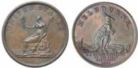
753* Taylor, W.J. , Melbourne halfpenny, undated, United States mule (A.575). Brown with hints of red, extremely fine. $2,500 With collector's ticket.