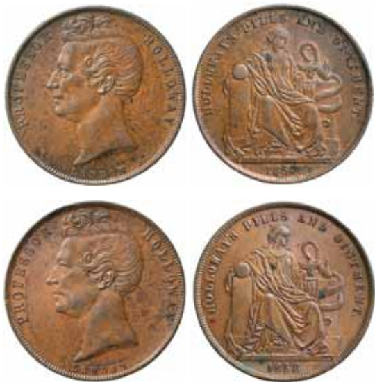
762* Holloway, Professor, London, England pennies, 1857 and 1858 (A.660, 668). Good extremely fine with hints of red; subdued mint bloom, nearly uncirculated. (2)