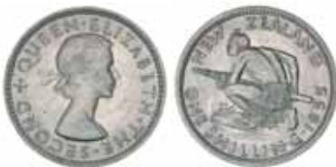
639* Elizabeth II , shilling, 1955. Nearly uncirculated.