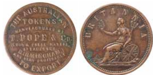
760* Pope, T. & Co. , Birmingham penny, undated (A.658). Two verdigris areas, otherwise nearly very fine and scarce. $180

Ex Noble Numismatics Sale 85 (lot 553) and 94 (lot 1014).