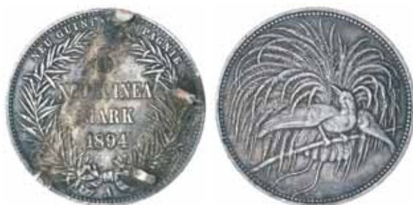
606* German New Guinea , five mark, 1894A. Has been a jewellery piece with mounts partially removed from obverse, fair. $150