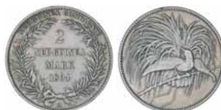
608* German New Guinea , two mark, 1894A. Very fine. $250