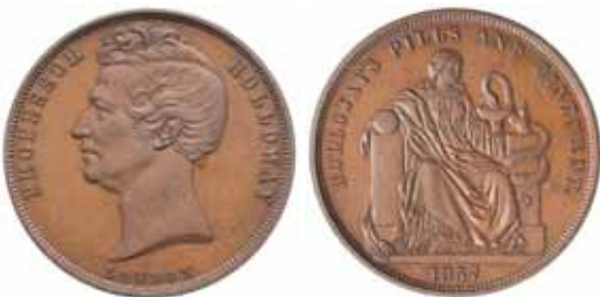
763* Holloway, Professor, London, England bronzed proof penny, 1857 (A.665). Nearly FDC and rare.

The first ex Status Sale, October 2007 (lot 7352).