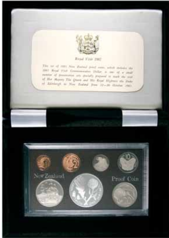
642* Elizabeth II , Royal Mint, VIP proof set of seven coins, Royal Visit, 1981. In plush presentation case, with official descriptive card, FDC and rare.