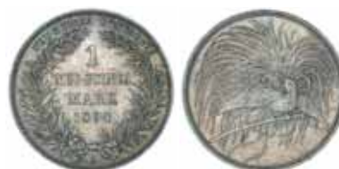
609* German New Guinea , one mark, 1894A. Nearly extremely fine. $300