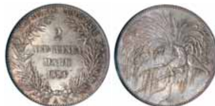
607* German New Guinea , two mark, 1894A (KM.6). Uncirculated. $900