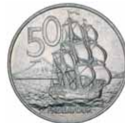
652* Elizabeth II , Royal Mint pattern fifty cents, 1986, cupro-nickel (13.6g). Nearly uncirculated and excessively rare.