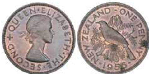
640* Elizabeth II , penny, 1956, type I (strapless). Red and brown, good extremely fine.