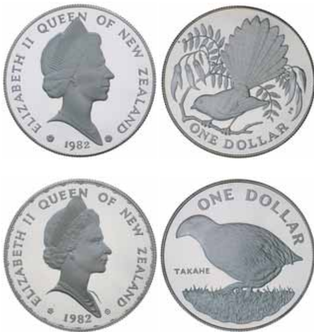
646* Elizabeth II , Royal Mint pattern proof dollar, in silver (.925, 27.6g), 1982. FDC and excessively rare.

This pattern not only has the reverse of the 1980 'fantail' dollar but features a modified obverse effigy of Queen Elizabeth II, by James Berry, a design which was not adopted at the time. An issued example is shown below it for comparison.