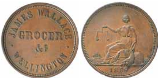
755* Wallace, James , Wellington penny, 1859 (A.592). Even brown patina, good very fine and rare, especially in this condition, one of the finest known. $270