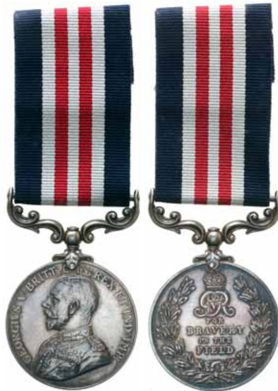
3874* MM for Gallipoli: Military Medal, (GVR type 1). 2327 Dvr: H.L.Arthur. 103/How:By:Aust:A. Impressed. Good very fine.