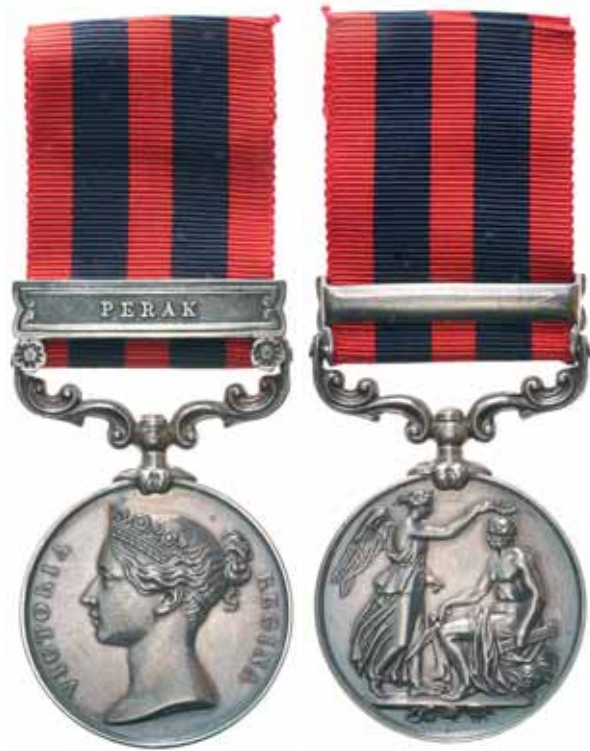
3740* India General Service Medal 1854-95 , - clasp - Perak. 1470, Pte S.Belcher, 1/10th Foot. Chisel engraved. Hairlines and a few scuff marks, otherwise very fine.