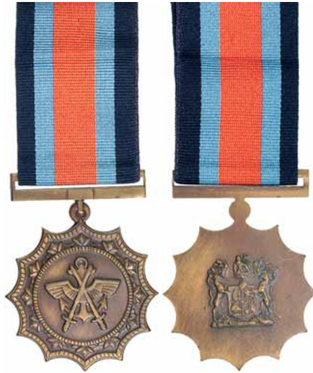
3970* South Africa , Chief of the SA Defence Force Military Merit Medal 1974. Unnamed. Uncirculated.