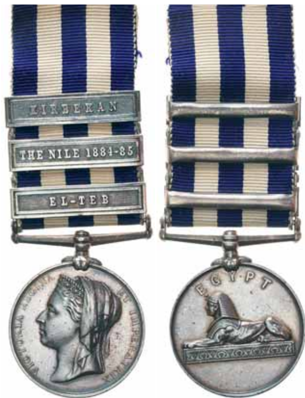
3769* Egypt Medal 1882-89 , (undated reverse), - three clasps - El-Teb, The Nile 1884-85, Kirbekan. 830 Pte E.Howarth. 1/Rl Highrs. Engraved. Many contact marks, otherwise nearly very fine.