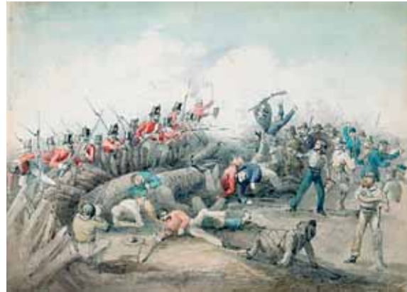
Battle of the Eureka Stockade watercolour by J.B.Henderson in the State Library of NSW