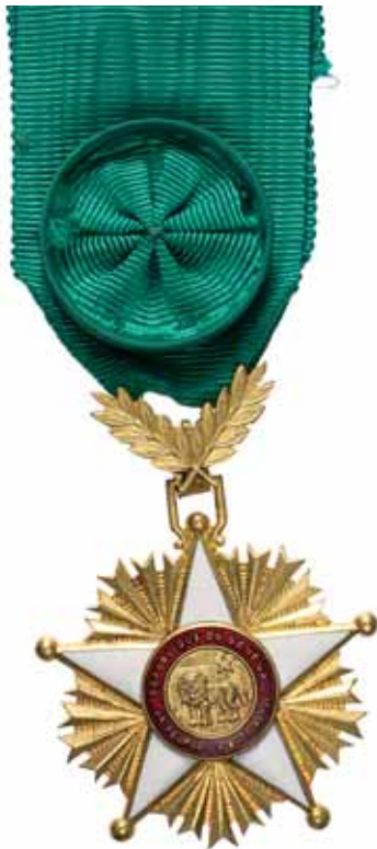
3968* Senegal , Order of Merit, 2nd Class breast star and breast badge, in silvered, gilt and enamel. Very fine - extremely fine. (set of 2)