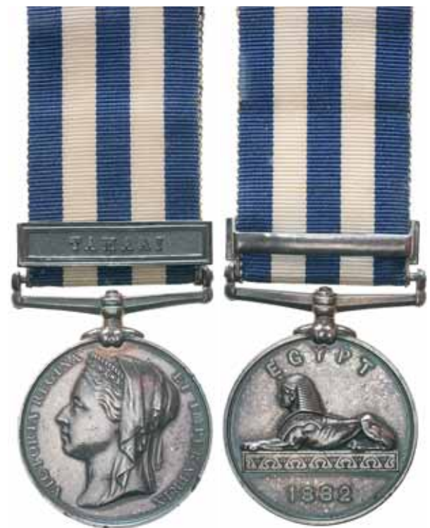
3770* Egypt Medal 1882-89 , (dated 1882 reverse), - clasp - Tamaai. 1070. Pte J. Manning. 3/K.R.Rif: Engraved. Contact marks and edge nicks, otherwise very fine.