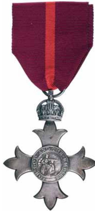
3732* The Most Excellent Order of the British Empire, Officer (OBE type 1) (Military) breast badge, hallmarked for London 1919. In Royal Mint case of issue, some toning to inside, toned extremely fine.