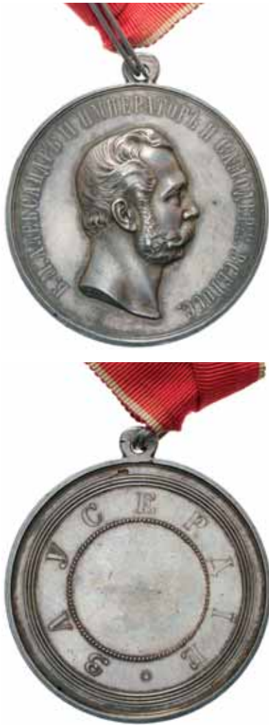
3963* Russia , Alexander II (middle aged head), Medal for Zeal in silver (51mm), with neck suspender and on St Anne ribbon. Scuffing on reverse and small surface defect spot near top edge, good very fine.