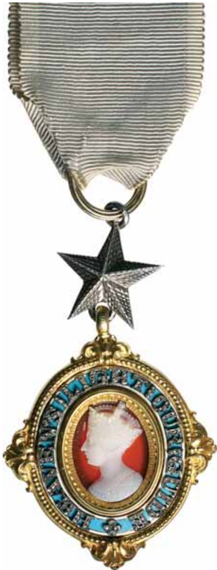
3731* The Most Exalted Order of the Star of India, Companion (CSI) neck badge with original ribbon. In Garrard & Co Ltd case of issue, nearly uncirculated.