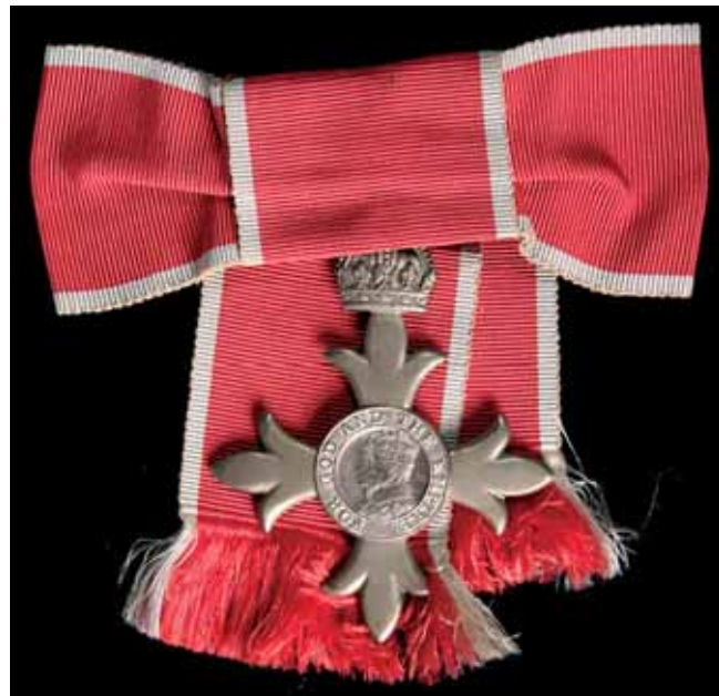
3733* The Most Excellent Order of the British Empire, Member (MBE type 2) (Civilian) ladies breast badge. In Royal Mint case of issue, some toning to inside, uncirculated.