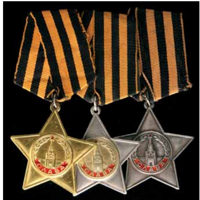
3965* Russia , USSR, The Order of Glory 1st Class, in gold , reverse with impressed number 2174; 2nd class, in silver with gilt centre, type 2 reverse with engraved number 22582; 3rd Class, in silver, type 2 reverse with engraved number 227093. Some nicks to obverse and reverse of the first medal, otherwise very fine. (3)