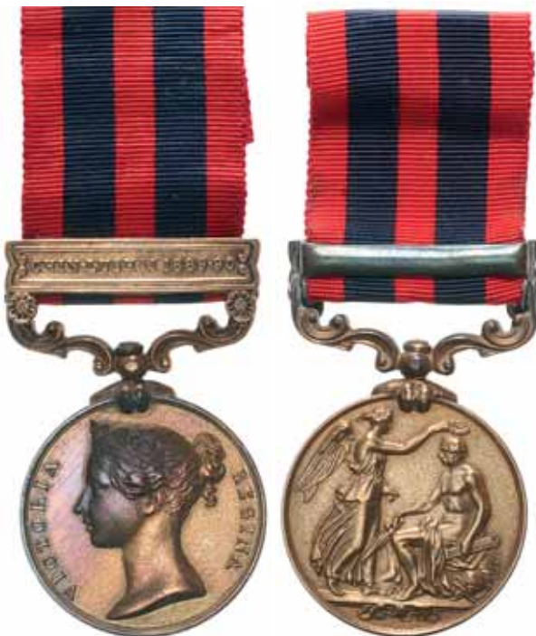
3747* India General Service Medal 1854-95 , in bronze, - clasp - Chin-Lushai 1889-90. Cook Shaik Hamid Ali 3d Bl Infy. Engraved in running script. Some scratches and also acid cleaned, otherwise very fine.