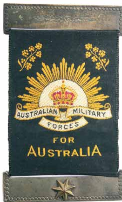
lot 3913 part