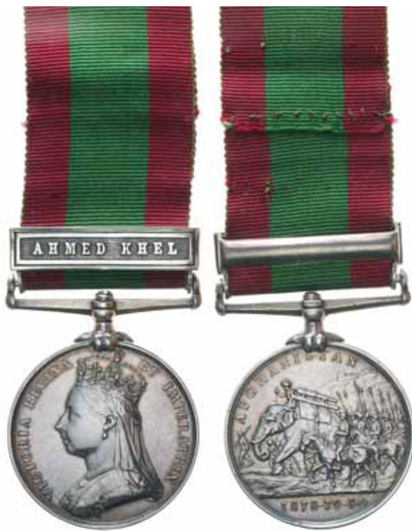
3767* Afghanistan Medal 1878-80 , - clasp - Ahmed Khel. 640. Pte W.Wood. 59th Foot. Engraved. Very fine.