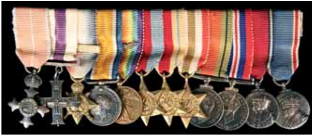
lot 3844 miniature medals