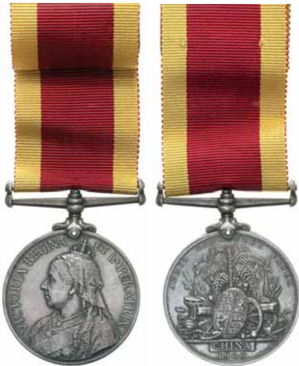
3872* China War Medal 1900. J.Empson, A.B., N.S.Wales Nav. Contgt. Impressed. Toned extremely fine.