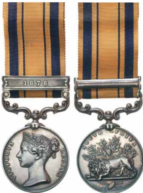
3765* South Africa Medal 1877-79 , - clasp - 1878. Corpl J. Burke, Transvl Arty. Engraved. Hairlines, otherwise good very fine.

With above documents and a few others in research folder.