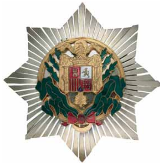
3971* Spain , Colonial, The Order of Africa, Commander's breast star in silver, gilt and enamel (72mm). Extremely fine.