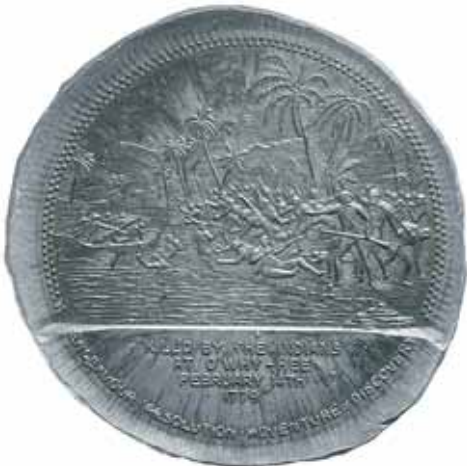
lot 262 part