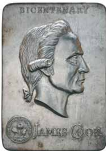
lot 249 part