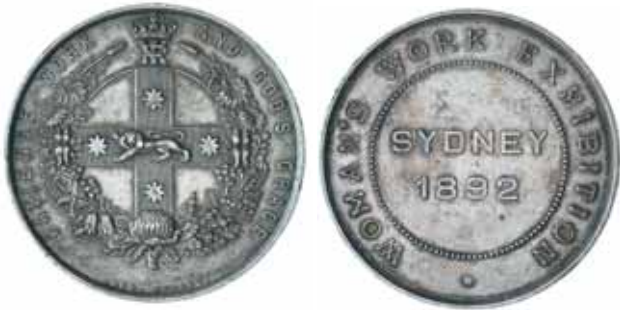
202* Women's Work Exhibition, Sydney, 1892 , in silver (39.5mm) by Amor, uninscribed. Edge knocks, very fine.