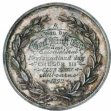
203* Victorian St Bernard, Mastiff & Newfoundland Club , in silver (47.5mm) inscribed on reverse 'Won by/Geo King Esq/Best/Colonial bred/Newfoundland dog/"Crusoe III"/ Club Show/Melbourne/1893'. Edge bump on obverse at 9 o'clock, otherwise nearly extremely fine and rare.