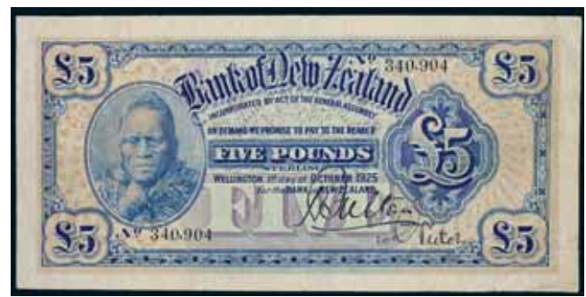
4363* Bank of New Zealand , uniform issue, five pounds, arched bank name, 1st October 1925, No. 340,904, imprint of Bradbury Wilkinson & Co Ld, New Malden, Surrey (P.S235; Robb D.841; L.469). Creases and folds, still crisp, good fine. $2,000