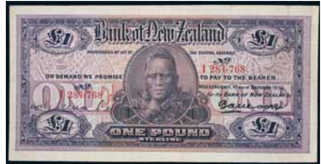
4361* Bank of New Zealand , uniform issue, one pound, straight bank name, 1st October 1932, No. I 281,768, imprint of Bradbury Wilkinson & Co Ld, New Malden, Surrey (P.S234b; Robb D.821; L.468). Creases and folds, good body to paper, good fine or better. $800