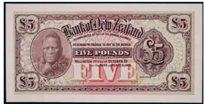
4362* Bank of New Zealand , uniform issue, uniface colour trial for five pounds, arched bank name, undated (c1924), no number or imprint, SPECIMEN perforated twice - at Manager signature reserve and No. reserve (cfP.S235; cfRobb D.841; cfL.469). Uncirculated. $3,000