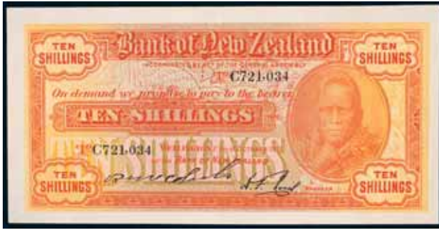
4358* Bank of New Zealand , uniform issue, ten shillings, Wellington, 1st October 1931, No. C721,034 (P.S232; Robb D.811; L.465). Several creases, minor ink mark on back, otherwise extremely fine and rare in this condition. $5,000