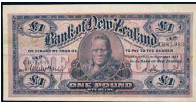
4360* Bank of New Zealand , uniform issue, one pound, arched bank name, 1st October 1925, No. C081,983, imprint of Bradbury Wilkinson & Co Ld, New Malden, Surrey (P.S233; Robb D.821; L.467). Crisp paper, some creases and folds with light toning, otherwise good fine or better. $800