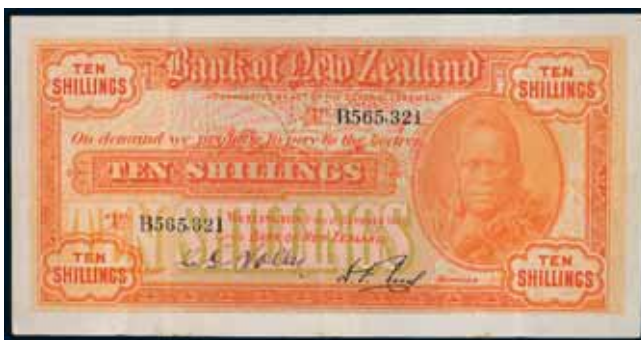
4359* Bank of New Zealand , uniform issue, ten shillings, Wellington, 1st October 1928, No. B565,321, £1/2 omitted from corners, imprint of Bradbury Wilkinson & Co Ld, New Malden, Surrey (P.S232a; Robb D.811; L.466). Crisp original body, good very fine. $750