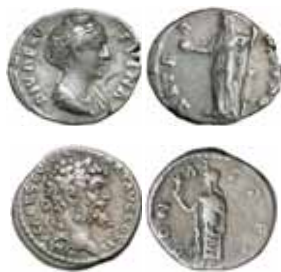
lot 5036 part