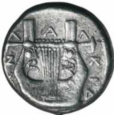
lot 4829 enlarged