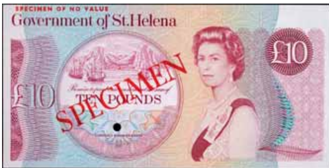
3752* St Helena , Government of St Helena, Elizabeth II, specimen ten pounds, undated (1979), no serial number or signatures, SPECIMEN in red diagonally on front and back, SPECIMEN OF NO VALUE in red top left margins on front and back, single punch hole cancellation at signatures, 003 stamped in top left margin on back (P.8s). Uncirculated.