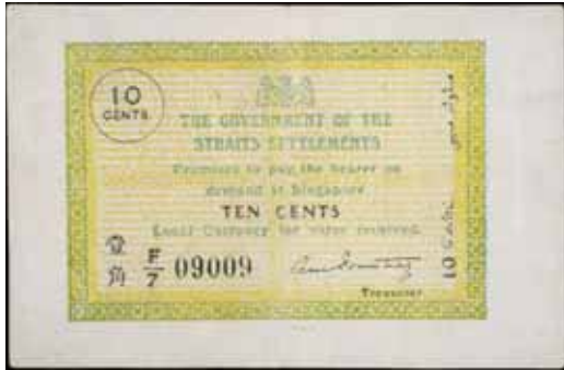
3796* Straits Settlements , The Government of the Straits Settlements, ten cents, undated (1919-20), F/7 09009 (P.6c). Fine.