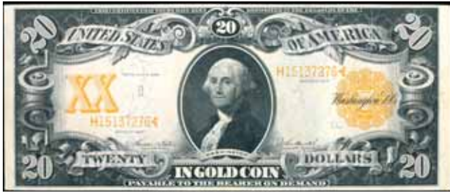
3830* USA , Gold Certificate, twenty dollars, Series of 1906, H15137276 (P.270). Flat, very fine and rare.