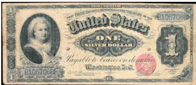
3833* USA , Silver Certificate, one dollar, Series of 1886, B1057068 (P.321). Folds and creases, pin holes, 3mm tear left side margin, very good.