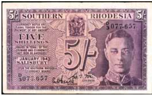
3790* Southern Rhodesia , Southern Rhodesia Currency Board, George VI, five shillings, 1st January 1943, D/3 077657 (P.8a). Good fine. $120