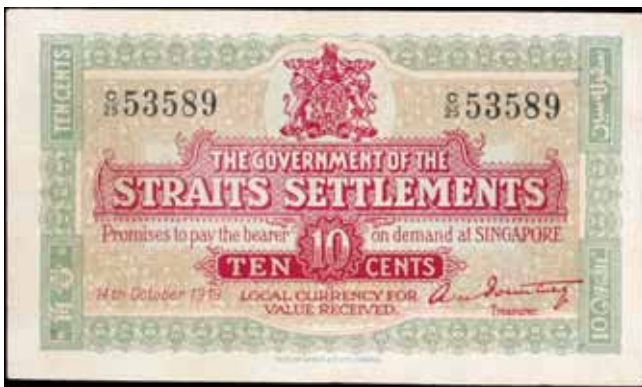
3797* Straits Settlements , The Government of the Straits Settlements, ten cents, 14th October 1919, C/25 53589 (P.8b). Nearly extremely fine and rare.