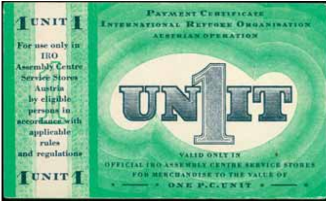
3826* United Nations , International Refugee Organisation, Austrian Operation, one unit payment certificate. (S&B.181). Nearly extremely fine.