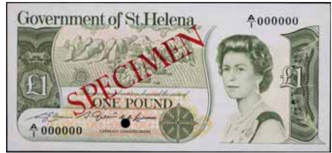
3754* St Helena , Government of St Helena, Elizabeth II, specimen one pound, undated (1981), A/1 000000, SPECIMEN in red diagonally on front and back, single punch hole cancellation at signatures (P.9s). Uncirculated.