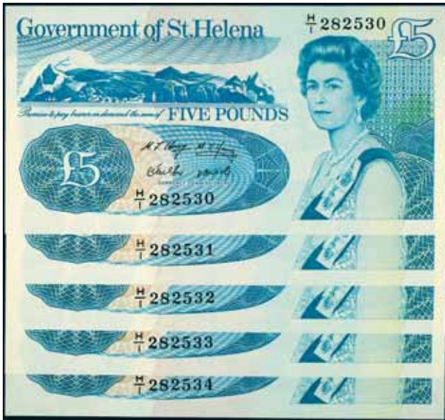
3751* St Helena , Government of St Helena, Elizabeth II, five pounds, undated (1981), H/1 282530/4 (P.7b) consecutive run of five notes. Uncirculated. (5)