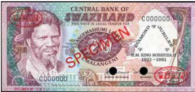
3801* Swaziland , Monetary Authority and Central Bank of Swaziland, de la Rue specimen notes for ten and twenty (3) emalangeni, SPECIMEN in red diagonally on fronts and backs, de la Rue specimen lozenges in red top left and bottom right both sides, SPECIMEN No. 001 in red or black at bottom left on fronts, single punch hole cancellation at signatures: twenty emalangeni, undated (1978), A 000000 and B 000000 (P.5s) (2); ten emalangeni, commemorative issue, 1981, K 000000 (P.6s); twenty emalangeni, commemorative issue, 1981, C 000000 (P.7s). Uncirculated. (4)