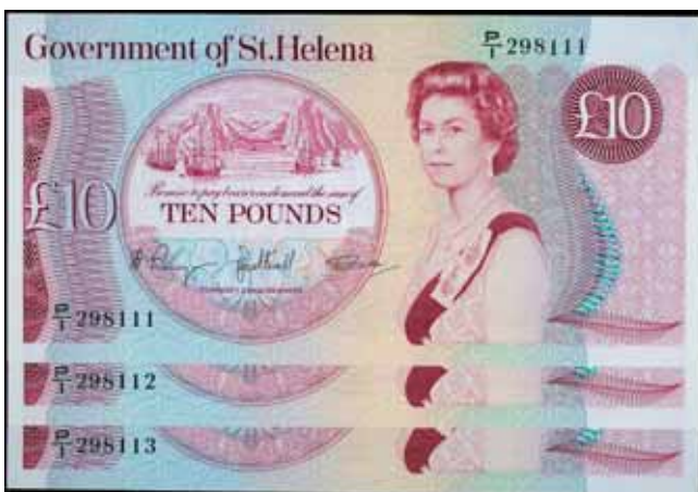
3753* St Helena , Government of St Helena, Elizabeth II, ten pounds, undated (1985), P/1 298111/3 (P.8b) consecutive run of three notes. Uncirculated. (3)