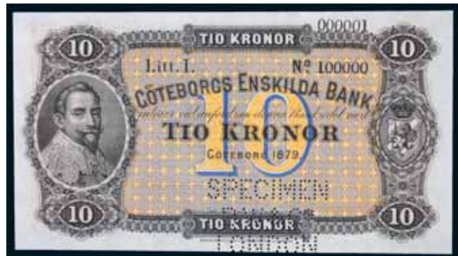
3804* Sweden , Goteborgs Enskilda Bank, specimen ten kronor, Goteborg, 1879, discordant serial numbers 000001 and 100000, imprint of Bradbury Wilkinson & Co., Engravers & c. London, SPECIMEN/B.W.&.Co./LONDON perforated below (P.228As). Uncirculated.