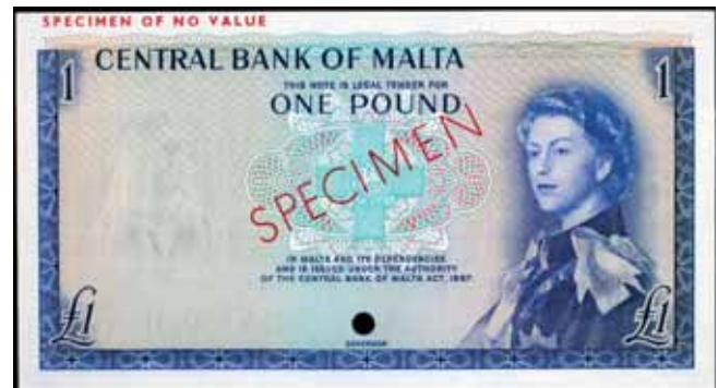
3695* Malta , Government of Malta, Elizabeth II, one pound colour trial, blue and multicolour (1969), overprinted SPECIMEN in red, diagonally front and back, 'SPECIMEN OF NO VALUE' in red in top left margin, front and back, the number 93 top left back corner, official hole cancellation lower centre (P.29ct). Uncirculated.