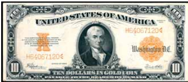
3831* USA , Gold Certificate, ten dollars, Series of 1922, H64067120 (P.274). Flat, very fine.