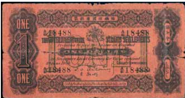
3792* Straits Settlements , The Government of the Straits Settlements, one dollar, 8th June 1906, A/61 18488 (P.1b); ten cents, 14th October 1919, C/53 49101 (P.8). First note with edge tears, horizontal crack part way through centre of note, good and rare, second note with pin holes, very good. (2) $200