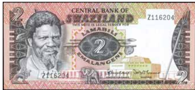
3803* Swaziland , Central Bank of Swaziland, two emalangeni replacement note, undated (1983) Z 116204 (P.8ar). Uncirculated.