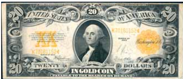
3832* USA , Gold Certificate, twenty dollars, Series of 1922, K70161152 (P.275). Several pin holes, good fine and rare.

Ex Gray Donaldson Collection, purchased from Australian Coin Auctions (lot 1118).