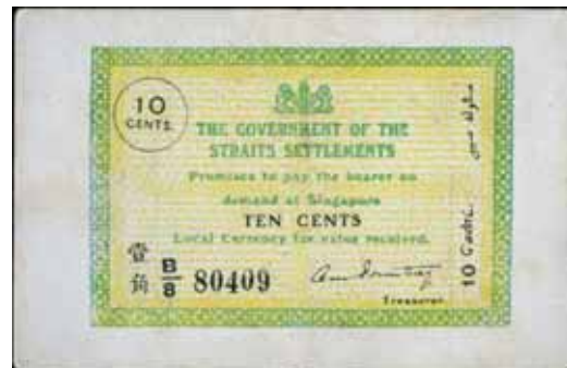
3795* Straits Settlements , The Government of the Straits Settlements, ten cents, undated (1919-20), B/8 80409 (P.6c). Fine. $80