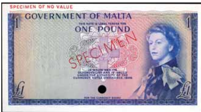
3692* Malta , Government of Malta, Elizabeth II, one pound colour trial, blue and multicolour (1963), overprinted SPECIMEN in red, diagonally front and back, 'SPECIMEN OF NO VALUE' in red in top left margin, front and back, the number 78 top left back corner, official hole cancellation lower centre (P.26ct). Uncirculated.

Ex Gray Donaldson Collection, purchased from Mavin Auctions (Singapore).