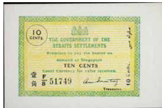
3794* Straits Settlements , The Government of the Straits Settlements, ten cents, undated (1919-20), F/8 51749 (P.6c). Extremely fine and rare thus. $350