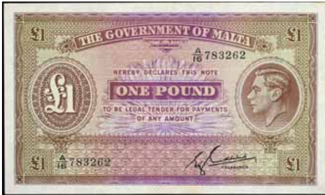
3691* Malta , The Government of Malta, George VI, one pound, undated (1940), A/16 467551 (P.20b) and A/16 783262 (P.20c). Virtually uncirculated. (2)