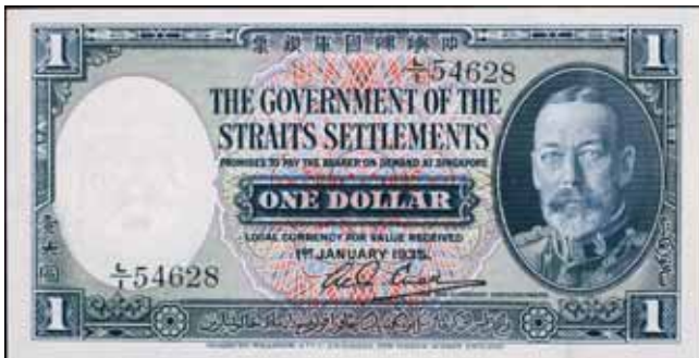
3799* Straits Settlements , The Government of the Straits Settlements, one dollar, 1st January 1935, L/1 54628 (P.16b). Crisp and original, extremely fine.