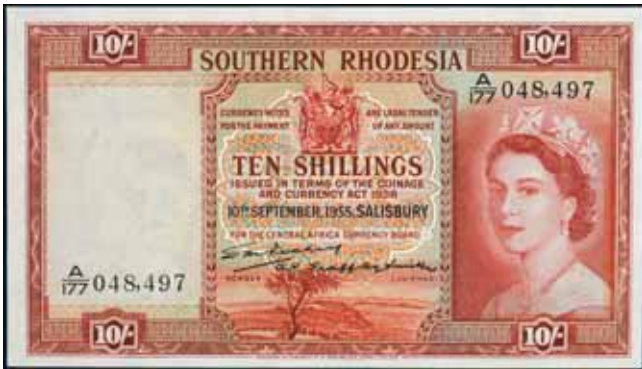
3791* Southern Rhodesia , Central Africa Currency Board, Elizabeth II, ten shillings, 10th September 1955, A/177 048,497 (P.16). Virtually uncirculated and very rare. $1,500