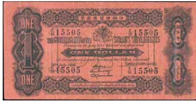
3793* Straits Settlements , The Government of the Straits Settlements, one dollar, 10th July 1916, E/26 15505 (P.1c). Very fine and rare. $500