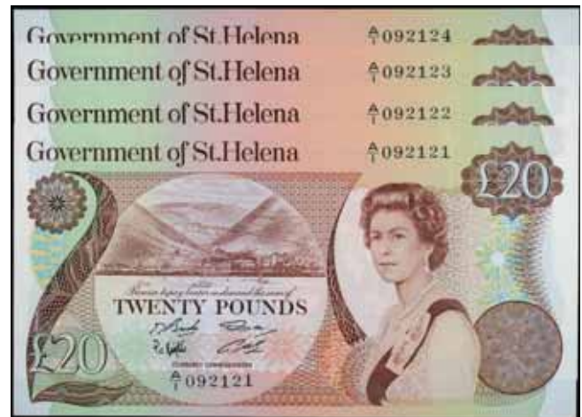
3756* St Helena , Government of St Helena, Elizabeth II, twenty pounds, undated (1986), A/1 092121/4 (P.10a) consecutive run of four notes. Uncirculated. (4)