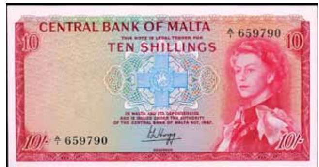
3694* Malta , Central Bank of Malta, Elizabeth II, ten shillings (1968), A/1 659790 (P.28a). Uncirculated.