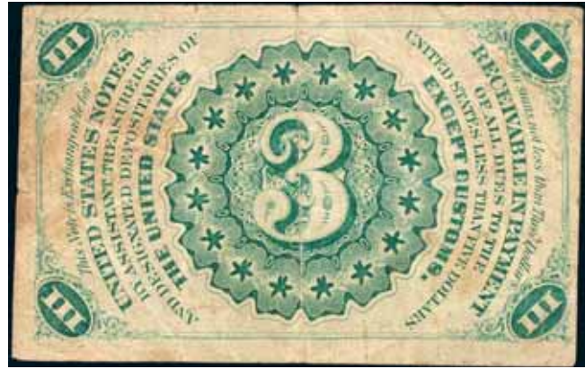
3827* USA , Delaware, Colonial Issue, one shilling, 1st Jan. 1776, No.25669 (P.S634); Maryland, Colonial Issue, four dollars, 10th April 1774, No. 11247 (P.S978); Fractional Currency, three cents, third issue, 1863 (P.105a). The second with corner off bottom right, very good. (3)