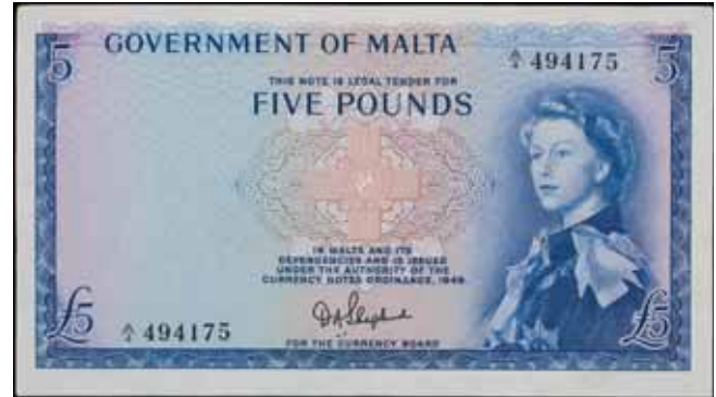
3693* Malta , Government of Malta, Elizabeth II, five pounds, undated (1961), A/4 494175 (P.27a). A 3mm tear in left margin, otherwise very fine and rare.