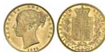
1287* Queen Victoria , 1879 Sydney. Nearly uncirculated.