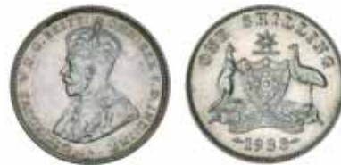
1446* George V, 1933. Nearly extremely fine and rare thus.