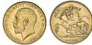
1279* George V , 1918 Perth. Considerable original mint bloom, uncirculated and rare.

Ex W.J.Baker Collection, from Spink Noble Sale 37 (lot 1335).