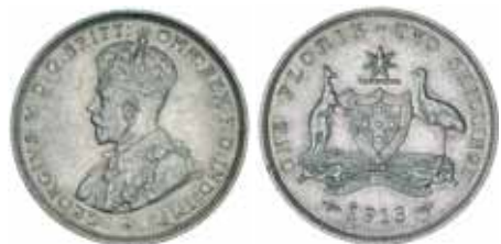
1387* George V , 1913. Good very fine. $250