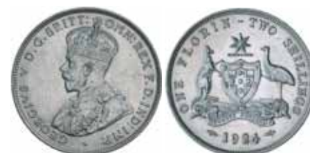
1400* George V, 1924. Good extremely fine.