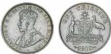
1429* George V, 1915. Brown golden tone, very fine or better, scarce thus.