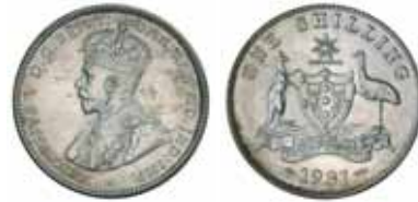
1445* George V, 1931. Subdued mint bloom, relatively unmarked surfaces as usual for this date, some golden toning, uncirculated.