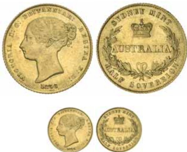
1189* Queen Victoria , first type, 1856, with filleted head of Queen Victoria left by James Wyon. Slightest surface marks, underlying mint bloom, nearly uncirculated and rare in this condition.