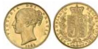
1290* Queen Victoria , 1882 Melbourne. Good extremely fine.