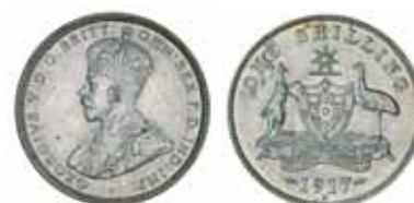
1433* George V, 1917M. Nearly uncirculated.