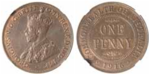
1482* George V, 1916I. Brown toned, nearly uncirculated.