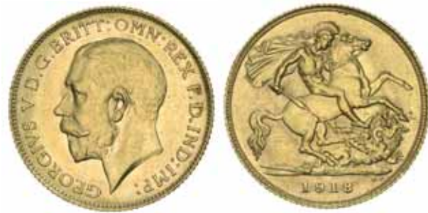
1278* George V , 1918 Perth. Well struck for this type, uncirculated and rare, especially in this condition, one of the finest known.

Ex W.J.Baker Collection, from Spink Australia Sale 32 (lot 1375).