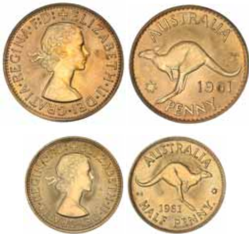
1374* Elizabeth II , Perth Mint proof set, 1961. Red FDC. (2) $500