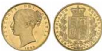
1208* Queen Victoria , 1883 Melbourne. Choice uncirculated and very rare in this condition, one of the finest known.