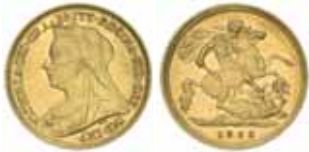
1273* Queen Victoria , 1900 Sydney. Extremely fine. $350