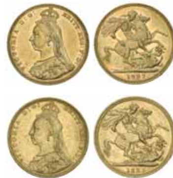
1232 Queen Victoria , Jubilee head, 1887 and 1888 Melbourne (McD 175a, 177b). Surface marks, extremely fine; extremely fine. (2)

Private purchases from Monetarium 25/11/89.