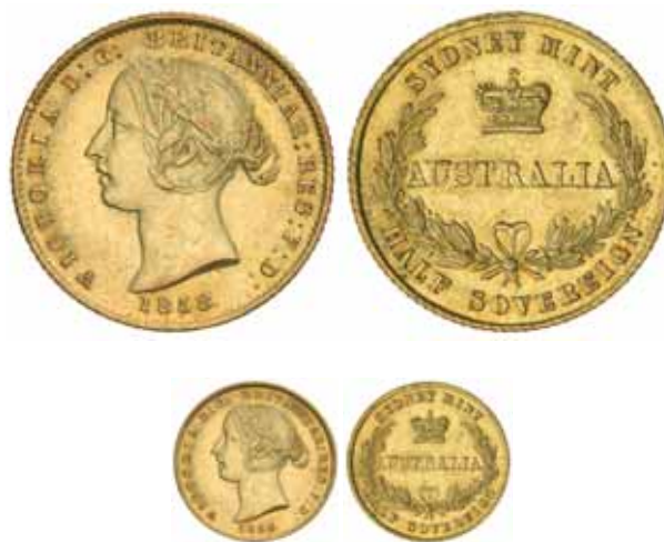
1192* Queen Victoria , second type, 1858. Considerable mint bloom, uncirculated and rare in this condition, one of the finest known.