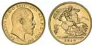
1276* Edward VII , 1910 Sydney. Full mint bloom, choice uncirculated. $500

Private purchase from Monetarium 25/11/89.