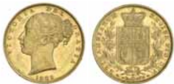
1211* Queen Victoria , 1884 and 1885 Melbourne. Good extremely fine. (2)