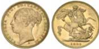
1327* Queen Victoria , 1885 Sydney. Uncirculated.