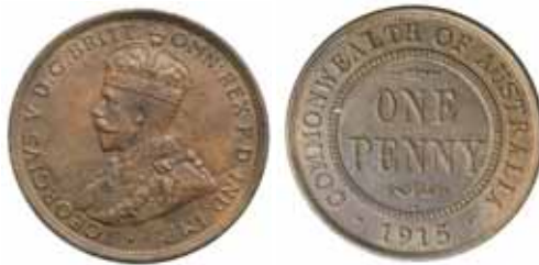
1480* George V, 1915H. Good extremely fine.