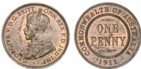
1476* George V, 1911. Has been lacquered, brown and red, nearly uncirculated.