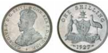
1442* George V, 1927. Frosty mint bloom on the obverse, uncirculated.