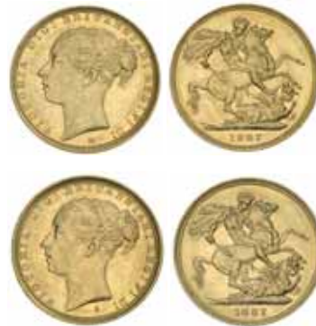
1231* Queen Victoria , young head, 1887 Melbourne and Sydney. Relatively unmarked, good extremely fine. (2)

Private purchases from Monetarium 25/11/89.