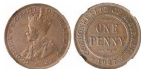
1489* George V, 1927 London die. Brown and red, nearly uncirculated.