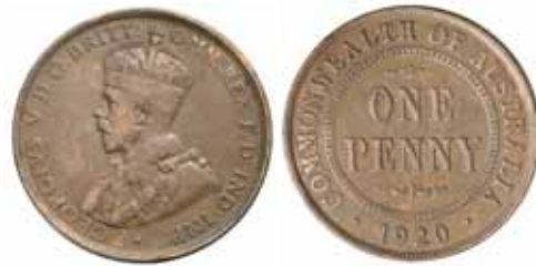
1486* George V, 1920 dot below, London die. Rim bruises, otherwise good fine and rare.