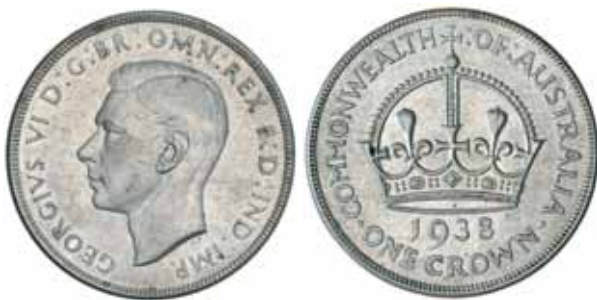
1381* George VI , 1938. Nearly uncirculated. $200