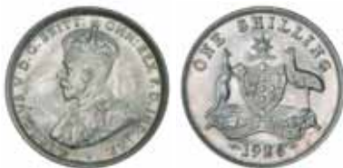
1441* George V, 1926. Frosty mint bloom on the obverse, nearly uncirculated.