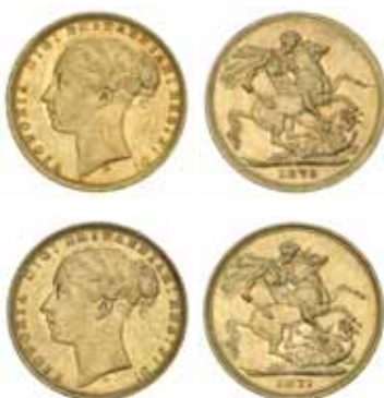
1222* Queen Victoria , 1875 and 1877 Melbourne. Extremely fine or better. (2)