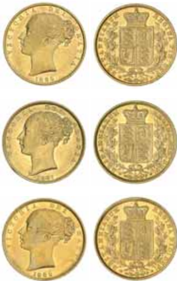
1204* Queen Victoria , 1880, 1881, and 1882 Sydney. Very fine; extremely fine; nearly extremely fine. (3)

Private purchases from Monetarium 25/11/89.