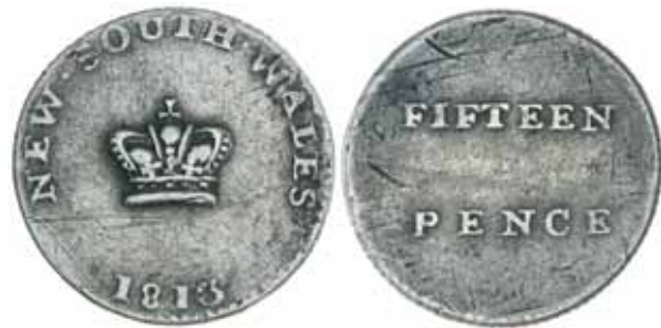
1156* New South Wales , fifteen pence or dump, 1813 (Mira dies D/2). Traces of reverse of centre of eight reales on the reverse, good very fine.