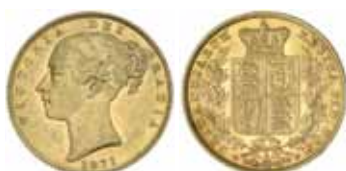
1282* Queen Victoria , 1871 Sydney, incuse WW (McD 118b). Nearly uncirculated.