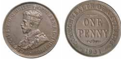
1493* George V , 1931, dropped I, London die. Dark brown patina, extremely fine. $140