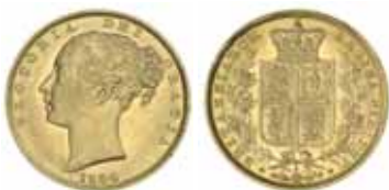
1212* Queen Victoria , 1884 Sydney. Nearly uncirculated.

Privates purchases from Monetarium 25/11/89.