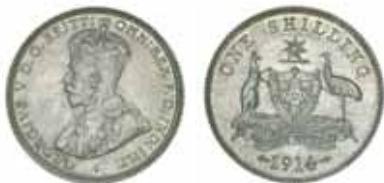
1428* George V, 1914. Frosty mint bloom, nearly uncirculated.