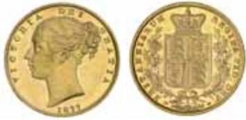
1202* Queen Victoria , 1877 Sydney. Surface marks otherwise extremely fine or better.