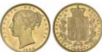
1293* Queen Victoria , 1884 Sydney. Uncirculated with brilliance.