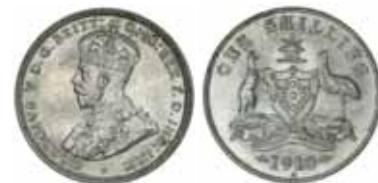
1434* George V, 1918M. Original mint bloom, slight scuffing in obverse field, otherwise uncirculated.