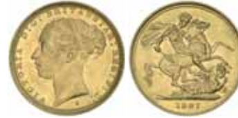
1331* Queen Victoria , young head, 1887 Sydney. Uncirculated.