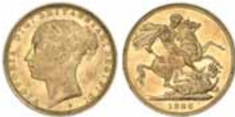
1329* Queen Victoria , 1886 Sydney. Nearly uncirculated.