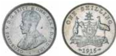
1430* George V, 1915H. Some underlying brilliance, good very fine or nearly extremely fine.