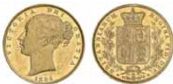
1210* Queen Victoria , 1884 and 1885 Melbourne. Surface marks, otherwise nearly uncirculated. (2)