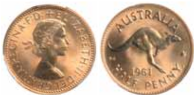
1375* Elizabeth II , Perth Mint proof halfpenny, 1961. Full mint red, FDC. $280

Both in slabs by PCGS as PR66RD. Ex Noble Numismatics Sale 96 (lot 1537).