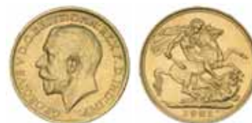
1247* George V , 1921 Sydney. Mint mark flattened on top half, good extremely fine/nearly uncirculated and rare. $3,000