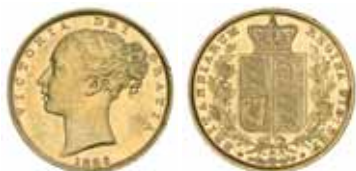
1215* Queen Victoria , 1886 Melbourne. Good extremely fine and very rare.