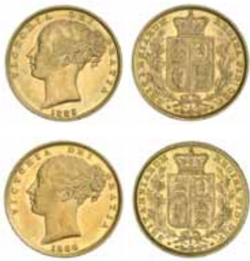
1214* Queen Victoria , 1885 and 1886 Sydney. Extremely fine/good extremely fine; nearly uncirculated. (2)