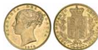
1286* Queen Victoria , 1878 Sydney. Uncirculated.