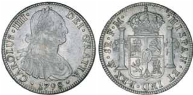
1152* Mexico , Charles III, silver eight reales, 1798FM, Mexico City Mint (KM.109). Good very fine.