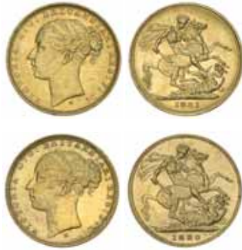
1227* Queen Victoria , 1880 and 1881 Melbourne (McD 159, 161). Good extremely fine; uncirculated. (2)