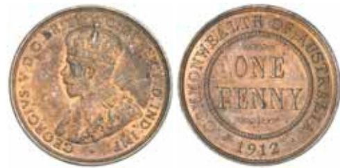
1478* George V, 1912H. Dusty brown and red, nearly uncirculated.