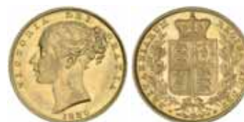
1288* Queen Victoria , 1880 Sydney. Hairline die break on truncation, softly struck obverse, nearly uncirculated/uncirculated.