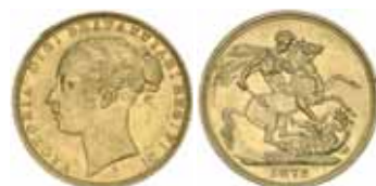
1297* Queen Victoria , 1872 Sydney. Satin-like subdued mint bloom, nearly uncirculated.