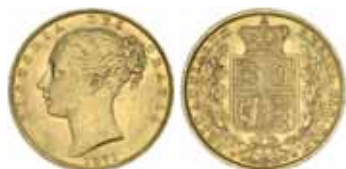
1281* Queen Victoria , 1871 Sydney, WW in relief (McD 118a). Good extremely fine.