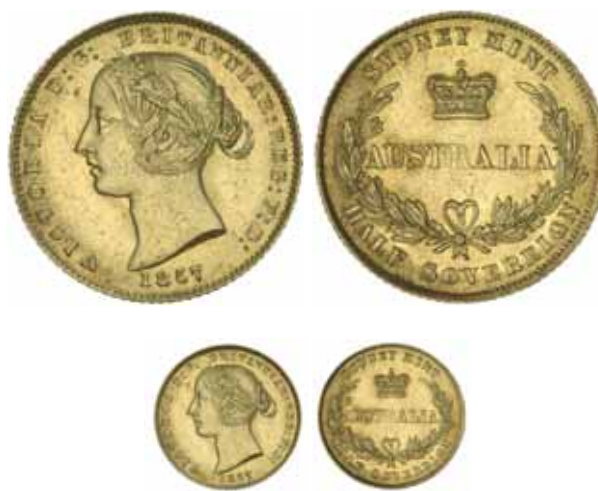
1191* Queen Victoria , second type, 1857. Considerable mint bloom, nearly uncirculated and rare in this condition.

Private purchase from Moneterium 25/11/89 from the India Hoard Spink Australia in 1976.