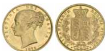
1284* Queen Victoria , 1873 Sydney. Nearly uncirculated.