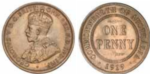
1484* George V, 1919. Faded red uncirculated.