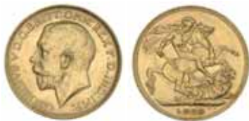
1244* George V , 1920 Melbourne. Nearly uncirculated and very rare in this condition. $9,000