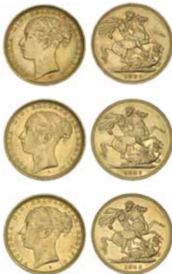
1229* Queen Victoria , 1884, 1885 and 1886 Sydney. Good extremely fine. (3)

Private purchases from Monetarium 25/11/89.