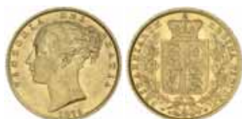
1285* Queen Victoria , 1875 Sydney. Lightly toned, nearly uncirculated.