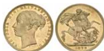
1298* Queen Victoria , 1872 Sydney. Nearly uncirculated.