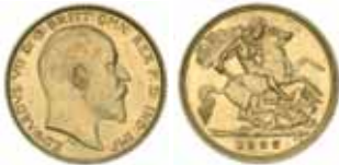
1274* Edward VII , 1908 Sydney. Subdued mint bloom, uncirculated and scarce in this condition. $500