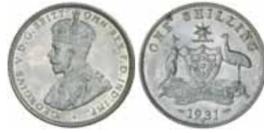
1444* George V, 1931. Uncirculated.