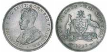
1385* George V , 1911. Reverse cleaned and old grey tone, otherwise nearly uncirculated and very scarce in this condition. $1,100