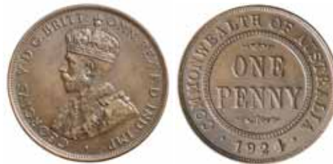
1487* George V, 1924 London die. Glossy dark brown, nearly uncirculated.