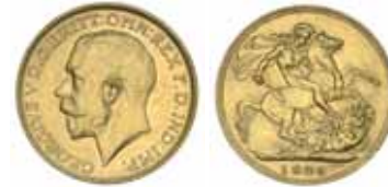
1245* George V , 1920 Melbourne. Extremely fine and very rare. $4,000