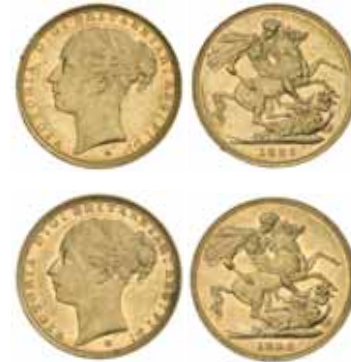
1230* Queen Victoria , 1885 and 1886 Melbourne (McD 169c, 171). Good extremely fine. (2)

Private purchases from Monetarium in 25/11/89.