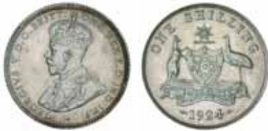
1439* George V, 1924. With 4 over 4 over 3 die state, slight red gold toning, nearly uncirculated and rare thus.