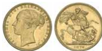
1223* Queen Victoria , 1876 Melbourne. Extremely fine or better.

Private purchases from Monetarium 25/11/89.