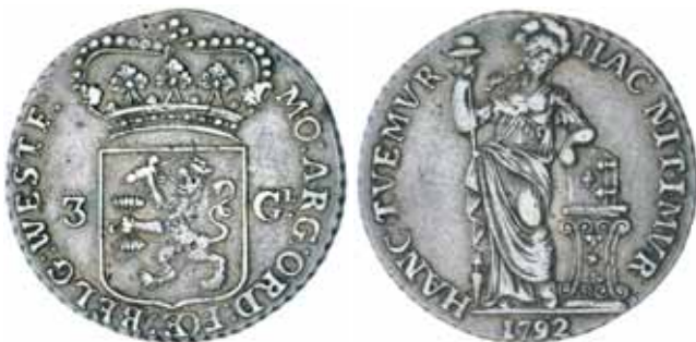
1153* Netherlands , West Friesland, silver three guilders, 1792, rev. standing figure, with inverted spear facing leaning on column, date in exergue 1792, obv. crowned arms, (KM.141.2). Toned, very fine.