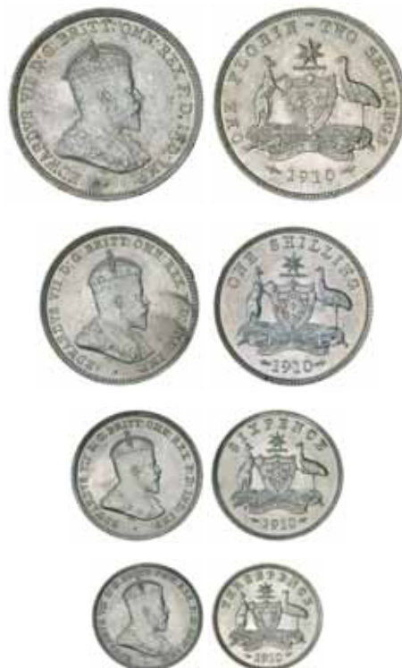
1379* Edward VII , florin, shilling, sixpence and threepence, 1910. Nearly uncirculated - uncirculated. (4) $2,000

Private purchase from Spink Australia in 1983 ($1,600).