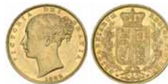
1291* Queen Victoria , 1882 Sydney. Considerable mint bloom, nearly uncirculated and very scarce thus.