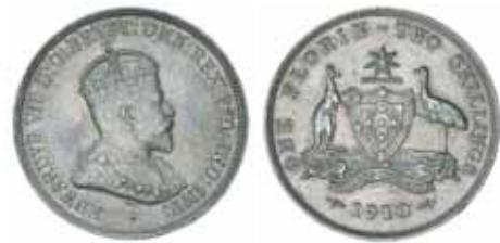
1384* Edward VII , 1910. Light grey tone, good extremely fine. $1,000