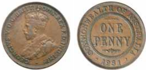
1492* George V , 1931 dropped 1, Indian die. Some scuffing in obverse field, otherwise nearly very fine and very rare. $2,000