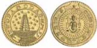
1150* India , British, Madras Presidency, milled coinage, two pagodas (1808-15)(KM.358). Good extremely fine. $2,000