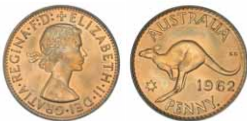
1376* Elizabeth II , Perth Mint proof penny, 1962. FDC. $350