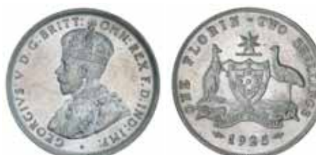
1401* George V, 1925. Considerable mint bloom, brilliant on the obverse, uncirculated.