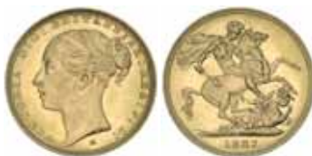
1330* Queen Victoria , young head, 1887 Melbourne. Choice uncirculated.