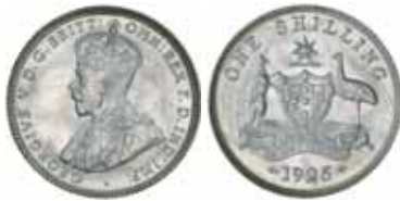
1440* George V, 1925. Considerable original mint bloom, nearly uncirculated.