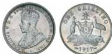
1432* George V, 1917M. Uncirculated.