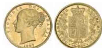
1218* Queen Victoria , 1887 Sydney. Extremely fine/good extremely fine.

Private purchases from Monetarium 25/11/89.