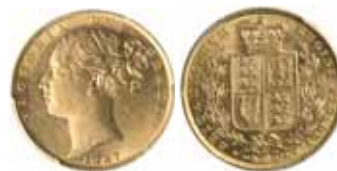
1216* Queen Victoria , 1887 Melbourne. Uncirculated and very rare, one of the finest known.