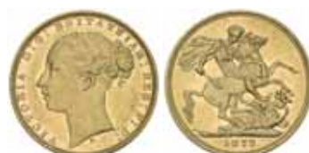
1299* Queen Victoria , 1873 Melbourne. Minor contact marks on obverse, otherwise good extremely fine.