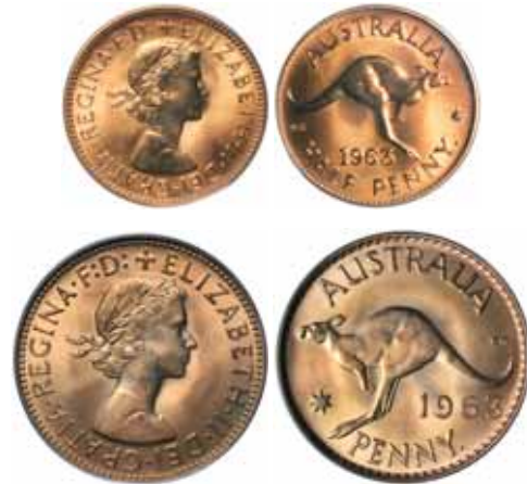
1378* Elizabeth II , Perth Mint proof set, 1963. FDC. (2) $550