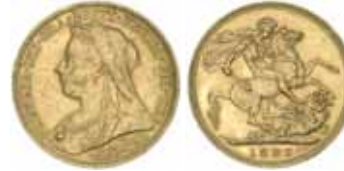
1332* Queen Victoria , young head, 1887 Sydney; old head, 1897 Sydney. Good extremely fine; nearly extremely fine, the second scarce. (2)