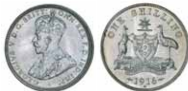
1431* George V, 1916M. Full frosty mint bloom with reverse die flash, uncirculated.