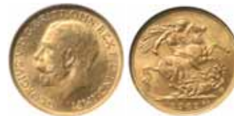
1246* George V , 1921 Sydney. Nearly uncirculated and rare, especially in this condition. $4,000