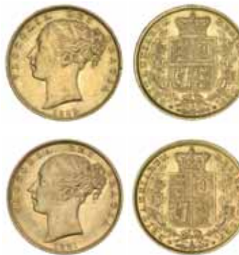
1206* Queen Victoria , 1881 and 1882 Sydney. Good extremely fine. (2)