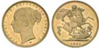
1325* Queen Victoria , 1885 Melbourne (McD 169c). Uncirculated.