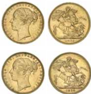
1219* Queen Victoria , 1873 and 1874 Melbourne. Extremely fine. (2)