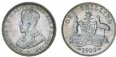
1438* George V, 1922. Nearly extremely fine.