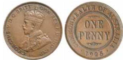
1488* George V, 1925 London die. Q die state, glossy brown nearly extremely fine.