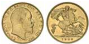
1275* Edward VII , 1909 Melbourne. Nearly uncirculated and scarce thus. $400

Ex W.J.Baker Collection, from Spink Noble Sale 37 (lot 1335).