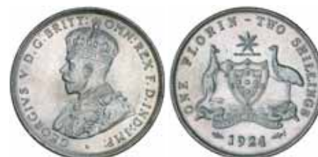
1399* George V, 1924. Weak serif to 4, shallow strike on reverse, considerable mint bloom, uncirculated.