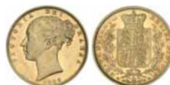
1289* Queen Victoria , 1882 Melbourne. Nearly uncirculated.