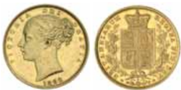
1207* Queen Victoria , 1882 Sydney. Extremely fine.