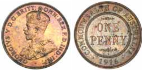
1483* George V, 1916I. Slight patina on the reverse, mirror-like red obverse, uncirculated.