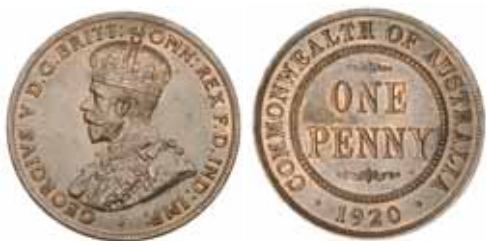
1485* George V, 1920 dot above, 30 degrees die axis, Indian die. Brown and red, nearly uncirculated and scarce thus.