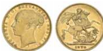
1226* Queen Victoria , 1879 Sydney. Good very fine and scarce.