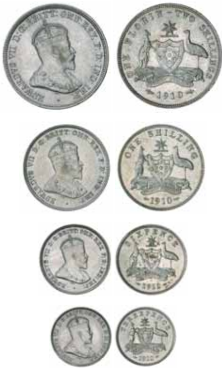
1380* Edward VII , florin, shilling, sixpence and threepence, 1910. Nearly uncirculated - choice uncirculated. (4) $1,500