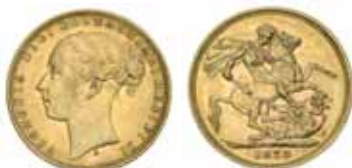
1220* Queen Victoria , 1873 Sydney. Good extremely fine.

Private purchases from Monetarium 25/11/89.