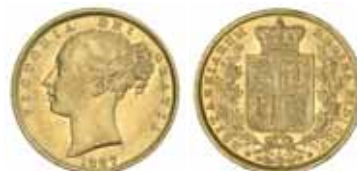
1217* Queen Victoria , 1887 Sydney. Extremely fine/good extremely fine.