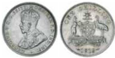
1427* George V, 1913. Extremely fine and very scarce in this condition.