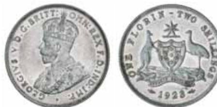
1398* George V, 1923. Considerable mint bloom, nearly uncirculated.