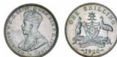
1436* George V, 1920M. Cleaned, otherwise good extremely fine.