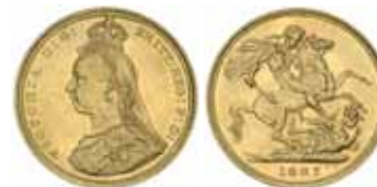
1333* Queen Victoria , Jubilee head, 1887 Sydney (McD 174). Choice uncirculated and rare in this condition, one of the finest known.