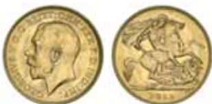
1277* George V , 1915 Melbourne. Nearly uncirculated and scarce. $300

Ex W.J.Baker Collection, from Spink Noble Sale 37 (lot 1337).