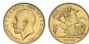
1280* George V , 1918 Perth. Cleaned and flat in the centre of reverse, good extremely fine and rare.

Private purchase from Monetarium 25/11/89.