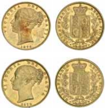
1203* Queen Victoria , 1878 and 1879 Sydney. Extremely fine/good extremely fine. (2)

Ex W.J.Baker Collection, from Spink Australia Sale 30 (lot 1282 part).