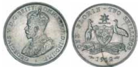
1386* George V , 1912. Nearly uncirculated and rare in this condition. $1,800