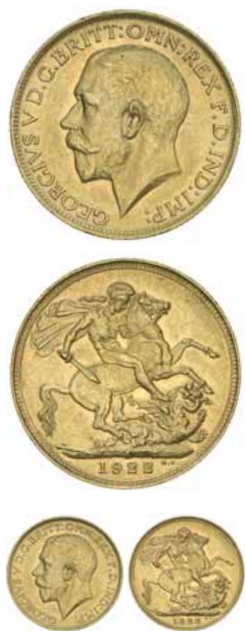
1249* George V , 1922 Sydney. Good extremely fine/nearly uncirculated and extremely rare.