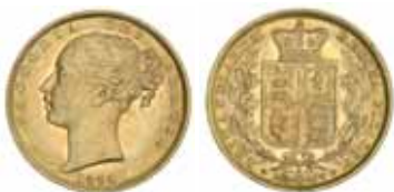
1209* Queen Victoria , 1883 and 1884 Sydney. Good extremely fine. (2)