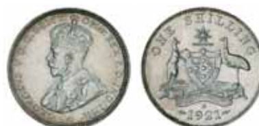
1437* George V, 1921 star. Obverse hairline scratch, cleaned and slight re-toning, otherwise extremely fine and rare thus.