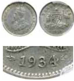
1473* George V, 1934/3 overdate. Nearly extremely fine.