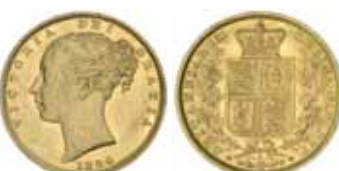
1294* Queen Victoria , 1884 Sydney. Subdued mint bloom, uncirculated.