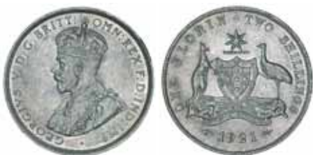
1395* George V, 1921. Frosty mint bloom, good extremely fine. $900

Ex C.R.Deane Collection, from Status International Sale 28/09/98.