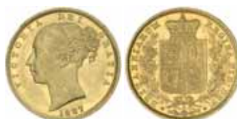
1296* Queen Victoria , young head, 1887 Sydney. Good extremely fine.