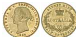
1193* Queen Victoria , second type, 1859. Die break, rim to 5 of date, some mint bloom, good very fine and rare in this condition.

Private purchase from Moneterium 25/11/89, from the India Hoard Spink Australia in 1976.