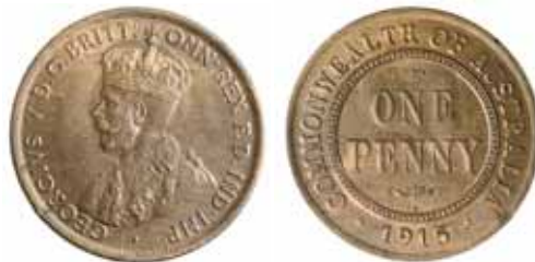
1481* George V, 1915H. Glossy brown and red mint bloom, obverse rim flaw at 8 o'clock, ghost striking, nearly uncirculated and rare as such.