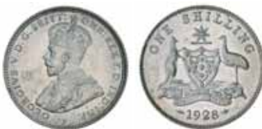
1443* George V, 1928. Considerable original mint bloom, uncirculated and rare as such.