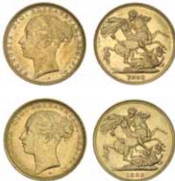
1228* Queen Victoria , 1882 and 1883 Sydney, faint BP. Nearly uncirculated. (2)

Private purchases from Monetarium 25/11/89.