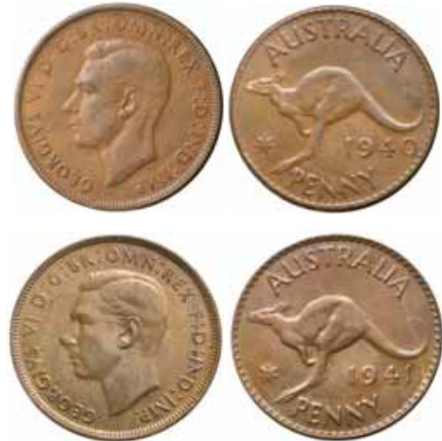
1495* George VI , 1938, 1939, 1940 K.G, 1941Y, 1942Y, 1942I, 1943I. Mostly brown, extremely fine - uncirculated. (7) $500