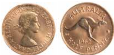
1377* Elizabeth II , Perth Mint proof halfpenny, 1962. Full original mint red, FDC. $350