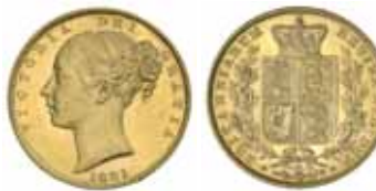
1205* Queen Victoria , 1881 Melbourne. Full original mint bloom, choice uncirculated and very rare in this condition, one of the finest known.