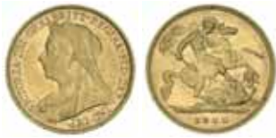
1272* Queen Victoria , 1900 Perth. Nearly very fine and scarce. $400

Ex W.J.Baker Collection, from Spink Australia Sale 32 (lot 1375).