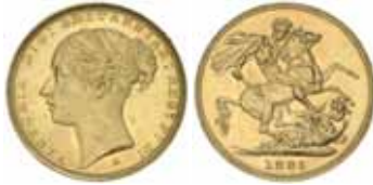
1326* Queen Victoria , 1885 Melbourne, faint BP (McD 169c). Uncirculated.