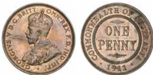
1477* George V, 1911. Brown and red, uncirculated.