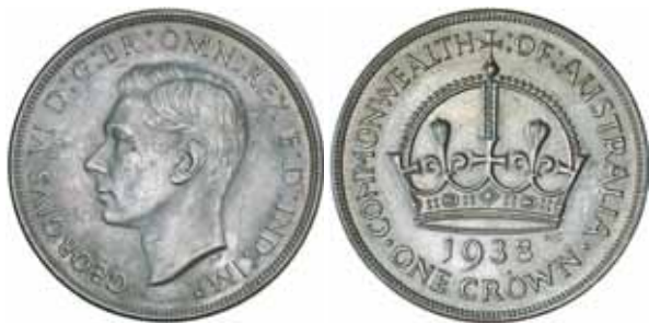
1382* George VI , 1938. Nearly uncirculated. $150