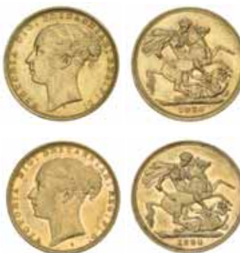
1224* Queen Victoria , 1876 and 1880 Sydney (McD 158b). Good extremely fine; nearly uncirculated. (2)