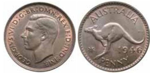
1494* George VI , 1946. Glossy, grey brown patina with some mint red, uncirculated and rare as such. $500