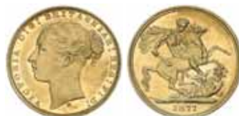
1225* Queen Victoria , 1877 Melbourne. Good extremely fine.

Private purchases from Monetarium 25/11/89.