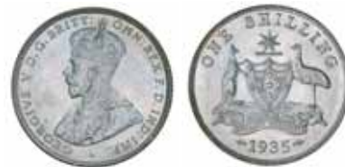
1448* George V, 1935. Semi-satin-like original mint bloom, choice uncirculated.