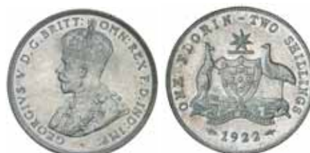
1397* George V, 1922. Considerable original frosty mint bloom, uncirculated and rare in this condition.

Ex C.R.Deane Collection, from Status International Sale 28/09/98.