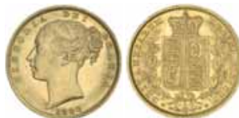
1295* Queen Victoria , 1886 Sydney. Hairline die break along truncation, nearly uncirculated.