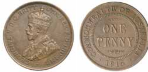
1479* George V, 1914 and 1915. Traces of red on the first, extremely fine - nearly extremely fine, both scarce. (2)