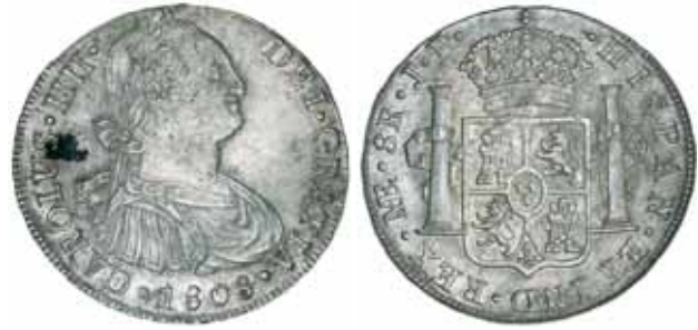
1154* Peru , Charles III (1788-1808), eight reales, Lima Mint, 1808JP (KM.97). Some original mint bloom, nearly extremely fine.