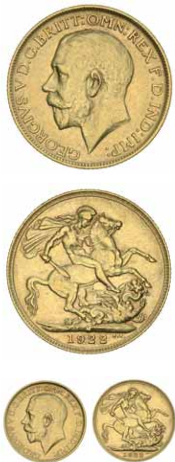
1248* George V , 1922 Melbourne. Mint mark flat at top, good very fine and extremely rare.