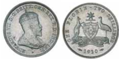
1383* Edward VII , 1910. Considerable mint bloom, nearly uncirculated. $850