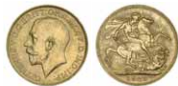
1251* George V , 1923 Melbourne. Extremely fine.