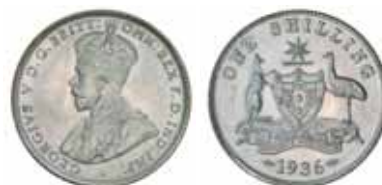
1449* George V, 1936. Full satin-like original mint bloom, unmarked surfaces, choice uncirculated.