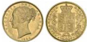
1213* Queen Victoria , 1884 Sydney. Good extremely fine.

Private purchase from Spink Australia in 1985 ($500).