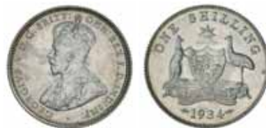
1447* George V, 1934. Extremely fine.