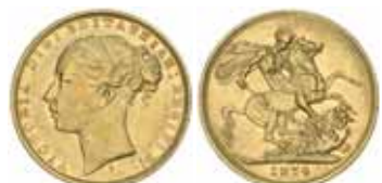
1221* Queen Victoria , 1874 Sydney. Good very fine.

Private purchase from Monetarium 25/11/89.