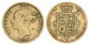
1093* Queen Victoria , young head, 1887 Melbourne. Dent on right obverse field, otherwise fine and rare.