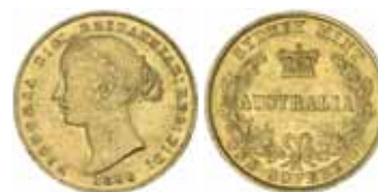
877* Queen Victoria , second type, 1866. Nearly extremely fine. $650