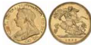
1099* Queen Victoria , old head, 1893 Sydney. Extremely fine/good extremely fine.