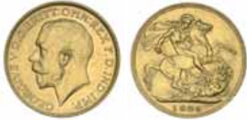
1056* George V , 1920 Melbourne. Extremely fine and very rare. $3,400