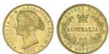
871* Queen Victoria , second type, 1862. Nearly very fine. $500