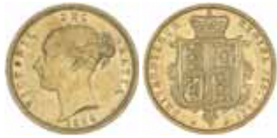
1089* Queen Victoria , 1884 Melbourne. Very fine.