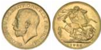
1057* George V , 1920 Perth. Nearly uncirculated. $400