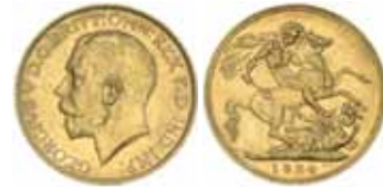
1060* George V , 1924 Perth. Extremely fine/good extremely fine. $650