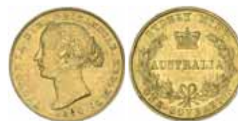
875* Queen Victoria , second type, 1864. Very fine/good very fine. $700 Ex W.Rado Collection.