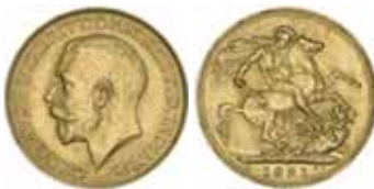
1058* George V , 1921 Sydney. Good very fine and rare. $1,500