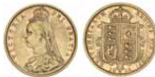
1098* Queen Victoria , Jubilee head, 1893 Melbourne. Very fine/good very fine.