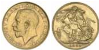
1059* George V , 1923 Melbourne. Nearly uncirculated. $650