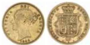
1092* Queen Victoria , 1886 Sydney. Toned, fine/good fine.