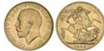
1063* George V , 1926 Perth. Obverse contact marks, otherwise nearly uncirculated and very scarce. $1,500