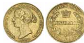
876* Queen Victoria , second type, 1864. Good fine. $400 Ex W.Rado Collection.