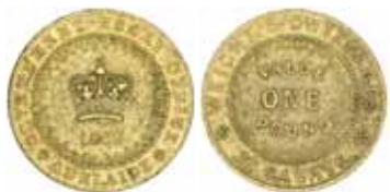
869* Adelaide pound , 1852, second type with crenellated inner circle on the reverse, later die state. Nearly very fine. $7,000