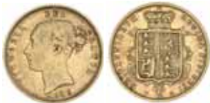
1091* Queen Victoria , 1886 Melbourne. Toned, good fine/very fine.