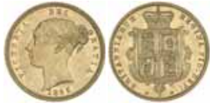
1090* Queen Victoria , 1885 Melbourne. Nearly extremely fine/ extremely fine and rare.