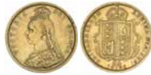
1095* Queen Victoria , Jubilee head, 1887 Sydney (McD.32b). Very fine/good very fine.