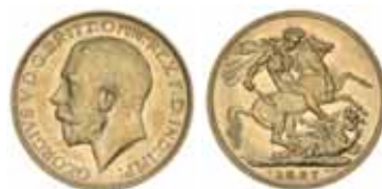
1065* George V , 1927 Perth. Good extremely fine/nearly uncirculated and scarce. $750