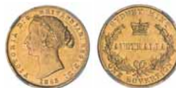
872* Queen Victoria , second type, 1863. Good very fine. $750 In a slab by NGC as AU50.