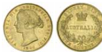
874* Queen Victoria , second type, 1864. Extremely fine. $800