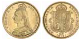
1097 Queen Victoria , 1891 Sydney, no JEB (McD.38a). Nearly extremely fine/extremely fine.