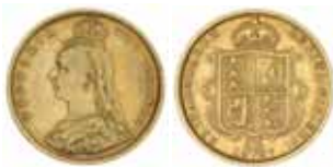
1094* Queen Victoria , Jubilee head, 1887 Sydney (McD.32a). Very fine.