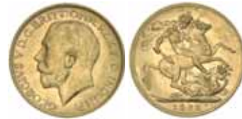
1062* George V , 1925 Perth. Extremely fine/good extremely fine and scarce. $720