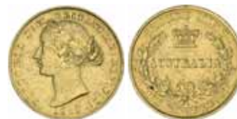
873* Queen Victoria , second type, 1863. Good fine. $500 Ex W.Rado Collection.