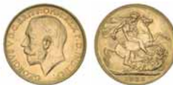
1064* George V , 1926 Perth. Rubbed obverse, extremely fine/nearly extremely fine and very scarce. $1,800