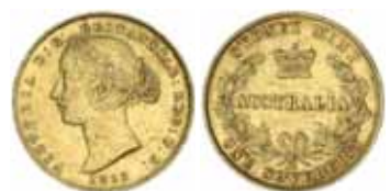
870* Queen Victoria , second type, 1862. Good very fine and rare in this condition. $1,500