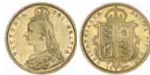
1096* Queen Victoria , 1889 Sydney. Very fine/good very fine.