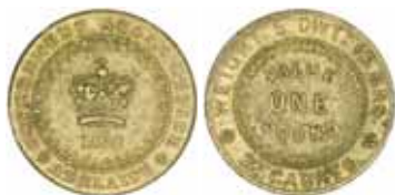
868* Adelaide pound , 1852, second type with crenellated inner circle on the reverse, later die state. Nearly very fine. $7,000