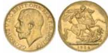
1061* George V , 1924 Sydney. Hardly noticeable rim nicks, otherwise good extremely fine and rare. $2,500