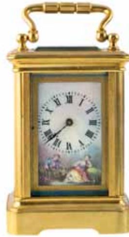
1485* Carriage clock , "Mignonette", French manufacture, Edwardian period, c1905, brass case, the face and sides of Sevres style porcelain panels, (80mm high), in custom case by The Goldsmith's and Silversmith's Company. Very fine and scarce .