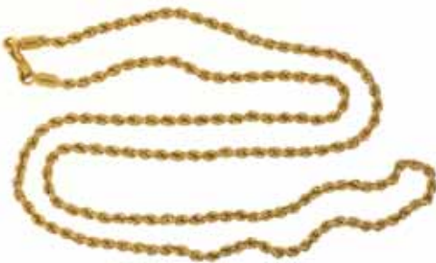
1513* Gold necklace , yellow gold rope chain (24ct; 44.96g; 67cm). Extremely fine.