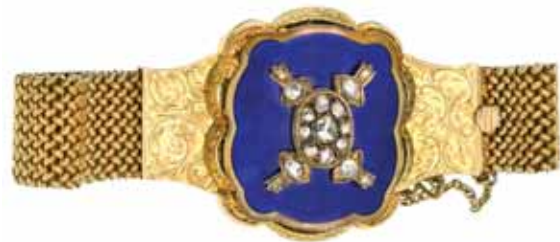
1517* Gold and diamond bracelet , features a blue polished rectangular panel inlaid in gold and in the centre is an oval with a centre diamond and eight diamonds around and behind are diamond decorated cross arms, this rectangular panel sits on an elaborately engraved panel fitted to a mesh bracelet with a safety chain, all in 18ct gold (tot wt 55.42g). Very fine - extremely fine.