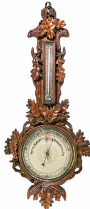
1490* Edwardian , Oak Aneroid barometer, c1900, large circular barometer below, vertical thermometer above, housed in an intricately carved case with oak leaf and acorn motifs, (890mm high). Very fine.