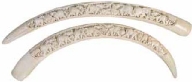
1598* Africa , 20th century, pair of elephant tusks carved with scenes of elephants cavorting amongst trees, (830mm and 760mm long). Very fine. (2)