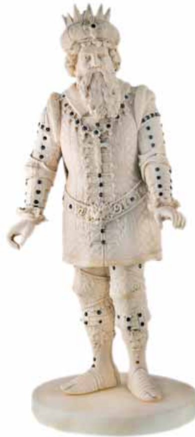
1602* France , 19th century, tusk carving of the Frankish King Clovis I, depicted standing in a fleur de lis robe, crowned and wearing a cross, studded with semi-precious stones, on circular white marble base, (320mm high). Very fine and scarce.