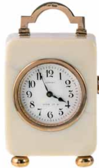
1489* Asprey of London , Edwardian period, c1910, miniature carriage timepiece, tusk case, mounted with 9ct gold fittings, French movement, (100mm high). Slight damage and repair to case, otherwise very fine.