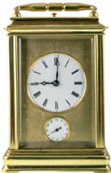
1484* Carriage clock , c1900, French manufacture, Aiguilles, enamelled dial with Roman numerals and separate seconds dial, in brass case, (145mm high). Very fine .