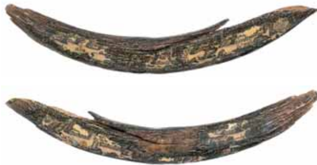
1575* China , mammoth tusk, c10,000 years old, carved with polychrome scenes of scholars, (480mm long). Very fine and scarce.