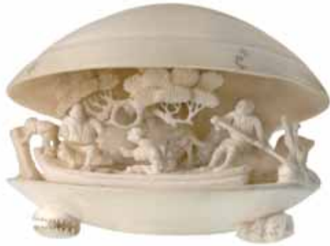
1591* Japan , 19th century, tusk carving depicting a mussel shell opening to reveal an interior boating scene, signed at base, (55mm wide). Very fine.