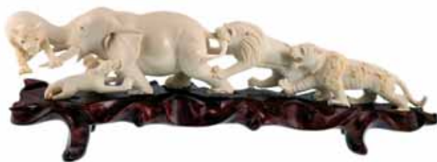
1593* Japan , 20th century, tusk carving group, depicting an elephant battling with lions, a tiger and a leopard, (290mm wide). Very fine.