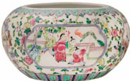
1573* China , early 20th century, heavy porcelain Koi fish bowl jardiniere, of bulbous form, decorated in polychrome with various outdoor scenes including armed combat and kite flying, signed to base, (280x145mm). Very fine.