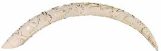
1599* Africa , 20th century, elephant tusk carved with elephants and floral panels, (1230mm long). Very fine.