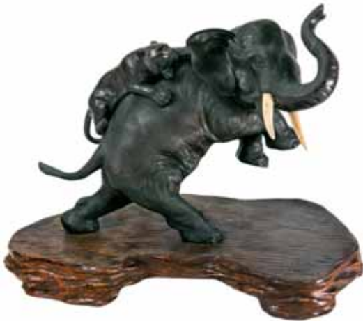
1588* Japan , bronze figural group, Meiji period, late 19th century, modelled as an elephant under attack by a lion, ivory tusks inset, mounted on a wooden base, (340mm wide). Very fine.