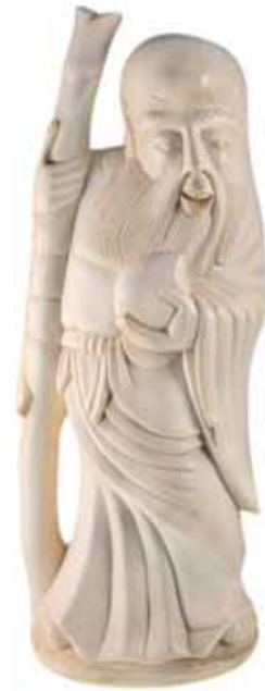
1585* China , 20th century, tusk figure depicting a Taoist monk standing, holding staff and apple, (300mm high). Very fine. $200