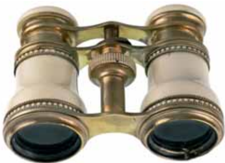
1617* United Kingdom , Edwardian period, brass opera glasses, tusk mounted, (100mm wide). Very fine.