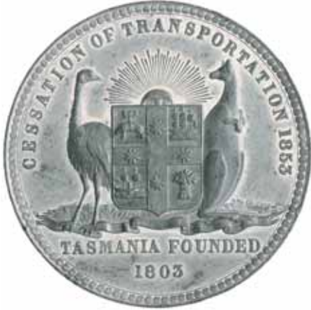
1644* Cessation of Transportation , 1853, in white metal (58mm) (C.1853/2), by Royal Mint, London. Short, thin scratch on reverse, otherwise nearly extremely fine with some mint bloom.