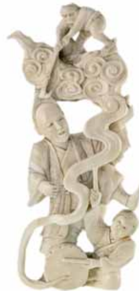
1586* Japan , Meiji period, 19th century, tusk okimono carving of a demon descending from the clouds to attack a man, drummer below, (170mm high). Very fine. $200