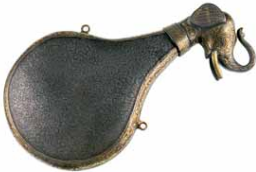
1616* India , 19th century, damascened steel powder flask, the screwtop stopper modelled as an elephant head, intricately inlaid with gold patterns, (170mm high). Very fine and scarce.