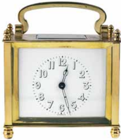
1487* Carriage clock , French manufacture, c1920s, of rectangular form, inscribed "Aiguilles", with strike and chime mechanism, brass case, (100mm high), in original fitted case. Very fine.