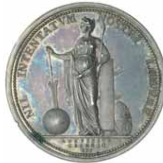
1632* Captain James Cook , memorial medal (1784) in silver (43mm) by L.Pingo for the Royal Society (MH 374; BHM 258). Attractively toned, nearly uncirculated and rare . $2,000

Ex Spink Australia Sale 4 (lot 207) and L.Richard Smith Collection (Noble Numismatics Sale 80, lot 599).