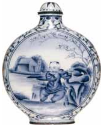
1572* China , early 20th century, blue and white enameled metal snuff bottle, of circular form, decorated with a scene of a mother and child in a rural setting, stopper intact, (75mm high). Extremely fine.