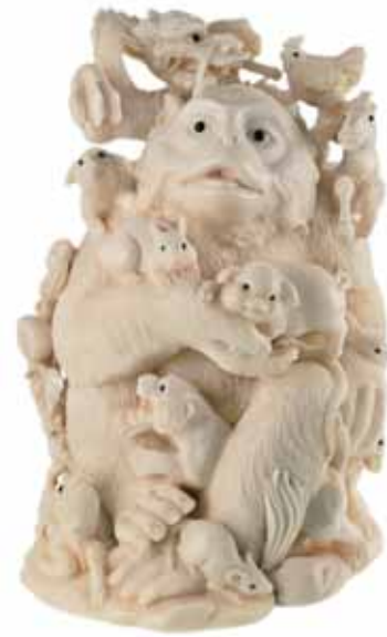
1589* Japan , Meiji period, late 19th century, tusk carving group depicting the Chinese zodiac animals, large central monkey, signed Tomotada at the base, (125mm high). Very fine.