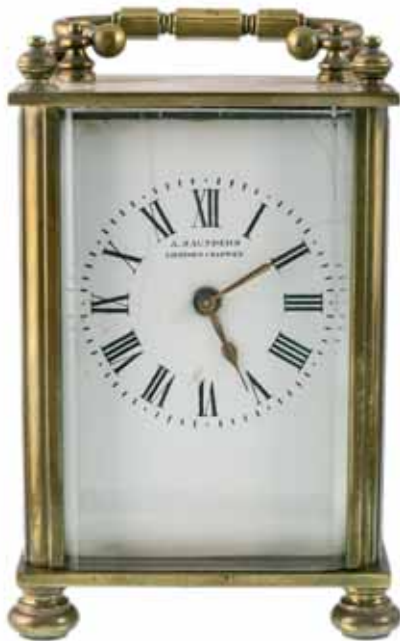
1488* Carriage clock , Edwardian period, c1905, by A.Saunders London-Sidney (sic), brass case, enamelled dial with Roman numerals, glass sides, (135mm high). Very fine.