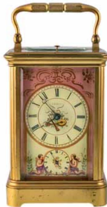
1486* Carriage clock , late 19th century French porcelain panelled repeating carriage clock, dial signed A. Reitz, corniche cased with pink and gilt porcelain panels, musical instruments to the centre of the Roman dial, cupids either side of the alarm dial, also cupid on the side panels, the right hand panel with damage, the twin barrel mechanism with rack striking on a gong and lever platform escapement with uncut bi-metallic balance, (165mm high). Extremely fine .