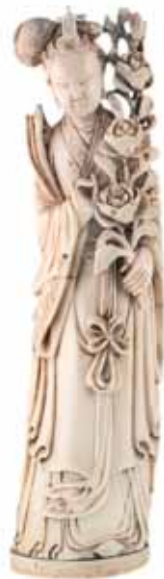
1592* Japan , early 20th century, tusk okimono carving, depicting Chosen standing, enrobed in kimono, holding floral display, (230mm high), signed at base. Very fine.