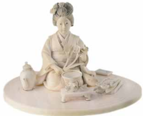
1590* Japan , Meiji period, late 19th century, tusk carving group depicting a kneeling geisha performing a tea ceremony, inlaid with mother of pearl flowers, on circular base, signed, (125mm wide). Very fine and intricately carved.