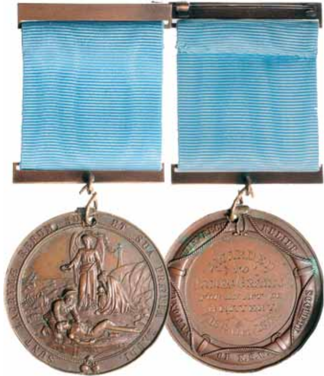
1646* National Shipwreck Relief Society of N.S.W. Bronze Medal , reverse inscribed, 'Awarded/To/James Graham/For An Act Of/Bravery/16th Oct. 1877.', in case. Some toning on case lid lining, medal with a few edge bumps and some areas of oxidation, a scratch on reverse, suspender bracket broken and replaced with a loop, otherwise very fine.