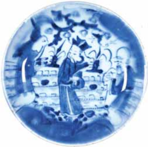
1571* China , Qing Dynasty, blue and white dish, Kangxi period, depicting scholars in a garden scene, 145mm diameter, signed at base. Extremely fine with no cracks.