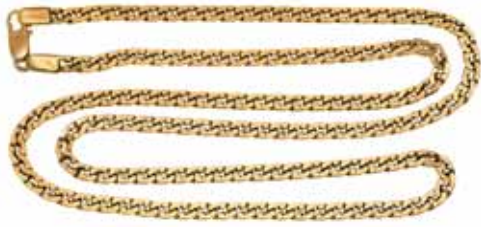
1511* Gold necklace , curb link in 18ct gold (36.56g; 60cm). Very fine.