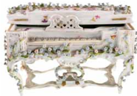
1620* Germany , early 20th century, Meissen porcelain miniature pianoforte, polychrome with applied flowers, (165mm wide). One leg repaired, otherwise very fine.