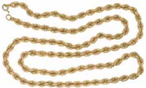
1512* Gold necklace , yellow gold rope chain (18ct; 43.7g; 80cm). Extremely fine.