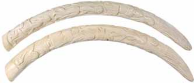
1597* Africa , 20th century, pair of elephant tusks carved with scenes of tribal figures working, (740mm long). Very fine. (2)