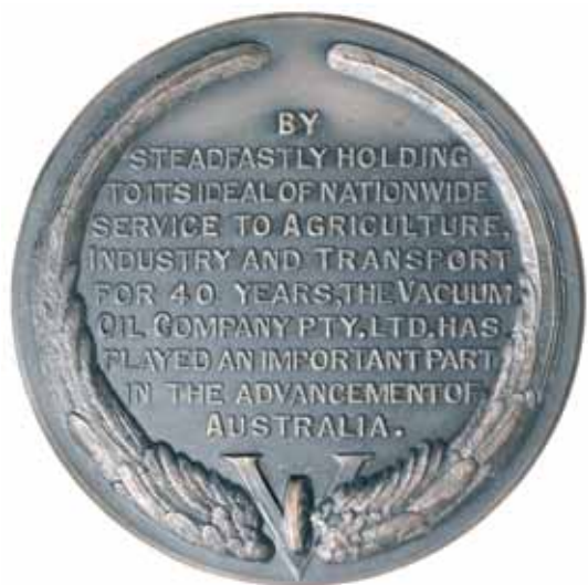
1680* Vacuum Oil Company , Fortieth Anniversary, 1935, in silvered (69mm) (C.1935/7), by Stokes & Sons. In original case, toning at right obverse edge, otherwise uncirculated. $100

Ex Noble Numismatics Sale 105 (lot 895).