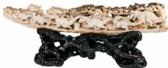
1576* China , mammoth tusk, c10,000 years old, carved in the 20th century, depicting dinosaurs racing through a prehistoric forest pursued by a Tyrannosaurus Rex, (380mm long), on custom hardwood stand, signed. Very fine.