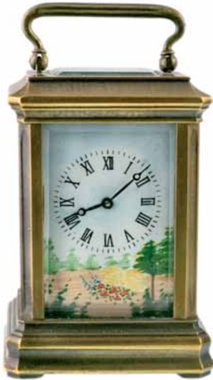
1483* Carriage clock , miniature proportions, c1920s, French manufacture, the face and side panels of painted enamel with rural scenes, (90mm high). Very fine .