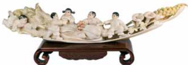
1584* China , early 20th century, tusk carving of children playing on a bok choy plant, polychrome colouring, on custom stand, (420mm long). Very fine. $250