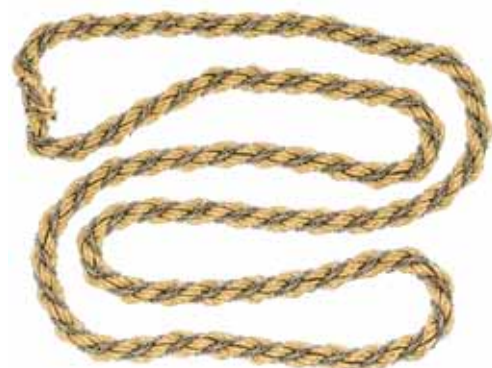
1518* Gold necklace , white and yellow gold rope chain (18ct; 62.48g; 68cm). Extremely fine.