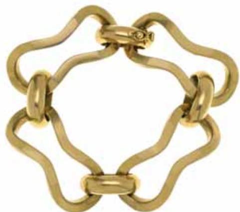
1514* Gold bracelet , four very large '8' shaped links with smaller stirrup link between, featuring yellow gold with white gold features (18ct; 42.99g). Very fine.