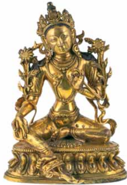
1594* Tibet , 18th century, gilt bronze Green Tara Bodhisattva, seated on a double lotus throne, adorned with an elaborate headress, floral disk earrings, necklaces and lotus blossoms on shoulders, hand depicted in the Varada gift giving mudra, copper base, (175mm high x 110mm wide). Extremely fine and rare.