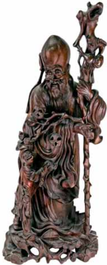
1582* China , late 19th century, hardwood carving of a deity, modelled with Taoist emblems holding an ornate staff, eyes inlaid, (530mm high). Slight damage otherwise very fine. $50