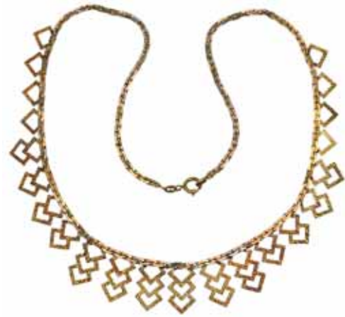
1515* Gold necklace , handcrafted in 14ct gold (20.67g; 43cm), features a voided series of square, double overlaid square and triple overlaid square shaped patterns in descending order around the chain. Some toning, otherwise very fine.