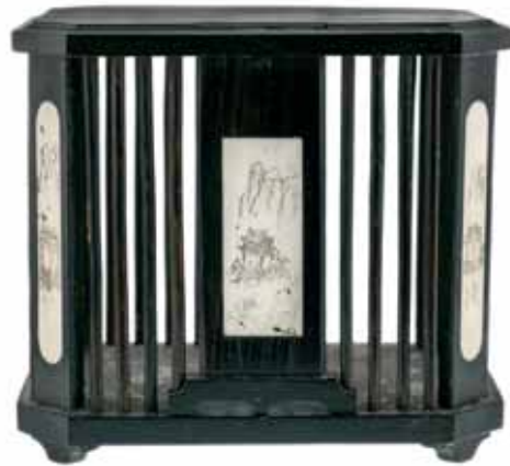
1574* China , 19th century, rosewood cricket cage, of octagonal form with sliding door, inset with bone panels carved with rural scenes, (80mm high x 90mm wide). Very fine and rare.