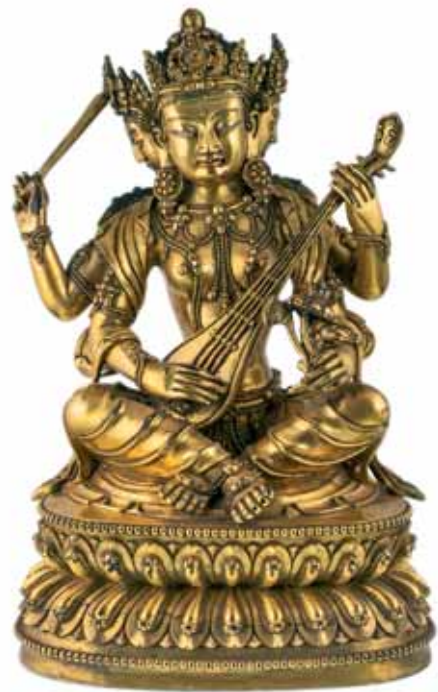
1595* Tibet , late 18th century, gilt bronze Ushnishavijaya, seated on a double lotus throne, the three faced diety with four arms is adorned with an elaborate victorious crown, floral disk earrings and necklaces, playing the traditional dramyen instrument and holding a lotus and sword, Chinese script atop the lotus throne, the copper base engraved with a vajra bolt symbol stamp, (230mm high x 145mm wide). Extremely fine and rare.