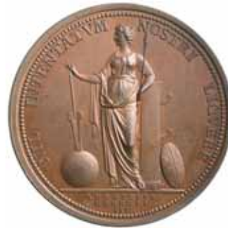
1633* Captain James Cook , memorial medal (1784) in bronze (43mm) by L.Pingo for the Royal Society (MH 374; BHM 758). Practically mint state, attractive brown patina, nearly uncirculated . $800