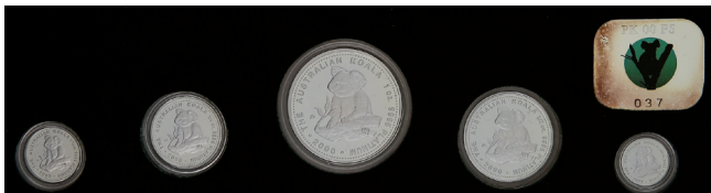
1599* Elizabeth II, Perth Mint, proof platinum one twentieth, one tenth, one quarter, half and one ounce koala five coin set, 2000. In jarrah timber case of issue with PK00 FS ingot number 037 of 135 issued, FDC. $2,300