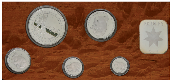
1603* Elizabeth II, Perth Mint, proof .9995 fine platinum koala five coin set, 2004, containing one twentieth, one tenth, quarter, half and one ounce koalas. In timber case of issue, FDC. $2,300