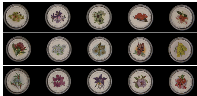
1605* Elizabeth II, Perth Mint, proof .9995 fine platinum fifteen coin set, 2006-2008, Discover Australia series, 1/2 ounce each coin and each coin with a unique design featuring Australian flora. In cases (3) of issue with certificates, FDC. (15 coins) $10,000