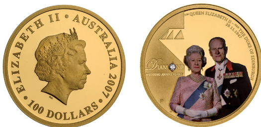
1541* Elizabeth II, Perth Mint, proof one ounce fine gold one hundred dollars, 2007, HM Queen Elizabeth II & HRH The Duke of Edinburgh Diamond Wedding Anniversary. In case of issue, no 0185 of 1000, FDC.