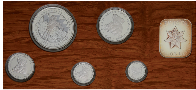
1602* Elizabeth II, Perth Mint, proof .9995 fine platinum koala five coin set, 2003, containing one twentieth, one tenth, quarter, half and one ounce koalas. In timber case of issue, FDC. $2,300