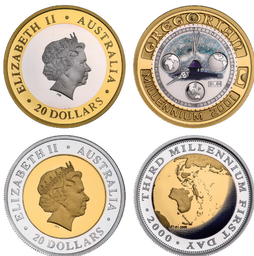
1573* Elizabeth II, Perth Mint, proof-like bi-metal silver and gold twenty dollars, 2001 Millennium issue. In cases of issue, uncirculated. (2)