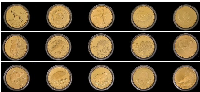
1536* Elizabeth II, Perth Mint, proof fine gold fifteen coin set, 2006-2008, Discover Australia series, 1/2 ounce each coin, featuring unique designs for each year of Australian Fauna. In cases (3) of issue with certificates, FDC. (15 coins)