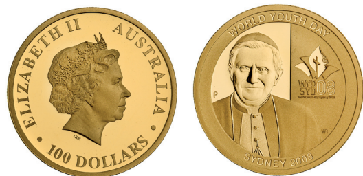
1545* Elizabeth II, Perth Mint, proof one ounce fine gold one hundred dollars, 2008, World Youth Day Commemorative. FDC.