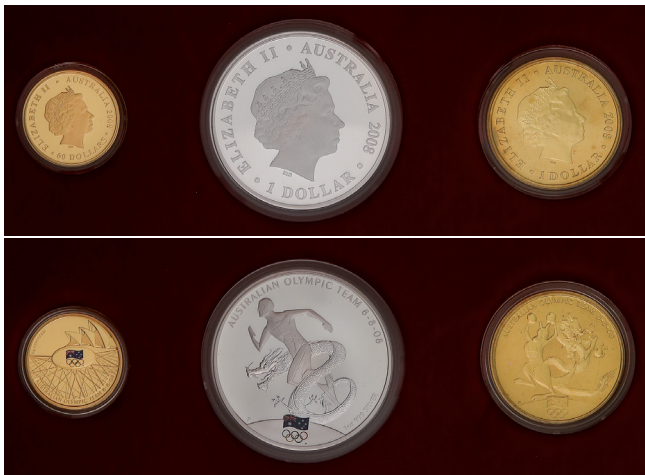
1579* Elizabeth II, Perth Mint, proof three coin set, 2008, Australian Olympic Team, contains fine gold sixty dollars (10g); one ounce fine silver dollar and aluminium bronze dollar. In cases of issue, FDC. (2)