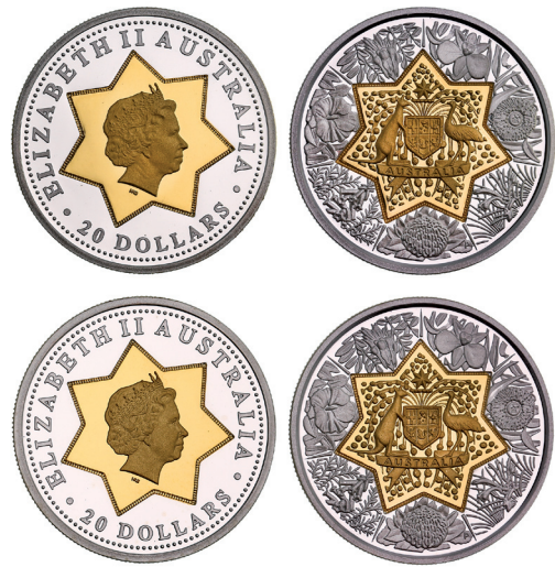
1574* Elizabeth II, Perth Mint, proof bi-metal gold and silver twenty dollars, Floral Emblems 2001 (.AGW = .285 troy ounces, ASW = .346 troy ounces each). In timber cases of issue with certificates, FDC. (2)