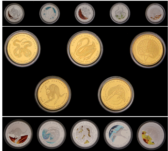
1537* Elizabeth II, Perth Mint, proof fifteen coin set, 2009, Discover Australia series, containing five fine silver one ounce silver dollars; five proof fine gold half ounce fifty dollars; five proof .9995 fine platinum fifty dollars, all coins featuring Australian animals in the style of Aboriginal Art. In cases (3) of issue, FDC. (15 coins)