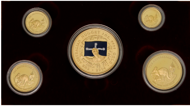
1534* Elizabeth II, Perth Mint, proof fine gold five coin set, 2004, The Australian Nugget, contains 1.90 ounces of gold. In case of issue, FDC.