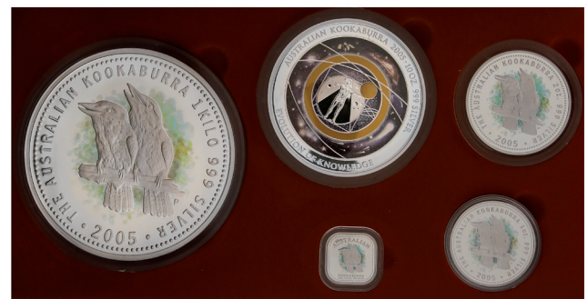
1611* Elizabeth II , Perth Mint proof Kilo Collection, 2005, contains half, one, two, ten ounce and kilo kookaburras. In case of issue, FDC.