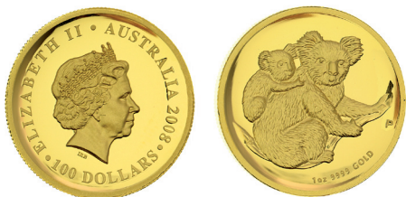
1549* Elizabeth II , Perth Mint, proof one ounce fine gold, high relief koala, 2008. In case, no 0488 of 2000 issued, FDC. $2,400