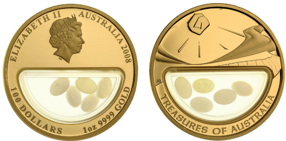
1543* Elizabeth II, Perth Mint, proof one ounce fine gold one hundred dollars, 2008, Treasures of Australia series, Opals. In case of issue with certificate, FDC.