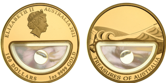
1548* Elizabeth II , Perth Mint, proof one ounce fine gold one hundred dollars, 2011, Treasures of Australia series, Pearls. In case of issue with certificate, FDC. $3,000