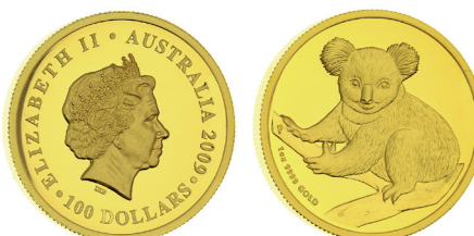
1550* Elizabeth II , Perth Mint, proof one ounce fine gold high relief koala, 2009. In case, no 0782 of 2000 issued, FDC. $2,400