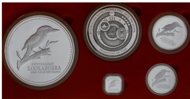
1608* Elizabeth II , Perth Mint, proof fine silver Kilo Collection, 2002, containing half, one two, ten ounce and kilo kookaburras. In case of issue, FDC.