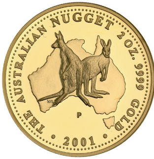
1539* Elizabeth II, Perth Mint, proof two ounce gold kangaroo nugget two hundred dollars, 2001. FDC.