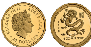
1554* Elizabeth II , Perth Mint, proof quarter ounce fine gold twenty five dollars, 2000, Lunar series I, Year of The Dragon commemorative. In case of issue, FDC. $620