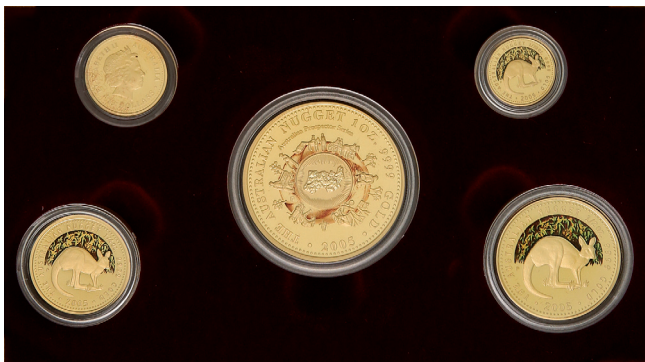
1535* Elizabeth II, Perth Mint, proof fine gold five coin set, 2005, The Australian Nugget, 20th Anniversary Edition, contains proof one twentieth, one tenth, quarter, half and one ounce coins. In timber case of issue with certificate No 288 of 500, FDC.