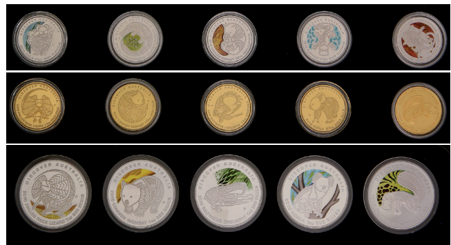
1538* Elizabeth II, Perth Mint, proof fifteen coin set, 2010, Discover Australia series, containing five proof one ounce silver dollars; five proof half ounce fine gold fifty dollars; proof .9995 fine platinum fifty dollars, each coin depicting an Australian animal in the style of Aboriginal Art. In cases (3) of issue, FDC. (15 coins)