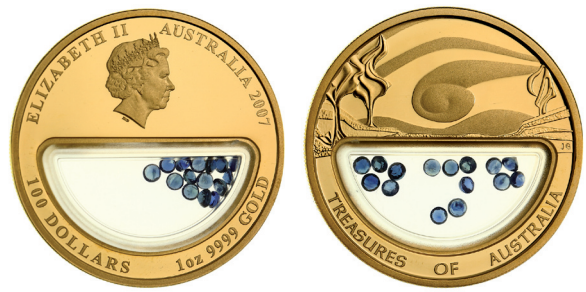
1542* Elizabeth II, Perth Mint, proof one ounce fine gold one hundred dollars, 2007, Treasures of Australia series, Sapphires. In case of issue with certificate, FDC.