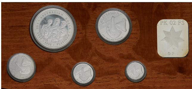
1601* Elizabeth II, Perth Mint, proof .9995 fine platinum five coin set, 2002, containing one twentieth, one tenth, quarter, half and one ounce koalas. In timber case of issue, FDC. $2,300