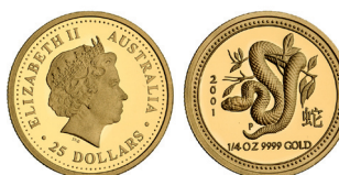
1553* Elizabeth II , Perth Mint, proof quarter ounce fine gold twenty five dollars, 2001, Lunar series I, Year of The Snake commemorative. In case of issue, FDC. $620