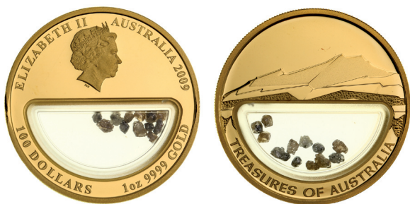
1546* Elizabeth II , Perth Mint, proof one ounce fine gold one hundred dollars, 2009, Treasures of Australia series, Diamonds. In case of issue with certificate, FDC. $3,000

Contains several encapsulated real diamonds.