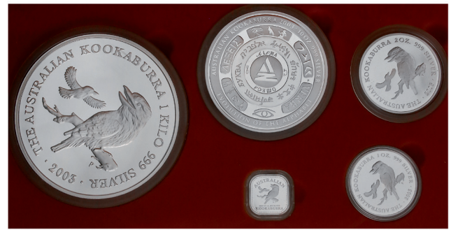
1609* Elizabeth II , Perth Mint, proof fine silver Kilo Collection, 2003, containing half, one, two, ten ounce and kilo kookaburras. In case of issue, FDC.