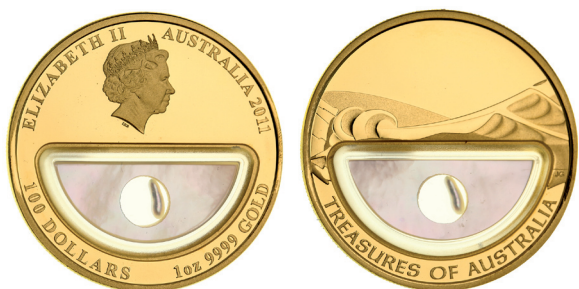
1547* Elizabeth II , Perth Mint, proof one ounce fine gold one hundred dollars, 2011, Treasures of Australia series, Pearls. In case of issue with certificate, FDC. $3,000

Contains several encapsulated real diamonds.