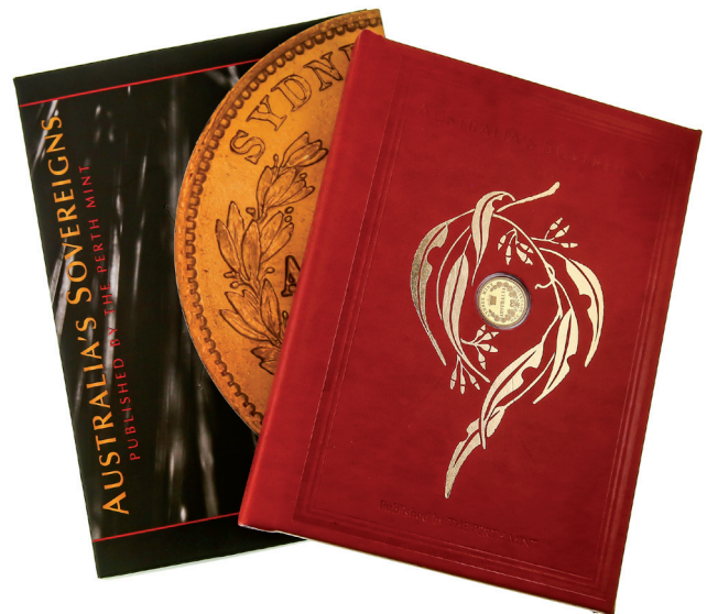
1576* Elizabeth II, Perth Mint, proof gold twenty five dollars or sovereigns, 2005, 150th Anniversary of the Sydney Mint. In official booklets, FDC. (2)