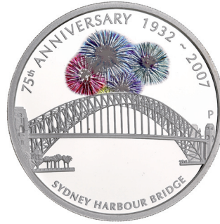
1584* Elizabeth II, Perth Mint, proof one twenty fifth ounce 99.99 fine gold five dollars, 2007, 75th Anniversary of Sydney Harbour Bridge, also proof one ounce 99.99 fine silver one dollar, 2007, 75th Anniversary of the Sydney Harbour Bridge 1932-2007. In case of issue with certificate, FDC. (2)