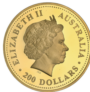
lot 1539 part