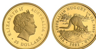
1552* Elizabeth II , Perth Mint, proof 9999 fine gold quarter ounce kangaroo nugget coin, 2002. In case of issue, FDC with certificate 030. $600