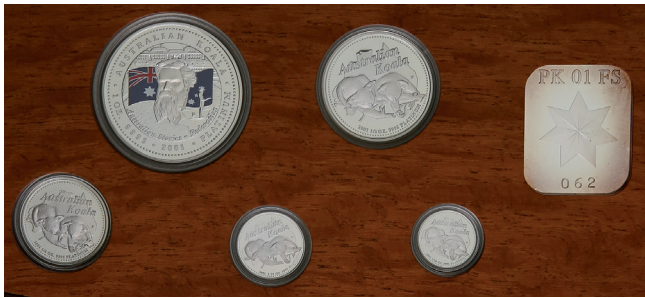
1600* Elizabeth II, Perth Mint, proof pure platinum koala, five coin set, one twentieth, one tenth, one quarter, half and one ounce, 2001. In case of issue with PK 01 FS ingot number 062 of only 250 issued, FDC. $2,300