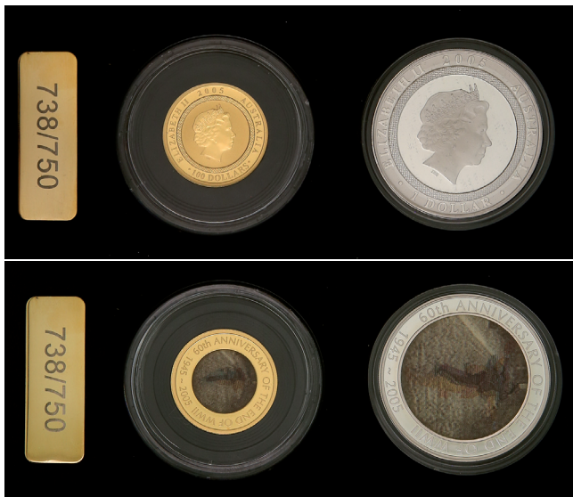
1540* Elizabeth II, Perth Mint, proof gold and silver two coin set, 2005, 60th Anniversary of the end of WW II, containing one ounce fine gold one hundred dollars and one ounce fine silver dollar, each featuring a hologram of the famous "Dancing Man". In case, no 738 of 750 issued, FDC.

Contains several encapsulated real sapphires.