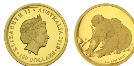
1551* Elizabeth II , Perth Mint, proof one ounce fine gold high relief koala, 2010. In case, no 0938 of 2000 issued, FDC. $2,400