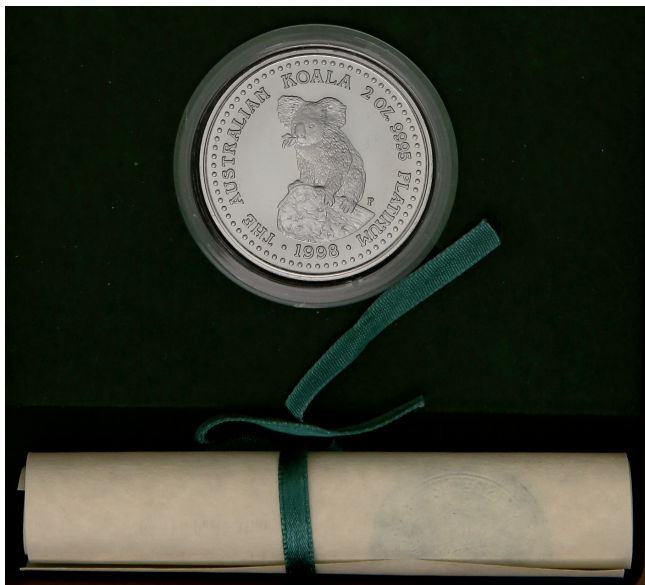
lot 1592 part