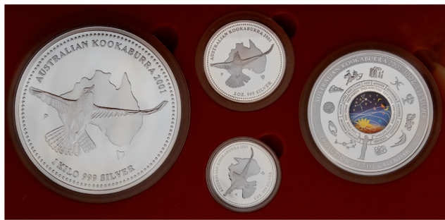
1607* Elizabeth II , Perth Mint, proof fine silver Kilo Collection, 2001, containing, one, two, ten ounce and kilo kookaburras. In case of issue, FDC.