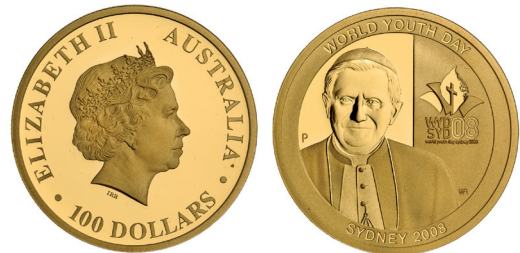
1544* Elizabeth II, Perth Mint, proof one ounce fine gold one hundred dollars, 2008, World Youth Day Commemorative. FDC.