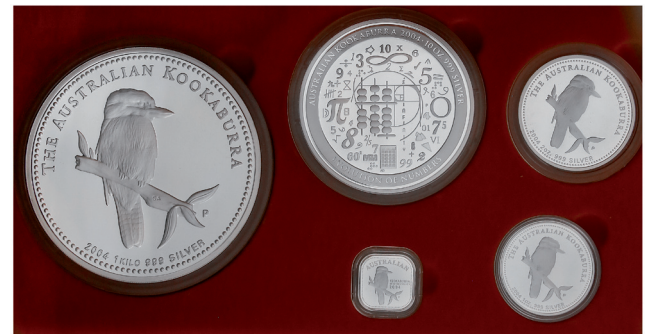
1610* Elizabeth II , Perth Mint, proof fine silver Kilo Collection, 2004, containing half, one, two, ten ounce and kilo kookaburras. In case of issue, FDC.