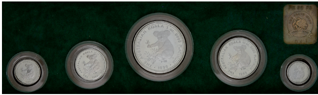
1598* Elizabeth II, Perth Mint, proof platinum one twentieth, one tenth, one quarter, half and one ounce koala five coin set, 1999. In timber case of issue with ingot set number 041 of only 108 sets issued, the ingot toned, otherwise FDC. $2,300