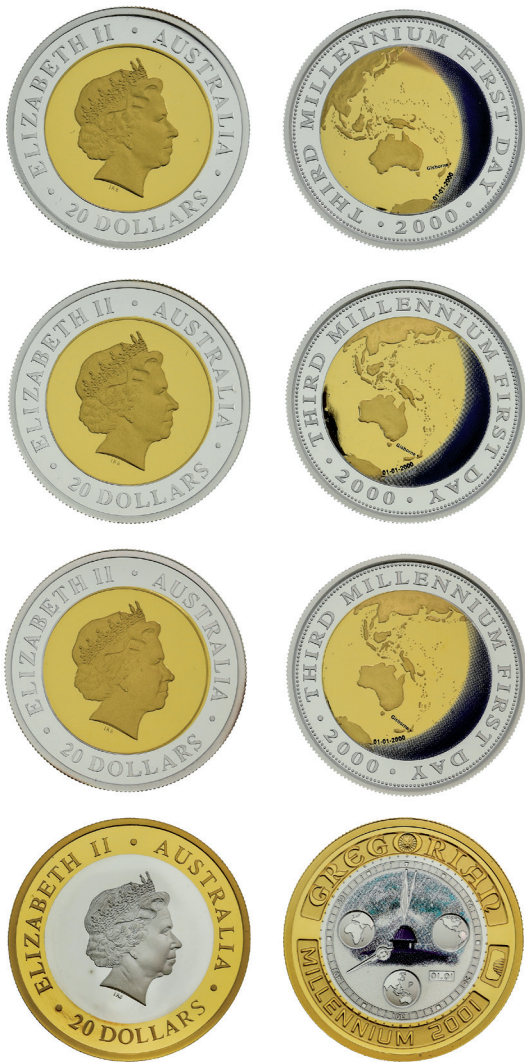
1572* Elizabeth II, Perth Mint, proof twenty dollars, 2000 bi-metal (gold and silver) Millennium issue. In cases of issue with certificates, FDC. (4)