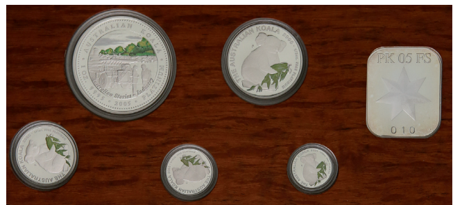
1604* Elizabeth II, Perth Mint, proof .9995 fine platinum koala five coin set, 2005, containing one twentieth, one tenth, quarter, half and one ounce koalas. In timber case of issue, FDC. $2,300