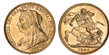
2239* Queen Victoria, 1896 Sydney. Nearly extremely fine.