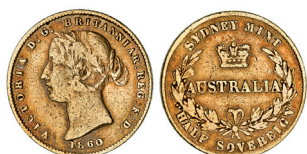
2139* Queen Victoria, second type, 1860. Slight bend, toned nearly fine and rare.