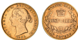
2150* Queen Victoria, second type, 1866. Nearly very fine.