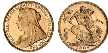
2240* Queen Victoria, 1897 Melbourne. Mirror-like obverse field, nearly uncirculated.