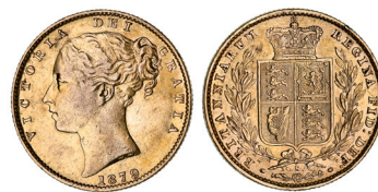
2157* Queen Victoria, 1879 Sydney. Extremely fine.