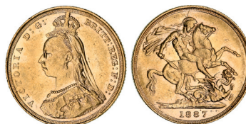
2201* Queen Victoria, Jubilee head, 1887 Sydney (McD.174). Extremely fine. $550