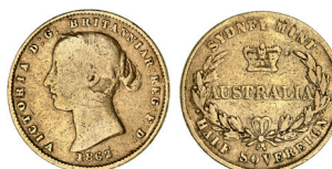
2145* Queen Victoria, second type, 1862. Very good.

Ex D.Featherstone/L.McNaught Collection.