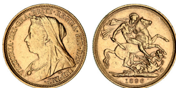
2237* Queen Victoria, 1896 Melbourne. Nearly very fine/good very fine.