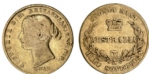
2138* Queen Victoria, second type, 1859. Very good.

Ex D.Featherstone/L.McNaught Collection.