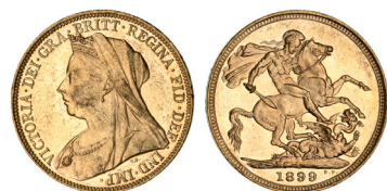
2244* Queen Victoria, 1899 Sydney. Uncirculated.