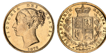
2154* Queen Victoria, 1872 Melbourne. Good extremely fine.

Ex D.Featherstone/L.McNaught Collection.