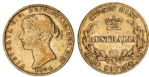
2148* Queen Victoria, second type, 1864. Very good.