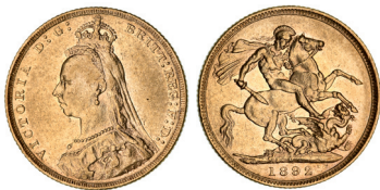
2224* Queen Victoria, 1892 Melbourne. Very fine extremely fine. $650