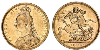
2225* Queen Victoria, 1892 Melbourne. Very fine. $650