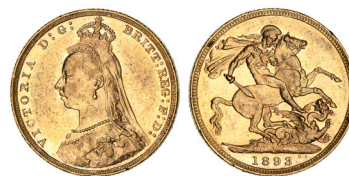
2232* Queen Victoria, Jubilee head, 1893 Melbourne (McD.188a). Extremely fine. $700