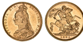
2228* Queen Victoria, 1892 Sydney. Very fine extremely fine. $650