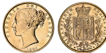
2160* Queen Victoria, 1883 Melbourne. Extremely fine.