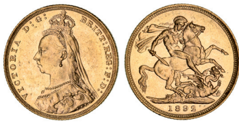
2222* Queen Victoria, 1892 Melbourne. Nearly uncirculated. $500