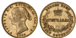
2137* Queen Victoria, second type, 1859. Very good/nearly fine.

Ex D.Featherstone/L.McNaught Collection.