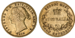
2136* Queen Victoria, second type, 1858. Good fine.