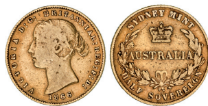
2151* Queen Victoria, second type, 1866. Very good.