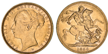
2192* Queen Victoria, 1886 Melbourne. Very fine - extremely fine. (2) $1,200