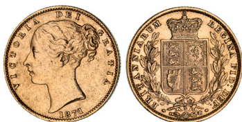
2153* Queen Victoria, 1871 Sydney, WW incuse (McD.118b). Nearly extremely fine.