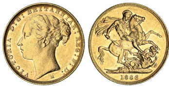
2191* Queen Victoria, 1886 Melbourne. Nearly extremely fine. $600