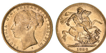
2194* Queen Victoria, 1886 Sydney. Extremely fine. $550