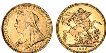
2238* Queen Victoria, 1896 Sydney. Extremely fine.