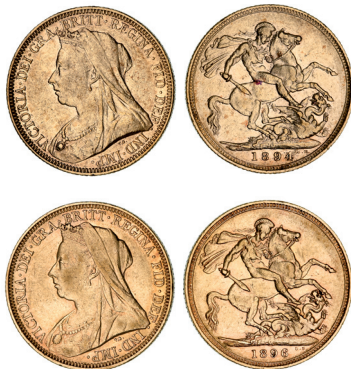
2235* Queen Victoria, 1894 and 1896 Melbourne. Very fine - extremely fine. (2)