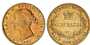
2140* Queen Victoria, second type, 1860. Very good/fine.