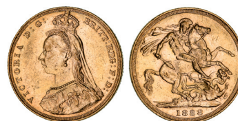
2203* Queen Victoria, 1888 Melbourne (McD.177). Nearly uncirculated. $600