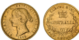
2146* Queen Victoria, second type, 1863. Good fine.

Ex David Ross Collection from Noble Numismatics Sale 65 (lot 1478).