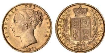
2152* Queen Victoria, 1871 Sydney, WW raised (McD.118a). Nearly uncirculated.