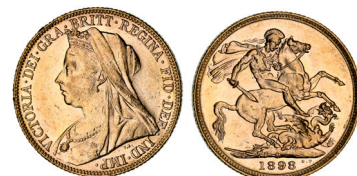
2241* Queen Victoria, 1898 Melbourne. Nearly uncirculated.