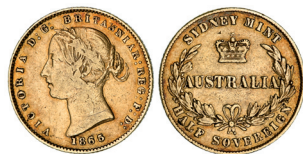
2149* Queen Victoria, second type, 1865. Nearly good fine.