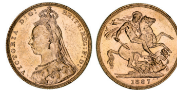
2199* Queen Victoria, Jubilee head, 1887 Melbourne (McD.175a). Extremely fine. $550