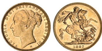
2193* Queen Victoria, 1886 and 1887 Melbourne. Extremely fine. (2) $1,250

Ex Donald McDougal Collection for second coin.