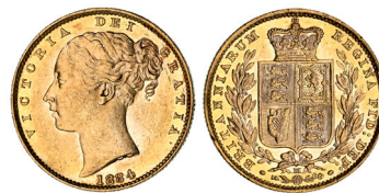
2161* Queen Victoria, 1884 Melbourne. Good extremely fine.