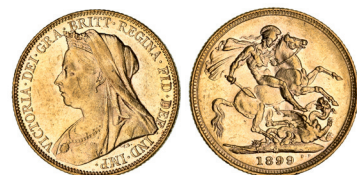
2243* Queen Victoria, 1899 Melbourne and 1899 Sydney. Extremely fine - nearly uncirculated. (2)