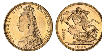
2231* Queen Victoria, Jubilee head, 1893 Melbourne (McD.188a). Nearly uncirculated. $650