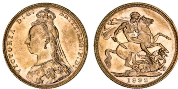
2223* Queen Victoria, 1892 Melbourne. Extremely fine. $650