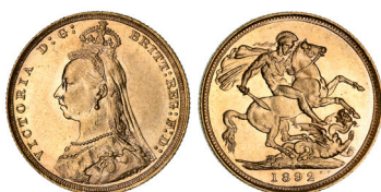
2226* Queen Victoria, 1892 Sydney. Nearly uncirculated. $700