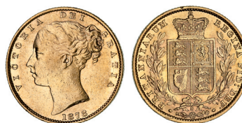
2156* Queen Victoria, 1878 Sydney. Extremely fine.