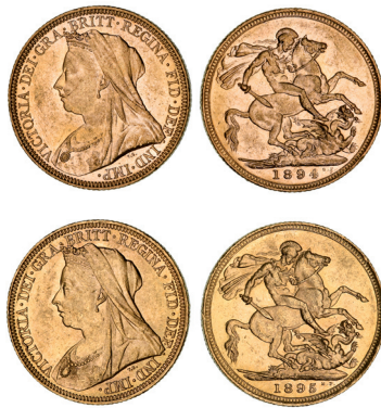
2234* Queen Victoria, 1894 Melbourne and 1895 Sydney. Very fine - extremely fine. (2)