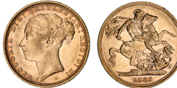
2197* Queen Victoria, young head, 1887 Sydney. Nearly extremely fine. $500