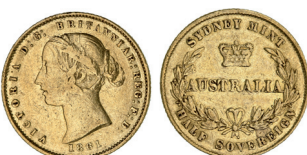
2141* Queen Victoria, second type, 1861. Fine.