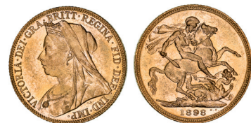
2242* Queen Victoria, 1898 Melbourne. Good extremely fine.