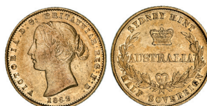
2143* Queen Victoria, second type, 1862. Good fine/nearly very fine and scarce thus.