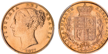
2155* Queen Victoria, 1877 Sydney. Good extremely fine.