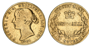
2142* Queen Victoria, second type, 1861. Very good.

Ex D.Featherstone/L.McNaught Collection.