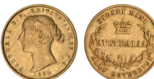
2144* Queen Victoria, second type, 1862. Good fine.