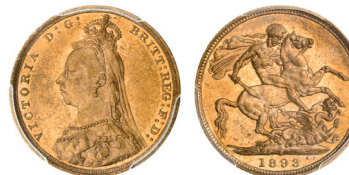
2230* Queen Victoria, Jubilee head 1893 Sydney. Nearly extremely fine/good extremely fine. $600