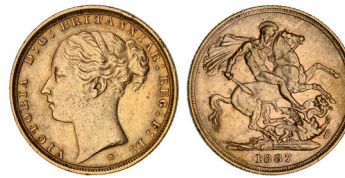
2196* Queen Victoria, young head, 1887 Sydney. Nearly extremely fine. $650

Ex David Ross Collection, from Spink Australia in November 1985.