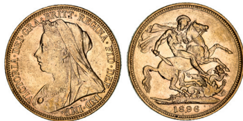
2236* Queen Victoria, 1896 Melbourne. Extremely fine.