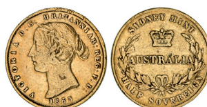
2147* Queen Victoria, second type, 1863. Dented, otherwise good fine.