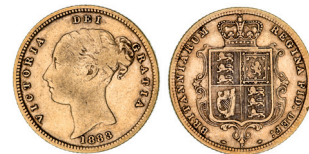
2300* Queen Victoria, 1883 Sydney (McD.25a). Nearly fine/fine. $350 Ex D.Featherstone/L.McNaught Collection.