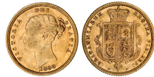
2298 Queen Victoria, 1883 Sydney (McD.25a). Very fine/good very fine. $450