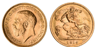
2377* George V, 1915 Sydney. Nearly uncirculated.