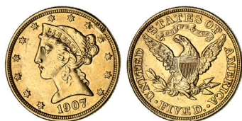
2457* USA, five dollars, or half eagle, 1907, Liberty head. Ex mount traces, cleaned, otherwise nearly extremely fine.