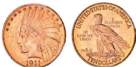
2458* USA, ten dollars or eagle, 1911, Indian head. Original frosted mint bloom, surface marks, otherwise uncirculated.