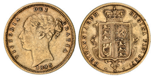
2306* Queen Victoria, 1885 Melbourne. Nearly very fine and rare. $1,000