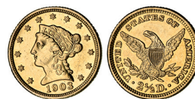
2453* USA, two and a half dollars or quarter eagle, 1903, Liberty head. Cleaned (ex jewellery), otherwise extremely fine.