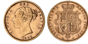
2295 Queen Victoria, 1882 Melbourne (McD.24). Very fine/good very fine. $450