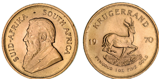
2436* South Africa, Republic, krugerrand, 1970 (KM.73). Uncirculated. $2,200