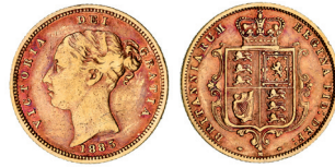
2308* Queen Victoria, 1885 Melbourne. Attractive tone, good fine and scarce. $750