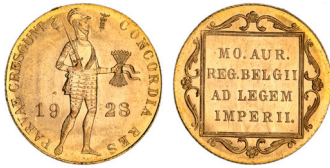
2428* Netherlands, trade ducat, 1928 (KM.83.1a). Uncirculated. $300