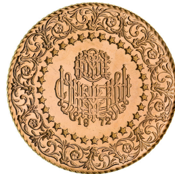
2451* Turkey, monnaie de Luxe, 500 kurush, 1972 (KM.874). Uncirculated.