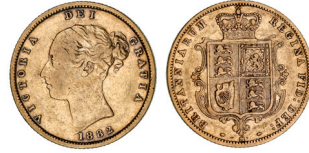
2296* Queen Victoria, 1882 Melbourne (McD.24). Good fine. $350 Ex D.Featherstone/L.McNaught Collection.