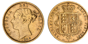
2312* Queen Victoria, 1886 Melbourne. Scatched and surface marked, otherwise very fine. $350