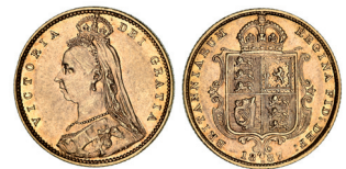
2320* Queen Victoria , Jubilee head, 1887 Melbourne (McD.33c). Extremely fine. $600

Ex D.Featherstone/L.McNaught Collection.