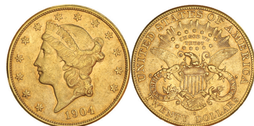
2462* USA, twenty dollars or double eagle, 1904S, Liberty head. Surface marks, otherwise nearly extremely fine.

Ex Noble Numismatics Sale 129 (lot 2038).