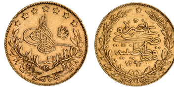
2450* Turkey, Abdul Hamid II (1876-1909), 100 kurush, AH1293/32 (1909) (KM.730). Very fine.