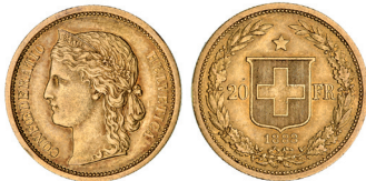
2446* Switzerland, twenty francs, 1883 (KM.31.1). Good very fine.