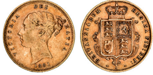
2289 Queen Victoria, 1881 Melbourne. Very fine/good very fine. $650