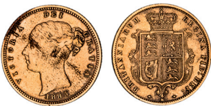
2307* Queen Victoria, 1885 Melbourne. Obverse surface adhesions, otherwise very fine and rare. $800

Ex D.Featherstone/L.McNaught Collection.