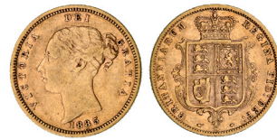
2310* Queen Victoria, 1886 Melbourne. Good very fine. $750