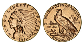
2455* USA, two and a half dollars or quarter eagle, 1912, Indian head. Very fine.