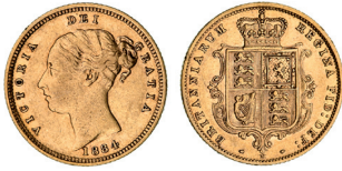
2302* Queen Victoria, 1884 Melbourne. Good very fine. $750