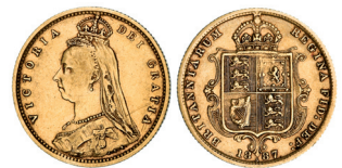
2323* Queen Victoria , Jubilee head, 1887 Sydney (McD.32b). Nearly very fine. $350