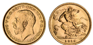
2376* George V, 1915 Sydney. Nearly uncirculated.