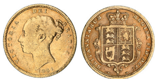
2294* part Queen Victoria, 1881 Sydney, also George V 1915 Sydney. Good/very good; traces of mounting, otherwise extremely fine. (2) $550