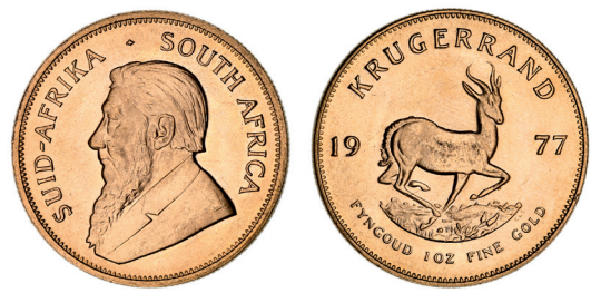
2437* South Africa, Republic, krugerrand, 1977 (KM.73). Uncirculated. (2) $4,400