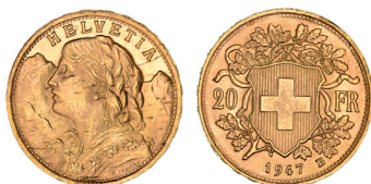
2448* Switzerland, twenty francs, 1947B (KM.35.2). Uncirculated.