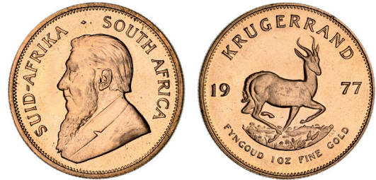
2438 South Africa, Republic, krugerrand, 1977 (M.73). Uncirculated. (2) $4,400