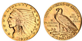
2454* USA, two and a half dollars or quarter eagle, 1910 Indian head. Good very fine.