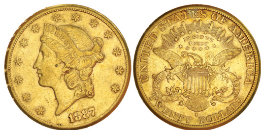
2459* USA, twenty dollars or double eagle, 1887S, Liberty head. Edge notches cut into obverse rim, otherwise very fine.