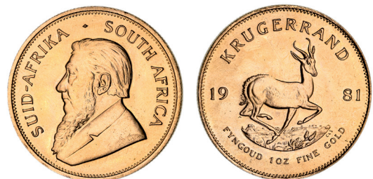
2441* South Africa, Republic, krugerrand, 1981 (KM.73). Uncirculated, some removeable glue on the reverse of the first. (2) $4,400