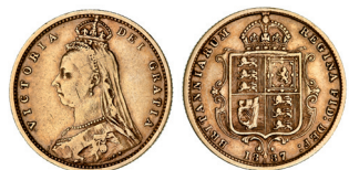
2322* Queen Victoria , Jubilee head, 1887 Sydney (McD.32). Light obverse scratches, otherwise nearly very fine. $300