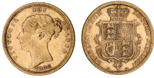
2288* Queen Victoria, 1880 Sydney (McD.20a). Good fine. $300