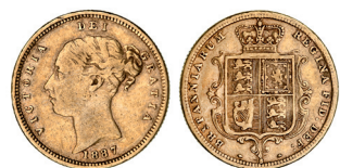
2318* Queen Victoria , young head, 1887 Sydney. Good fine. $350