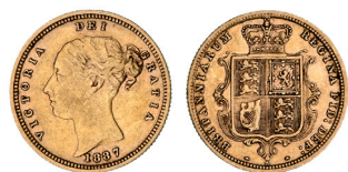
2317* Queen Victoria , young head, 1887 Sydney. Good very fine. $500