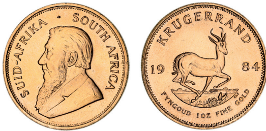
2443* South Africa, Republic, krugerrand, 1984 (KM.73). Uncirculated.