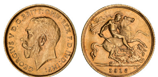
2379* George V, 1916 Sydney. Good extremely fine.

Ex D.Featherstone/L.McNaught Collection.