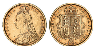
2325* Queen Victoria , 1891 Sydney no JEB (McD.38a). Nearly very fine/very fine. $400