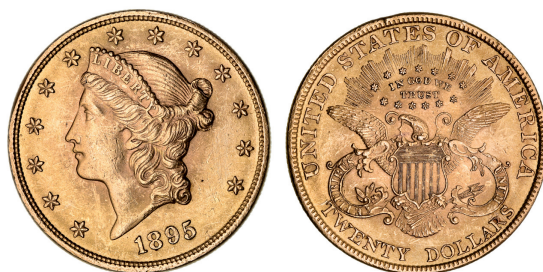
2460* USA, twenty dollars or double eagle, 1895, Liberty head. Good extremely fine.

Ex Noble Numismatics Sale 129 (lot 2036).