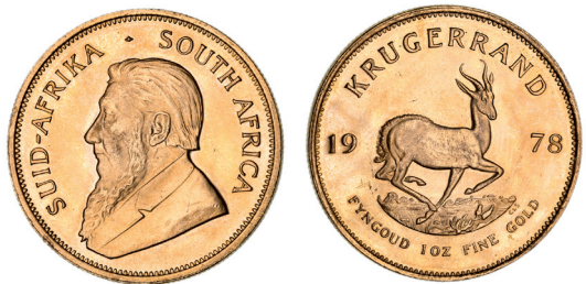
2439* South Africa, Republic, krugerrand, 1978 (KM.73). Uncirculated. $2,200