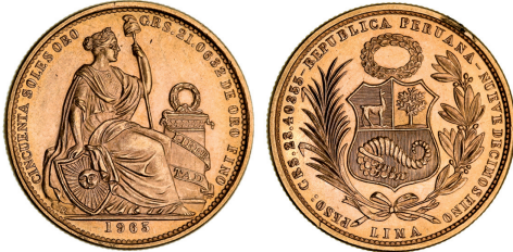
2429* Peru, fifty sols, 1965 (KM.230). Uncirculated. $1,200