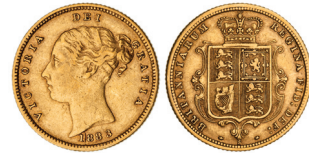
2299* Queen Victoria, 1883 Sydney (McD.25a). Some scratching on portrait, otherwise very fine. $520