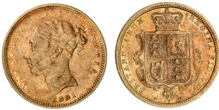
2291 Queen Victoria, 1881 Sydney (McD.21a). Good fine/very fine. $400