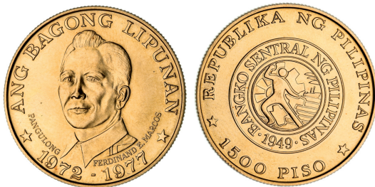
2430* Philippines, 1500 piso 1979 President Marcos (KM.219). Uncirculated. $1,200