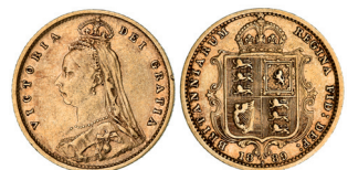
2324* Queen Victoria , 1889 Sydney. Good fine. $350

Ex D.Featherstone/L.McNaught Collection.