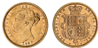
2316* Queen Victoria , young head, 1887 Sydney. Nearly extremely fine. $650