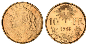
2447* Switzerland, ten francs, 1913B (KM.36). Nearly extremely fine.