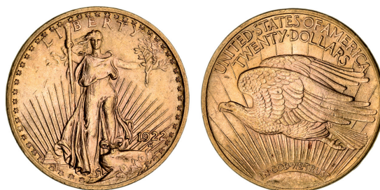
2463* USA, twenty dollars or double eagle, 1922, St.Gaudens. Good extremely fine.

Ex Noble Numismatics Sale 129 (lot 2039).