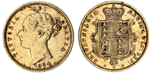
2303* Queen Victoria, 1884 Melbourne. Very fine/good very fine, light scratches. $400