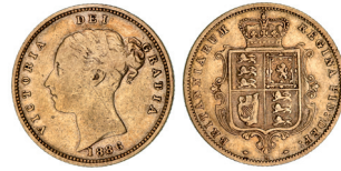
2313* Queen Victoria, 1886 Melbourne. Fine/good fine. $400

Ex D.Featherstone/L.McNaught Collection.