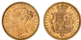
2314* Queen Victoria , 1886 Sydney. Nearly extremely fine. $750