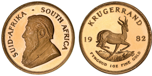
2442* South Africa, Republic, proof krugerrand, 1982 (KM.73). Nearly FDC.