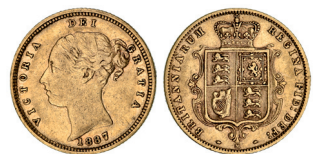
2315* Queen Victoria , young head, 1887 Melbourne. Very fine and scarce. $450 Ex D.Featherstone/L.McNaught Collection.