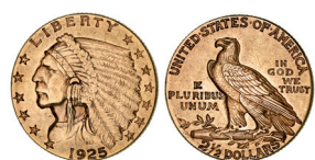
2456* USA, two and a half dollars or quarter eagle, 1925D, Indian head. Good very fine.