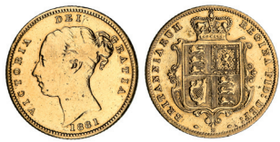
2290* Queen Victoria, 1881 Melbourne. Cleaned, polished, very good/nearly very fine. $350 Ex D.Featherstone/L.McNaught Collection.