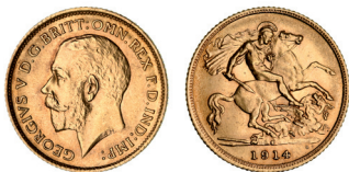
2374* George V, 1914 Sydney. Extremely fine.