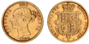
2304* Queen Victoria, 1884 Melbourne. Nearly very fine. $400

Ex D.Featherstone/L.McNaught Collection.