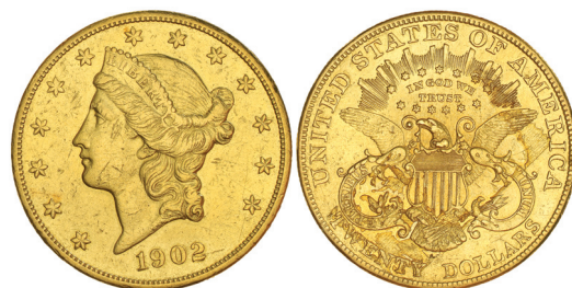
2461* USA, twenty dollars or double eagle, 1902, Liberty head. Surface marks, otherwise good very fine.