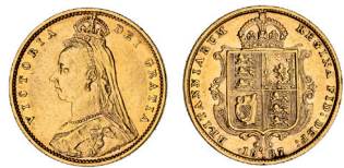
2321* Queen Victoria , Jubilee head, 1887 Melbourne (McD.33c). Good very fine/nearly extremely fine. $450

Ex D.Featherstone/L.McNaught Collection.