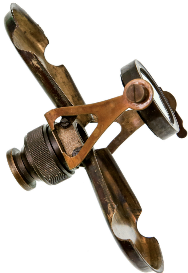
lot 3202 part