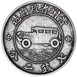
3493* China, Kweichow Province, automobile dollar yr 17 (1928) (26.95g), probable old copy. Nearly very fine.