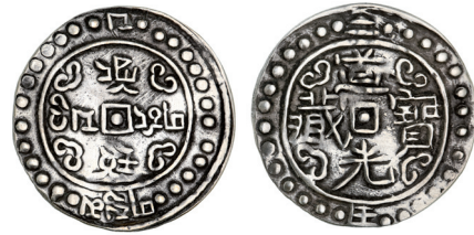
3531* Tibet, Sino Tibetan coinage, Tao Kuang (1820-1851) silver sho, yr 16 (KM.93). Very fine.