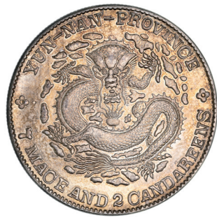
3492* China, Empire, Yunnan Province, silver dollar (1908) (KM.Y254). Light golden toned mint bloom, nearly uncirculated.