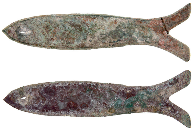
lot 3444 part

Coole in "Coins in China's History", discusses these pieces under "Odd Shaped Mediums of Exchange", and that these pieces were initially used in that transitional period between the bartering age and the coin age. They were made in many shapes and resembled various valuable utensils and objects used at that time including fish, bells, lotus roots, shields etc. Thus these objects in copper described above look like the early jade musical instruments called ch'in and they were used in orchestras like the modern metallic triangles. Dragon head "ch'in" are rarely seen and seem to have some monetary exchange value.