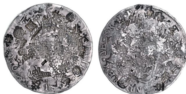
3506* China, Mexico, Philip V, eight reales or pillar dollar, 1735 MF (KM.103), with numerous chop marks; Peru, Charles III (1788-1808), eight reales, Lima Mint, 1808JP (KM.97), with extensive chop marks. Very fine and rare . (2)