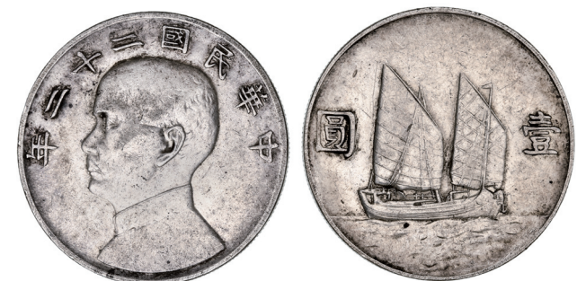
3502* China, Republic, Sun Yat Sen, 'Junk' silver dollar, yr 22 (1933) (KM.Y.345). Good very fine .