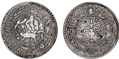
3529* Tibet, Sro-Srang coinage, silver three (3) srang, BE 16-11 (1937), Tapchi mint, (KM.Y.26). Toned, very fine, scarce.