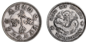
3487* China, Empire, Kiang nan, ten cents, cd 1899, (KM.142a.2). Good very fine, scarce.