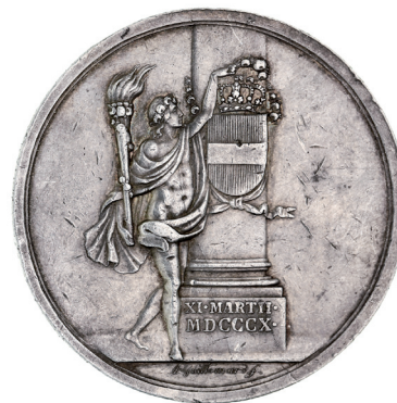
3553* France, Napoleon and M.Louisa of Austria marriage 11 March 1810 in silver (48mm) by A.Guillemand. Edge bump, otherwise very fine.