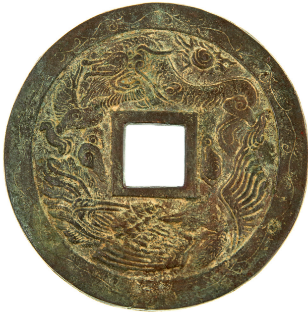
3476* China , large bronze charm (cf Sch 259). Very fine. $500