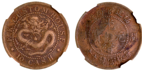
3484* China, Empire, Fukien Province, ten cash (1901-5) large character (KM.Y#100). Nearly very fine.