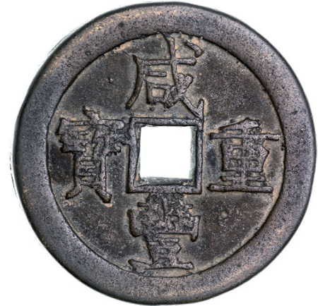
3470* China , Qing (Ch'ing) Dynasty (1644-1911), Emperor Wen Zong (1851-1861), 56mm, fifty cash coin, Hunan mint, "Boo nan" (cf. Harwill 22.899, Sch. -, cf. TFP 2530). Very fine and very rare.