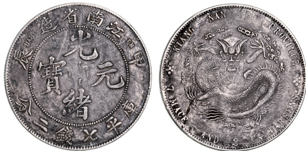
3489* China, Empire, Kiang nan Province, silver dollar (1905) (KM.Y145a.17). Dark toning, nearly very fine.