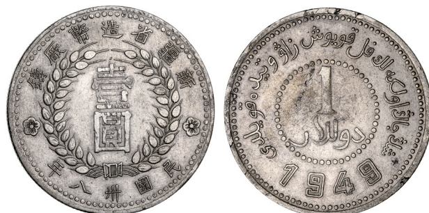
3504* China, Sinkiang Republic, silver dollar, 1949 (KM.46.2). Very fine .