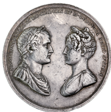
lot 3553 part