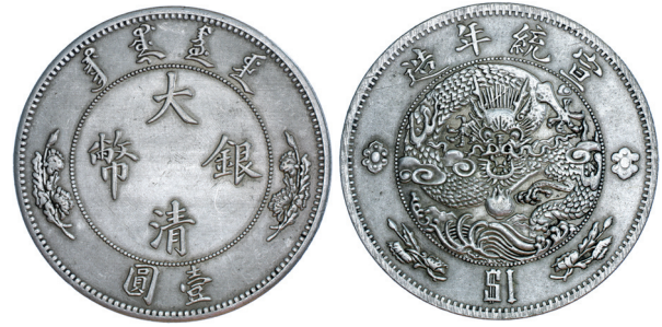
3480* China , Empire, Central Mint of Tientsin, silver dollar, undated (1910) (KM.219). Good very fine and very scarce thus. $1,000

Ex Noble Numismatics Sale 94 (lot 3615).