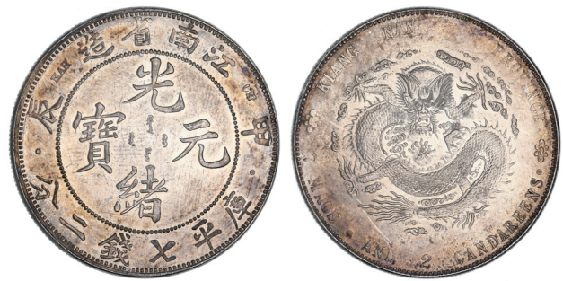
3488* China, Empire, Kiang nan Province, silver dragon dollar (1905) (KM.Y145a.17). Some red gold toning over mint bloom, nearly uncirculated.