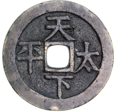
3468* China , Qing Dynasty, Gao Zong (1736-1795), large medallion coin (45mm), Tianxia Taiping type, (cf H.26.3), (Zhong guo hua qian 1324). Very fine.