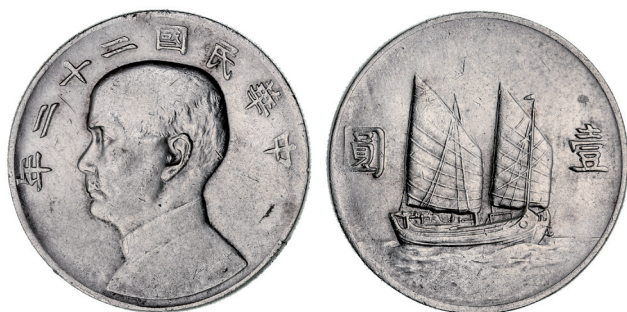
3501* China, Republic, Sun Yat Sen, silver 'Junk' dollar, Yr 22 (1933) (KM.Y.345). Cleaned very fine .

Ex Noble Numismatics Sale 94 (lot 3619).