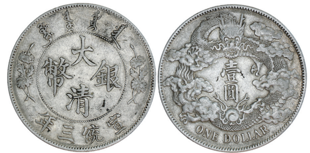
3481* China , Empire, Chingkiang, central mint Tientsin, under Hsuen Tung (1908-1911), issued in the third year (1911), silver dollar (KM.Y.31). Nearly very fine. $700