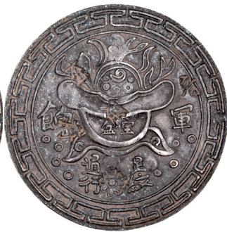
3494* China, Taiwan, Rebel coinage, Ting-dih silver dollar (1862), obv. floral vase, rev. crossed brushes (KM.cfC.25-5; Kann 4), with Spanish American silver dollar edge devices, probable trial (26.85g). Deep brown patina, chop mark, including flower lower obverse, good very fine and rare.