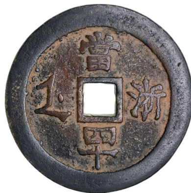
3469* China , Qing (Ch'ing) Dynasty (1644-1911), Emperor Wen Zong (1851-1861), 51mm, forty cash coin, Hangzhou, Zhejiang mint, "dang sishi" (Hartill 22.1042 [2], Sch. -, TFP 2484). Very fine and very rare.