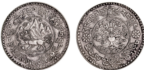
3530* Tibet, Sro-Srang coinage, silver three (3) srang, BE 16-10 (1936) (3, one illustrated), Tapchi mint, (KM.Y.26); together with a counterfeit cast example in copper. Lightly toned, good very fine or better, scarce. (4)