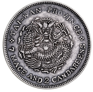
3495* China, Empire, Taiwan Province, fantasy silver dollar (Kann p64 called a bogus coin) (26.85g). Toned good very fine.