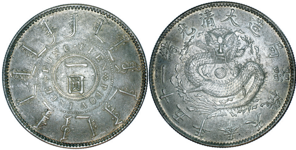
3485* China, Empire, Feng Tien Province, silver dollar, yr 25 (1899) (KM.Y.87.1). Shallow strike, copy dies, frosty mint bloom, nearly uncirculated.