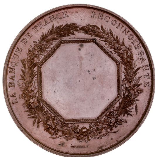
3554 France, Exposition Universelle Internationale de 1878, in bronze (68mm), awarded to 'De Paniaqua'. In case of issue, uncirculated.