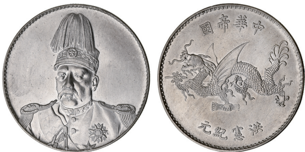
3499* China, Republic, Hung-hsien, bust in military uniform with plumed hat, rev. winged dragon (1916) (KM.Y332) (26.89g), probable modern copy. Uncirculated .