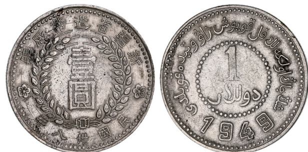
3505* China, Sinkiang Republic, silver dollar, 1949 (KM.46.2). Very fine .