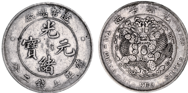
3479* China , Empire, silver dollar, Tientsin (1908) (KM.Y.14). Nearly very fine. $450

Ex Baldwin -Ma Tuk Wu Sale 49 Hong Kong (lot 516).