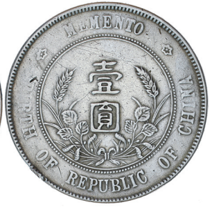
3498* China, Republic, Sun Yat Sen, memento silver dollar (1927) (KM.Y.318a.1). Obverse scratch, cleaned, striking weakness, otherwise fine.