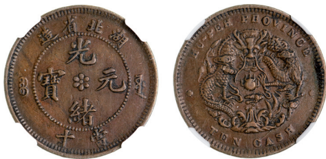
3486* China, Empire, Hu Peh Province, ten cash (1902-5) (KM.Y#120a.2). Good very fine.