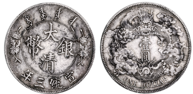
3482* China , Empire, Chingkiang central Mint of Tientsin, under Hsuen Tung (1908-1911), silver dollar, yr 3 (1911) (KM. Y.31). Blackened areas, otherwise very fine. $400