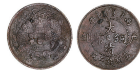
3483* China , Empire, Fukien Province copper two cash (1901-3) (KM.Y81 for type, unlisted in copper). Porous, otherwise very fine. $100