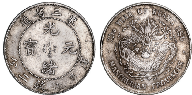
3491* China, Empire, Manchurian Province, silver dollar, yr 33 (1907) (KM.Y212) (26.90g). Golden tone, very fine and scarce.

A similar example at Stacks 3 May 2022 (lot 59430) realised $750 US.