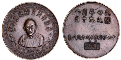
3508* China, Republic, Ma Jun Wu, Yr 29 (1940) commemorative medal in bronze (26mm). Good very fine. $100 Sold with biographical research.