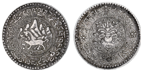
3528* Tibet, Sro-Srang coinage, silver three srang, BE 16-10 (1936), Tapchi mint, (KM.Y.26). Toned, very fine.