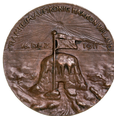
3555* Germany, Roald Amundsen, in bronze (50mm) commemorating his South Pole Expedition in 1911, by Lauer, Nurnberg, obverse, bust right, wearing thick fur, inscription around, reverse, flagpole in front of igloo, divided by date 16 Dez 1911, radiant sun above surrounded by inscription. Small edge knock at 2 o'clock on reverse, otherwise extremely fine.