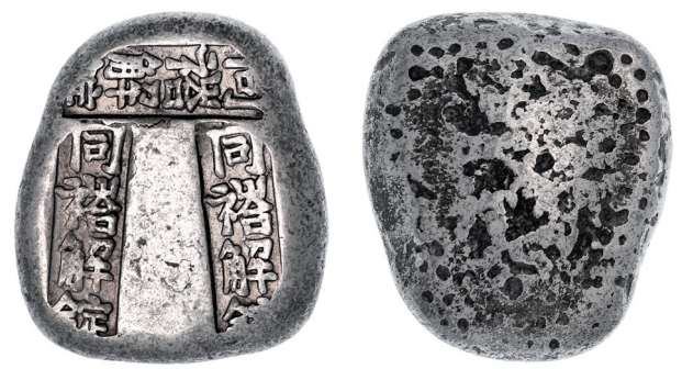
3510* China, silver sycee, (83.36g), same punch applied three times similar in style to Cribb A710, could have been filed down from original size. Fine. $100