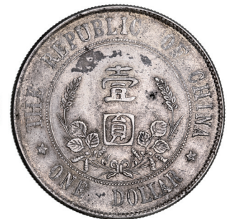
3497* China, Republic Sun Yat Sen, silver dollar, undated (1912) (KM.Y.319). Underlying mint bloom, light golden toning, lettering weakness in part of reverse, otherwise nearly extremely fine.