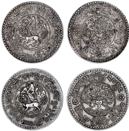
3527* Tibet, Sro-Srang coinage, silver three srang, BE 16-9 (1935), Tapchi mint, (KM.Y.26). Toned, very fine. (2)