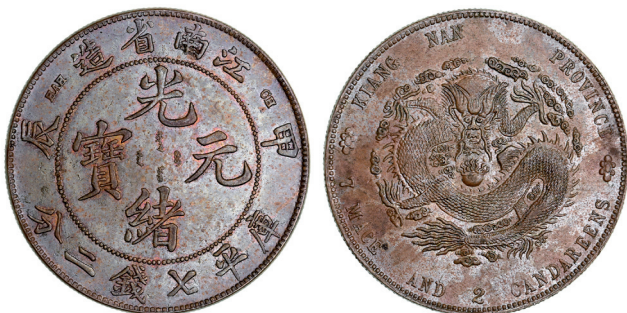
3490* China, Empire, Kiang nan, dragon dollar struck in copper (L & M 257). Slight stain, underlying bloom, nearly uncirculated and rare.