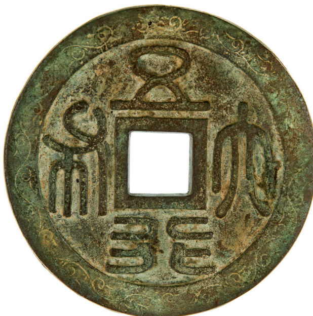
lot 3476 part