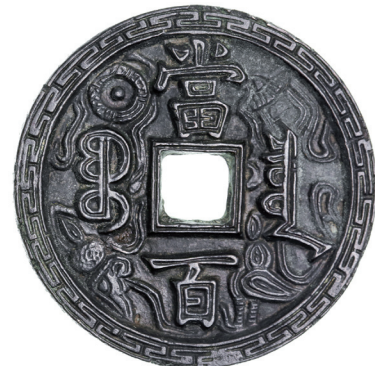
3471* China , Qing (Ch'ing) Dynasty (1644-1911), Emperor Wen Zong (1851-1861), 47mm, ornate and engraved fields one hundred cash coin, The Prince Qing Hui mint, (reading as the Board of Revenue mint), issued May - August 1854, two dots on reverse at top left and right, (cf. Hartill 22.717, Sch. -, cf. TFP 2431). Very fine and very rare.