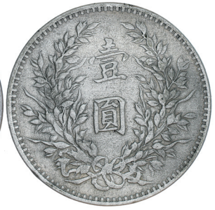
3496* China, Republic, Yuan Shi Kai, silver dollar, year 3 (1914) (KM.Y329). Lightly toned, has been brushed, otherwise very fine or better.