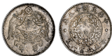
3500* China, Republic, unadopted design of the National emblem, silver twenty cents, year 15, 1926, (KM.Y.335). Very fine, scarce .

Ex Noble Numismatics Sale 94 (lot 3618).