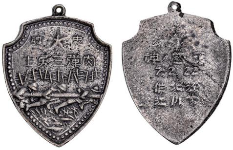
3507* China, C.E.R.A., Nationalist bronze medal by Whitehead Hoag Co. Newark N.J., fob medals in white metal dated 7.2.22 (2), sports fob medal in hard white metal. Very fine - extremely fine. (4) $50