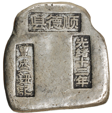
3509* China, Qing Dynasty, (late 19th century), silver ingot, (197.3g). Very fine. $50