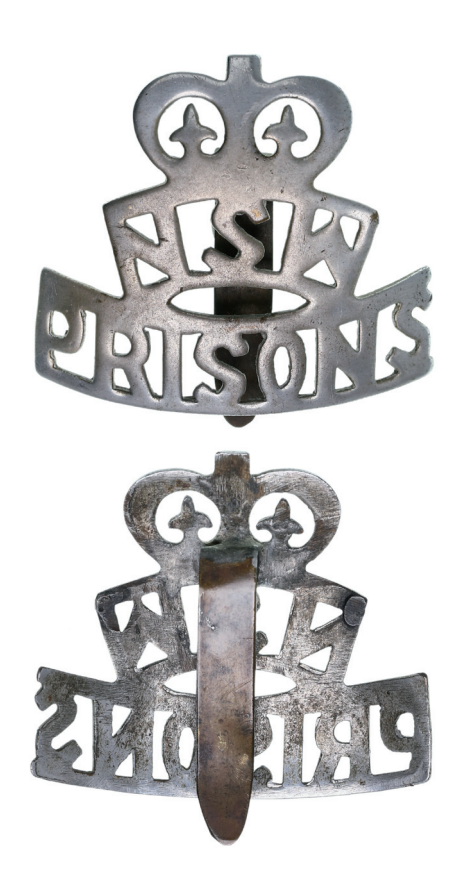
1323* NSW Prisons, cap badge, an unofficial issue made by prisoners for prison guards, slide-back fitting. Fine . $100