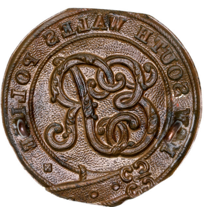
1322* New South Wales Police, helmet plate (E [VII]R), appears to be a specimen strike in bronze (53.5x52mm), two lugs on reverse, crown at top and decorative piece at base both not struck. Small dent near one lug, otherwise extremely fine and unused.