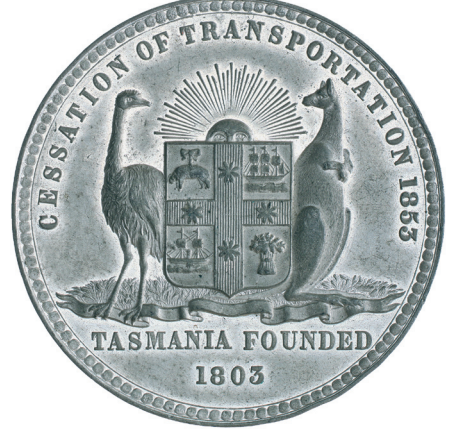
1289* Cessation of Transportation, 1853, in white metal (58mm) (C.1853/2). Much mint bloom, good extremely fine and rare in this condition.

Ex Noble Numismatics Sale 124 (lot 327).