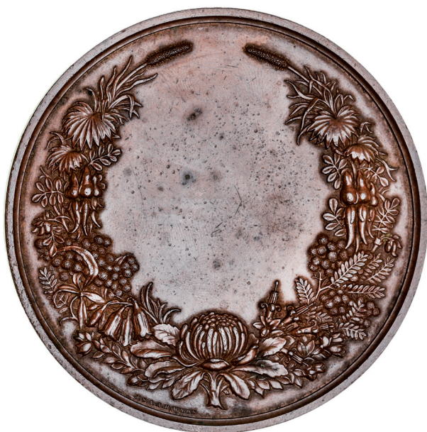
1303* Sydney International Exhibition, M.D.CCC LXXIX (1879), in bronze (76mm), by J.S. & A.B.Wyon, no stop after CCC in date, uninscribed. A few tone spots otherwise, very fine.