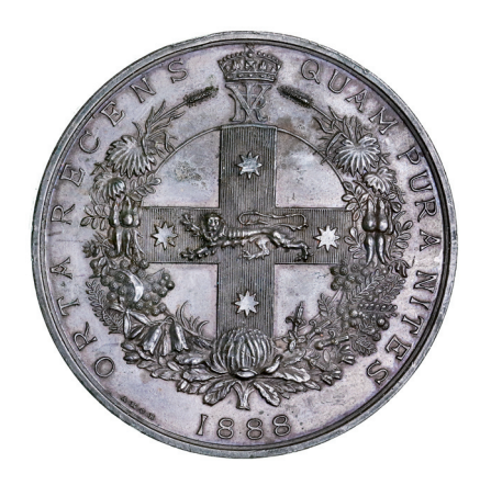
1315* Australia, January 26 1788, Centennial 1888 in bronze (51mm) by Amor (C.1888/1). Extremely fine.