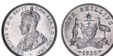
1460* George V, 1935. Minor obverse surface marks, otherwise brilliant uncirculated/choice uncirculated.