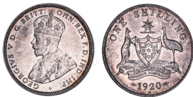
1453* George V, 1920M. Underlying mint bloom, some peripheral toning, nearly uncirculated and rare thus.