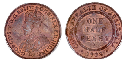
1505* George V, 1933. Glossy brown and red, uncirculated.