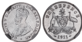
1473* George V, 1911. Extremely fine/nearly uncirculated.