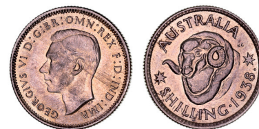
1461* George VI, 1938. Uncirculated.