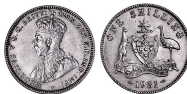
1458* George V, 1931. Light grey frosty tone, good extremely fine.