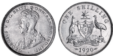
1454* George V, 1920M. Subdued mint bloom, slight spotting, nearly uncirculated and rare in this condition.