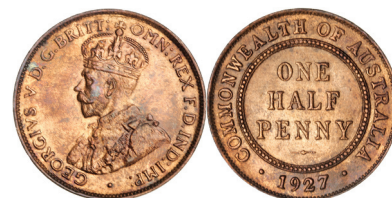
1503* George V, 1927. Brown and red, probably cleaned, nearly uncirculated.

Ex Downies Sale (lot 1475) with their catalogue cut-out.