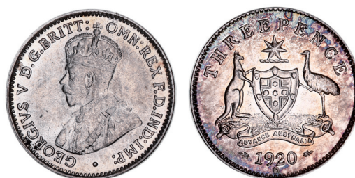
1476* George V, 1920M. Attractive toning over full original mint bloom, uncirculated/choice uncirculated and rare thus.