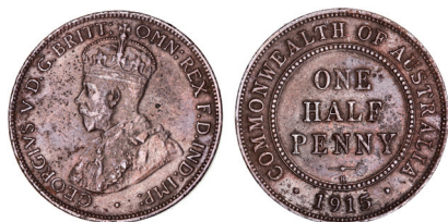
1496* George V, 1915H. Some surface pitting, good very fine and scarce in this condition.