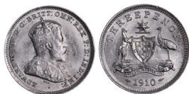
1472* Edward VII, 1910. Uncirculated.