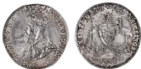
1435* George V, 1913. Gold and brown grey toning, underlying mint bloom, nearly uncirculated and rare in this condition.

Ex Purchased from Spink Australia in 1977, Ex Noble Numismatics Sale 83 (lot 1483).