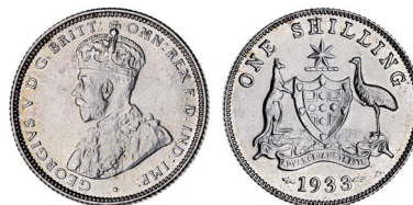
1459* George V, 1933. Cleaned, otherwise extremely fine or better and rare in this condition.