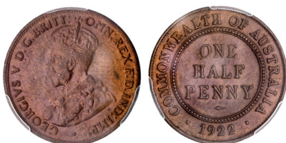
1498* George V, 1922, die chip on left of base of ONE. Red uncirculated.