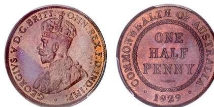
1504* George V, 1929. Attractive nearly full mint red bloom, choice uncirculated and one of the finest if not the finest known.