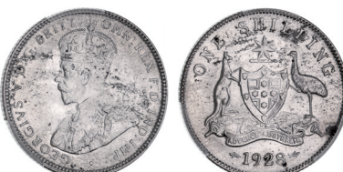
1457* George V, 1928. Full original frosty mint bloom, uncirculated and rare, one of the finest known.