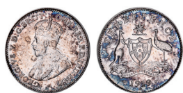
1475* George V, 1919M. Deep blue grey toning over full original mint bloom, choice uncirculated.