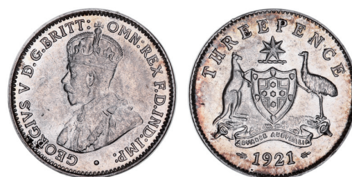
1477* George V, 1921. Peripheral gold toning on the reverse, uncirculated/choice uncirculated and rare in this condition, one of the finest known.