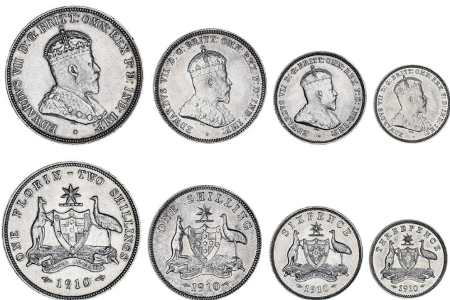
1428* Edward VII, year set 1910, florin, shilling, sixpence and threepence. Extremely fine - uncirculated. (4) $1,200