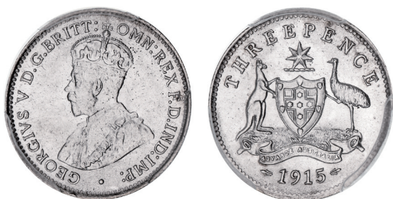
1474* George V, 1915. Full original frosty mint bloom, choice uncirculated and very rare in this condition, one of the finest known.