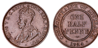
1502* George V, 1924. Glossy brown, good extremely fine.