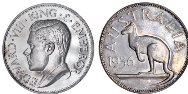
1431* Edward VIII, 1936 retrospective issue in silver by Pinches for G.E. Hearn. In case of issue, FDC. $70