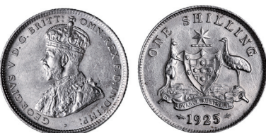
1456* George V, 1925. Nearly uncirculated.