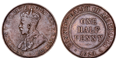
1500* George V, 1923. Good fine/nearly very fine.