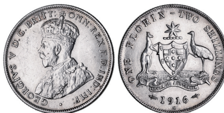
1437* George V, 1916M. Slightly rubbed, otherwise nearly uncirculated.

Ex Jon Saxton Collection & Noble Numismatics Sale 108 (lot 1460) and Sale 131 (lot 497).