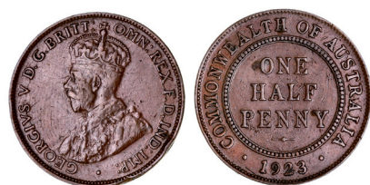
1499* George V, 1923. Peripheral die breaks either side, obverse rim nick at 4 o'clock, otherwise nearly very fine.