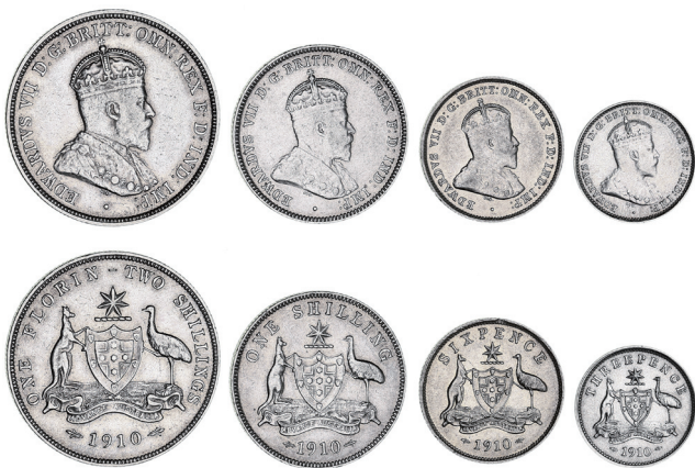
1429* Edward VII, year set 1910, florin, shilling, sixpence and threepence. Very fine - extremely fine. (4) $400