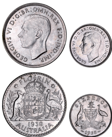
part 1430* George VI, year set, 1938, florin to halfpenny. Nearly uncirculated - uncirculated. (6) $150