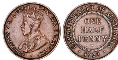
1501* George V, 1923. Diagnostic peripheral die breaks either side, even brown patina, good fine.