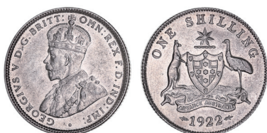
1455* George V, 1922. Nearly uncirculated.