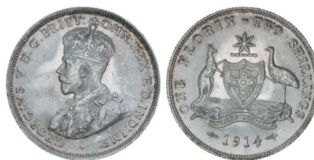
1436* George V, 1914. Full original satin-like mint bloom with peripheral golden highlights, choice uncirculated and rare in this condition, one of the finest known.