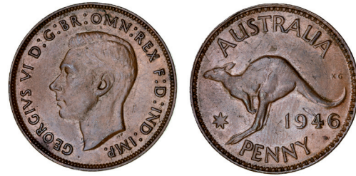
1493* George VI, 1946. Metal flaw above 4, minor contact marks, otherwise glossy extremely fine, scarce thus.