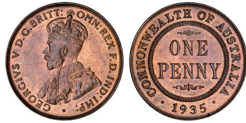
1492* George V, 1935 London die. Nearly full mint red, uncirculated.