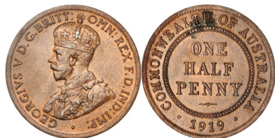
1497* George V, 1919. Two carbon spots on reverse, otherwise red and brown, nearly uncirculated.