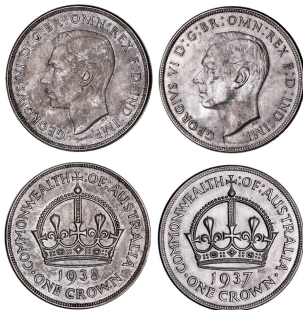
part 1433* George VI, 1937 (2) and 1938. Extremely fine and nearly uncirculated. (3) $200