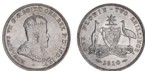
1434* Edward VII, 1910. Full original mint bloom, well struck uncirculated.