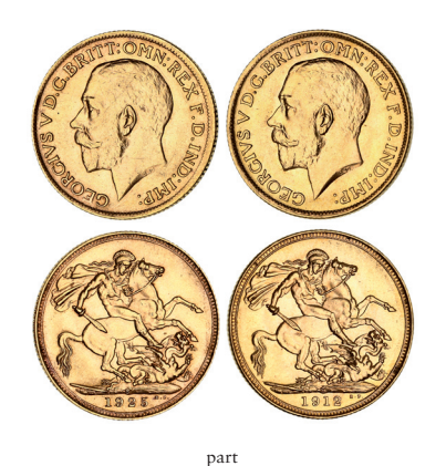
2043* George V, 1912 Melbourne, 1912 and 1925 Sydney. Nearly uncirculated . (3)