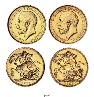
George V, 1912, 1913, 1914, 1917, 1918 and 1925 Melbourne. Nearly extremely fine - uncirculated. (6) $3,750