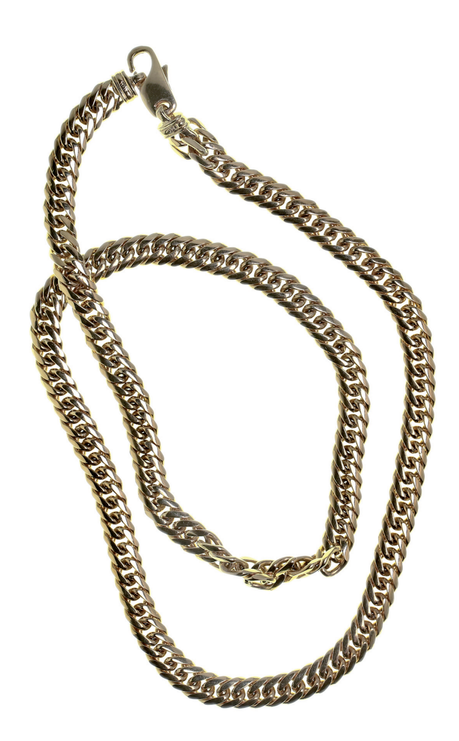
2140^{\ast} Gold chain or necklace, 18 carat, Italy (97.03g). Extremely fine.