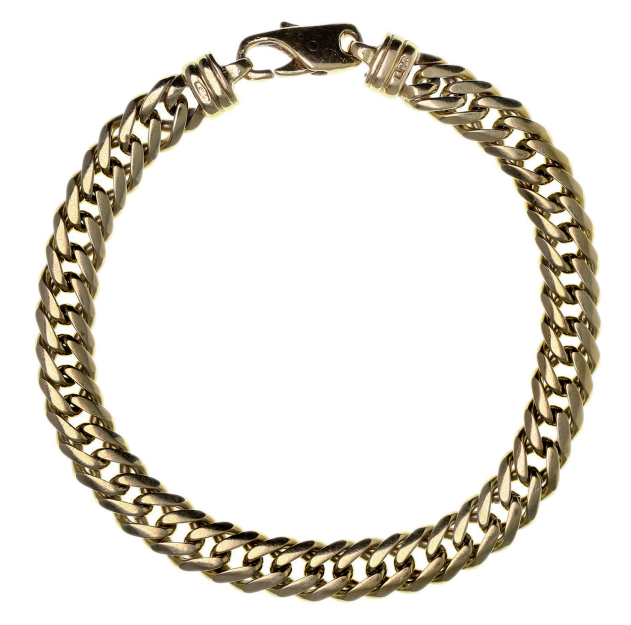
2142* Gold chain bracelet, 18 carat (39.09g). Very fine.