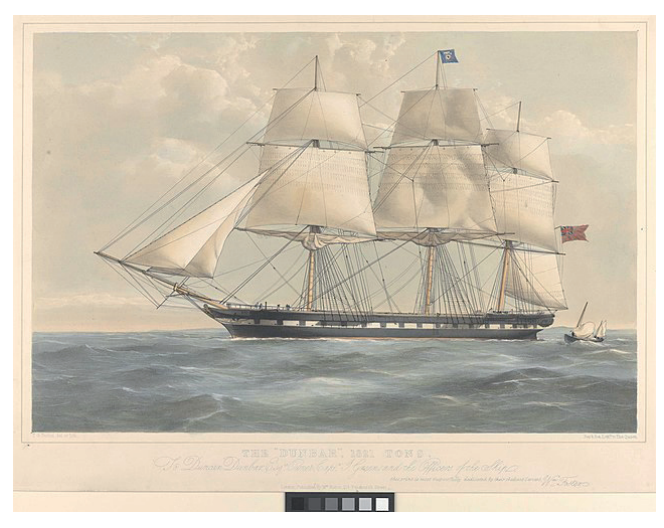
Dunbar iImage source: Wikimedia Commons