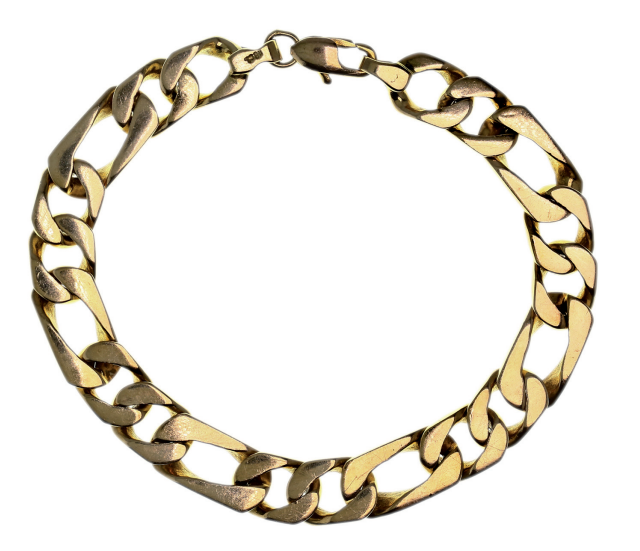
2141* Gold chain bracelet, 18 carat (39.69g). Extremely fine. $2,200