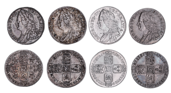
2424* George II, old head, silver sixpences, 1743 roses (S.3709), 1745 Lima (S.3710), 1746 Lima (S.3710A) and 1758 (S.3711). Toned nearly extremely fine - extremely fine. (4) $400