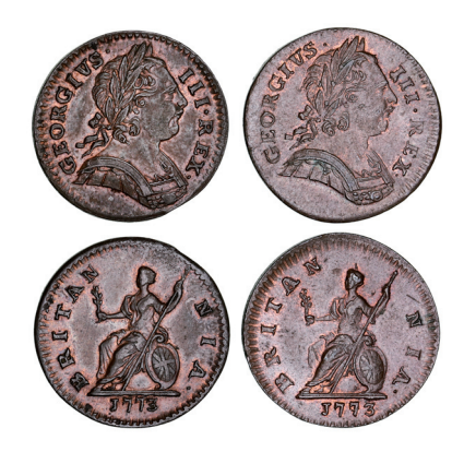
2439* George III, first copper issue, farthings, 1773 (S.3775; Peck 911) leaf to N, another leaf to A. Good extremely fine with some mint red . (2)