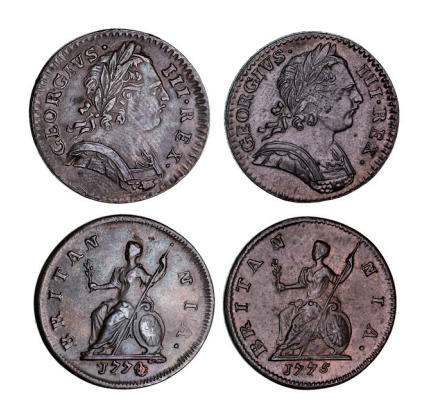
2440* George III, first copper issue, farthings, 1774 (S.3775; Peck 915), 1775 (S.3775; Peck 917). Extremely fine . (2) $300