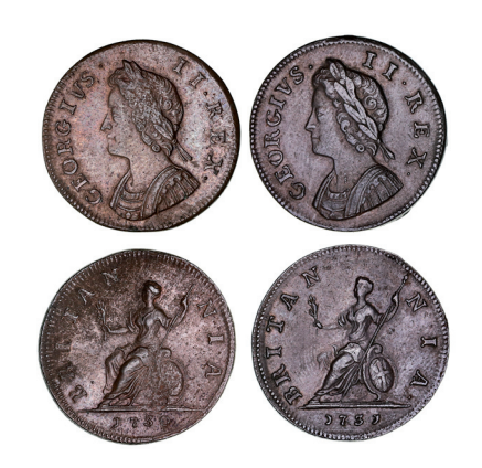
2425* George II, young head, copper farthings, 1730 (Peck 854) and 1731 (Peck 858)(S.3720). Attractive light to medium brown patinas, virtually extremely fine. (2) $350