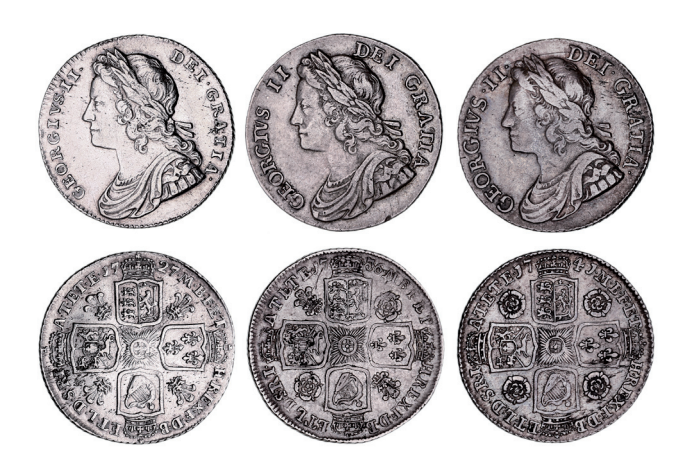
2422* George II, young head, shillings, 1727 plumes (S.3697); 1736 roses and plumes (S.3699) and 1741 roses (S.3701). Cleaned extremely fine; toned very fine; toned good very fine, the first scarce. (3)