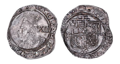
Ex S.J. Green Collection. Previously Noble Numismatics Sale 121, lot 1896 (part). Previously Spink Auction 15007, lot 1005 (part). With ticket.