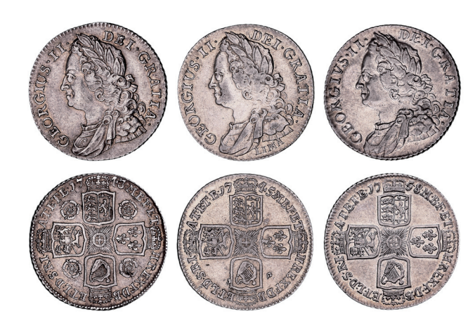
2423* George II, old head, shillings, 1743 roses (S.3702), 1745 Lima (S.3703) and 1758 (S.3704). Toned extremely fine; good very fine; good very fine. (3)