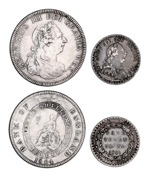
2434* George III, Bank of England, silver dollar or five shillings,

1804, leaf to left upright of E (S.3768); Bank token, eighteen pence, 1811 (S.3771). Toned, good fine. (2)