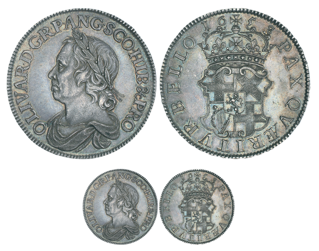
2396* Oliver Cromwell, silver crown, 1658 (S.3226). Die break clear, beautiful irridescent blue grey tone, good extremely fine. $15,000

Ex Brian Maloney Collection, Robert Tonner Collection, from Spink Australia, Sale 21, lot 1231 and then Sale 124, lot 2602.