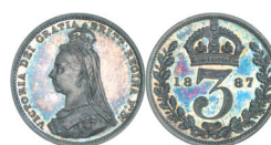
2506* Queen Victoria , Jubilee coinage, proof threepence 1887, (S.3931, ESC.3437, Davies 1330?) (S) (1.42g). Slightly concave, dark brilliant blue toning, brilliant FDC and scarce. $280

The above set and case from Noble Numismatics Sale 95 (lot 4898).