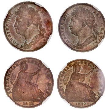
2470* George IV, first issue copper farthings, legends poorly struck from die filling on both, 1822 (S.3822; Peck 1411). Underlying mint bloom, nearly uncirculated. (2)