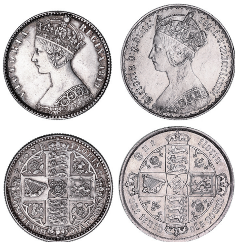
2491* Queen Victoria , Godless silver florin, 1849 (S.3890); Gothic florin, 1886 (S.3900). Good extremely fine. (2)