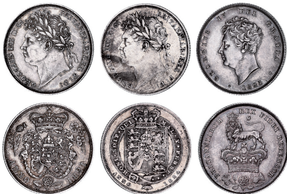
2468* George IV, silver shillings, 1821 (S.3810), 1824 (S.3811) and 1825 (S.3812). Scratches on neck, toned and extremely fine; reverse toned very fine; attractively toned extremely fine. (3)