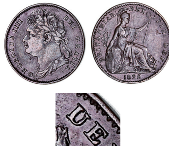
2472* George IV, first copper issue, farthing 1825, D over U in DEI (S.3882; Peck 1414 variety not listed in Peck). Very fine and rare.