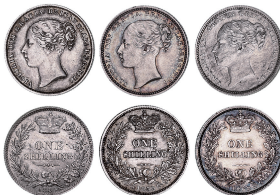
2494* Queen Victoria , young head, shillings, 1859 (S.3904), 1868, die no.30 (S.3906A) and 1884 (S.3907). Good very fine; extremely fine; good extremely fine. (3)