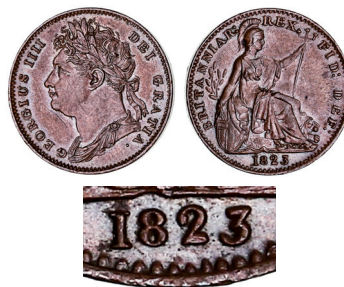
2471* George IV, first copper issue, farthing, 1823, I for 1 in date (S.3822; Peck 1413). Extremely fine and rare.