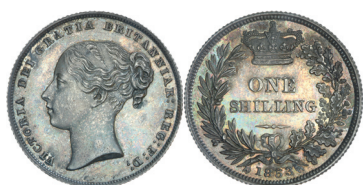
2493* Queen Victoria , young head, proof shilling 1853, (S-3904, ESC-3003, Davies-867) (R2) (5.65g), straight-grained edge. Medium grey semi brilliant proof, FDC and rare thus.