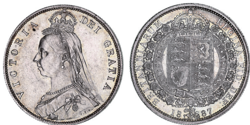
2501* Queen Victoria , Jubilee coinage, silver halfcrown 1887 (S.3924). Attractive tone, uncirculated. $100