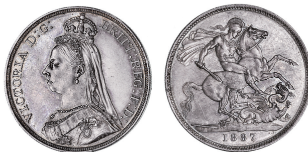
2496* Queen Victoria , Jubilee coinage, silver crown, 1887, JEB close (S.3921). Attractive blue grey iridescent tone, proof-like, nearly uncirculated.