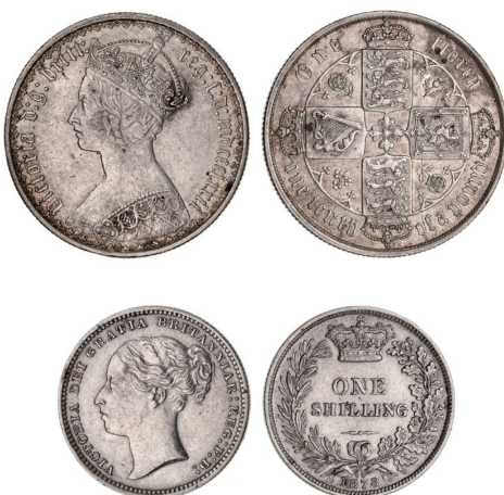
2492* Queen Victoria , Gothic florin, 1872, die no 32 (S.3892); young head shilling, 1878, die no 69 (S.3906A). Good very fine, the second scarce. (2)