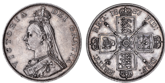
2498* Queen Victoria , Jubilee coinage, double florin, 1887 (S.3922). Toned extremely fine/good extremely fine. $150