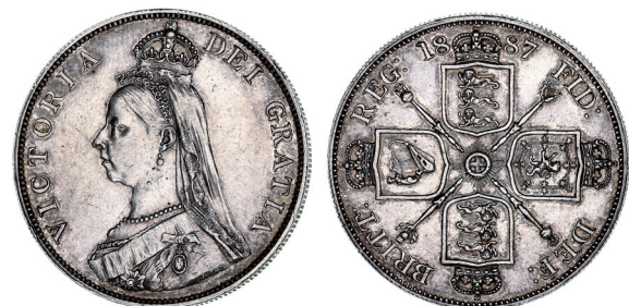
2500* Queen Victoria , Jubilee coinage, double florin, 1887, Arabic I (S.3923). Mirrored fields, minor scuff marks, extremely fine. $100