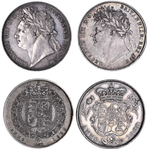
2467* George IV, silver halfcrown, 1820 (S.3807) and 1823 (S.3808). Nearly extremely fine; toned good very fine. (2) $450