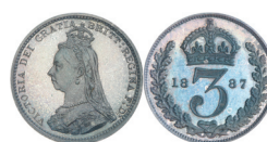
2505* Queen Victoria , Jubilee coinage, proof threepence 1887, (S.3931, ESC.3437, Davies 1330 (Dies 1 A)) (S) (1.44g). Dark blue grey toned, brilliant FDC and scarce. $300

The above set and case from Noble Numismatics Sale 95 (lot 4898).