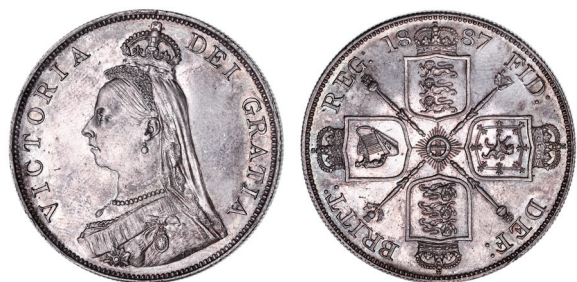
2499* Queen Victoria , Jubilee coinage, double florins, 1887 (S.3922,3). Cleaned extremely fine/good extremely fine; proof-like uncirculated. (2) $250