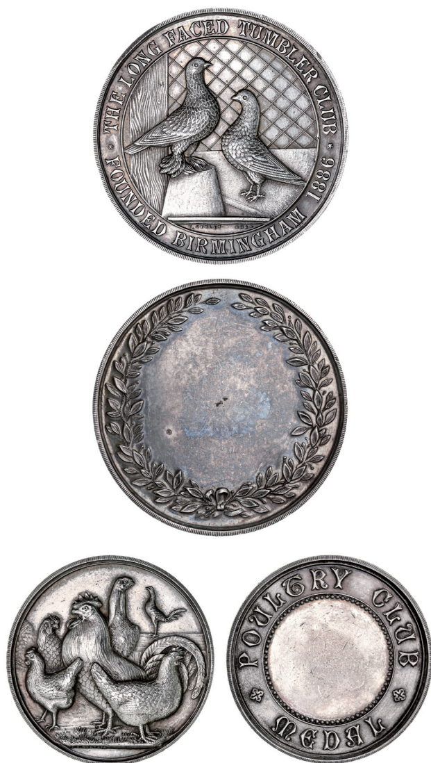
lot 2629 part