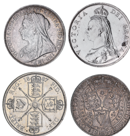
2503* Queen Victoria , Jubilee coinage, florin 1887 (S.3925), threepence 1891 (S.3931); old head, florin, 1899 (S.3939). Good extremely fine; very good; toned nearly extremely fine/extremely fine. (3) $200