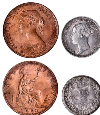
2495* Queen Victoria , young head, sixpence, 1887 (S.3912); bun head bronze halfpenny, 1860 beaded border (S.3956). Toned good extremely fine; red uncirculated. (2)