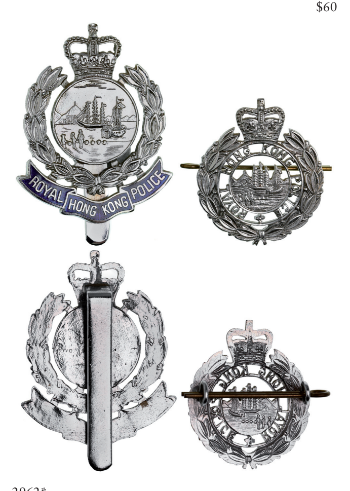
2962* Hong Kong, Royal Hong Kong Police, cap and collar badge. Very fine . (2)

Germany, D.R.L. Sports Badge 1937, third design type, 2nd Class in silver, reverse marked in relief, 'D.R.G.M.35269/ Wenstein Jena', pin-back. Toned good very fine .