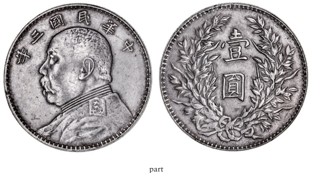
World coins, China, Yuan Shih Kai dollar, Yr 3 (1914); Germany, Bavaria, two mark 1876-D; Great Britain, sixpences 1757, 1887, threepence 1887; South Africa, five shillings 1948; Straits Settlements, dollar 1907 and USA dollar 1883. Fine - extremely fine. (8)

World coins, one ounce 999 fine silver coins; China, ten Yuan 2015; Rwanda, 50 unit, 2016; USA silver Liberty one dollar 2015 (2), the silver bug community with Chinese writing, 2015. In packs of issue, uncirculated. (5)