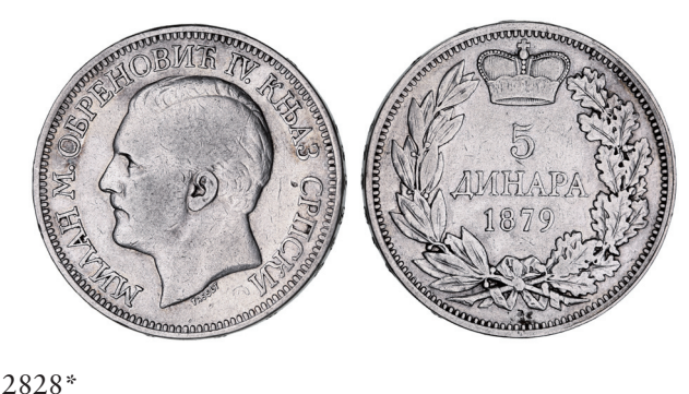
Serbia, five dinara, 1879 (KM.12). Good fine .

Ex D. Featherstone/L. McNaught Collection.