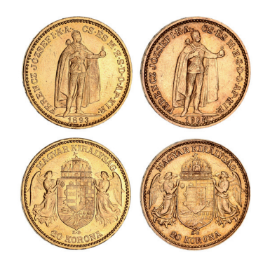
3057* Hungary, Franz Joseph, twenty korona, 1893 and 1904 (KM.486). Extremely fine - uncirculated . (2)