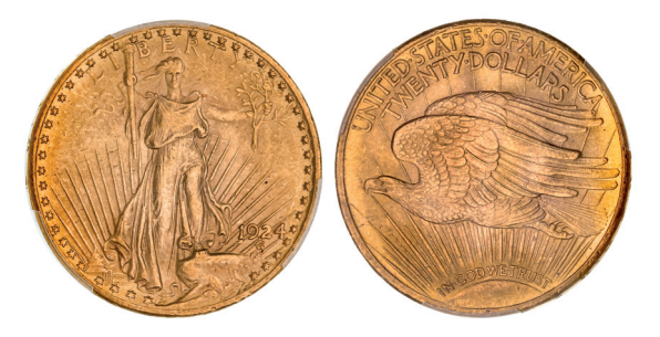
3193* USA, twenty dollars or double eagle, 1924, St. Gaudens. Uncirculated .