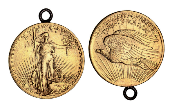
3190* USA, twenty dollars or double eagle, 1908, no motto, St. Gaudens. Loop mount at top, otherwise very fine.