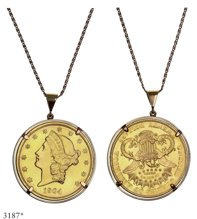
USA, twenty dollars or double eagle, 1904, Liberty head. Set in a clip surround mount with fine gold chain, (37. 81g) coin nearly uncirculated.

Ex Chris Hall Collection, from Noble Numismatics Sale 92 (lot 2455).