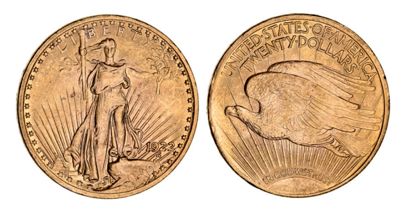
3191* USA, twenty dollars or double eagle, 1922, St. Gaudens. Nearly uncirculated .