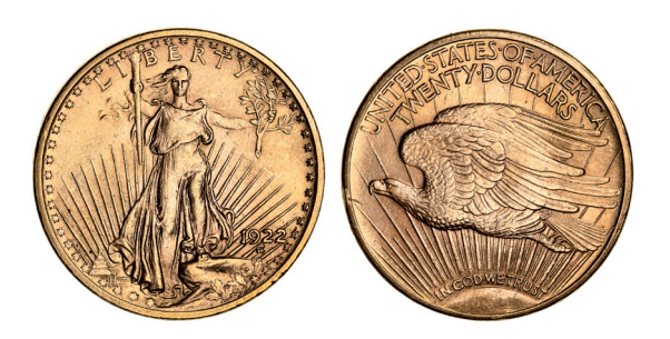
3192* USA, twenty dollars or double eagle, 1922, St. Gaudens. Nearly uncirculated. $2,400

Ex Chris Hall Collection, from Noble Numismatics Sale 92 (lot 2467).