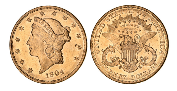
3186* USA, twenty dollars or double eagle, 1904, Liberty head. Nearly uncirculated. $2,700

Ex Chris Hall Collection, from Noble Numismatics Sale 92 (lot 2455).