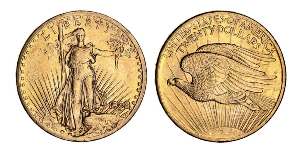
3189* USA, twenty dollars or double eagle, 1908 no motto, St. Gaudens. Good extremely fine . $2,400