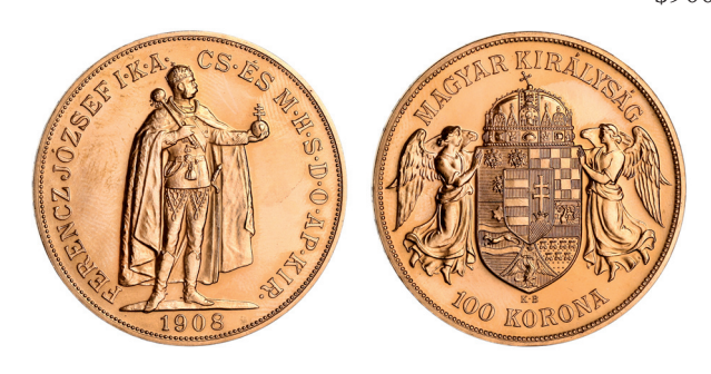
3062* Hungary, Franz Joseph, one hundred korona, 1908 restrike (KM.491). Nearly uncirculated . $2,200