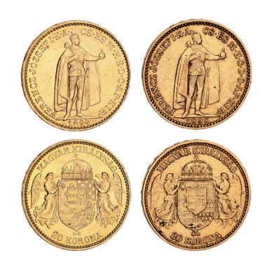
3058* Hungary, Franz Joseph, twenty korona, 1894 and 1898 (KM.486). Extremely fine - uncirculated . (2) $900