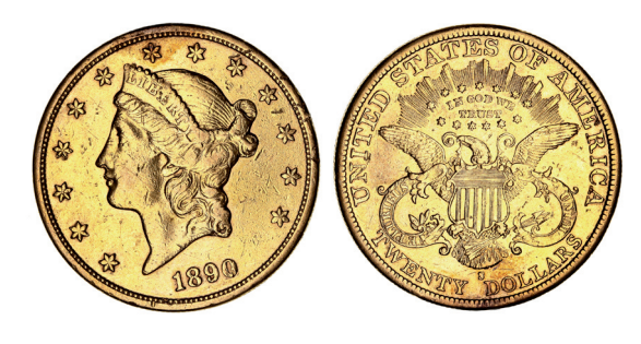
3185* USA, twenty dollars or double eagle, 1890S, Liberty head. Loop mount removed from the top, otherwise very fine. $2,400