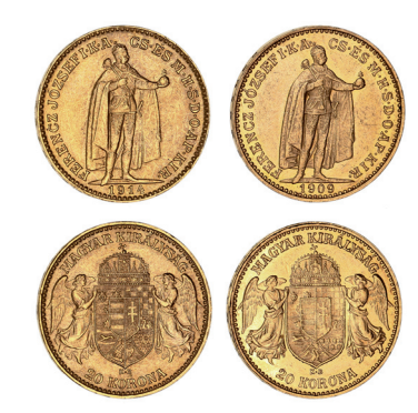
3061* Hungary, Franz Joseph, twenty korona, 1909 and 1914 (KM.486). Extremely fine - uncirculated. (2) $900