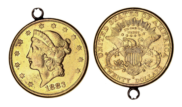
3184* USA, twenty dollars or double eagle, 1883S, Liberty head. Loop mount at top, otherwise very fine.