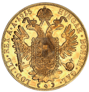
2991* Austria, Franz Joseph, four ducats, 1915 restrike (KM.2276). Proof-like uncirculated .