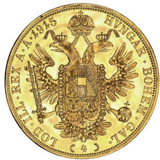
Austria, Franz Joseph, four ducats, 1915 restrike (KM.2276). Proof-like uncirculated.