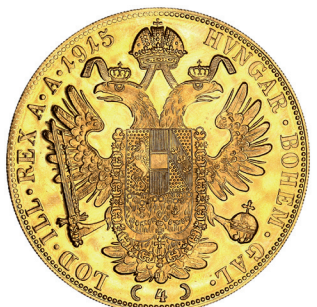
2993* Austria, Franz Joseph, four ducats, 1915 restrike (KM.2276). Obverse contact mark, nearly uncirculated. $1,100