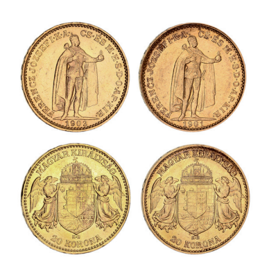
3060* Hungary, Franz Joseph, twenty korona, 1901 and 1903 (KM.486). Extremely fine - uncirculated . (2) $900