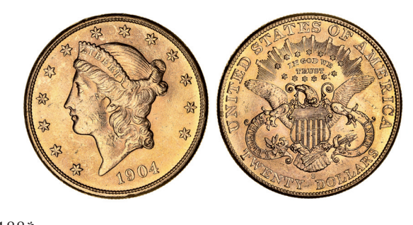
3188* USA, twenty dollars or double eagle, 1904S, Liberty head. Scuffed on the obverse, otherwise nearly uncirculated. $2,400