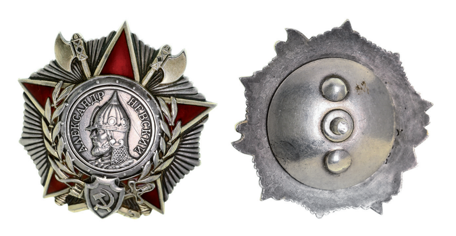
4229* Russia, USSR, Order of Alexander Nevsky, breast badge, type 3 screw back version, impressed Monetny Dvor mintmark on reverse below screw and engraved number 35905. Scratch mark on central disc, otherwise very fine. $1,500