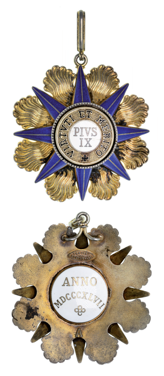
4246* Vatican, Order of Pius, neck badge in gilt and enamel, reverse marked for maker, 'Tanfani Bertarelli'. No ribbon, very fine. $300