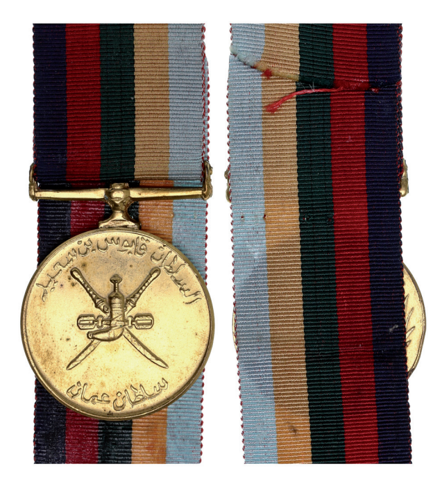
4217* Oman, Sultan's Bravery Medal. Some tone spots and ribbon with glue residue, otherwise good very fine and scarce.

Nigeria, Federal Republic, Service Medal 1963-1973; National Service Medal 1966-1970; Defence Service Medal 1967-1970. All unnamed as issued. Extremely fine - uncirculated. (3)