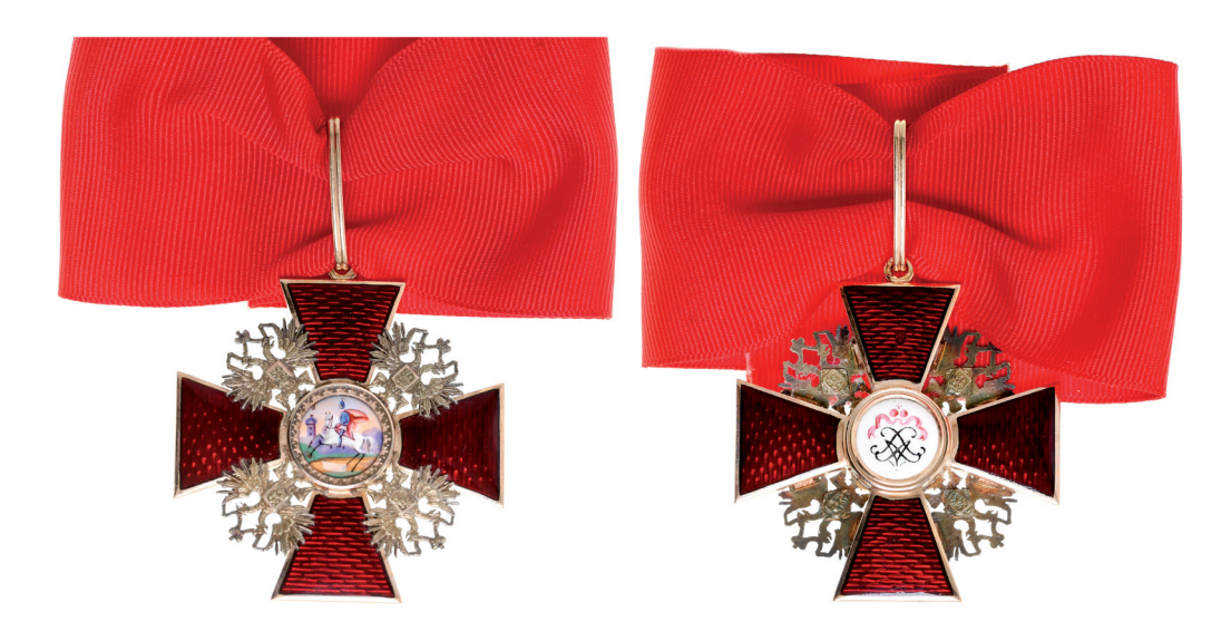
4227* Russia, Imperial, Order of St Alexander Nevsky neck badge, no swords, in gold and enamel with hallmark on suspension ring. Good very fine . $10,000