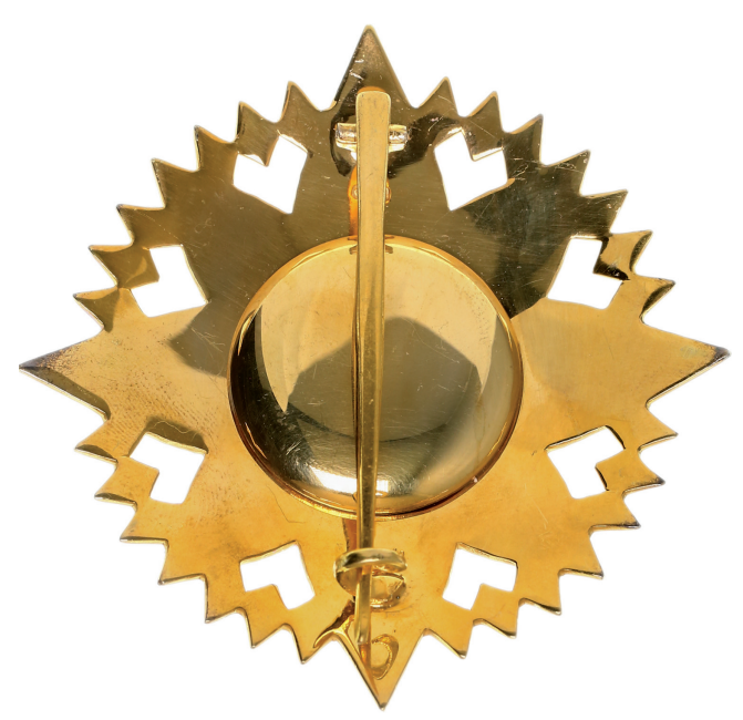
4235* Thailand, Order of the Crown of Thailand, breast star in silver, gilt and enamel, reverse numbered 36/1 and this number also on back of suspension pin. Some chipping to enamel, otherwise extremely fine.