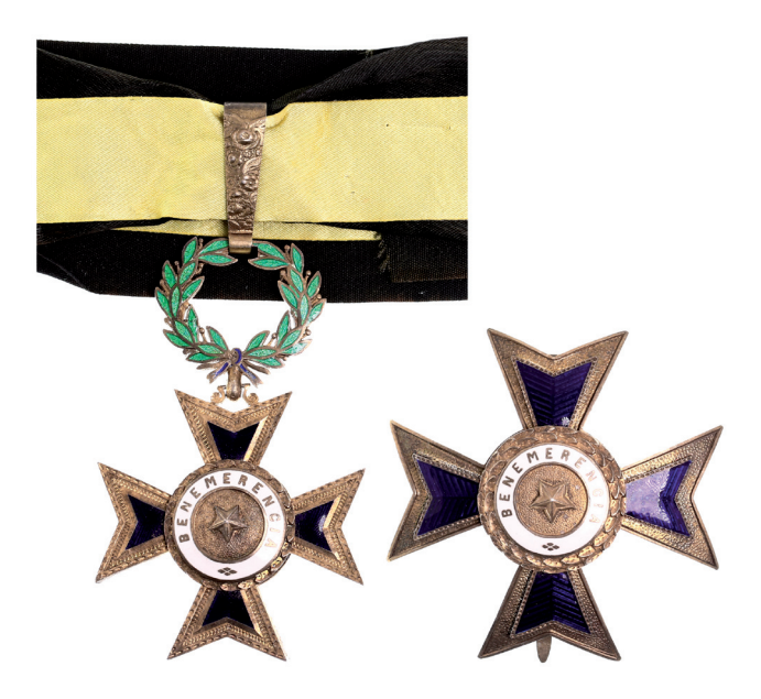
4219* Portugal, Order of Merit Second Class (Grand Officer) neck badge and breast star in gilt and enamel. Very fine . (2) $600