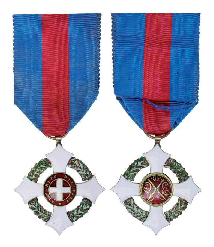
4209* Italy, Savoy, Military Order of Savoy (Chevalier Fifth Class),