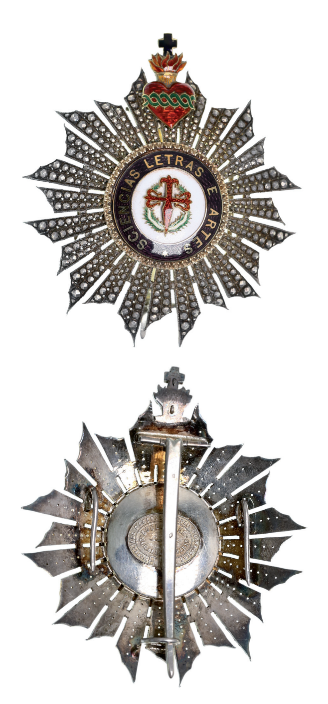
4221* Portugal, Military Order of St James of the Sword, pre 1910 type breast star in silver gilt and enamel, by Boullanger, Paris. Extremely fine .