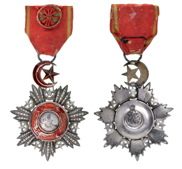
Turkey, Order of Medjidjie, badge in silver, gold and enamel, with rosette on ribbon. Very fine .