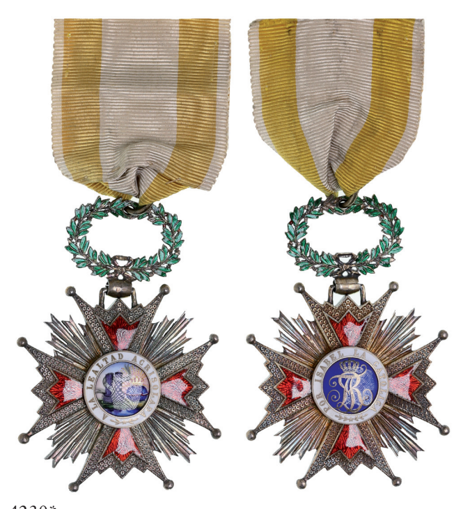
4230* Spain, Order of Isabella the Catholic, Commander (Second Class) breast badge in silver, gilt and enamel. Toned nearly extremely fine .