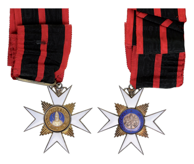
4247* Vatican, Order of St Sylvester, Commander's neck badge in silver, gilt and enamel. Very fine .