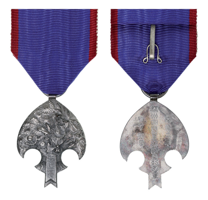
4214* Japan, Manchukuo State (Japanese puppet state) medal in silver on ribbon, Imperial Visit of Emperor Pu-Yi of Manchukuo to Japan, 1935, marked M 1000 on ring. In box of issue, nearly uncirculated and rare.