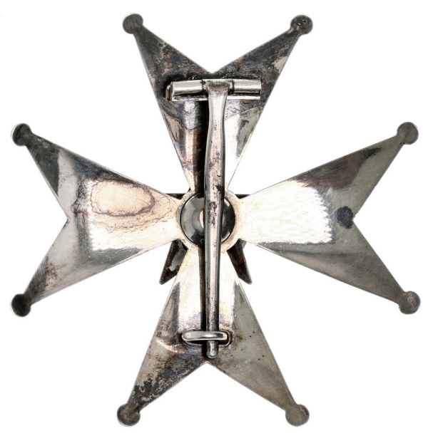
4233* Sweden, Royal Order of the North (Polar) Star, Commander 1st Class breast badge in silver. Extremely fine .