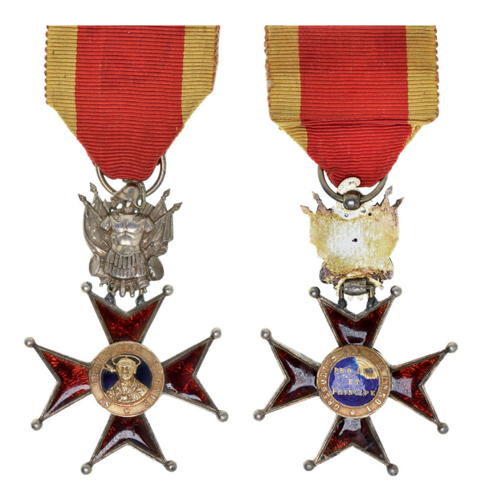
4245* Vatican, Order of St Gregory (Military Division), breast badge in gold, silver and enamel. Some enamel missing on reverse and suspender repaired, otherwise very fine.