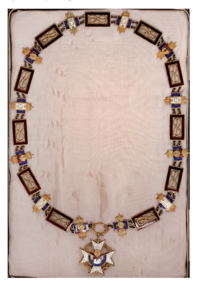
Spain, Order of the Cross of St Raymond of Penafort, collar chain of the Grand Cross in gilt and enamel, stored in a case by Wm Drummond & Co, Melbourne, case damaged. Collar chain and cross extremely fine .