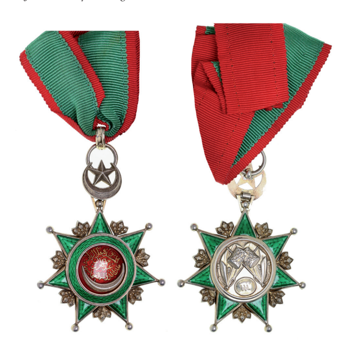
4237* Turkey, Order of Osmania, Commander's neck badge in silver, gilt and enamel. Extremely fine . $250