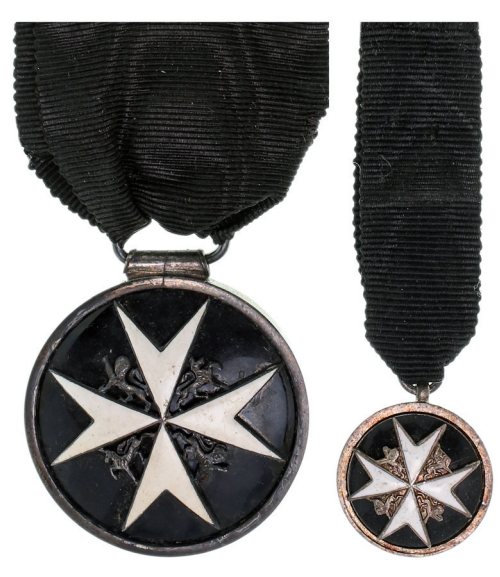
4145* Order of St John, Officer Serving Brother/Sister breast badge (type 2). Unnamed. Toned good very fine .