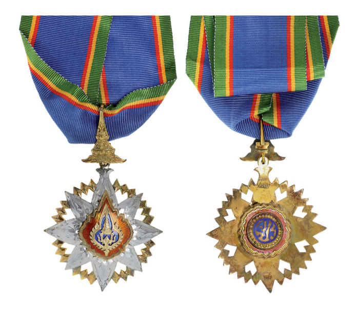
4236* Thailand, Order of the Crown of Thailand, neck badge in silver, gilt and enamel, reverse numbered 38/2. In case of issue, nearly uncirculated.