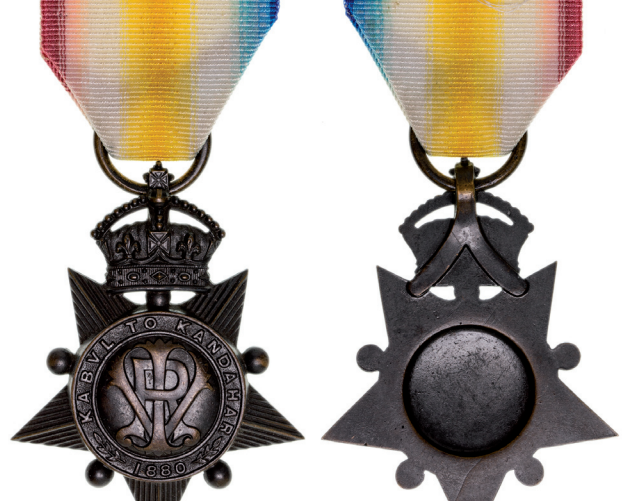
4115* Kabul to Kandahar Star 1878-80. Unnamed. Extremely fine .