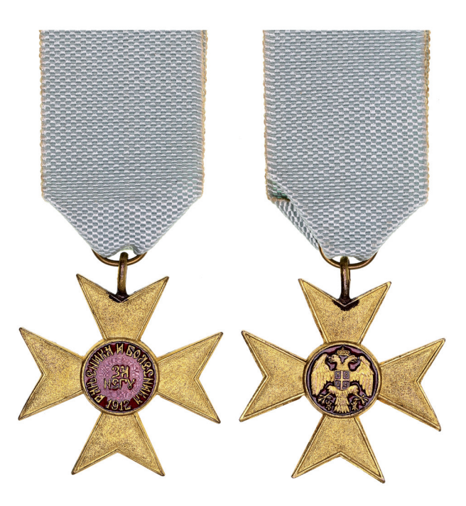
4228* Serbia, Cross of Charity or Mercy, 1912. A few tone spots, otherwise nearly extremely fine.