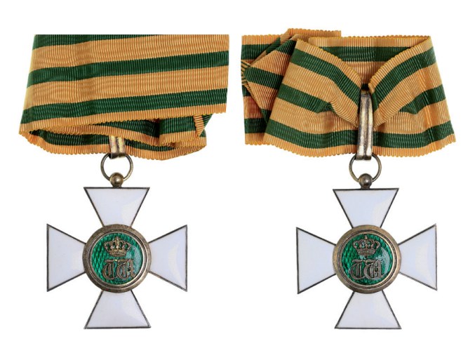
4215* Luxembourg, Grand Duchy, Order of the Oak Crown, Commander (Third Class) neck badge in gilt and enamel. In fitted case of issue, this with some damage, neck badge nearly uncirculated.