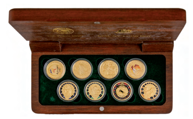
1246* Elizabeth II, Royal Australian Mint and Perth Mint, proof gold one hundred dollars, Sydney 2000 Olympic gold coin Collection, eight coin set. In jarrah case of issue, with certificate , 05385, FDC. (8)