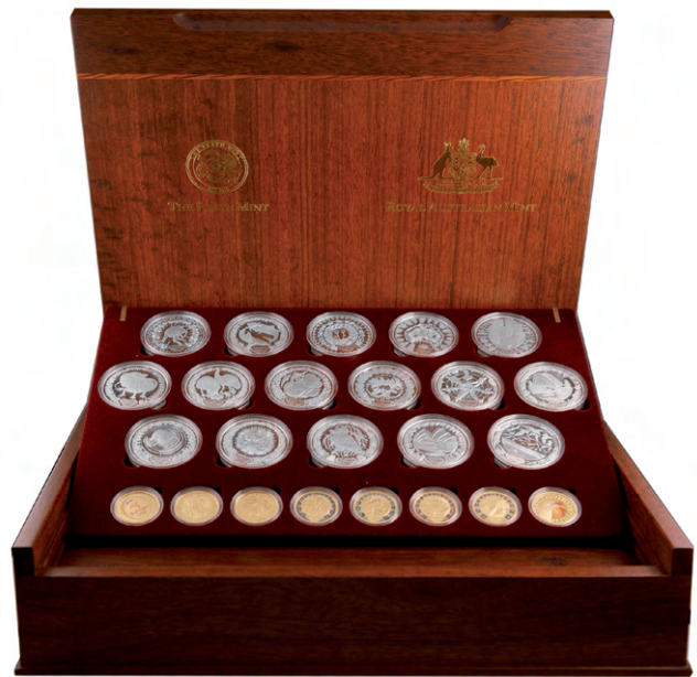
1245* Elizabeth II, Sydney 2000 Olympics, Millennium coin collection, eight gold (AGW = 10.021 g each) and sixteen silver (ASW = 31.63 g each) proof coin set in jarrah and she-oak presentation box with booklets, all with matching numbers. FDC .