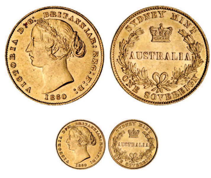
1810* Queen Victoria, second type, 1860. Good extremely fine and very rare .

Ex Chris Hall Collection, from Noble Numismatics Sale 92 (lot 1351).