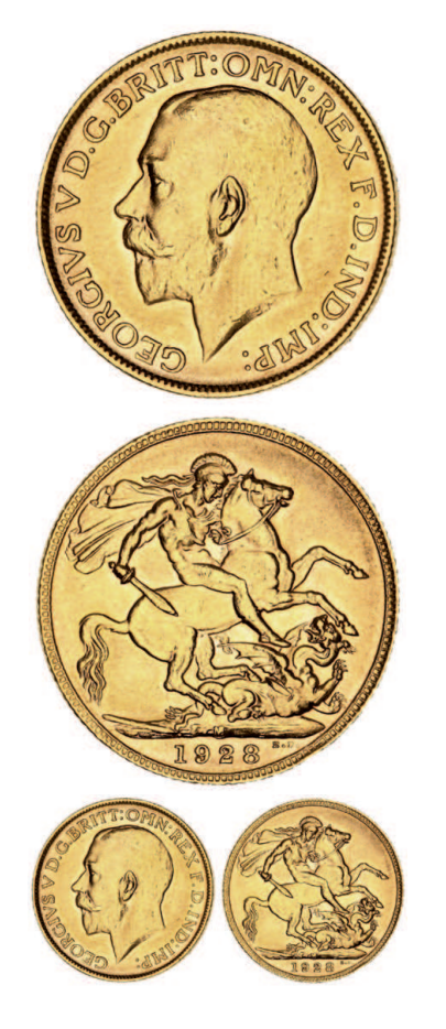
George V, 1928 Melbourne. Nearly uncirculated and rare . $2,200