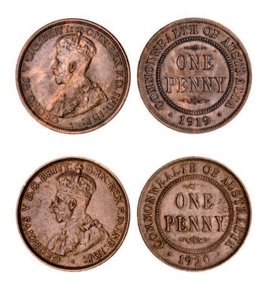
2279* George V, 1919 and 1920 dot below scroll, Indian die. Extremely fine; good very fine. (2)