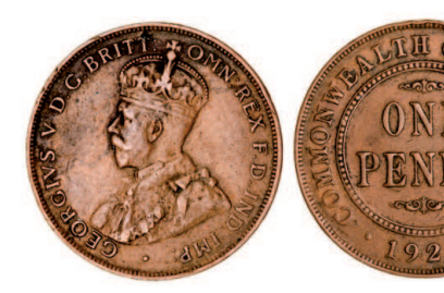
2289* George V, 1925, London die. Q die state, brown patina, very fine.