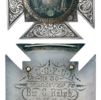
Lot 2376 part