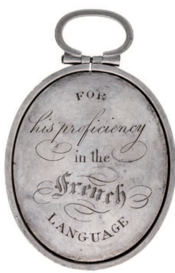
Lot 2413 part