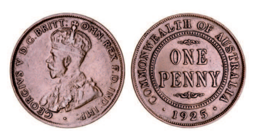
George V, 1925 London die. Q die state; plain die state, first damaged, otherwise very fine; second six pearls even brown patina, very fine. (2)