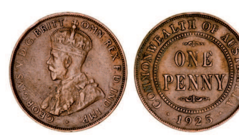
2286* George V, 1925, London die. Plain die state, nearly very fine.