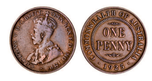
2290* George V, 1925 London die. Q die state, fine/good fine. $80