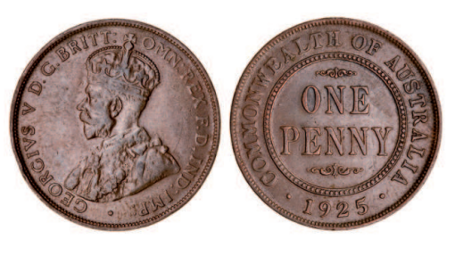
2288* George V, 1925 London die. Q die state, very fine.