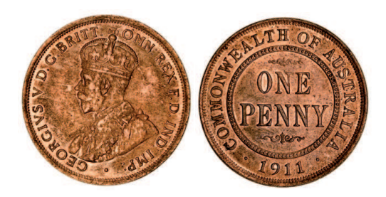
2270* George V, 1911. Dusty spotted obverse, some mint red, nearly uncirculated.