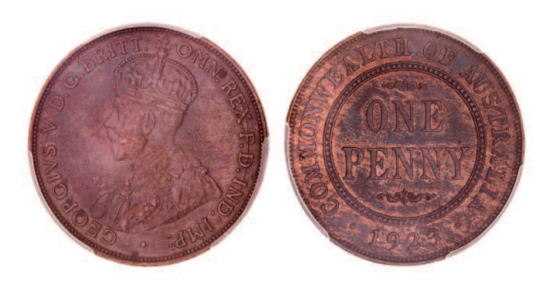
2285* George V, 1923. Patchy tone, good extremely fine.