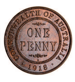
2277* George V, 1918I. Glossy grey brown patina, nearly uncirculated.