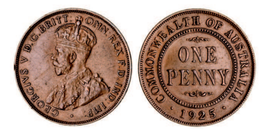
2292* George V, 1925 London die. Horizontal line on neck die state, eight pearls, three tiny rim nicks, otherwise nearly extremely fine. $400