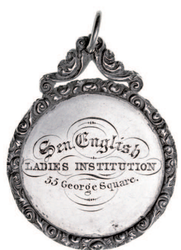
Lot 2411 part