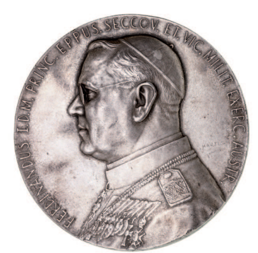
Lot 2398 part