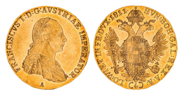
2647* Austria, Franz II, four ducats, 1811A (KM.2177). Considerable mirror-like brilliance, minor surface hairline scratch not visible to the naked eye, nearly uncirculated and very scarce. $2,500