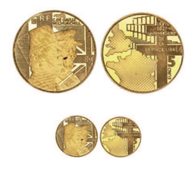
2696* France, Paris Mint, proof five euros 2021, in 9999 fine gold (0.5g), 80th Anniversary of Free French and Franco-British Friendship, error coin mm above De Gaulle instead of Churchill. In case of issue with certificate No 0048, FDC and very rare. $1,100