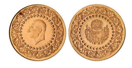
2776* Turkey, Attaturk, one hundred kurush, monnaies de luxe, 1968 (KM.872). Uncirculated . $600