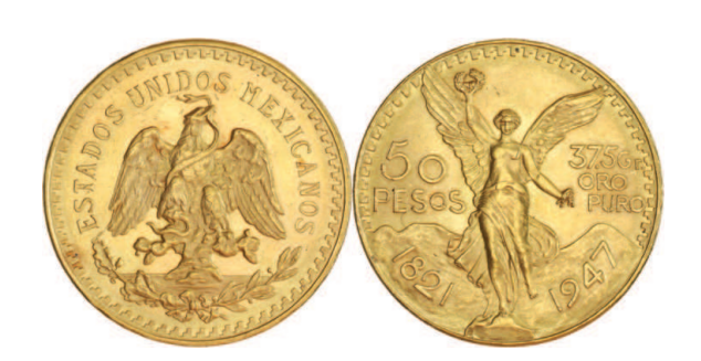
2739* Mexico, Republic, fifty pesos, 1947 (KM.481). Nearly uncirculated. $3,000