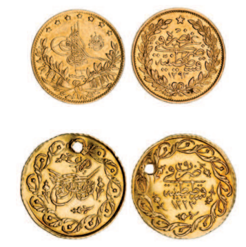
2775* Turkey, Abdul Hamid II, 50 kurush AH 1293/33 (1908)(KM.731); also cedid mahmudiye, AH 1223/29 (KM.645). Nearly extremely fine; extremely fine holed. (2) $200