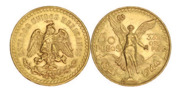
2736* Mexico, Republic, fifty pesos, 1944 (KM.481). Good extremely fine. $2,800