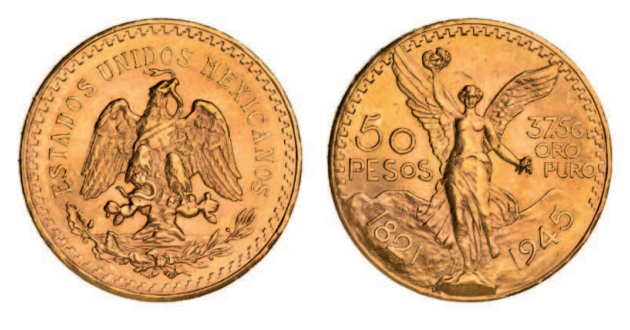
2737* Mexico, Republic, fifty pesos, 1945 (KM.481). Nearly uncirculated.

Ex Noble Numismatics Sale 105 (lot 3193)(was attributed for Utrecht).