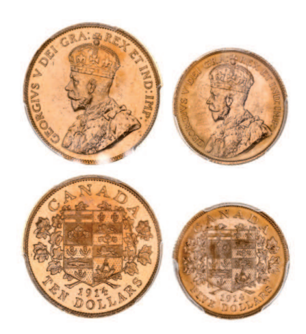
2676* Canada, George V, five and ten dollars, 1914 (KM.26,7). Uncirculated. (2)