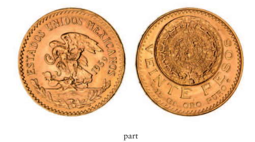
2735* Mexico, Republic, twenty pesos, 1959 (KM.478). Nearly uncirculated . (2)