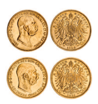
2658* Austria, Franz Joseph, ten corona 1909 (KM.2815), 1910 (KM.2816). Nearly extremely fine. (2) $550