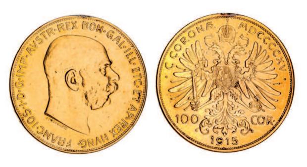
2662* Austria, Franz Joseph, one hundred corona, 1915 (KM.2819). Possibly mounted on the top, otherwise very fine or better. $2,400