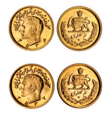
2718* Iran, Mohammad Reza Pahlavi Shah, half pahlavi, MS 2536; 2537, (KM.1199). Choice uncirculated . (2) $650