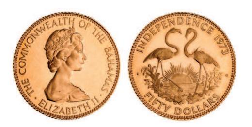
2663* Bahamas, Elizabeth II, fifty dollars 1973 (KM.48). Uncirculated.