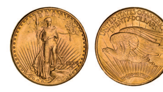
2794* USA, twenty dollars or double eagle, 1924, St. Gaudens. Nearly uncirculated. $2,800