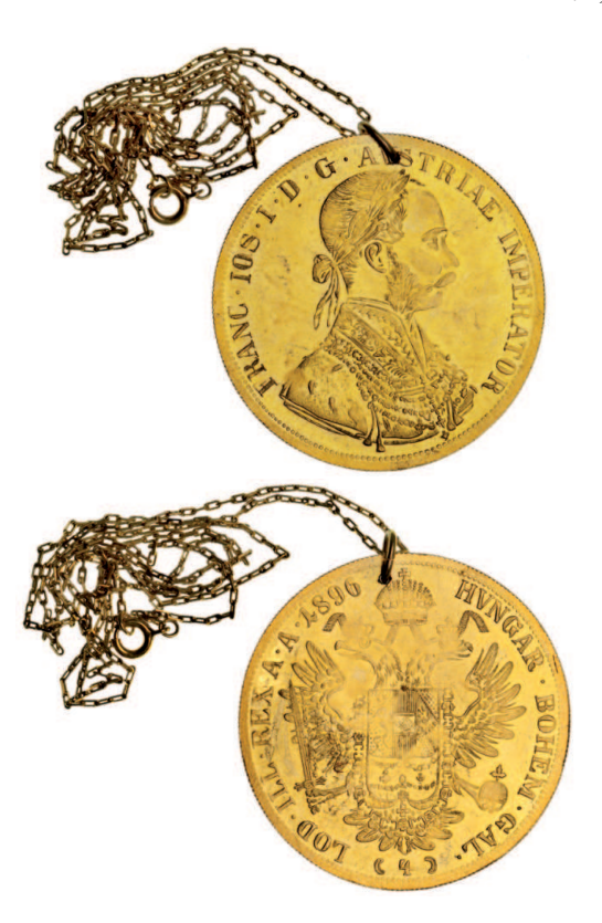
2657* Austra, Franz Joseph, four ducats, 1896, Levantine jewellers' copy (cf KM.2276) with 22 carat fine chain (coin 8.18g with chain 10.24g). Extremely fine or better .