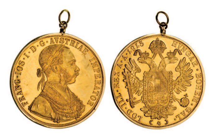
2656* Austria, Franz Joseph, four ducats, 1915 (KM.2276) restrike (16.02g). Set in 14 carat (. 585) surround mount, otherwise good extremely fine.