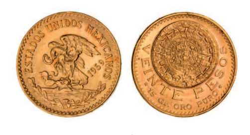
2734* Mexico, Republic, twenty pesos, 1959 (KM.478). Nearly uncirculated . (2)