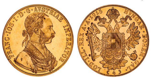
2654* Austria, Franz Joseph, four ducats, 1915, restrike (KM.2276). Uncirculated . $1,100