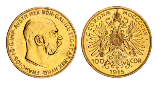
2661* Austria, Franz Joseph, one hundred corona, 1915, restrike (KM.2819). Good extremely fine/nearly uncirculated . $2,400