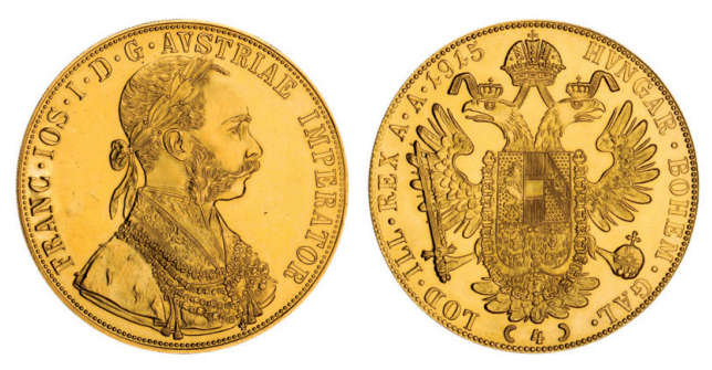
2653* Austria, Franz Joseph, four ducats, 1915 restrike (KM.2276). Uncirculated.