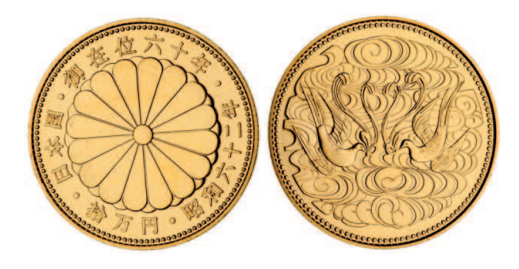
2727* Japan, mint 100,000 yen, year 62 (1987)(KM.Y.92). FDC. $1,650

Ex Noble Numismatics Sale 120 (lot 2782).