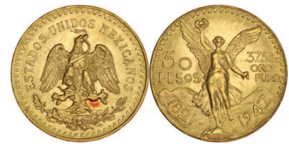
2738* Mexico, Republic, fifty pesos, 1947 (KM.481). Nearly uncirculated. $3,000