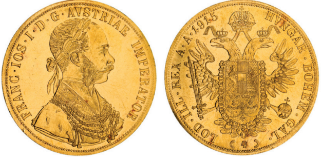
2655* Austria, Franz Joseph, four ducats, 1915 restrike (KM.2276). Slight bending and hairlines, otherwise nearly uncircualted.