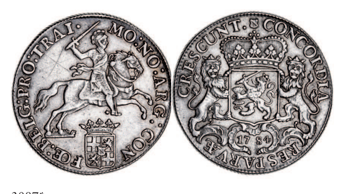
3087* Netherlands, Utrecht, ducaton 1784 (Dav. 1832; De. 1031; KM.92.1). Graffiti scratch behind the rider, good very fine.

Ex Alan L. Whiting Collection (Spink Australia, Sale 17, lot 2492).