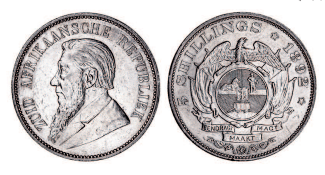
3115* South Africa, ZAR, Paul Kruger, silver five shillings, 1892 double shaft (KM.8.2). Nearly extremely fine .