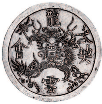
3154* Vietnam (Annam), Thieu Tri (1841-47) silver five tien (18.76g)(KM.286; Sch.261). Nearly extremely fine and very scarce.