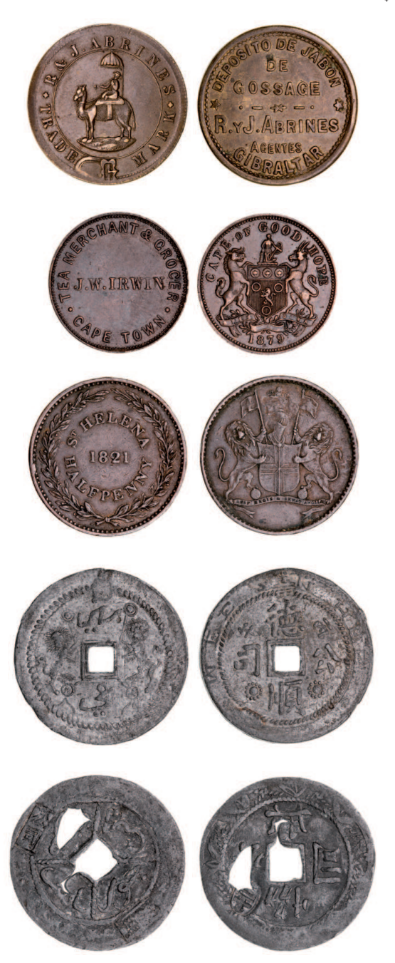
Lot 3198 part