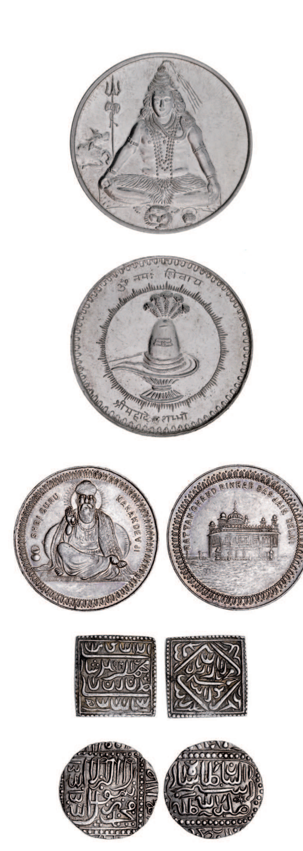
Lot 3040 part