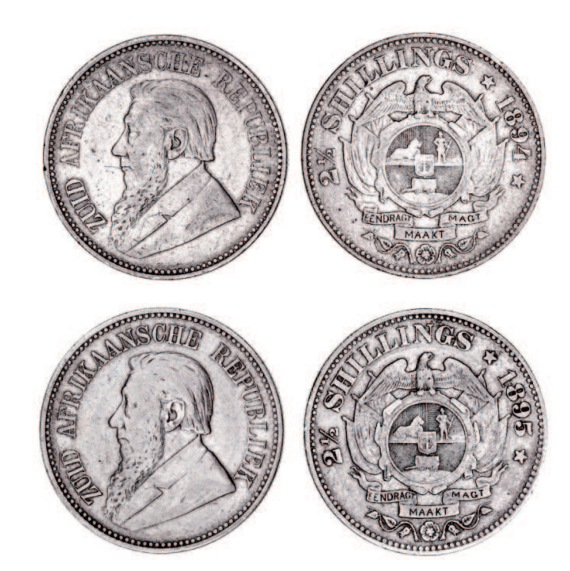
3114* South Africa, ZAR, Paul Kruger silver two and a half shillings, 1894, 1895. Toned, good fine or better. (2)