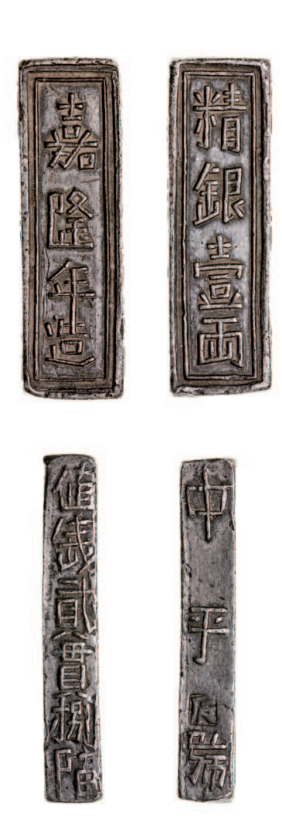
3146* Vietnam (Annam), Gia Long (1802-20) silver bullion bar (38.31g) one liang (KM.179; Sch.118). Toned, good very fine .