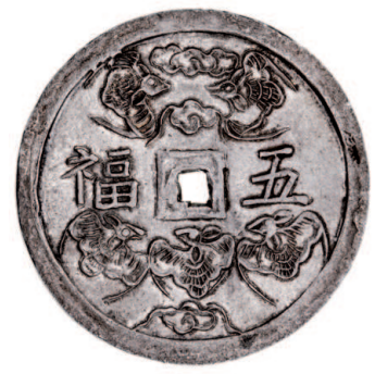
3153* Vietnam (Annam), Thieu Tri (1841-47), silver five tien, (18.93g) (KM.285; Sch.255). Toned, nearly extremely fine and rare.