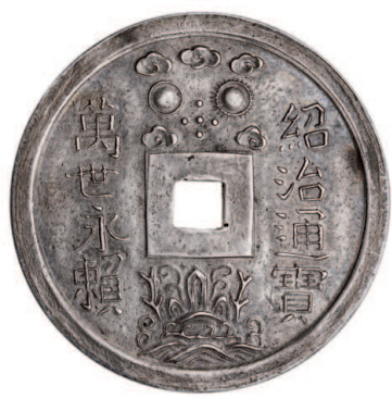
3152* Vietnam (Annam), Thieu Tri (1841-47) silver five tien (18.37g)(KM.281; Sch.242). Toned, nearly extremely fine and very scarce.