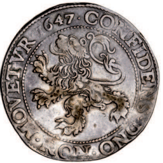
3086* Netherlands, Utrecht, lion daalder, 1647 (KM.32.1). Brown blue grey toning, nearly very fine. $80