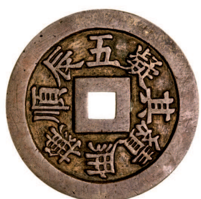
Lot 3166 part