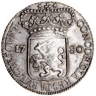
3090* Netherlands, Zeeland, silver ducat, 1780 (KM.52.4). Flan flaw (or cmk?) behind the knight, otherwise toned good very fine.