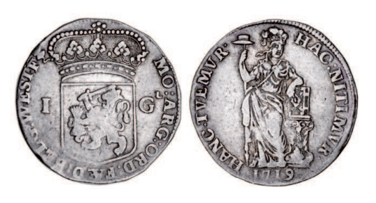
Netherlands, Westfriesland, silver gulden, 1719 (KM.97.3). Nearly very fine.

In ANACS slabs as MS62 AU55, MS60, last as PCGS as MS65.