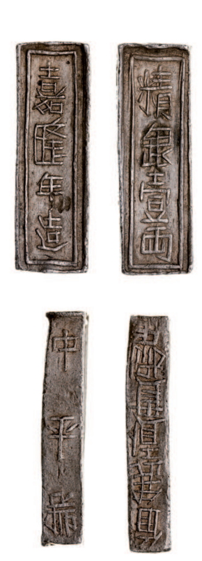
3145* Vietnam (Annam), Gia Long (1802-20) silver bullion bar (39.09g)(KM.179; Sch.118) tiny chopmark on obverse. Toned good very fine .

Ex Ken O'Brien Collection, first from Taisei Sale 29 (lot 468).