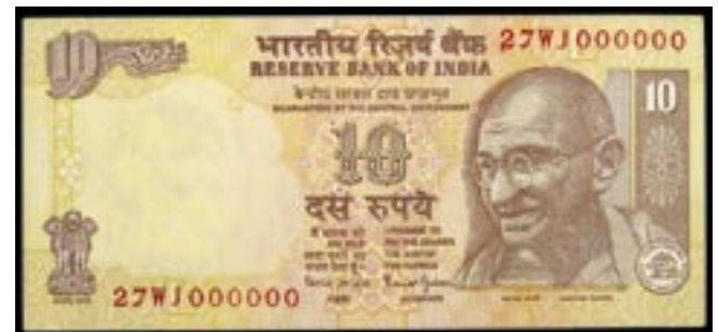
2522* India , Reserve Bank of India, ten rupees, 1992 issue, 27W 1000000, (P.88c). Uncirculated. $100