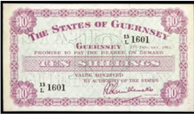
2516* Guernsey , the States of Guernsey, ten shillings, 1st January 1961, 13/L 1601, (P.42b). Slight foxing, nearly uncirculated. $100