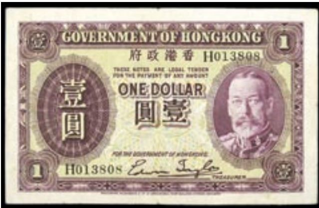
2517* Hong Kong , Government of Hong Kong, George V, one dollar, undated (1935) H013808, (P.311). Flattened of folds, otherwise fine. $150