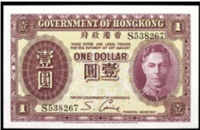
2518* Hong Kong , Government of Hong Kong, George VI, undated (1936), one dollar, S538267, (P.312). Uncirculated. $150