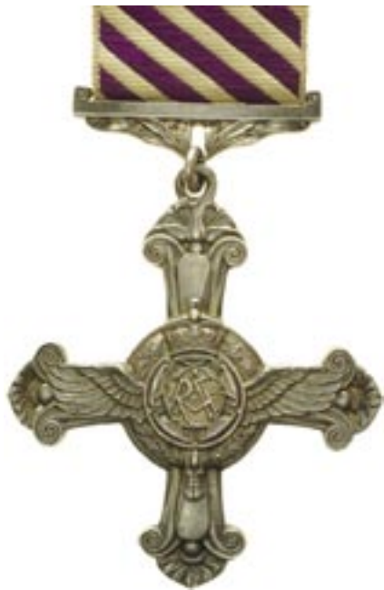
2215* Distinguished Flying Cross (GVR). Unnamed, cased. Extremely fine. $1,500