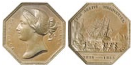
2220* Arctic Medal (VR Young Head). Specimen in bronze, unnamed. Extremely fine. $250