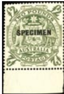
Lot 2397 (part)