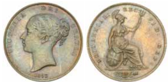
1031* Queen Victoria , copper penny, 1853 with ornamental trident, DEF with far colon, (S.3948, P.1500). Nearly uncirculated with trace of mint red.