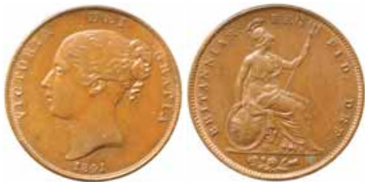
1028* Queen Victoria , copper penny, 1841 ornamental trident, no colon after REG, (S.3948). Good extremely fine, with traces of mint red colour.