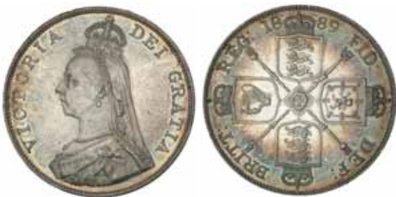
1014* Queen Victoria , Jubilee head, silver double florin, 1889 with inverted 1 for I in Victoria, (S.3923, ESC 398A [R3]). Blue and gold patina, good extremely fine or better and very rare.