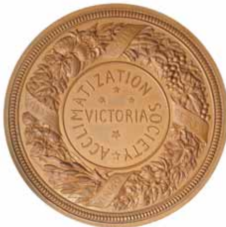
Lot 1217 reverse