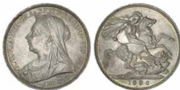
1021* Queen Victoria , old head, crown, 1896 LX (S.3937). Golden peripheral tone, uncirculated.