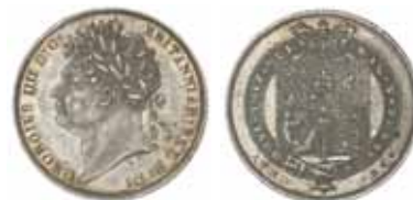
961* George IV , laureate head, shilling 1824, (S.3811, ESC 1251). Lightly toned, nearly uncirculated. $450