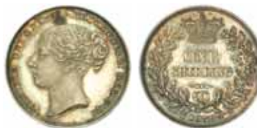
998* Queen Victoria , proof young head shilling 1839, plain edge (S.3904). Carbon spot top of head, toned, nearly FDC.