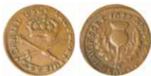
1159* Scotland , Charles II, (1649-1685), third coinage, copper turner or bodle, 1677, variety IIIB for HIB, (S.5630). Lightly toned, very fine, rare. $250