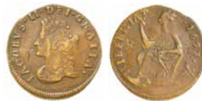
1164* Ireland , James II, Civil War, Limerick besieged 1690-1691, halfpenny, 1691 struck over a Gunmoney large shilling, (S.6594). Good very fine and scarce. $250