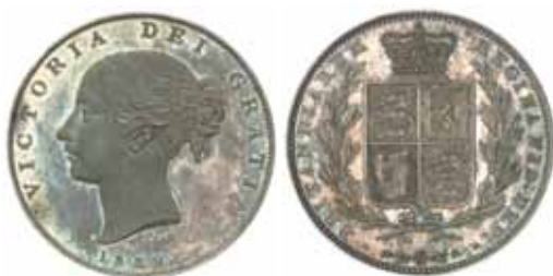
992* Queen Victoria , proof young head half crown, 1839, plain edge (S.3885). Deep iridescent grey toned proof, FDC and rare.