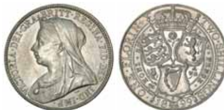
1023* Queen Victoria , old head, florin, 1899, (S.3939). Brilliant, uncirculated.