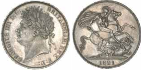
955* George IV , laureate head, crown 1821, Secundo (S.3805, ESC 246). Light steel-blue tone, good extremely fine. $2,000