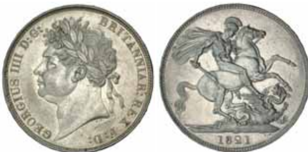
957* George IV , laureate head, crown, 1821 secundo (S.3805, ESC 246). Good very fine. $400