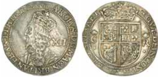
1156* Scotland , Charles I, (1625-1649), twelve shillings, mm thistle before legend, F over crown, type IV, (S.5563). Has been bent and straightened, otherwise nearly very fine. $250