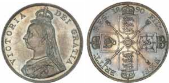
1015* Queen Victoria , Jubilee head double florin, Arabic 1, 1890 (S.3923). Toned, uncirculated.