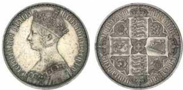
991* Queen Victoria , Gothic crown, 1847, lettered edge (S.3883). Has been lacquered, causing yellow metal appearance, good very fine.