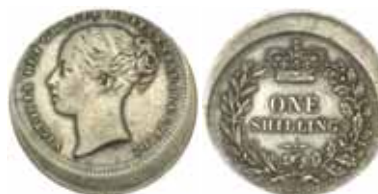
999* Queen Victoria , young head misstruck shilling, 1872, no WW, die no.78, (S.3906A). Toned, extremely fine.