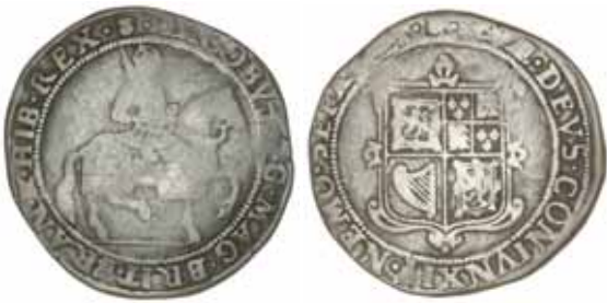
1155* Scotland , James VI, (1567-1625), thirty shillings, mm thistle, first type, (S.5504). Toned, nearly fine/fine, scarce. $200