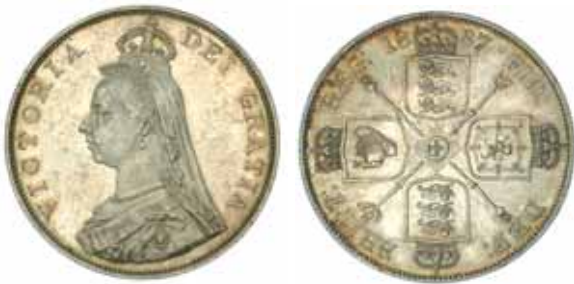
1012* Queen Victoria , Jubilee head double florin, Arabic 1, 1887 (S.3923). Nearly uncirculated.