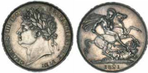
956* George IV , laureate head, crown, 1821 Secundo, (S.3805, ESC 246). Grey tone, nearly uncirculated. $1,800