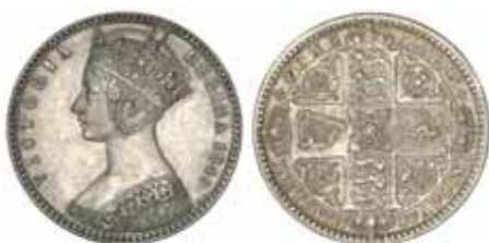
994* Queen Victoria , Godless type florin, 1849, WW behind bust (S.3890). Brilliant, good extremely fine.