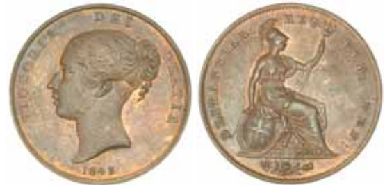
1030* Queen Victoria , copper penny, 1848/7 (S.3948). Brown and red, nearly uncirculated.