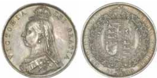
1017* Queen Victoria , Jubilee head, halfcrown, 1889, (S.3924). Green and gold, uncirculated.