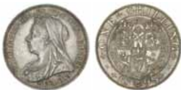
1026* Queen Victoria , old head, shilling, 1898 (S.3940, ESC 1367). Toned, nearly uncirculated.