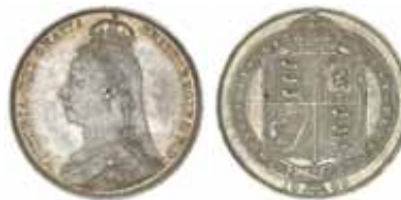
1020* Queen Victoria , Jubilee head shilling, large head shilling 1889, (S.3927, ESC 1355). Golden peripheral tone, good extremely fine.