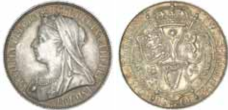
1025* Queen Victoria , old head, florin, 1900, (S.3939). Golden peripheral tone, nearly uncirculated.