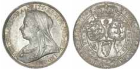
1024* Queen Victoria , old head, florin, 1897, (S.3939). Good extremely fine or better.