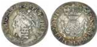
1157* Scotland , Charles I, (1625-1649), third coinage, 1637-1642, forty pence, obv. bust to edge, rev. B at end of reverse legend, (S.5577). Toned, very fine, scarce. $100