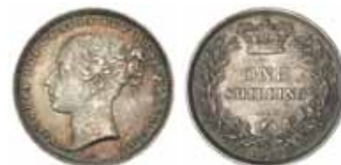
1000* Queen Victoria , young head shilling, 1877, no WW, die no.44, (S.3906A, ESC 1329). Toned, extremely fine.