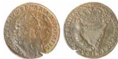
1165* Ireland , William and Mary, halfpenny, 1692, (S.6597). Edge flaw, good very fine and scarce. $350