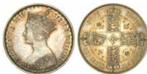
997* Queen Victoria , proof Gothic florin, 1857 (S.3891). Attractive grey and iridescent toned FDC and very rare.