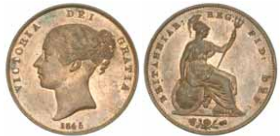
1029* Queen Victoria , copper penny, 1845 (S.3948). Nearly full mint red.