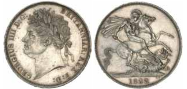
959* George IV , laureate head, crown, 1822. edge Tertio (S.3805). Scratch behind horse otherwise lightly toned extremely fine. $1,500