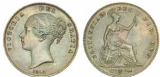
1032* Queen Victoria , copper penny, 1854 with normal trident, DEF with close colon, (S.3948, P.1506). Extremely fine.