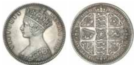
995* Queen Victoria , Godless type florin, 1849 (S.3890). Toned, minor contact on field and cheek otherwise attractive good