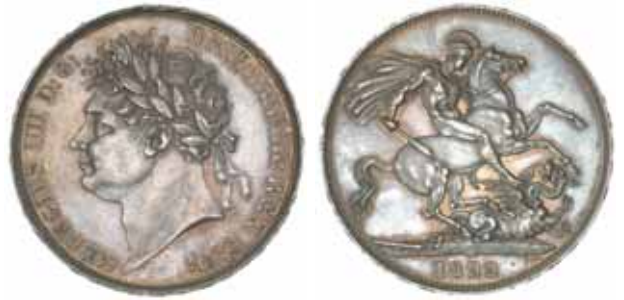
958* George IV , laureate head, crown 1822, Secundo (S.3805, ESC 251). Light gold and steel blue tone, good extremely fine. $1,400