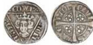
1161* Ireland , Edward I (1272-1307), second coinage, silver penny, long cross and crowned bust in triangle coinage, 1279 - 1302, Waterford mint, (S.6254). Toned, good fine. $100