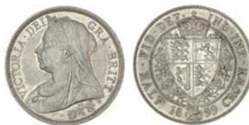
1022* Queen Victoria , veiled head, halfcrown, 1899, (S.3938, ESC 733). Brilliant, good extremely fine.