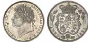
960* George IV , garnished shield, shilling 1821, (S.3810, ESC 1247). Brilliant, proof-like fields, nearly uncirculated. $500