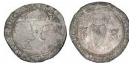
1162* Ireland , Mary and Philip of Spain, (1554-1558), silver groat, 1557, Z replaces ET in obv. legend, (S.6501C). Toned, nearly very fine/fine or better and scarce. $400