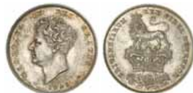
962* George IV , laureate head, shilling 1825, (S.3811, ESC 1253). Light golden peripheral patina, otherwise brilliant, nearly uncirculated. $350