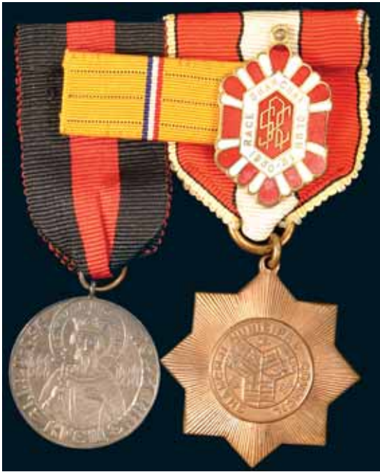
5441* Shanghai Municipal Council Emergency Medal 1937. Un-named. Very fine.