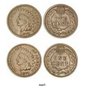
U.S.A. , Indian head cents, 1870, 1871 and 1872, all bold N. Good fine - very fine . (3)