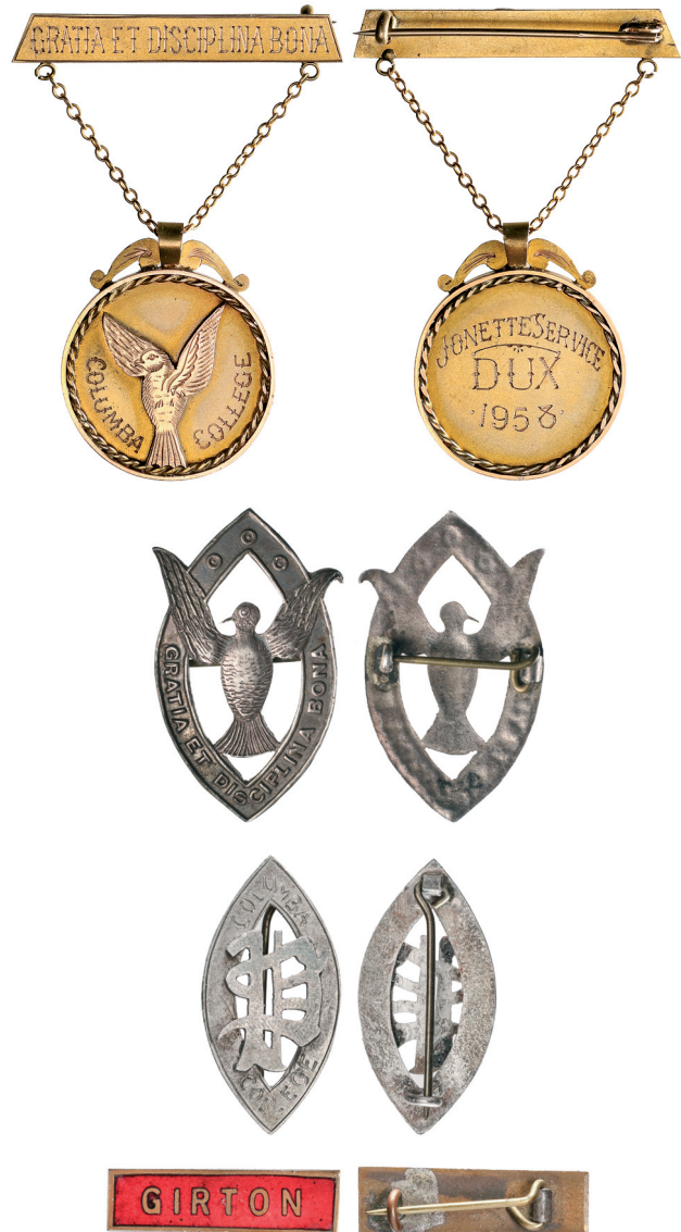
3614* Columba College, (Dunedin), Dux, 1958, handcrafted in gold (9ct, 8.4g, 27mm), by G. & T.Y. (G. & T.Young, Dunedin), ring top, chain and bar with pin-back suspension, reverse inscribed 'Jonette Service/Dux/1958'; badge, struck in silver (38x22mm), no maker, pin-back; another badge in silver (35x17mm); Girton, badge in brass and enamel (27x8mm), no maker, pin-back. Very fine. (4)