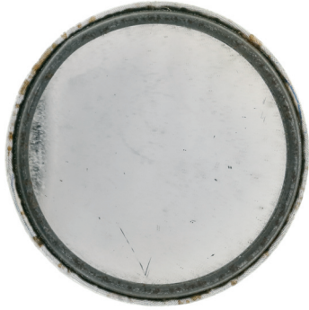
3520* George Street School, (Dunedin), Jubilee, 1930, tin and celluloid souvenir (45mm), no maker, mirror back. Very fine.