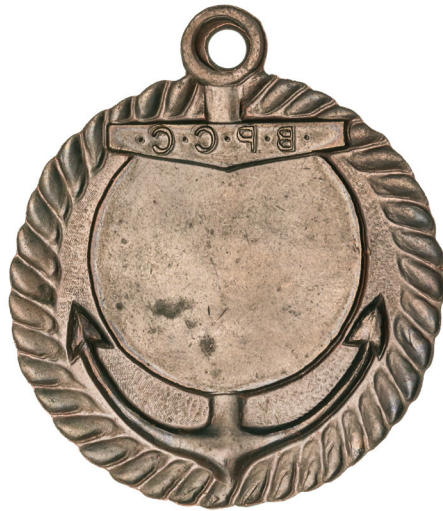
3635* B.P.C.C. (Banks Peninsula Cruising Club) , struck in copper (65x55mm), ring top suspension, obverse inscribed 'Little Akaloa/To/Lyttelton/"Paora"/1961-62'. Very fine.