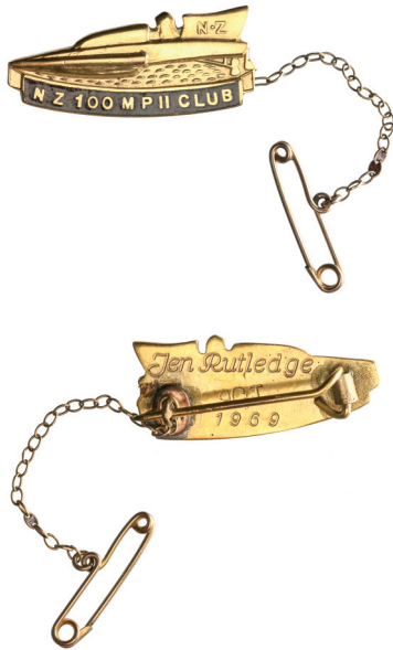
3636* NZ 100 MPH Club , badge struck in gold (9ct, 3.8g, 28x13mm) and black enamel, no maker, pin-back with safety chain, reverse inscribed 'Jen Rutledge/1969'. Extremely fine.