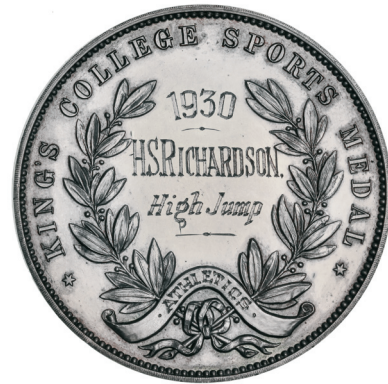
3523* King's College, (Auckland), Sports Medal (Athletics), struck in silver (48mm) by W&H (Walker & Hall), hallmark for Birmingham 1927, reverse inscribed '1930/H.S.Richardson/High Jump'. Toned, good extremely fine.