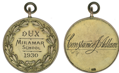
3524* Miramar School, (Wellington), dux medal, 1930, stock medal in gold (9ct, 9.8g, 26mm), by Bock (Wellington), ring top suspension, reverse inscribed 'Constance J.Adlam'. Good very fine.