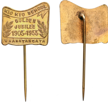
3611* Kio Kio School, Whakatangata, Golden Jubilee, 1905-1955, pin in brass (25x25mm). Extremely fine.