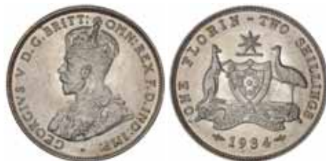
1522* George V, 1934. Full original mint bloom, nearly choice uncirculated. $1,000