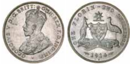
1504* George V, 1914H. Uncirculated and rare in this condition. $12,000