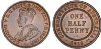
1622* George V, 1913. Brown and lilac red toned uncirculated. $1,250