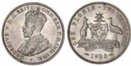
1513* George V, 1923. Well struck, nearly uncirculated. $1,500