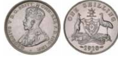
1540* George V, 1918M. Well struck, slightly rubbed, otherwise uncirculated.