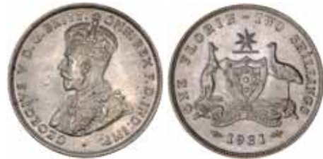
1520* George V, 1931. Uncirculated with near proof-like fields. $350