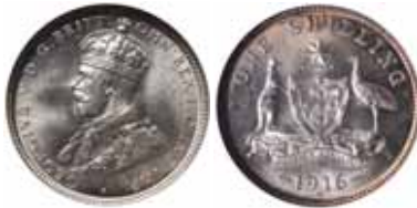
1537* George V, 1916M. Full original frosty mint bloom, faint die break from emu to rim (like third leg), choice uncirculated.