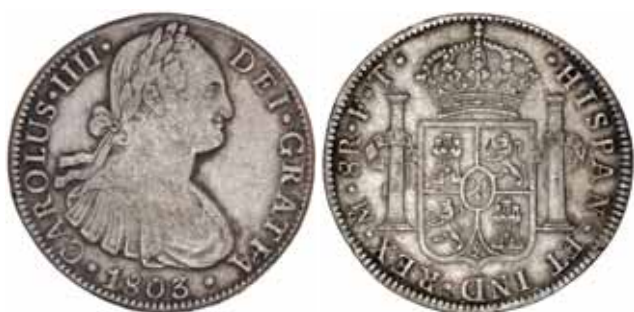
1309* Mexico , Charles III, silver eight reales, 1803 FT, Mexico City mint, (KM.109). Nearly very fine.