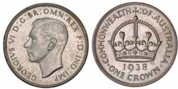
1499* George VI , 1938. Slightly hairlined otherwise nearly uncirculated.