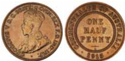
1625* George V, 1915H. Cleaned and polished otherwise good extremely fine and rare in this state. $500