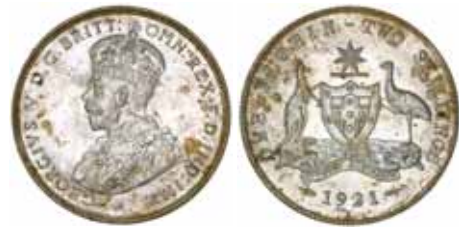
1511* George V, 1921. Full original cartwheeling mint bloom, minor yellow brown rust toning, otherwise choice uncirculated and rare thus.