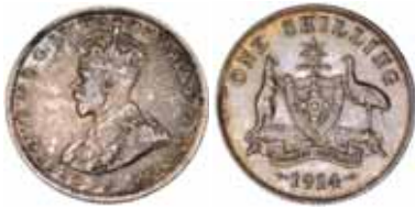
1534* George V, 1914. Toned extremely fine/good extremely fine.