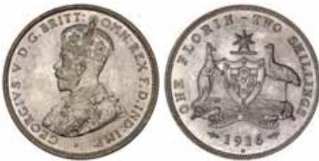
1506* George V, 1916M. Nearly uncirculated.