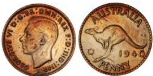
1615* George VI , 1940 K dot G. Cleaned of surface patina otherwise nearly uncirculated and rare in high grade.