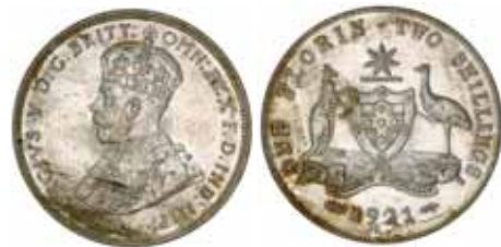
1512* George V, 1921. Well struck with full original mint bloom, minor rust stains, otherwise uncirculated and rare in this condition.