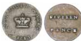
1314* New South Wales , fifteen pence or dump, 1813 (Mira dies A/1). Struck over the centre of a Charles III eight reales, traces of the original reverse on the obverse and original obverse on the reverse, toned very fine and rare in this condition.