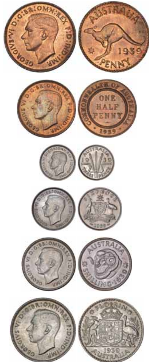
1496* George VI , year set, 1939, florin to halfpenny. The shilling and threepence choice uncirculated, the others nearly uncirculated. (6)