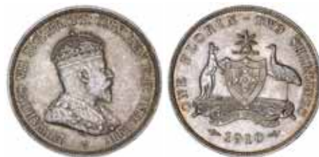
1500* Edward VII , 1910. Scuff on kangaroo's neck otherwise attractively toned with original mint bloom, good extremely fine/ nearly uncirculated.