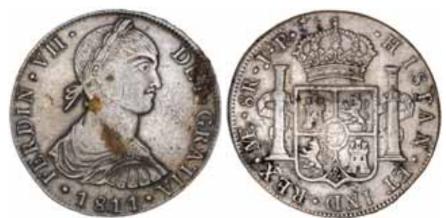
1312* Peru , Ferdinand VII, (1808-1821), eight reales imaginary bust dollar, Lima City mint, 1811 JP, (KM.106.2). Toned, very fine and scarce.