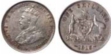
1535* George V, 1915. Good very fine.