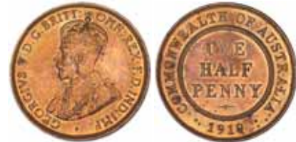
1627* George V, 1919. Red and brown uncirculated. $750