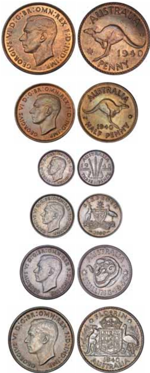
1497 George VI , year set, 1940, florin to halfpenny, all Melbourne mint. Toned nearly uncirculated. (6)