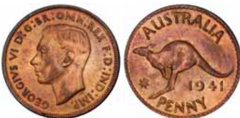
1616* George VI , 1941 K dot G. Red and brown uncirculated.