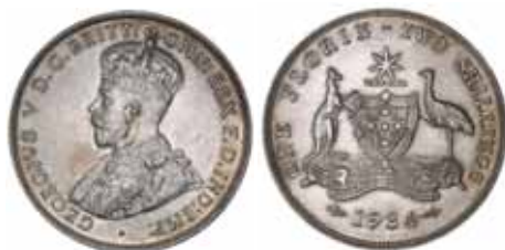
1523* George V, 1934. Lightly toned with full mint bloom, uncirculated. $750