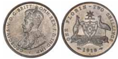
1508* George V, 1918M. Full frosty mint bloom, uncirculated. $1,000