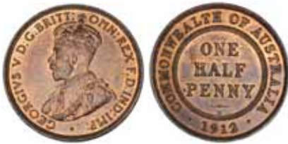
1621* George V, 1912H. Red and dark brown, uncirculated. $500