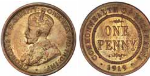
1600* George V, 1919. Dull olive red brown uncirculated, obverse rim die break at 2 o'clock. $250