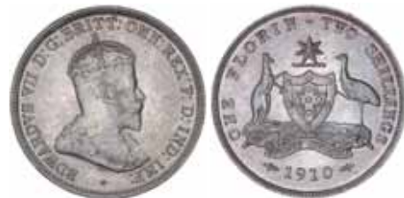
1501* Edward VII , 1910. Extremely fine/nearly uncirculated.