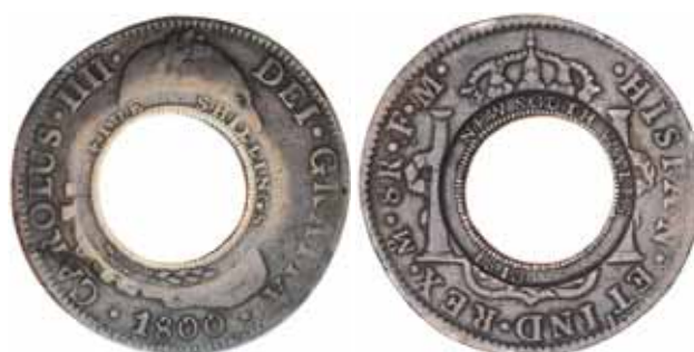
1313* New South Wales , five shillings or holey dollar, 1813, struck on a Charles III Mexico City mint eight reales, 1800 F.M. (Mira dies B/10; I/10). The coin fine/very fine and slightly dished, the countermarks fine/good very fine, toned and very rare.