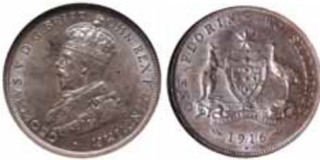
1505* George V, 1916M. Silver grey toning with mint bloom, minor surface marking otherwise nearly uncirculated.