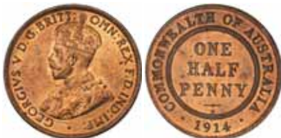
1624* George V, 1914H. Full original mint red, toned on high points, choice uncirculated and rare in this condition, one of the finest known. $3,000