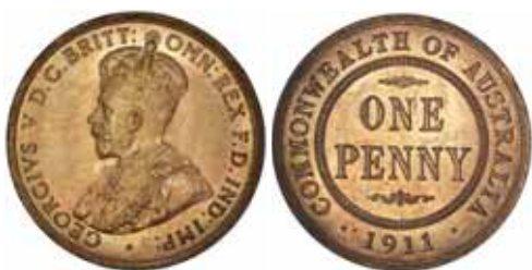
1593* George V, 1911. Full original mint red, gem uncirculated. $1,000