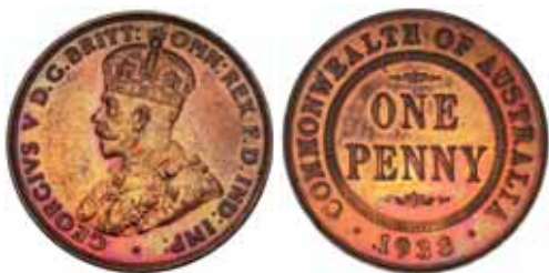
1612* George V , 1933/2 overdate. Has been cleaned and re-toning otherwise good extremely fine and very rare in this condition.