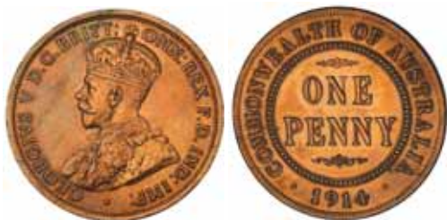
1595* George V, 1914. Cleaned otherwise nearly uncirculated. $250