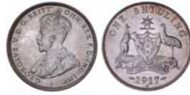
1539* George V, 1917M. Full mint bloom, nearly uncirculated/uncirculated.