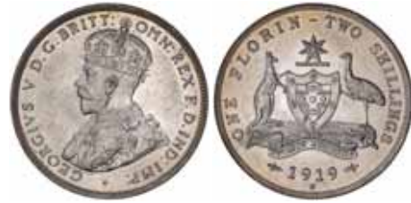
1510* George V, 1919M. Considerable mint bloom, nearly uncirculated and rare in this condition.