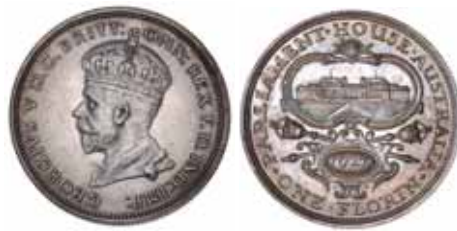
1518* George V, 1927 Canberra. Attractive tone, uncirculated. $100