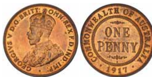
1597* George V, 1917I. Mostly mint red, obverse field with scratches in front of King's head, spotting on reverse, otherwise nearly uncirculated. $200