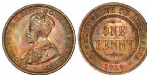
1599* George V, 1919. Dull red olive brown, uncirculated. $850