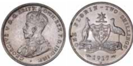
1507* George V, 1917M. Obverse scuffing otherwise considerable mint bloom, nearly uncirculated/uncirculated.