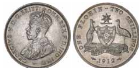
1502* George V , 1912. Some mint bloom, extremely fine/good extremely fine and rare in this condition.