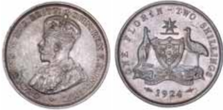
1514* George V, 1924. Matte obverse tone, reverse with considerable mint bloom, nearly uncirculated. $2,000