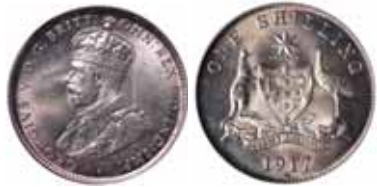
1538* George V, 1917M. Lightly toned, full original mint bloom, uncirculated.