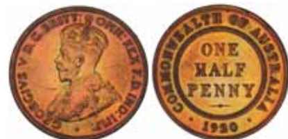
1628* George V, 1920. Cleaned but attractive nearly uncirculated. $200