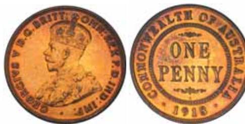
1598* George V, 1918I. Cleaned otherwise nearly uncirculated with virtually unmarked surfaces, rare thus. $750