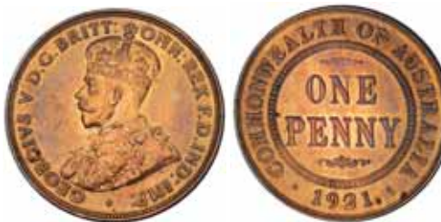
1601* George V, 1921 Indian die. Cleaned red and brown, nearly uncirculated. $250