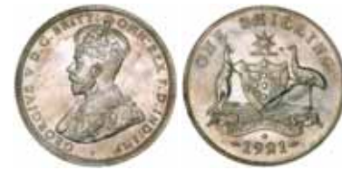
1542* George V, 1921 star. Die flash in front of forehead, full original mint bloom, choice uncirculated and very rare in this condition, one of the finest known.