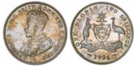
1515* George V, 1924. Golden tone, good extremely fine/nearly uncirculated. $1,200 Purchased from Spink Australia in 1977.