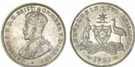
1517* George V, 1927. Nearly full original mint bloom, nearly uncirculated. $500