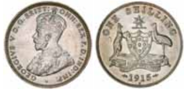
1536* George V, 1915H. Extremely fine and rare.