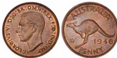
1617* George VI , 1946. Beautiful brown and red mint bloom, uncirculated and rare in this condition.