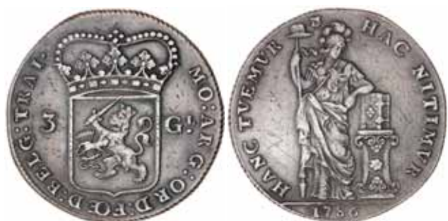
1310* Netherlands , Utrecht, three gulden, 1786 (KM.117). Good very fine.