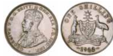
1543* George V, 1922. Heavily rubbed, otherwise uncirculated.