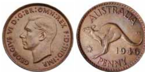
1618* George VI , 1946. Brown patina with some traces of mint red, minor reverse rim bruise at 9 o'clock, otherwise nearly uncirculated and rare in this condition.