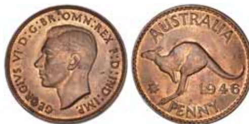
1619* George VI , 1946. Red and brown, nearly uncirculated and rare in this condition.