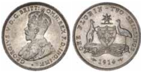
1503* George V, 1914. Reverse die break from emu's tail to last S good extremely fine/ nearly uncirculated.