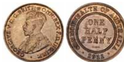
1620* George V , 1911. Partial mint red, good extremely fine.