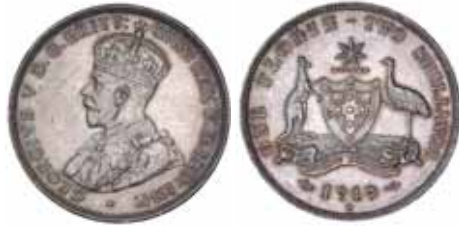
1509* George V, 1919M. Grey and golden red toned, good extremely fine/nearly uncirculated and rare in this condition. $3,000