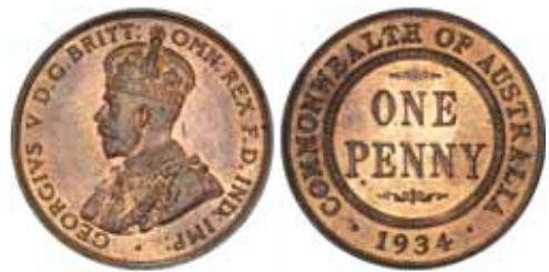
1613* George V , 1934. Small 3mm scratch behind King's head, almost full mint red, virtually uncirculated.