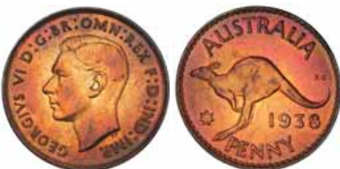
1614* George VI , 1938. Attractive red and lilac tone, uncirculated.