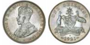
1541* George V, 1921 star. Lightly toned golden silver blue, well struck and unmarked, choice uncirculated and very rare in this condition, one of the finest known.