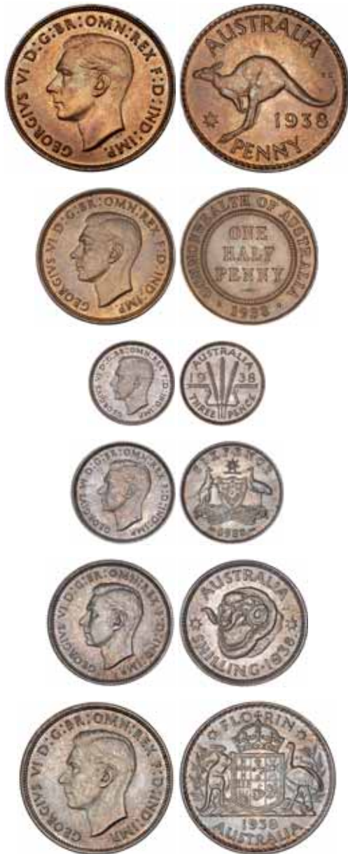
1494* George VI , year set, 1938, florin to halfpenny. Toned nearly uncirculated - uncirculated. (6)