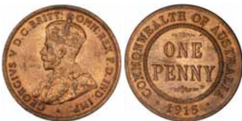
1596* George V, 1915. Nearly full original mint red, minute rim die cud on reverse at 2 o'clock, rare in this condition, one of the finest known. $6,000