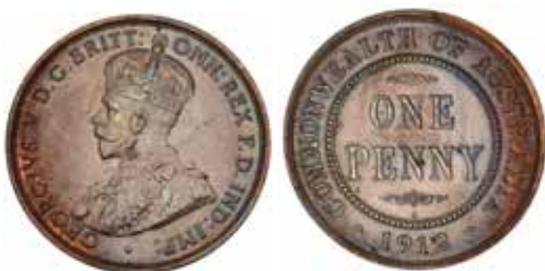
1594* George V, 1912H. Traces of red, full blue grey toned mint bloom, uncirculated. $300