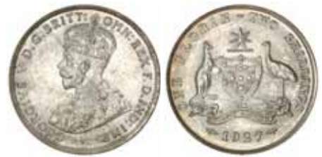
1516* George V, 1927. Full frosty mint bloom, lightly toned on the obverse, uncirculated. $750