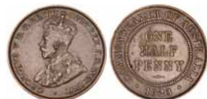
1630* George V, 1923. Good very fine. $4,000