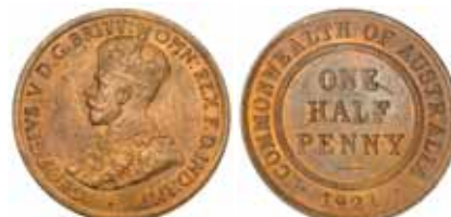
1629* George V, 1921. Approximately 75% mint red, soft strike on obverse, uncirculated. $150