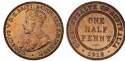
1626* George V, 1918I. Struck from clashed dies, cleaned of surface patina otherwise nearly uncirculated and attractive, rare in this state. $750