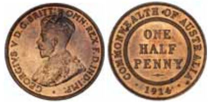
1623* George V, 1914. Partial light toning on obverse, otherwise full mint red, uncirculated. $750