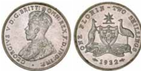
1521* George V, 1932. Some original mint bloom, nearly uncirculated and very rare in this condition. $7,500