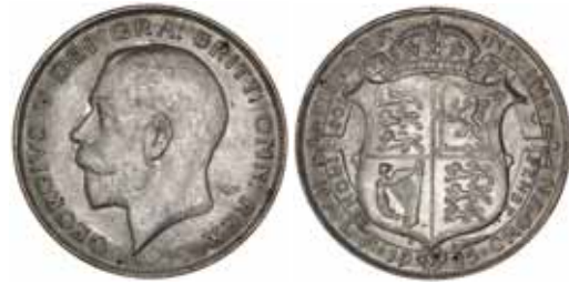
1800* George V , silver halfcrown, 1925 (S.4021). Subdued mint bloom, nearly uncirculated and rare in this condition.