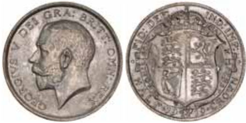
1795* George V , silver halfcrown, 1919 (S.4011). Obverse well struck, nearly uncirculated.