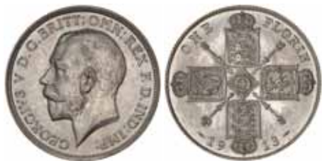
1797* George V , silver florin, 1913. Uncirculated.