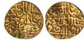
1866* Egypt , under Turkey, Ottoman Empire, Suleiman I ibn Selim (The Great and The Magnificent), (A.H. 926-974, A.D. 1520-1566), gold sultani (dinar), Misr (Egypt) mint, year 926, (A.1317, M.1252). Crinkled, very fine.