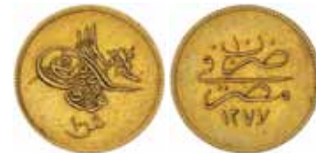
1867* Egypt , one hundred qirsh, AH1277/10 = 1869 (KM.263). Nearly extremely fine, scarce.