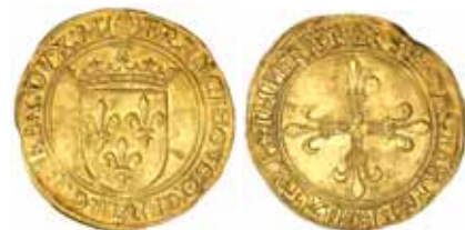
1869* France , Francis I, (1515-1547), ecu d'or au soleil, issue of 23 January 1515, (head of St.Ambroise in brackets, Milan mint) (issued from 1515-1522), (3.41 grams), obv. +FRANCISCVS O G FRANCOR REX OVX M, crowned arms with sun above, rev. Cross with extremities as lis, around. +XPS VINCIT XPS REGNET XPS IMPERAT, (Lafaurie 634* [Pl.XXXI illustrated]; CNI 3 [p.221, Pl.XII, 9], Duplessy 957, Ciani 1217, cf.Friedberg 340). Good very fine or better and rare.