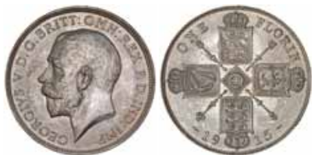
1798* George V , silver florin, 1915 (S.4012). Uncirculated.