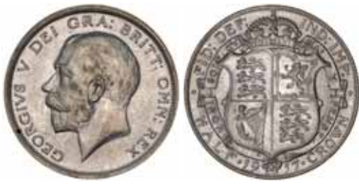
1794* George V , silver halfcrown, 1917 (S.4011). Nearly uncirculated/uncirculated.