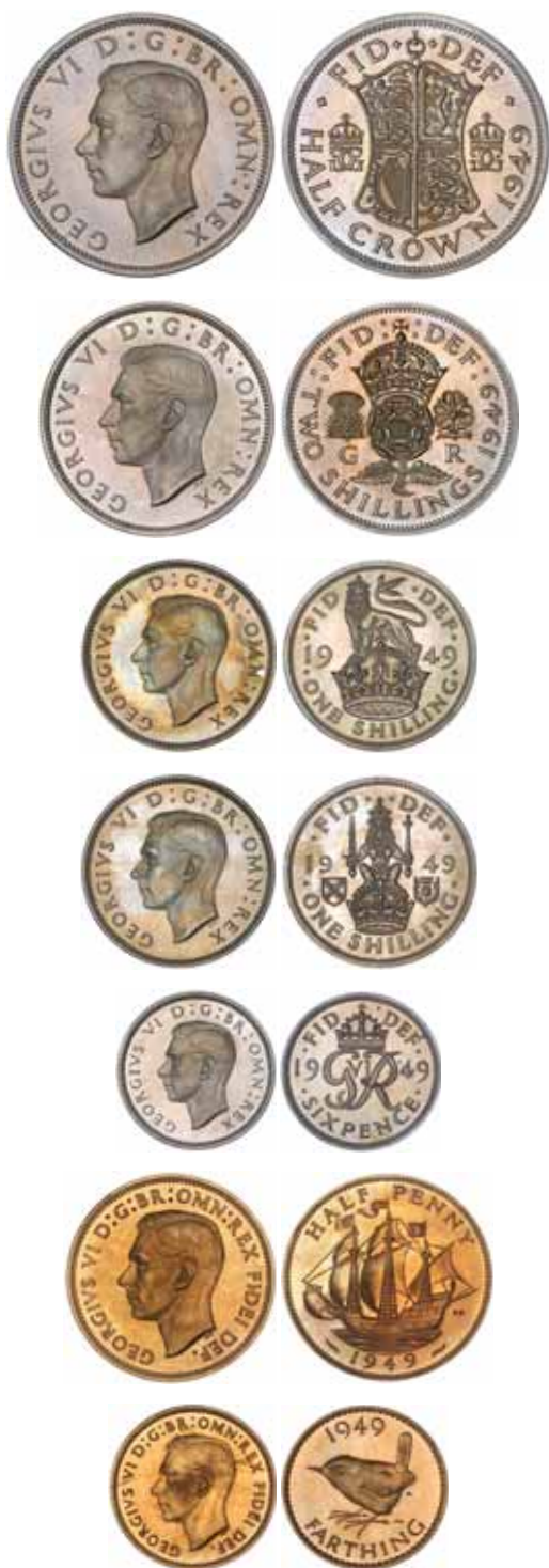
1811* George VI , proof farthing, halfpenny, sixpence, shilling (E), shilling (S), florin and halfcrown, 1949 (KM.867, 868, 875, 876, 877, 878, 879). Light toning, FDC and rare. (7) $2,500