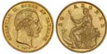
1860* Denmark , Christian IX, twenty kroner, 1873 (KM.791.1). Nearly uncirculated.