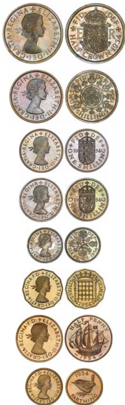
1813* Elizabeth II , proof set, 1954, farthing, halfpenny, threepence, sixpence, shilling (2) English and Scottish, florin, halfcrown, unlisted in Spink. Toned, nearly FDC - FDC and very rare. (8) $2,000