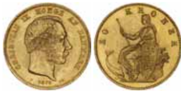
1859* Denmark , Christian IX, twenty kroner, 1873 (KM.791.1). Uncirculated.