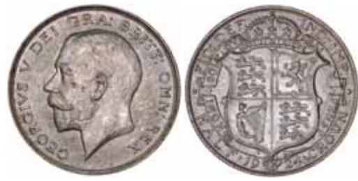
1799* George V , silver halfcrown 1924 (S.4021A). Uncirculated.