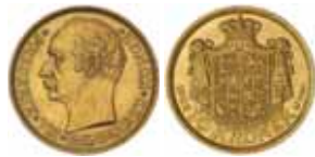
1861* Denmark , Frederick VIII, ten kroner, 1909 (KM.809). Nearly uncirculated.