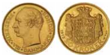
1863* Denmark , Frederik VIII, twenty kroner, 1912 (KM.810). Nearly uncirculated.