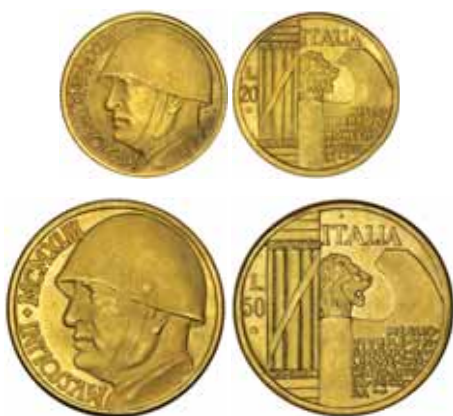
lot 1889 part

Italy , Vittorio Emanuele III, (1909-1946), gold fifty lire, 1931, year IX, (KM.71). Good extremely fine. $400