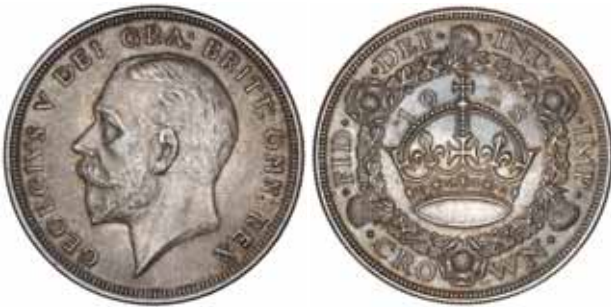
1806* George V , wreath type crown, 1928 (SW.4036). Toned good extremely fine.