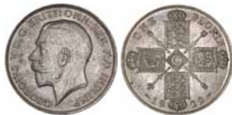
1803* George V , silver florins, 1922 and 1926 (S.4022A). Subdued mint bloom, uncirculated. (2)