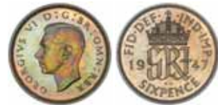
1810* George VI , second coinage, cupro-nickel proof set, 1947, sixpence, shilling (E) shilling (S), florin, halfcrown (S.4102-4105). Lightly toned, fingerprint on obverse of florin, otherwise nearly FDC and very rare. (5)