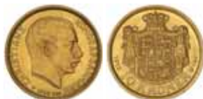
1864* Denmark , Christian X, ten kroner, 1913 (KM.816). Uncirculated.