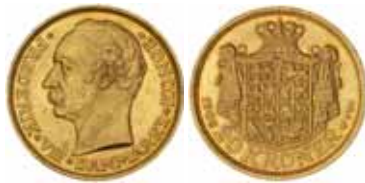
1862* Denmark , Frederick VIII, twenty kroner, 1908 (KM.810). Nearly uncirculated.