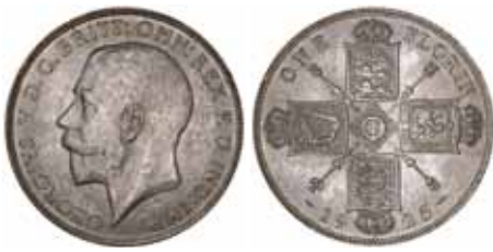
1804* George V , florin, 1925 (S.4022A). Uncirculated and rare in this condition.