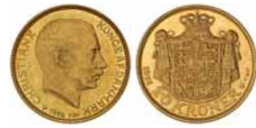
1865* Denmark , Christian X, twenty kroner, 1914 (KM.817.1). Nearly uncirculated.