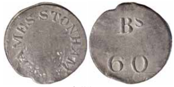
lot 3976 part

Ex W.J. Noble Collection, Sale 61B (lot 500) and previously a set of H.430 (iii) from Seaby in 1975, the others ex Glendining's Sale in 1967.