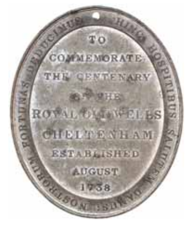
lot 3996 reverse

Ex W.J. Noble Collection, Sale 61B (lot 758) previously Tatton Collection (28 August 1924) and from Baldwin in 1992.