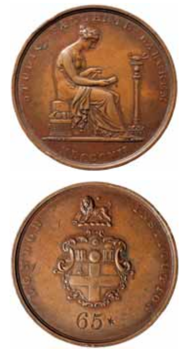
lot 4029 part

Ex W.J. Noble Collection, Sale 61B (lot 908) previously the first from Schwer in 1984, the second from Baldwin in 1989.