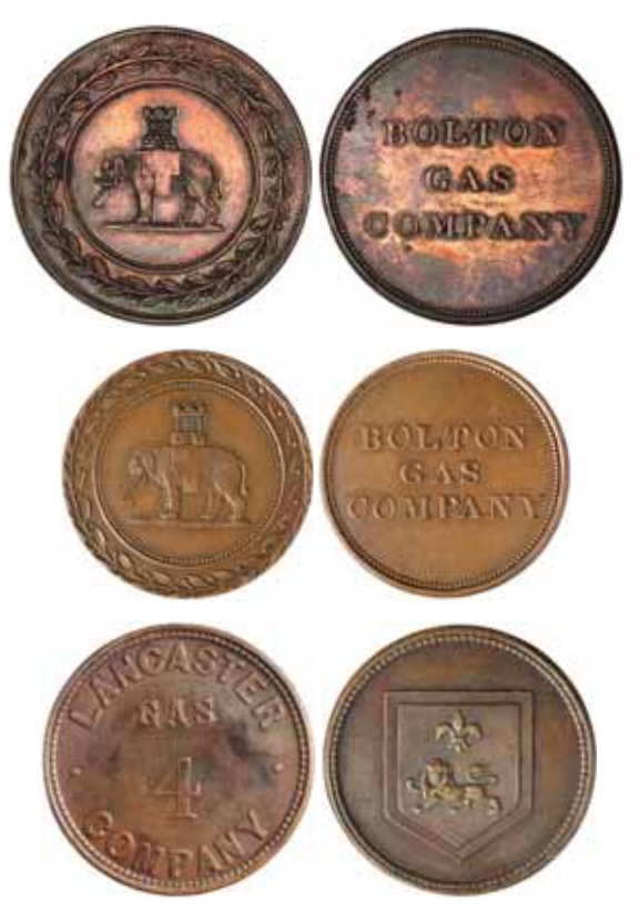
lot 4061 part