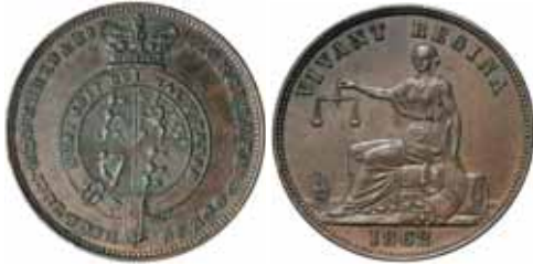
763* De Carle, E. & Co. , Dunedin penny, 1862 (A.102). Chocolate tone, extremely fine and rare thus.