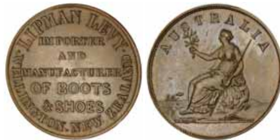
768* Levy, Lipman , Wellington, Australia seated figure mule penny, undated (A.324). Glossy blue and red brown uncirculated and rare.