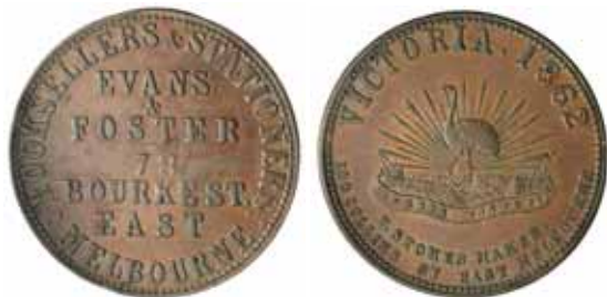
765* Evans & Foster , Melbourne penny, 1862 (A.119). Light to medium brown patina, good very fine and rare.