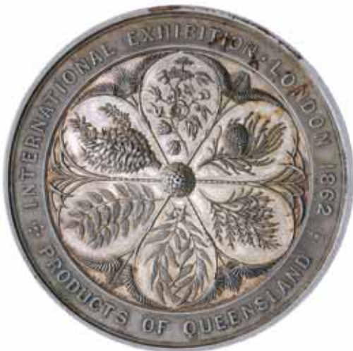
647* International Exhibition London, 1862 , Products of Queensland, in silver (64mm) by J.S. & A.B. Wyon. Extremely fine and rare.