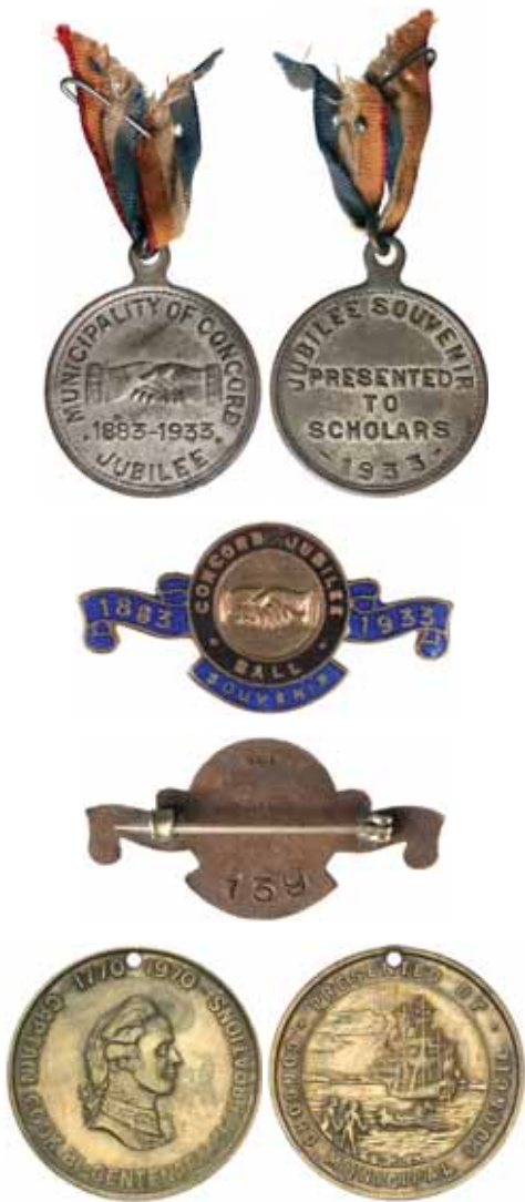
685* Municipality of Concord Jubilee, 1833-1933 (C.1933/2), bronze silvered (26mm); metal badge, black and blue enamel (43mm x 22mm) 'Concord Jubilee Ball Souvenir 1833-1933' by Rider; Captain Cook bi-centenary celebrations 1770-1970, 'Presented by Concord Municipal Council' (C.1970/9). Very fine - extremely fine, the first two rare. (3)