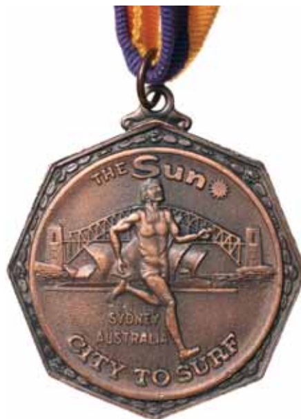
Lot 753 part