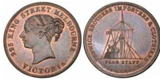
766* Fenwick Brothers , Melbourne penny, undated (A.121). Red and brown, nearly uncirculated, probably the finest known.