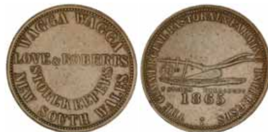
770* Love & Roberts , Wagga Wagga penny, 1865 (A.335). Red brown patina, very fine and rare.