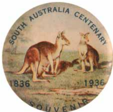
686* South Australian Centenary, 1936 , souvenir tin badge with mirror back (57mm), obverse with scene in colour of two kangaroos in a field, with inscription around scene 'South Australian Centenary, 1836-1936 Souvenir'. Extremely fine and rare, especially this large.