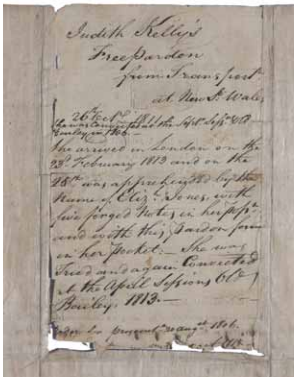
detail of back