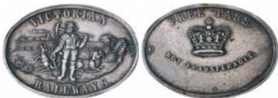
648* Victorian Railways, Free Pass , c.1860s, in silver (36mm x 25mm oval) unscripted on reverse, without hole punched through at side. Good very fine and rare.