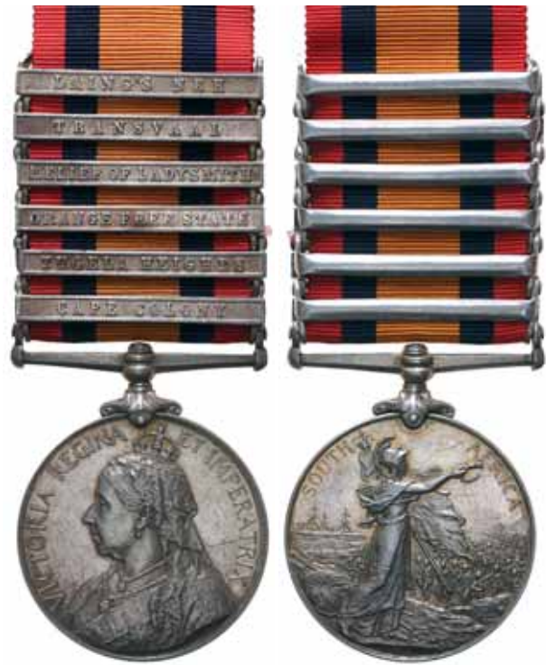
4281* Queen's South Africa Medal 1899 , six clasps - Cape Colony, Tugela Heights, Orange Free State, Relief of Ladysmith, Transvaal, Laing's Nek. 9226 Pte W. Purdie. Th' Crofts M.I. Impressed. Extremely fine. $200