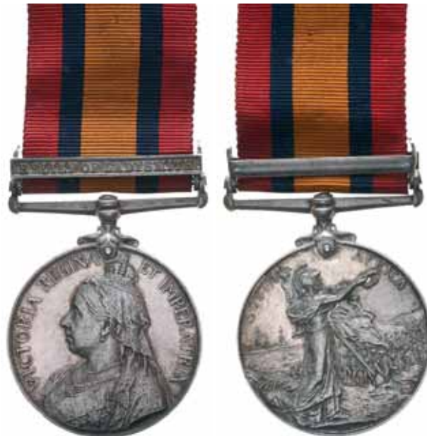
4282* Queen's South Africa Medal 1899 , - clasp - Relief of Ladysmith. 3751 Pte T. Prosser Devon. Regt. Impressed. Obverse with edge bruise at 7 o'clock, good very fine. $450

3751 Pte T. Prosser KIA 15 Dec 1899 Colenzo.