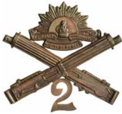
4395* A.I.F., 2nd Machine Gun Company, hat badge in brass (47mm), struck (not cast as usual). Uncirculated and rare. $500