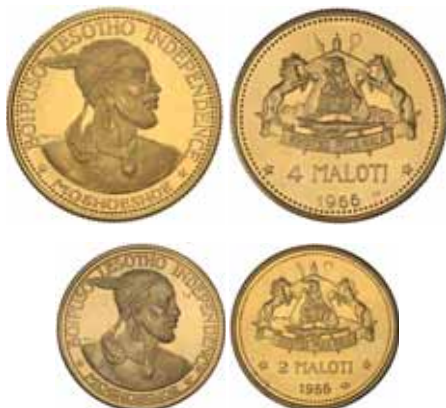
Lot 5156 part