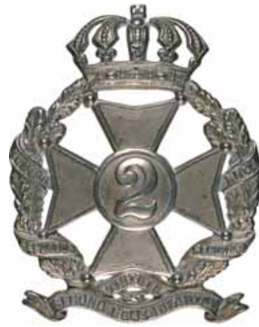
4380* 2nd Regiment New South Wales Volunteer Infantry , c.1890s, first pattern hat badge in white metal (61mm) (Grebert p24). Good very fine.