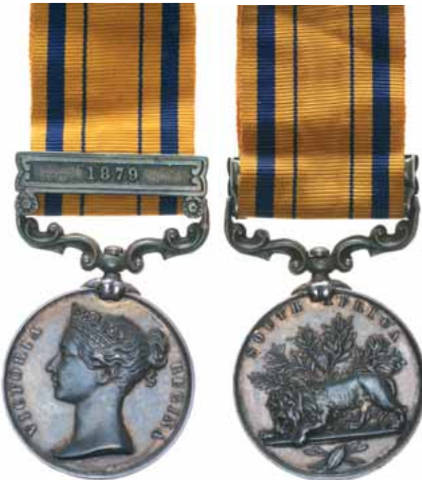
4280* South Africa Medal 1879 , - clasp - 1879, 918. Pte. T.J. Wright. 99th Foot, impressed. Very fine. $400