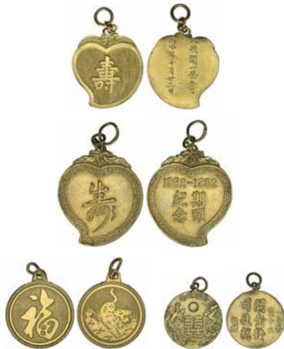
Lot 4257 part