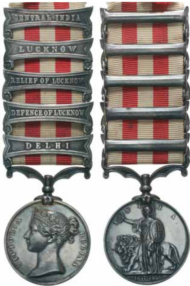
4279* Indian Mutiny Medal 1857-58 , five clasps - Delhi, Defence of Lucknow, Relief of Lucknow, Lucknow, Central India. Unnamed specimen issue. Light hairlines, extremely fine. $250