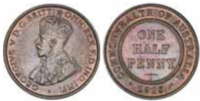
2085* George V, 1918I. Good very fine with some old red. $250