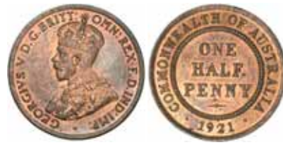
2090* George V, 1921. Red and brown, uncirculated. $250