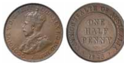
2093* George V, 1923. Peripheral die crack on first part of GEORGIVS, two small edge nicks, cleaned, good fine. $1,200