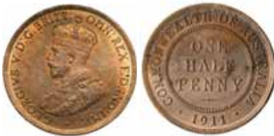
2076* George V , 1911. Toned, red and brown uncirculated. $200 Ex Pat Boland Collection.