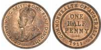
2075* George V , 1911. Considerable original mint red, uncirculated. $230 Ex McHugh Collection.