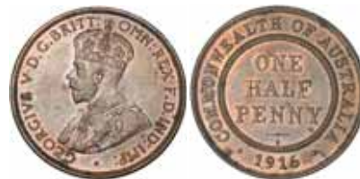
2084* George V , 1916I. Brown with some mint red, nearly uncirculated. $100 Ex McHugh Collection.