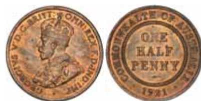
2091* George V, 1921. Mostly red on the obverse, uncirculated. $180