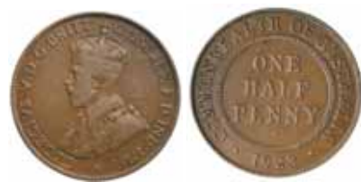
2094* George V, 1923. With diagnostic peripheral die break on both obverse and reverse, very good/fine. $1,000