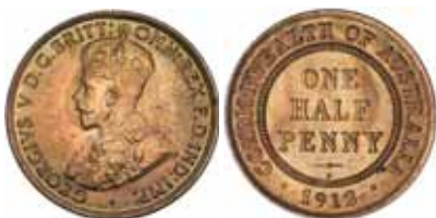
2078* George V , 1912H. Olive red mint bloom, uncirculated. $400