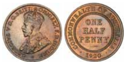
2089* George V, 1920. Red and brown, nearly uncirculated. $280