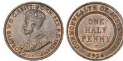
2081* George V , 1914. Much mint red, good extremely fine. $200