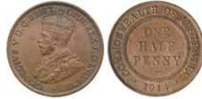
2080* George V , 1914. Brown with traces of red on reverse, good extremely fine. $300 Ex Cornwall Collection.