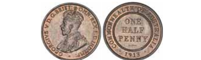
2077* George V , 1911 and 1913. Brown and red, nearly uncirculated. (2) $100 Ex Cornwall Collection.