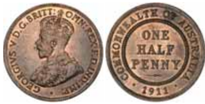
2074* George V , 1911. Glossy brown and red uncirculated. $250