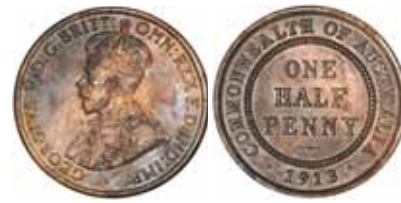
2079* George V , 1913. Toned, good extremely fine with underlying mint bloom. $250