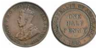
2092* George V, 1923. Diagnostic peripheral die breaks both sides, even brown patina, very good. $1,500