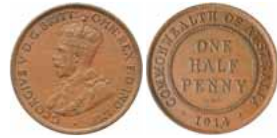
2082* George V , 1914. Even brown patina, good extremely fine. $150 Ex McHugh Collection.