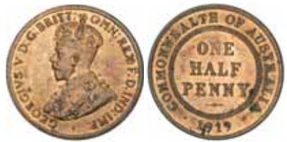
2086* George V, 1919. Carbon spots, considerable mint red, nearly uncirculated. $120