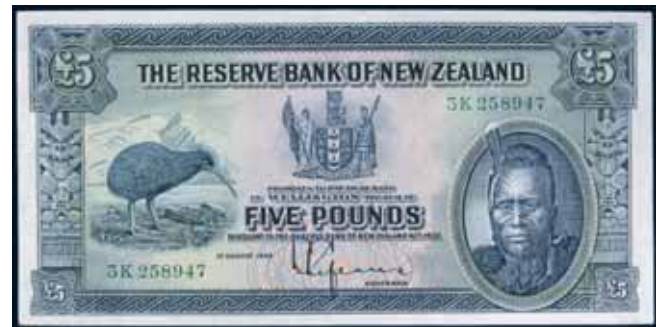
2323* L. Lefeaux , five pounds, 1st August 1934, number letter, 3K 258947 (Robb.R.142; L.605; P.156). Good extremely fine and rare in this condition. $1,500

Ex W.H. Lampard Collection, Noble Numismatics Sale 78 (lot 3167).