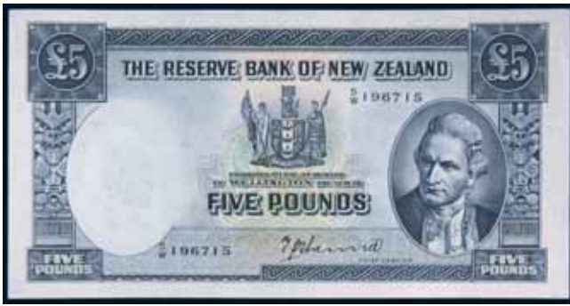
2344* T.P. Hanna (1940-55) , five pounds, number over letter, 5/W 196715 (Robb.R.241b; L.614; P.160a). Nearly uncirculated.