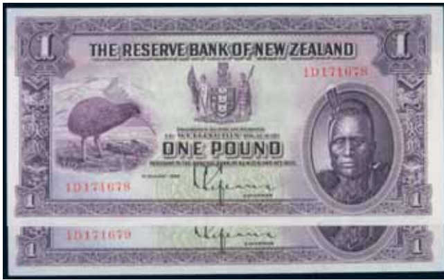
2319* L. Lefeaux , one pound, 1st August 1934, number letter, 1D 171678/9 consecutive pair (Robb.R.122; L.604; P155). Nearly uncirculated and very rare, especially as a pair. (2) $4,000