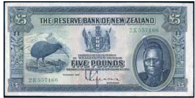
2322* L. Lefeaux , five pounds, 1st August 1934, number letter, 2K 557166 (Robb.R.142; L.605; P.156). Very fine or better. $500