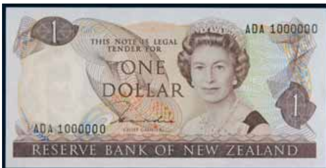
2462* H.R. Hardie (1981-85) , type II, one dollar, three letters, ADA 1000000 (Robb.R.412; P.169a). Uncirculated and a very rare one million serial number.