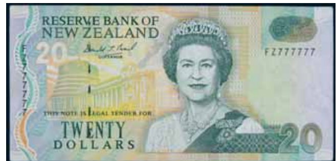
2467* D.T. Brash (1994-99) , type III, modified reverse, twenty dollars, letter letter, FZ 777777 (Robb.R.553; P.183). Very fine and a rare solid number.