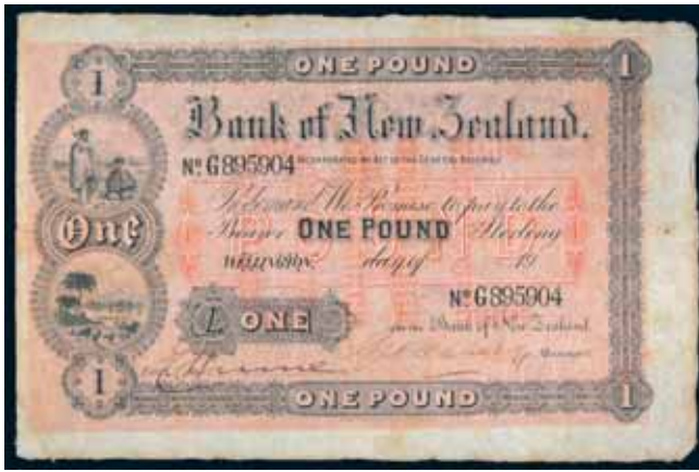
2248* Bank of New Zealand , sixth issue, one pound, Wellington, c1902-16 (date faded), No. G895904, booklet issue, imprint of Bradbury, Wilkinson & Co Engravers & c London (Robb. D.621; L.455; P.S212). Pin holes and an expert repair to cut near top, otherwise nearly fine and scarce.