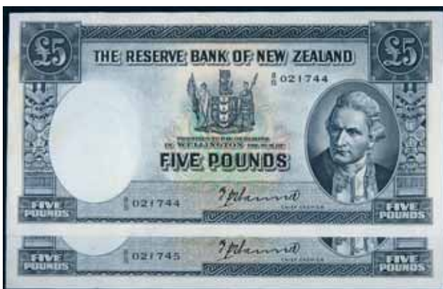
2339* T.P. Hanna (1940-55) , five pounds, number over letter, 8/S 021744/5 consecutive pair (Robb.R.241b; L.614; P.160a). Extremely fine. (2)