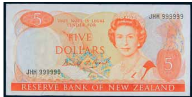
2466* D.T. Brash (1989-91) , type I, five dollars, three letters, JHH 999999 (Robb.R.435; P.171c). Very fine and a very scarce solid number.