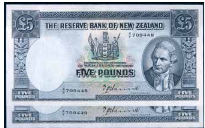
2342* T.P. Hanna (1940-55) , five pounds, number over letter, 4/V 709448/9 consecutive pair (Robb.R.241b; L.614; P.160a). Extremely fine. (2)