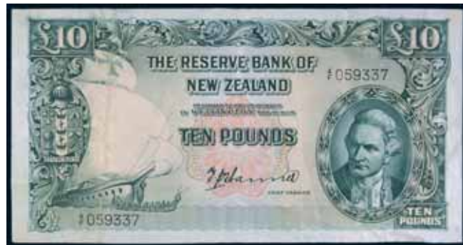
2350* T.P. Hanna (1940-55) , ten pounds, number over letter, 4/F 059337, last prefix (Robb.R.251; L.615; P.161a). Heavy creases and folds, still crisp, fine and very rare, less than ten known.