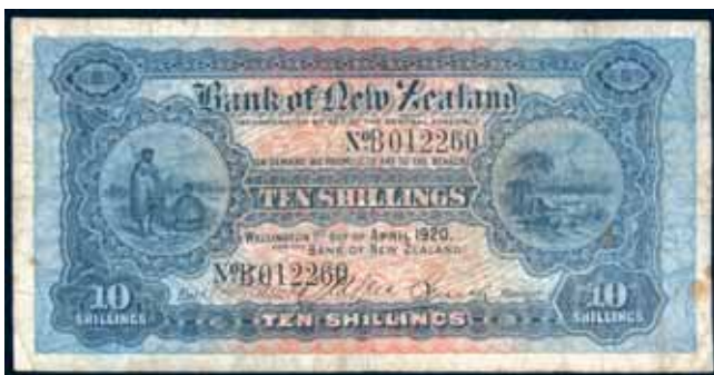
2250* Bank of New Zealand , seventh issue, ten shillings, Wellington, 1st April 1920, No. B 012260, words and figures omitted from back, imprint of Bradbury Wilkinson & Co. Ld. London (Robb.D.711d; L.458; P.S224). Toning spots bottom right edge, otherwise very good.