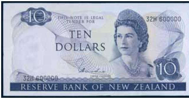
2460* H.R. Hardie (1977-81) , type I, ten dollars, number number letter, 32H 600000 (Robb.R.349a; L.673; P.166d). Uncirculated, a rare round number.