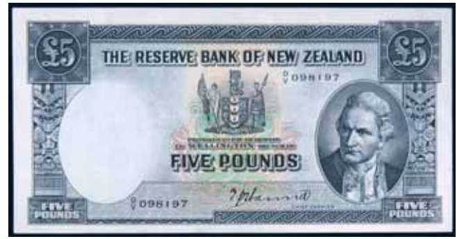
2340* T.P. Hanna (1940-55) , five pounds, number over letter, 0/V 098197 (Robb.R.241b; L.614; P.160a). Good extremely fine.