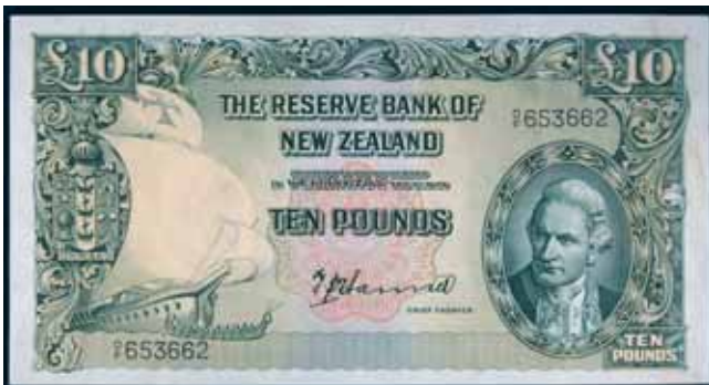
2346* T.P. Hanna (1940-55) , ten pounds, number over letter, 0/F 653662, first serial prefix (Robb.R.251; L.615; P.161a). Good very fine.