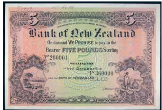
2252* Bank of New Zealand , seventh issue, specimen five pounds, Wellington, 1st October 1918, discordant serials No.260001 and No.360000, imprint of Bradbury Wilkinson & Co. Ld. London, printed date, text and figures on back, CANCELLED perforated at bottom, '0/3490 15.5.18' written in pen at top (Robb.D.471; L.461; P.S227). Nearly uncirculated and rare.

Ex Noble Numismatics Sale 80 (lot 3026).