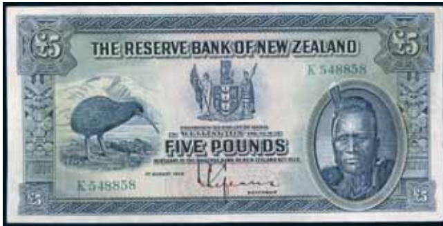
2320* L. Lefeaux , five pounds, 1st August 1934, letter only, K 548858 (Robb.R.141; L.605; P.156). Nearly very fine. $550

Ex W.H. Lampard Collection, Noble Numismatics Sale 78 (lot 3167).