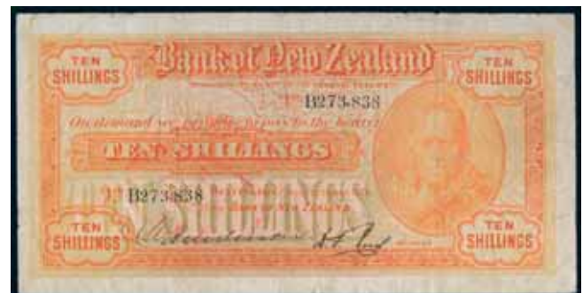
2253* Bank of New Zealand , uniform issue, ten shillings, Wellington, 1st October 1928, No. B273,838, £1/2 omitted from corners, imprint of Bradbury Wilkinson & Co Ld, New Malden, Surrey (Robb.D.811c; L.466; P.S232a). Bank stamp on back, very good.

Ex Noble Numismatics Sale 80 (lot 3027).