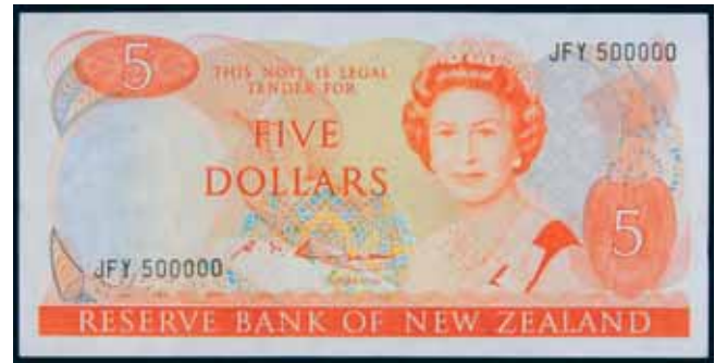
2465* S.T. Russell (1985-89) , five dollars, three letters, JFY 500000 (Robb.R.433; P.171b). Extremely fine and a scarce round number.