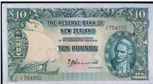
2347* T.P. Hanna (1940-55) , ten pounds, number over letter, 1/F 754552, (Robb.R.251; L.615; P.161a). Good very fine.