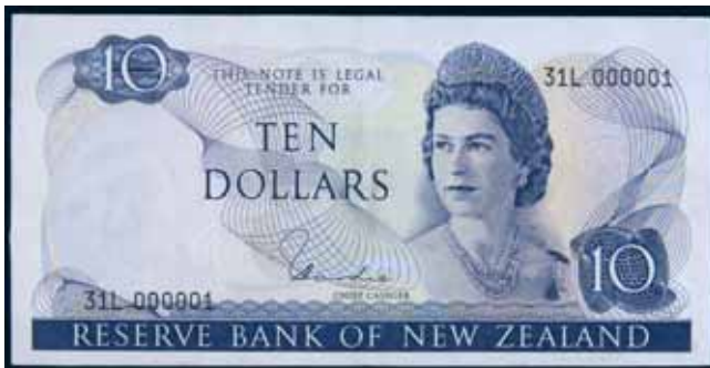
2461* H.R. Hardie (1977-81) , type I, ten dollars, number number letter, 31L 000001 (Robb.R.349a; L.673; P.166d). Nearly uncirculated, a rare number one serial number.