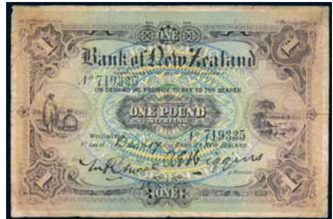
2251* Bank of New Zealand , seventh issue, one pound, Wellington, 1st Dec 1917, No. 719335, imprint of Bradbury Wilkinson & Co, Engravers, London, plain edge, written date (Robb. D.721b; L.459; P.S225). Many folds and creases, very good.