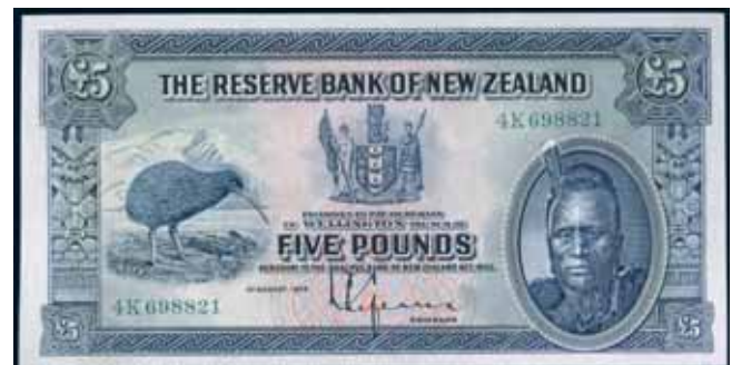
2325* L. Lefeaux , five pounds, 1st August 1934, number letter, 4K 698821 (Robb.R.142; L.605; P.156). Good extremely fine and rare in this condition. $1,500