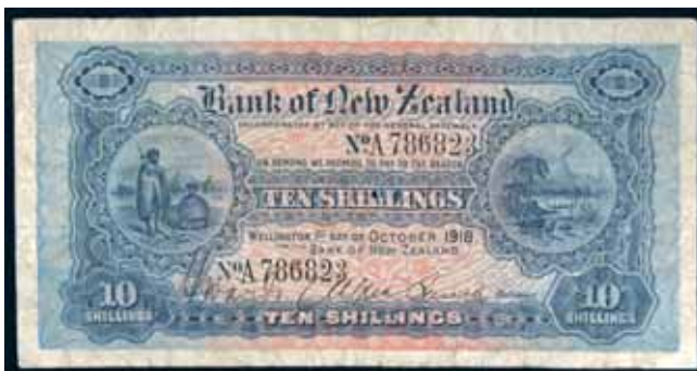
2249* Bank of New Zealand , seventh issue, ten shillings, Wellington, 1st October 1918, No. A786823, '10 Shillings' omitted from top corners, imprint of Bradbury Wilkinson & Co. Ld. London (Robb.D711c; L.456; P.S223). Hole in centre, many creases, otherwise very good with good colour.