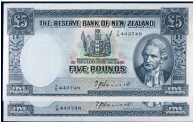
2338* T.P. Hanna (1940-55) , five pounds, number over letter, 7/S 443748/9 consecutive pair (Robb.R.241b; L.614; P.160a). Nearly uncirculated. (2)