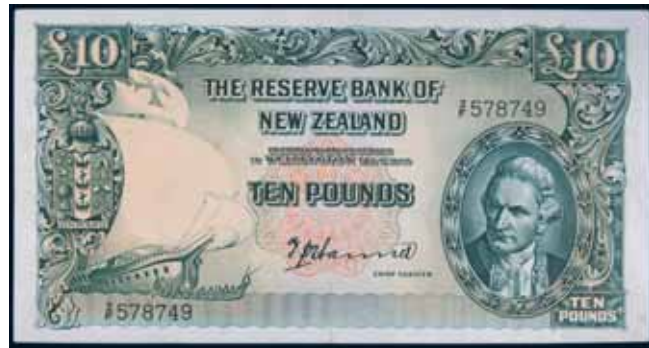
2348* T.P. Hanna (1940-55) , ten pounds, number over letter, 2/F 578749, (Robb.R.251; L.615; P.161a). Nearly extremely fine.

Ex W.H. Lampard Collection, Noble Numismatics Sale 78B.