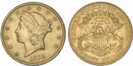
3553* USA , twenty dollars or double eagle, 1904, Liberty head. Good extremely fine.