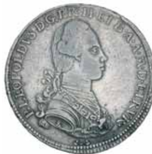
3708* Italy , Tuscany, Pietro Leopoldo (1765-1790), silver francescone or ten paoli, 1778 (KM.C.24.2). Very fine.