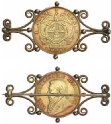
3508* South Africa , ZAR, pond, 1892, single shaft (KM.10.2). Set in ornate gold scroll brooch mounting, lightly polished, very fine and rare.