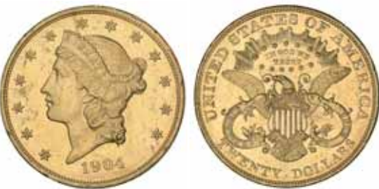
3552* USA , twenty dollars or double eagle, 1904, Liberty head. Proof-like fields, scuff marks, otherwise nearly uncirculated.