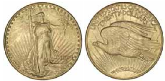
3559* USA , twenty dollars or double eagle, 1924, St.Gaudens. Considerable original mint bloom, uncirculated.