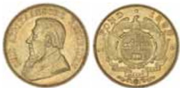
3511* South Africa , ZAR, pond, 1898 (KM.10.2). Nearly uncirculated.