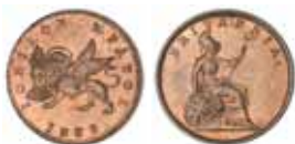
3702* Ionian Islands , one lepton, 1862 (KM.34). Red uncirculated.