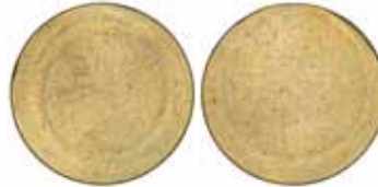
3515* South Africa , ZAR, rimless blank pond (7.5g). Polished, otherwise fine.