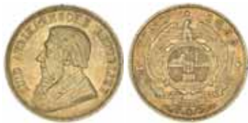
3509* South Africa , ZAR, pond, 1893 (KM.10.2). Very fine.