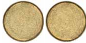
3514* South Africa , ZAR, rimmed blank pond (7.97g). Nearly extremely fine and rare in this state.

Probably a souvenir of a returning Boer War soldier.