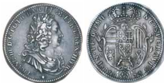
3707* Italy , Tuscany, Francis III, half francescone, 1740 (KM.C6). Toned, very fine.