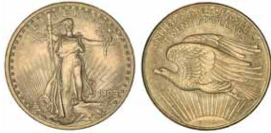
3556* USA , twenty dollars or double eagle, 1908, St.Gaudens, without motto. Nearly uncirculated.