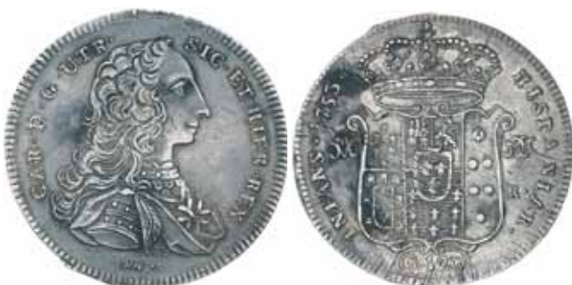
3705* Italy , Naples and Sicily, Carlos III, piastra of 120 grana, 1753 (KM.C25). Toned, very fine.