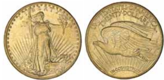
3557* USA , twenty dollars or double eagle, 1911S, St.Gaudens. Nearly uncirculated.