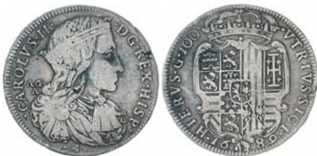
3704* Italy , Naples and Sicily, Charles II, silver ducato, 1689 AG/A (KM.115). Nearly fine.