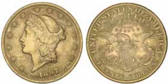
3551* USA , twenty dollars or double eagle, 1897, Liberty head. Extremely fine.