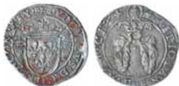
3703* Italy , Milan, Louis XII of Orleans as King of France, (1500-1512), silver grosso of three soldi, (2.16g), undated, obv. crowned shield of France, around LVDOVICVS D G FRANCORVM REX, rev. knotted veil, around MEDIOLANI DVX ET CIET, (CNI.96, pg.213). Irregular flan with some hoard patination, otherwise toned, very fine and very rare.