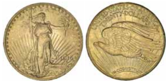
3558* USA , twenty dollars or double eagle, 1916S, St.Gaudens. A few reverse edge nicks, otherwise nearly uncirculated.