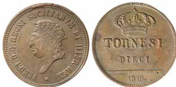
3706* Italy , Naples and Sicily, Ferdinand IV ten tornesi 1819 (32.35g) (KM.C.123). Extremely fine and rare in this condition.