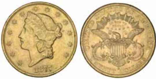
3549* USA , twenty dollars or double eagle, 1877S, Liberty head. Nearly extremely fine.