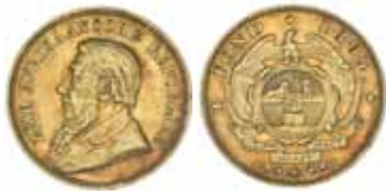
3510* South Africa , ZAR, pond, 1894 (KM.10.2). Toned, good very fine.