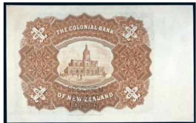
2022* The Colonial Bank of New Zealand , second issue, printer's specimen, one pound, Dunedin, dated 1 March 18., discordant serial numbers S/Z 440001 - S/Z 465000, with counterfoil, printed both sides, imprint of Bradbury, Wilkinson & Co. Engravers London, perforated Cancelled lower right, Specimen, B.W. & Co London in three lines, (L.559; P.S267s; Robb G.22). Good extremely fine and very rare.