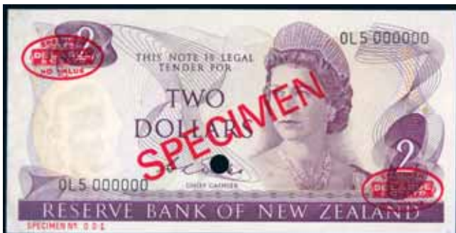
2116* Reserve Bank of New Zealand, D.L.Wilks (1968-75), specimen two dollars, 0L5 000000, SPECIMEN in red diagonally and de la Rue red specimen lozenges top left and bottom right corners, front and back, one punch hole cancellation at bottom, SPECIMEN No. 001 in bottom margin (P.164s). Uncirculated and very rare.