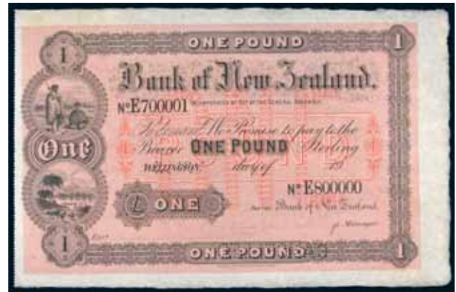
2057* Bank of New Zealand , sixth issue, printer's specimen, one pound, Wellington, not dated 19.., discordant serial numbers E700001 - E800000, at top on face, printed both sides, imprint of Bradbury, Wilkinson & Co. Engravers & c. London, perforated 'Cancelled' lower centre, (L.455; P.S212s; Robb D.721). Good extremely fine, pin holes and very rare.