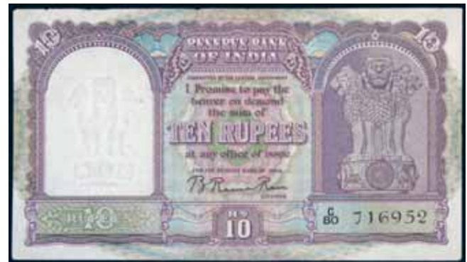
2286* India , Reserve Bank of India, ten rupees, signature B.Rama Rau (1950), C/80 716952 (P.37a; Jhun.4.1.2). Staple holes at left, uneven top edge, flat, very fine.