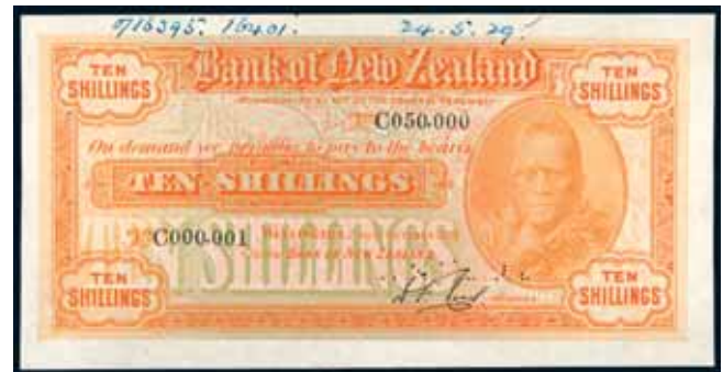
2058* Bank of New Zealand , uniform issue, specimen ten shillings, printed both sides, Wellington, 1 October 1929, dicordant numbers No. C000,001 -C050,000, uniform issue, perforated CANCELLED, on top margin o/ 16395 16401 24.5.29 (L.466; P.S232; Robb D.811). About uncirculated, very rare.