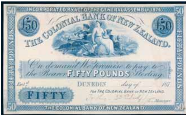
2020* The Colonial Bank of New Zealand , second issue, specimen fifty pounds, Dunedin, undated 187-, not numbered, imprint Perkins Bacon & Co. London, blue on white, (P.S266 [domicile unlisted]; Robb G.17), with 'To this 23rd July/ 75' in pencil in signature reserve. Tipping marks on back, one heavy fold, otherwise nearly extremely fine and extremely rare.