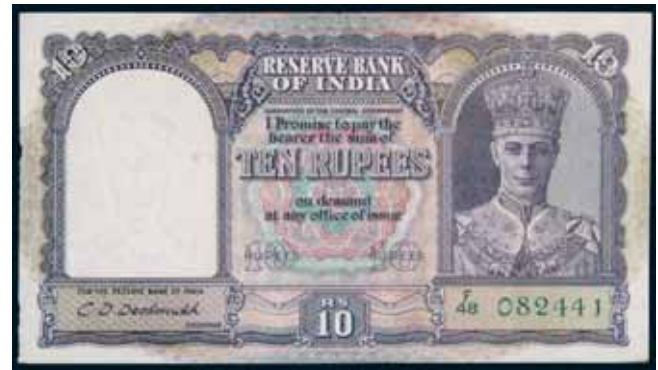
2285* India , Reserve Bank of India, George VI, ten rupees, signature C.D.Deshmukh, undated (issued 1944), F/48 082441 (P.24; Jhun.6.1). Staple holes at left, uneven left margin, otherwise good extremely fine.