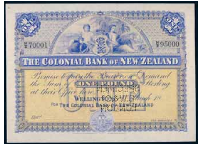
2021* The Colonial Bank of New Zealand , second issue, specimen one pound, Wellington, dated 1st March 18... N/Z 70001-N/Z 95000, imprint of Bradbury Wilkinson & Co, engravers, London, perforated Specimen BW & Co London in three lines, (Robb.G.22; L.558; P.S267e). Nearly uncirculated and very rare.