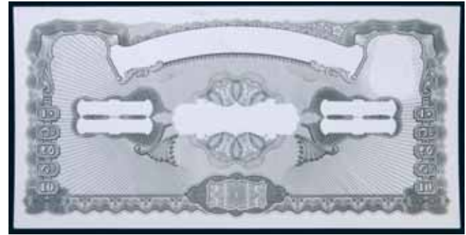
lot 2292 part