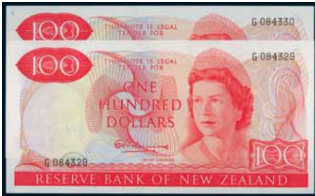
2113* Reserve Bank of New Zealand, R.N.Fleming (1967-68), one hundred dollars, G 084329/30 (P.168a) consecutive pair. Uncirculated. (2)