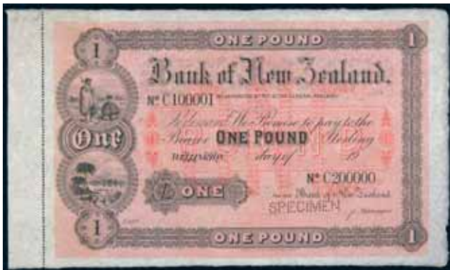
2056* Bank of New Zealand , sixth issue, specimen one pound, Wellington 19- ,No C100001/C200000, pencilled on butt 15.5.06 by the printer, perforated SPECIMEN, imprint Bradbury Wilkinson & Co Engravers & C London (P.S212s). Perforated left, butt margin intact, good extremely fine.