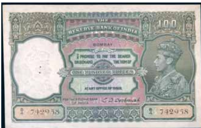
2284* India , The Reserve Bank of India, George VI, one hundred rupees, signature C.D.Deshmukh, undated (issued 1943), Bombay, B/4 742958, watermark profile head (P.20b; Jhun.7.2A). Two staple holes and spindle hole at left, extremely fine.