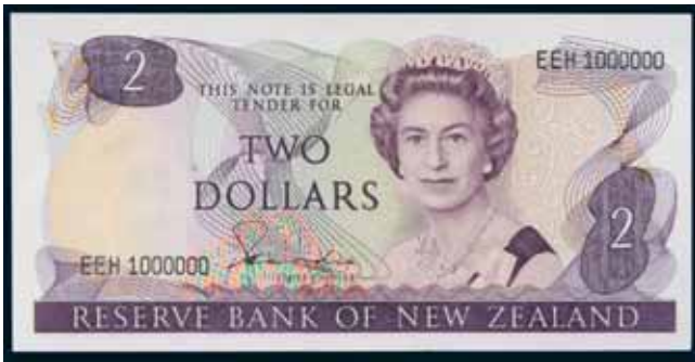
2144* Reserve Bank of New Zealand , H.R.Hardie (1981-85), type II, two dollars, EEH 1000000 (P.170a). Uncirculated and very rare one million serial number.