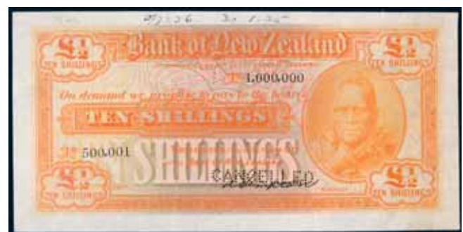
2059* Bank of New Zealand , uniform issue, printer's proof-specimen note, printed both sides in orange/multicoloured, ten shillings, Wellington, 1st October 1924, numbered 500,001 - 1,000,000 perforated Cancelled in signature area, on edge above in ink o/7236 30.1.25, and 72/36 (L.465; P.S232; Robb D.811). Good extremely fine and very rare.