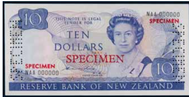
2149* Reserve Bank of New Zealand , H.R.Hardie (1981-85), type II, specimen ten dollars, NAA 000000, first serial prefix, large SPECIMEN in red above signature and in smaller letters below top serial number and above bottom serial number, SPECIMEN perforated at both ends of note (P.172a). Virtually uncirculated and rare.