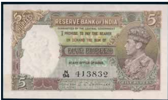
2283* India , Reserve Bank of India, George VI, five rupees, undated (issued 1944), signature Deshmukh, N/94 413832 (P.18b; Jhun.3.2). Staple holes at left, extremely fine.