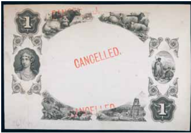
2055* Bank of New Zealand , fourth issue, proof of vignettes (as for pound issue 1888-1898), printed on card on one side only, date on edge in pencil 26/1/87, with CANCELLED overprinted three times on face (cfP.S202p; Robb D.42p). Minor paper toning, otherwise extremely fine.