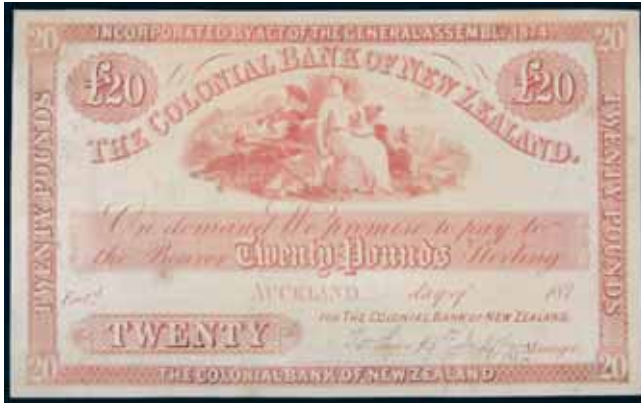
2019* The Colonial Bank of New Zealand , first issue, proof uniface twenty pounds, Auckland .... 187., imprint of Perkins Bacon & Co, London, in pencil 'To This 19th July /75', (L.-; Robb G.16; P.S265a). Glue stains in corners on back, otherwise extremely fine and rare.