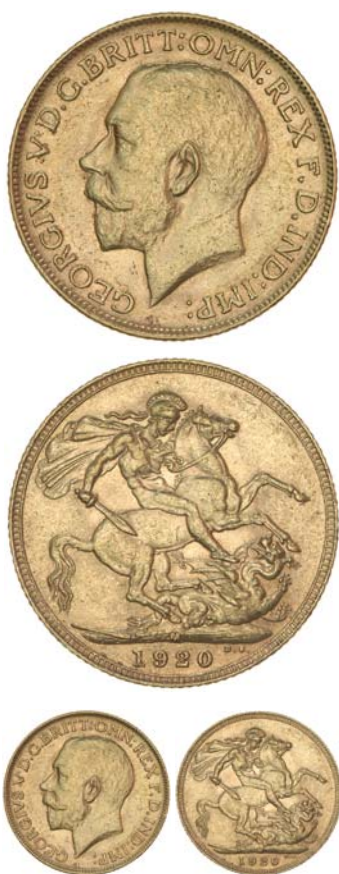
1344* George V, 1920 Melbourne. Good extremely fine and rare. $6,000

Ex Tony Baker Collection (private purchase from KJC in 2005).