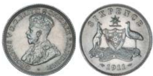
1528* George V, 1911. Well struck, uncirculated.