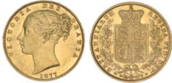
1297* Queen Victoria, 1877 Sydney. Nearly uncirculated.