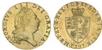
1222 Great Britain , George III, half guinea, fifth bust or spade type, 1797 (S.3735). Nearly uncirculated . $500 Ex Jon Saxton Collection.