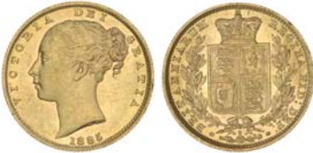
1307* Queen Victoria , 1885 Sydney. Original frosty mint bloom, uncirculated. $1,000