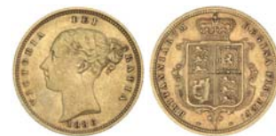
1369* Queen Victoria , 1886 Sydney. Very fine.