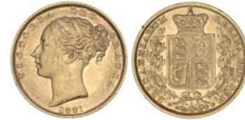
1302* Queen Victoria, 1881 Sydney. Die break through 1 of date and along truncation, nearly extremely fine/extremely fine.