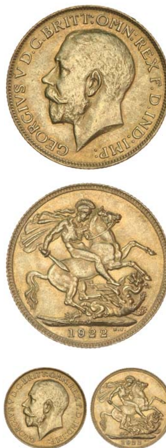
1346* George V, 1922 Melbourne. Good extremely fine and very rare. $15,000

Ex Tony Baker Collection (private purchase from KJC in 2005).