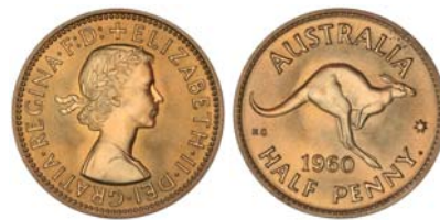
1436* Elizabeth II , Perth Mint proof halfpenny, 1960. Full red, FDC.