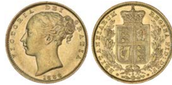
1309* Queen Victoria , 1886 Sydney. Hairline die break through 6 of date, extremely fine/good extremely fine. $600