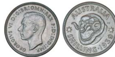
1522* George VI, 1939. Uncirculated. $300

Ex Jon Saxton Collection (from WA auction Jan 2000, lot 532).