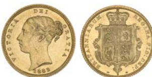
1365* Queen Victoria , 1882 Sydney. Hairline die breaks rim to A of Victoria and to second I, also vertically on cheek, minor obverse hairlines, otherwise full original mint bloom, choice uncirculated and extremely rare in this condition, one of the finest known.