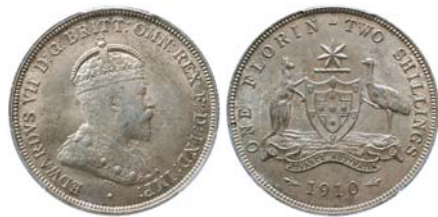
1450* Edward VII , 1910. Lightly toned with underlying mint bloom, nearly uncirculated/uncirculated.