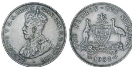
1481* George V, 1932. Has been cleaned, otherwise nearly extremely fine and rare. $1,500

Ex Jon Saxton Collection (from WA auction August 2000, lot 479).