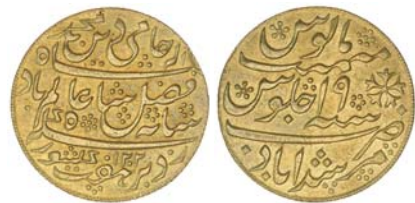
1226* India , Bengal Presidency, EIC mohur of Murshidabad type (1793) (12.28g) (KM.103.1). Obverse rim bruise at 2 o'clock, otherwise extremely fine . $750