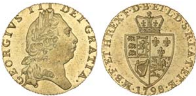
1221* Great Britain , George III, guinea, fifth bust or spade type, 1798 (S.3729). Extremely fine/good extremely fine, with considerable brilliance . $750