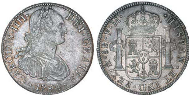
1236* Mexico , Charles III, eight reales, 1794FM (KM.109) (26.80g). Good very fine with mint bloom .