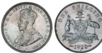
1507* George V, 1920M. Nearly full original mint bloom, obverse lightly toned, uncirculated.