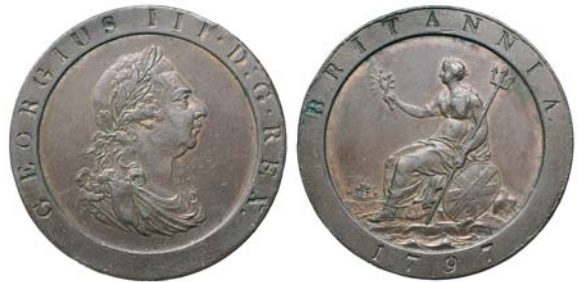
1225* Great Britain , George III, cartwheel penny, 1797 (S.3777). Good very fine . $150