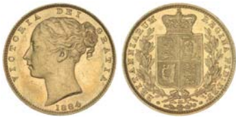
1306* Queen Victoria , 1884 Melbourne. Nearly uncirculated. $750