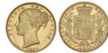
1304* Queen Victoria, 1883 Melbourne. Good very fine and scarce.