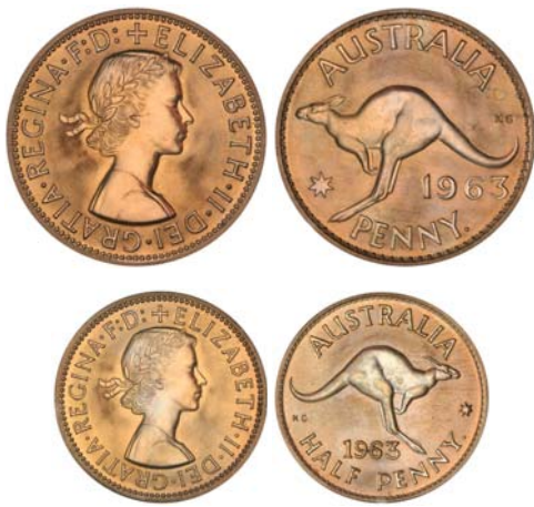
1440* Elizabeth II , Perth Mint proof set, 1963. FDC . (2) $1,000