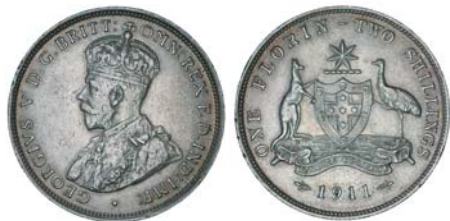
1454* George V , 1911, second 1 over gap, third over denticle. Extremely fine or better.