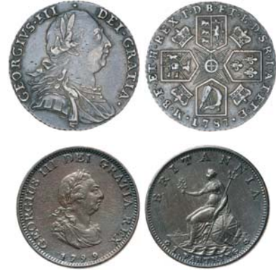
part 1223* Great Britain , George III, shilling and sixpence, 1787 (S.3746, 3749)(2); halfpenny and farthing, 1799 (S.3778, 3779)(2). Good very fine . (4) $200