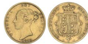
1362* Queen Victoria , 1873 Melbourne. Fine.