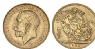
1347* George V, 1922 Perth and 1923 Melbourne. Uncirculated; nearly uncirculated. (2) $750