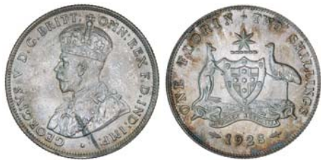
1478* George V, 1928. Full original frosty and pearl-like mint bloom, with some toning, choice uncirculated and rare thus. $1,200