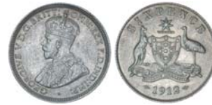
1529* George V, 1912. Good extremely fine and rare.

Ex Jon Saxton Collection (from WA auction April 2000, lot 313).