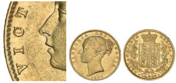
1301* Queen Victoria, 1880 Sydney, inverted A for V in Victoria (McD.127a). Very fine and rare.