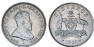
1527* Edward VII, 1910. Well struck, uncirculated.