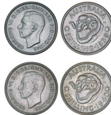
1523* George VI, 1939, 1940 and 1943. Last spotted, otherwise original mint bloom, nearly uncirculated. (3) $350