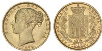
1299* Queen Victoria, 1879 Sydney. Nearly extremely fine.