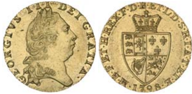
1220* Great Britain , George III, guinea, fifth bust or spade type, 1798 (S.3729). Nearly uncirculated . $800 Ex Jon Saxton Collection.