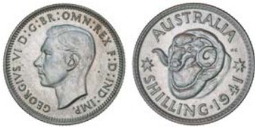
1525* George VI, 1941. Brilliant uncirculated.