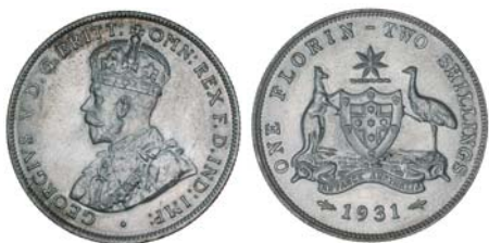
1479* George V, 1931. Full original subdued satin-like mint bloom, choice uncirculated. $300