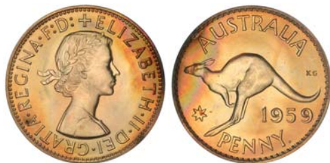
1431* Elizabeth II , Perth Mint proof penny, 1959. FDC.