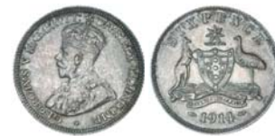
1530* George V, 1914. Grey toned uncirculated and rare in this condition.