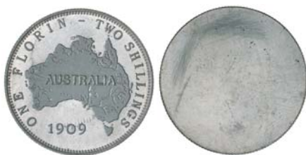
1443* Edward VII , uniface pattern florin, 1909, in silver (8.15g) (28mm) milled edge, obverse plain, an unofficial replica. FDC . $250