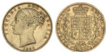
1300* Queen Victoria, 1880 Melbourne. Very fine and rare.