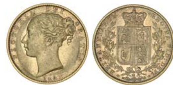
1310* Queen Victoria , 1887 Melbourne. Very fine and rare. $1,500

Ex Noble Numismatics Sale 95A (lot 545) and Tony Baker Collection.