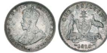
1502* George V, 1915. Considerable original mint bloom, surface marks, toned uncirculated and rare in this condition. $2,000