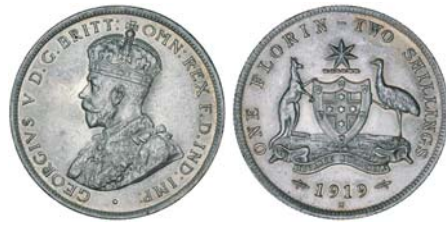
1468* George V, 1919M. Well struck, nearly uncirculated and rare in this condition.