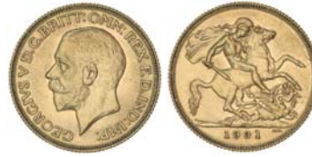
1359* George V , small head, 1931 Melbourne. Good extremely fine and scarce.