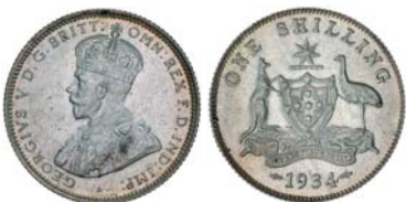
1518* George V, 1934. Lightly toned, nearly uncirculated. $350