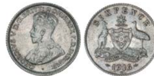
1531* George V, 1916M. Nearly uncirculated and rare in this condition.