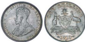
1505* George V, 1918M. Full golden mint bloom, gem uncirculated, one of the finest known.