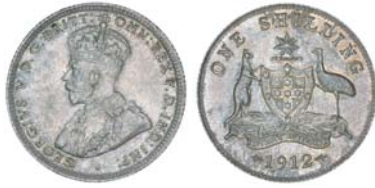
1499* George V, 1912. Golden brown tone, subdued original mint bloom, nearly uncirculated and rare in this condition. $1,800