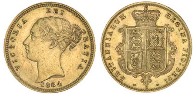
1366* Queen Victoria , 1884 Melbourne. Hairline marks in front of face and to rim, otherwise subdued mint bloom, nearly uncirculated and very rare in this condition.

Ex Spink Australia Sale 7 (lot 100 part).