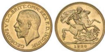
1358* George V , small head, 1930 Melbourne. Nearly Uncirculated.