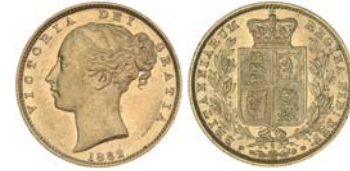
1303* Queen Victoria, 1882 Sydney. Considerable mint bloom, good extremely fine.