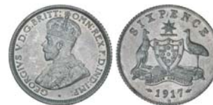
1532* George V, 1917M. Nearly uncirculated.