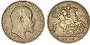
1387* Edward VII , 1908 Perth. Good very fine.