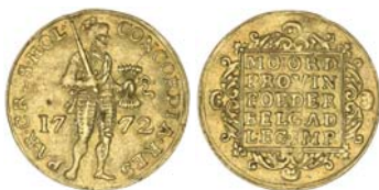
1237* Netherlands , Holland, gold ducat, 1772 (KM.12.3). Good very fine .