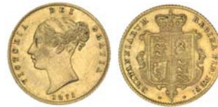
1360* Queen Victoria , 1871 Sydney. Good extremely fine and rare in this condition.