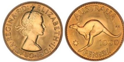
1434* Elizabeth II , Perth Mint proof penny, 1960. Mint red, obverse with carbon mark at 12 o'clock, nearly FDC.