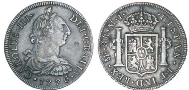
1239* Peru , Charles III, eight reales, 1776MJ (KM.78). Toned, very fine .