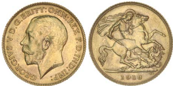
1391* George V , 1918 Perth. Contact marks on obverse, otherwise nearly uncirculated and rare.