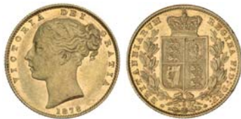
1298* Queen Victoria, 1878 Sydney. Extremely fine with brilliance.