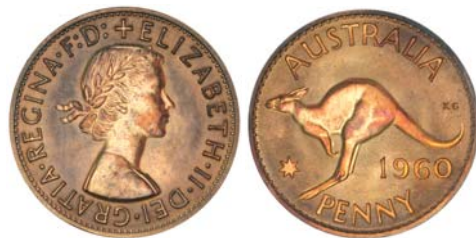
1435* Elizabeth II , Perth Mint proof penny, 1960. With mint red, toning, some spotting, nearly FDC.