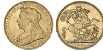
1341* Queen Victoria , 1901 Sydney. Nearly uncirculated.