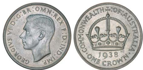
1446* George VI , 1938. Minor obverse marks, otherwise nearly uncirculated . $200