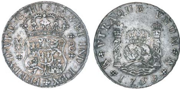
1235* Mexico , Ferdinand VI, eight reales, 1759MM (KM.104.2) (26.66g). Very fine .