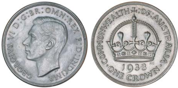
1448* George VI , 1938. Good extremely fine.

Ex Jon Saxton Collection (from WA auction Sept 2002).