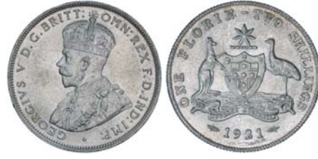
1469* George V, 1921. Full frosty mint bloom, choice uncirculated and rare thus.