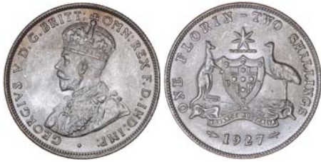
1476* George V, 1927. Full frosty mint bloom, uncirculated. $750