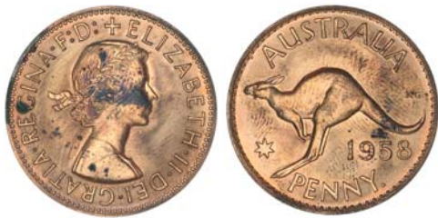
1430 Elizabeth II , Perth Mint proof penny, 1958. Some carbon toning and finger marks, nearly FDC.