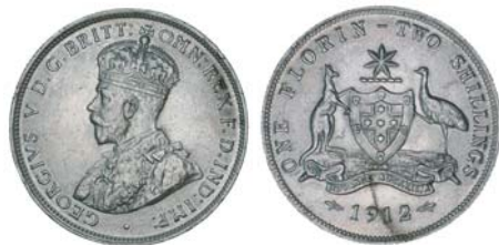
1455* George V , 1912, second 1 slopes to left. Nearly uncirculated and rare in this condition.