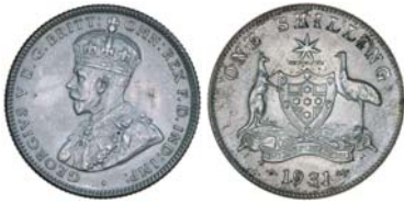
1516* George V, 1931. Full pearl-like mint bloom, uncirculated. $700