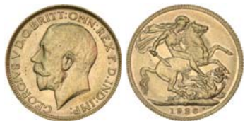
1351* George V , 1926 Melbourne. Nearly uncirculated/uncirculated.