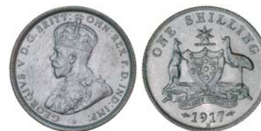
1504* George V, 1917M. Considerable mint bloom, uncirculated. $200