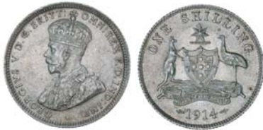
1501* George V, 1914, narrow date, second 1 over gap between denticles. Nearly uncirculated. $900