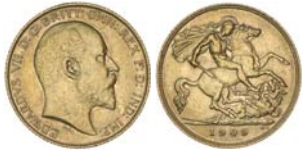
1388* Edward VII , 1909 Perth. Nearly extremely fine.