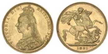
1338* Queen Victoria , 1891 Sydney. Uncirculated.