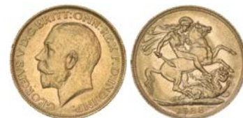
1355* George V , 1928 Melbourne. Good extremely fine/nearly uncirculated and rare.