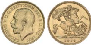
1389* George V , 1914 Sydney. Choice uncirculated.