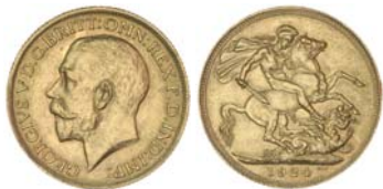
1350* George V , 1924 Sydney. Nearly uncirculated and very scarce.