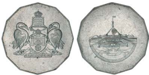
1441* Elizabeth II , Royal Australian Mint Canberra trial twelve sided (duodecagonal) fifty cents in cupro nickel (15.3g). Uncirculated and very rare . $1,000