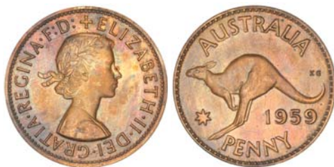
1432* Elizabeth II , Perth Mint proof penny, 1959. Some toning, FDC.