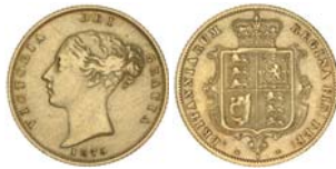
1363* Queen Victoria , 1875 Sydney. Very fine.