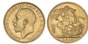
1343* George V , 1919 Melbourne. Nearly uncirculated and scarce.