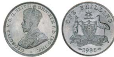
1519* George V, 1935. Satin or pearl-like full original mint bloom, choice uncirculated, reverse gem quality. $400