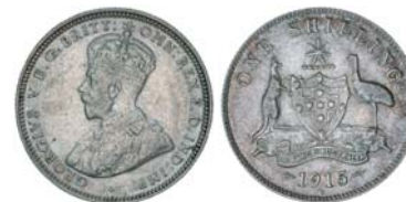
1503* George V, 1915H. Good very fine. $200