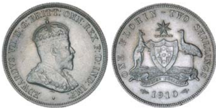
1449* Edward VII , 1910. Well struck, uncirculated.