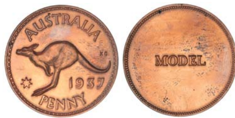
1444* George V , uniface pattern penny, 1937 (9.76g) 'Model' on obverse, kangaroo reverse, an unofficial replica struck in bronze c1970s. FDC . $150