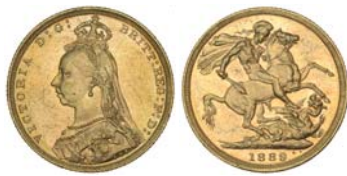
1334* Queen Victoria , 1889 Melbourne (McD.179a). Uncirculated.