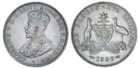
1477* George V, 1927. Uncirculated. $650