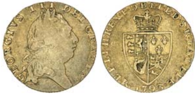
1219* Great Britain , George III, guinea, fifth bust or spade type, 1793 (S.3729). Very good/fine . $400