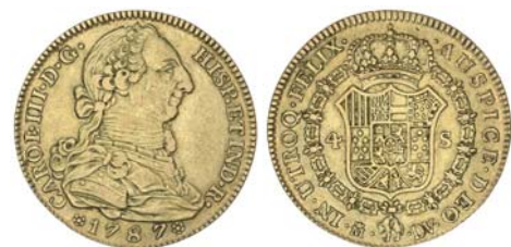
1240* Spain , Charles III, four escudos, 1787DV (Madrid) (13.38g) (KM.418.1a). Good very fine .