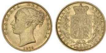
1296* Queen Victoria, 1875 Sydney. Some mint bloom, extremely fine/good extremely fine.