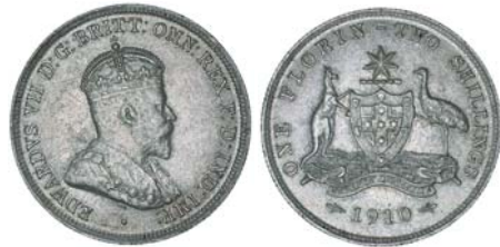
1453* Edward VII , 1910. Toned, subdued mint bloom, nearly uncirculated.