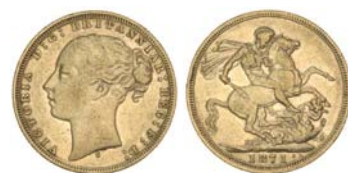
1311* Queen Victoria , 1871 Sydney, large BP (McD.143). Nearly very fine and scarce. $500

Ex Noble Numismatics Sale 93 (lot 1342).