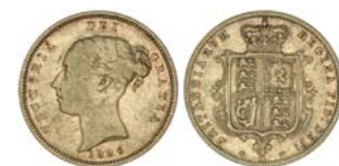
1368* Queen Victoria , 1886 Melbourne. Good fine/nearly very fine.