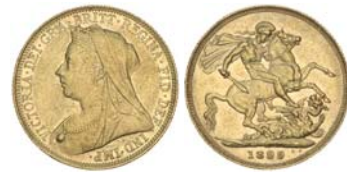
1340* Queen Victoria , 1899 Perth. Well struck for this, nearly extremely fine/extremely fine.