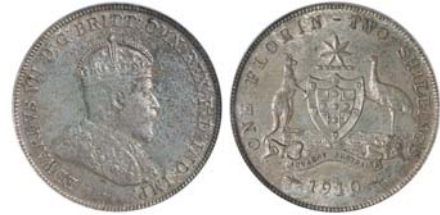
1452* Edward VII , 1910. Mottled tone, nearly uncirculated.