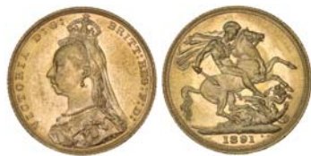
1337* Queen Victoria , 1891 Melbourne (McD.183a). Nearly uncirculated.