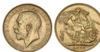
1348* George V, 1923 Melbourne. Nearly uncirculated. $350