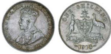
1500* George V, 1913, left slope to 913. Light tone, subdued original mint bloom, good extremely fine and rare. $1,500