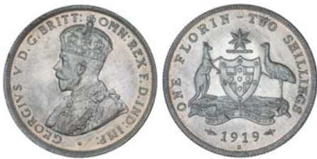
1467* George V, 1919M, second 19 upright, 1 over denticle. Full original mint bloom with edge toning, choice uncirculated and rare in this condition.