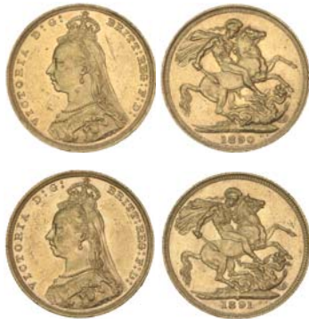
1336* Queen Victoria , 1890 and 1891 Sydney (McD.180a, 182). Scratches, otherwise uncirculated. (2)