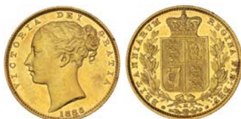
1308* Queen Victoria , 1886 Melbourne. Good extremely fine and very rare in this condition, one of the finest known. $25,000

Ex Noble Numismatics Sale 93 (lot 1342).