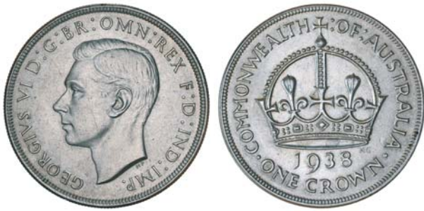
1447* George VI , 1938. Minor obverse mark, otherwise well struck nearly uncirculated.