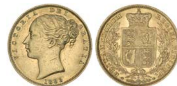
1305* Queen Victoria, 1883 Sydney. Die break rim to front of truncation, a few obverse surface marks, otherwise good extremely fine.