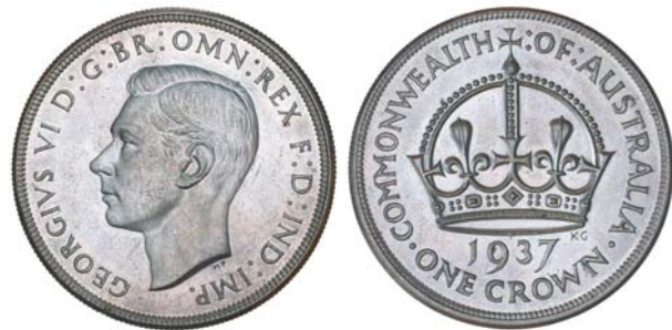
1445* George VI , 1937. Minor obverse marks, otherwise choice uncirculated and well struck . $100