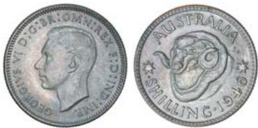
1526* George VI, 1946 dot (Perth). Well struck for this, full subdued original mint bloom, uncirculated.