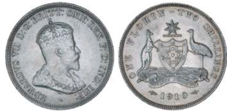
1451* Edward VII , 1910. Uncirculated.