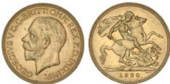
1357* George V , small head, 1930 Melbourne. Subdued light toning, uncirculated.