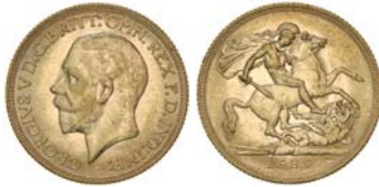
1356* George V , small head, 1929 Melbourne. Extremely fine/nearly uncirculated and rare.