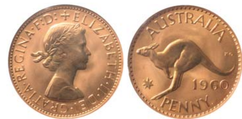
1433* Elizabeth II , Perth Mint proof penny, 1960. Red, FDC.