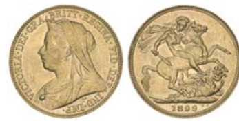
1339* Queen Victoria , 1899 Perth. Extremely fine/good extremely fine and scarce.

Private purchase from Spink Australia in 1984.