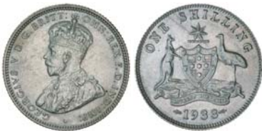
1517* George V, 1933. Some mint bloom, good extremely fine and rare in this condition. $2,500