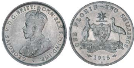
1466* George V, 1918M. Some mint bloom, die break from emu's tail, good extremely fine.