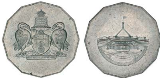
1442* Elizabeth II , Royal Australia Mint Canberra trial twelve sided (duodecagonal) fifty cents in cupro-nickel (15.59g). Uncirculated and very rare . $1,000