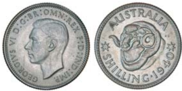
1524* George VI, 1940. Uncirculated.