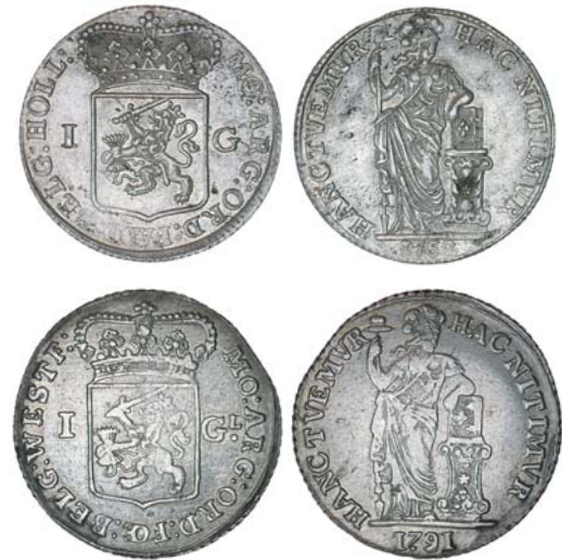
1238* Netherlands , Holland, gulden, 1762 (KM.73); Westfrisia, gulden, 1791/81 overdate (KM.97.5). Extremely fine; very fine . (2)