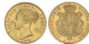
1361* Queen Victoria , 1872 Sydney. Reverse rim filed at 6 o'clock, otherwise nearly extremely fine.