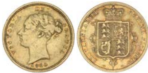
1364* Queen Victoria , 1880 Sydney. Nearly very fine.