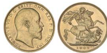
1342 Edward VII , 1902 Sydney. Nearly full mint bloom, uncirculated.