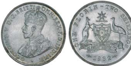
1480* George V, 1932. Full original mint bloom, minor hairlines below scroll, otherwise uncirculated and very rare in this condition. $8,000

Ex 'Grange' hoard (E.H.Crawford, October 2000) and Jon Saxton Collection.