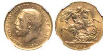
1352* George V , 1926 Perth. Nearly uncirculated and very scarce.