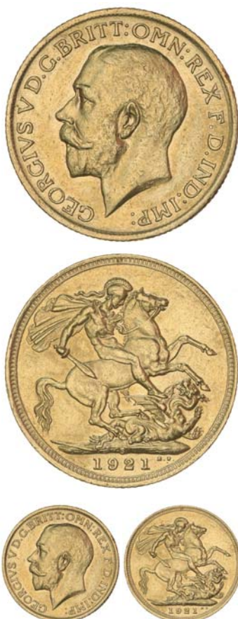
1345* George V, 1921 Sydney. Extremely fine and very scarce. $2,000