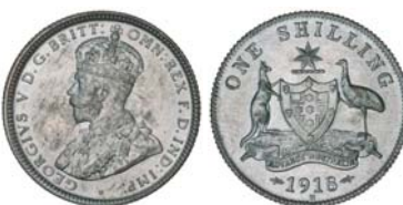
1506* George V, 1918M. Full original mint bloom, uncirculated.