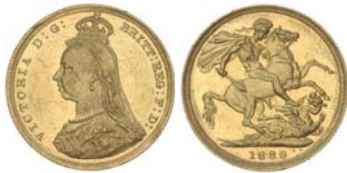
1335* Queen Victoria , 1889 Sydney (McD.178). Obverse specimen-like, uncirculated.