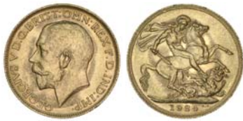
1349* George V , 1924 Melbourne. Nearly uncirculated.