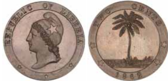
2395* Liberia , bronzed proof two cents, 1862 (KM.4). Attractive medium brown brilliant patina, FDC.