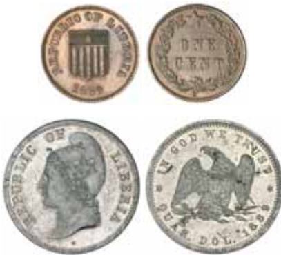
2400* Liberia , pattern one cent, 1889, and pattern twenty five cents in cupro-nickel, 1889 (KM.Pn18, 22). Nearly FDC. (2)

Ex Spink Australia Sale 8 (lot 1743) and M.M.Andrews Collection.