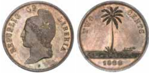
2399* Liberia , pattern two cents, 1868 (KM.Pn16). Spotted brilliant patina, nearly FDC.

Ex Spink Australia Sale 8 (lot 1744) and M.M.Andrews Collection.