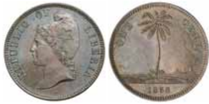
2398* Liberia , pattern bronzed proof cent, 1868 (KM.Pn15). Bluish brown brilliant, but spotted patina, nearly FDC.