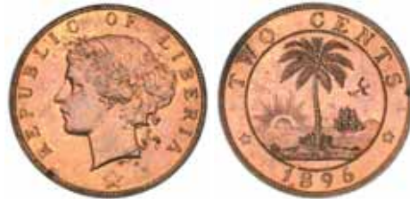
2396* Liberia , proof two cents, 1896H (KM.6). Red and brown, semi-brilliant, nearly FDC.