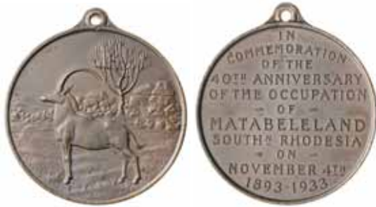
2647* Southern Rhodesia , 40th Anniversary of the Occupation of Matabeleland, 1933, in bronze (33.6mm), with ring for suspension loop, obverse, sable antelope left with balancing rocks and aloe tree behind, reverse, commemoration text. Toned, extremely fine.