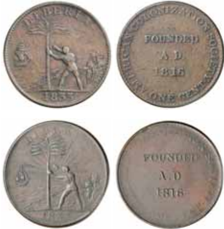
2392* Liberia , token coinage, one cent, 1833 (KM.Tn1, 2). Very fine; nearly extremely fine. (2)