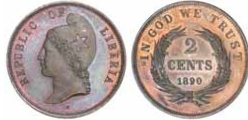
2403* Liberia , pattern two cents, 1890 (KM.Pn51, 52 and 54). Brown and red, nearly FDC. (3)