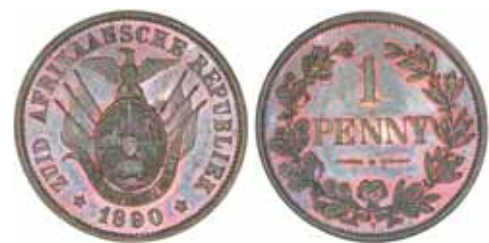
2466* South Africa , ZAR, pattern penny, 1890, by L.C.Lauer for Otto Nolte & Co., Berlin (Bruce XPn9; KM.Pn22). Purple and red, uncirculated.