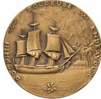
2648* Tahiti , James Cook in bronze (54mm) by Georges Guiraud, Paris, issued by High Commission of French Polynesia (Klenman K26B). Extremely fine in box of issue.