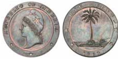
2394* Liberia , proof one cent, 1862 (KM.3). Some original mint red, nearly FDC.