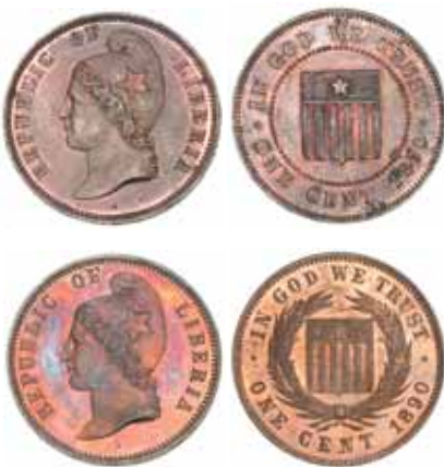
2401* Liberia , pattern one cent, 1890 (KM.Pn47, 48). First toned, second red and brown, nearly FDC. (2)