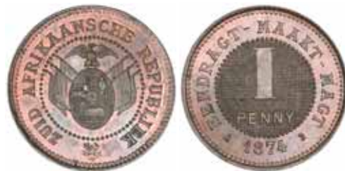
2464* South Africa , ZAR, pattern penny, 1874 by Wurden, Brussels (Bruce XPn1; KM.Pn1). Brown and red, uncirculated.