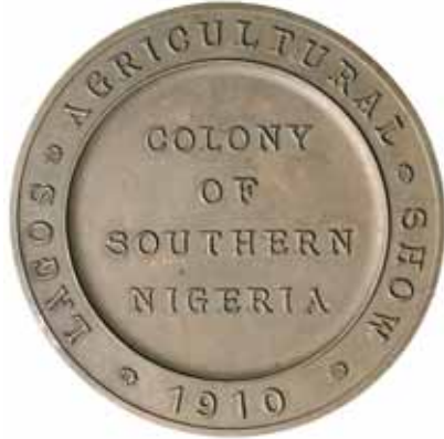
2646* Southern Nigeria , Colony, Lagos Agricultural Show, 1910, in bronze (50mm), obverse, Hippopotamus right, corn stalk in exergue, reverse, commemorative details. Toned extremely fine and scarce.