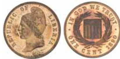
2402* Liberia , pattern cent, 1890 (KM.Pn48). Red FDC.