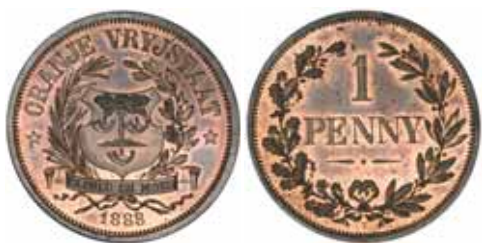
2462* South Africa , Orange Free State, pattern penny, 1888 V, by L.C.Lauer for Otto Nolte & Co., Berlin (Bruce XPn6; KM.Pn9). Brilliant dark red, uncirculated.