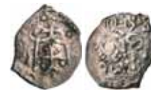
2404 Lithuania , Grand Duchy, Vladimiras Algirdas, Grand Prince of Kiev, (1362-1394), silver denaras (0.62 g), Kijevas (Kiev) mint, obv. Military standard, swallowtail banner decorated with cross and pellet in each quarter set on curved arm surmounted by cross, pellets around, rev. Cross pattée, legend around, all within pelleted border. (Gumowski 441 [Pl.XVII]). Fine - very fine, areas of flat strike and extremely rare.