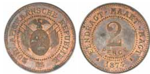
2465* South Africa , ZAR, pattern two pence, 1874, by Wurden, Brussels (Bruce XPn3; KM.Pn5). Dark blue brown tone with red, uncirculated.