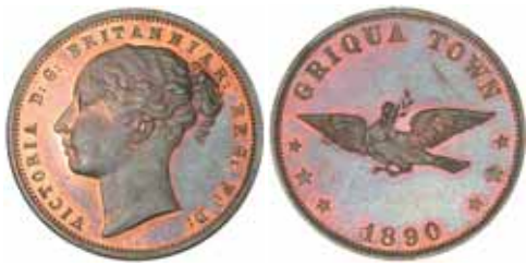
2459* South Africa , Cape Province, Griqua Town, pattern penny, 1890 (Bruce X8; KM.Pn5) by L.C.Lauer for Nolte of Berlin. Red and brown, uncirculated.