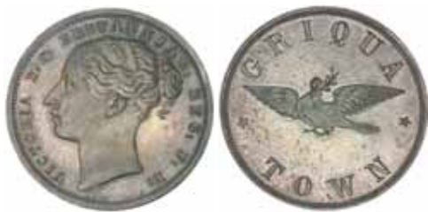
2460* South Africa , Cape Province, Griqua Town, pattern penny, undated (Bruce X9; KM.Pn6). Dark toned, uncirculated.